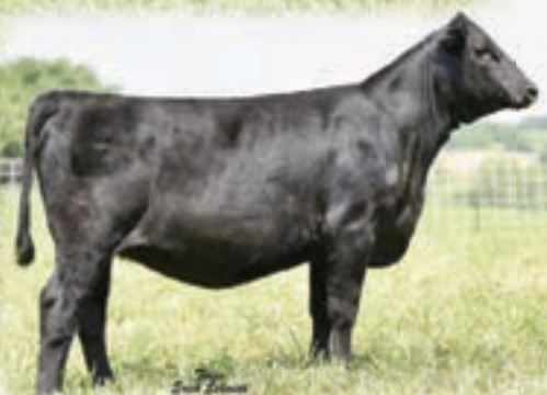
BC 0763 BONNIE 507 - She sells as Lot 40A.