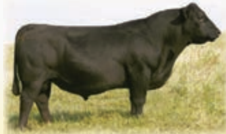
BC SURVEYOR 680D - Reference Sire R.

BC 304 PURE PRIDE 7022 512 #BC MARATHON 7022 +15036483 BC PURE PRIDE 413 854E 304 CED +7 BW +1.3 WW +54 YW +88 MILK +21 MARB +.33 RE +.65 $W+58.55