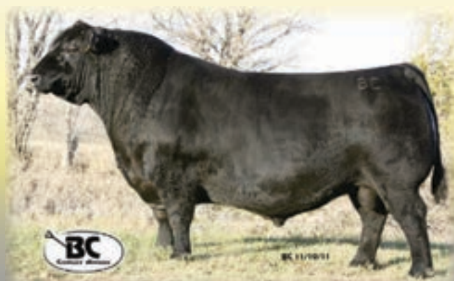
BC BALANCE 516-7 - His influence sells.