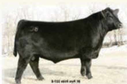
BC PURE PRIDE 327-8 - Reference Sire Q.

CANE RIDGE PRIDES LASS 2266L #OCC HOMER 650H 14063773 +OCC PRIDES LASS 709F CED +9 BW +.7 WW +46 YW +79 MILK +17 MARB +.35 RE +.42 $W+49.44