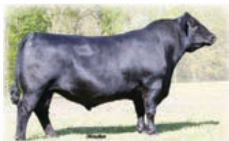
BC CHARLIE PRIDE 304-6 - Reference Sire X.