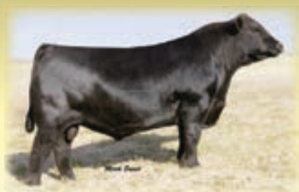
BC CLASSIC 385-7 - Reference Sire W.