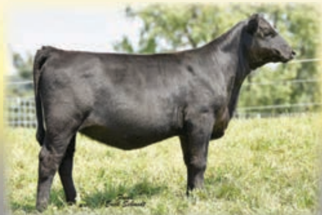
BC 219 QUEEN 539 - She sells as Lot 37.