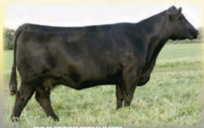
BC E BELLE 327-8 1-759 - She sells as Lot 9.