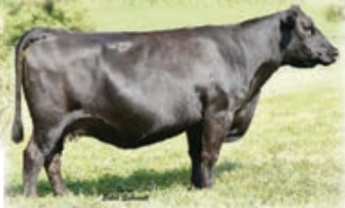
BC BARBARA EAGLE EYE 0 902 - She sells as Lot 27.