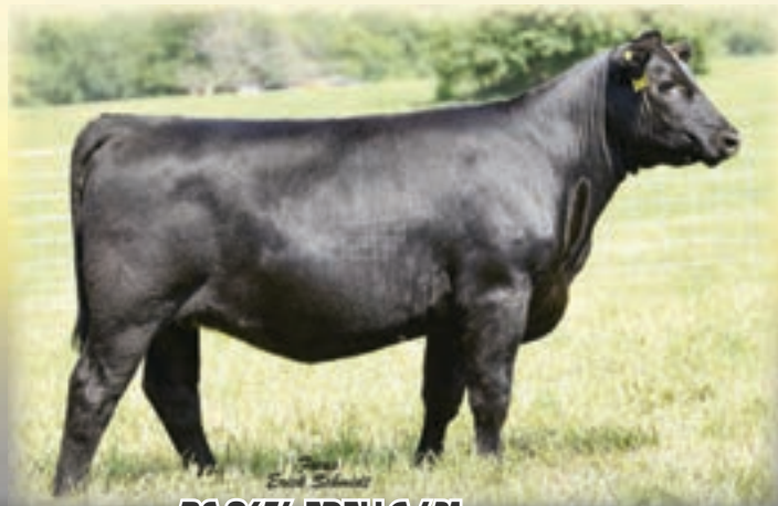
BC 0674 EDELLA 431 - She sells as Lot 32.