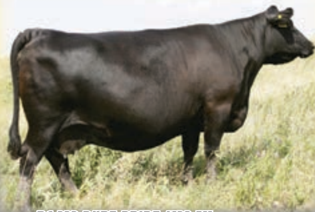
BC 223 PURE PRIDE 4132 511 - Dam of Lot 2.