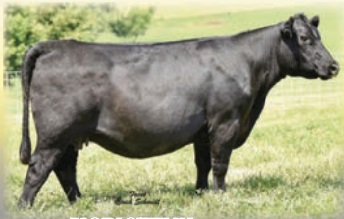
BC 0636 QUEEN 316 - She sells as Lot 43.