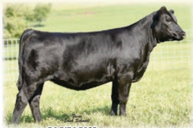
BC RITA B387 - She sells as Lot 46A.