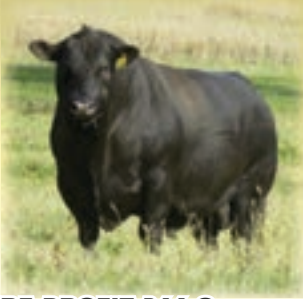
BC PURE PROFIT 266-0 - Reference Sire O.