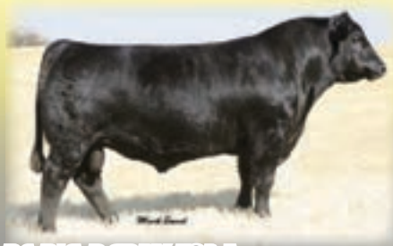
BC BIG DADDY 702-5 - Reference Sire AA.