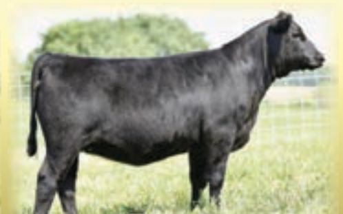
BC 003 TILDA 434 - She sells as Lot 29A.