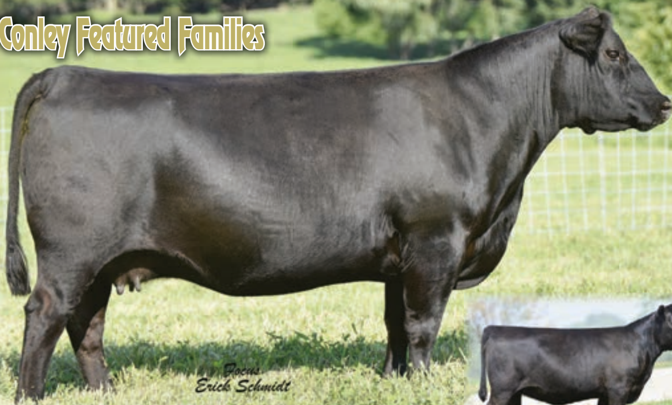
BC 674 EDELLA PRIDE ROCK 974 - She sells as Lot 36.