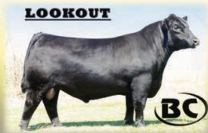
BC LOOKOUT 7024 - Sire of Lot 1A.