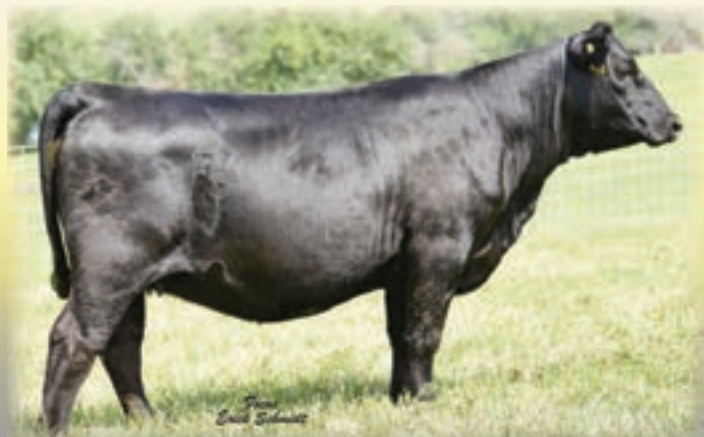
BC BEAUTY 4-827 - She sells as Lot 39.