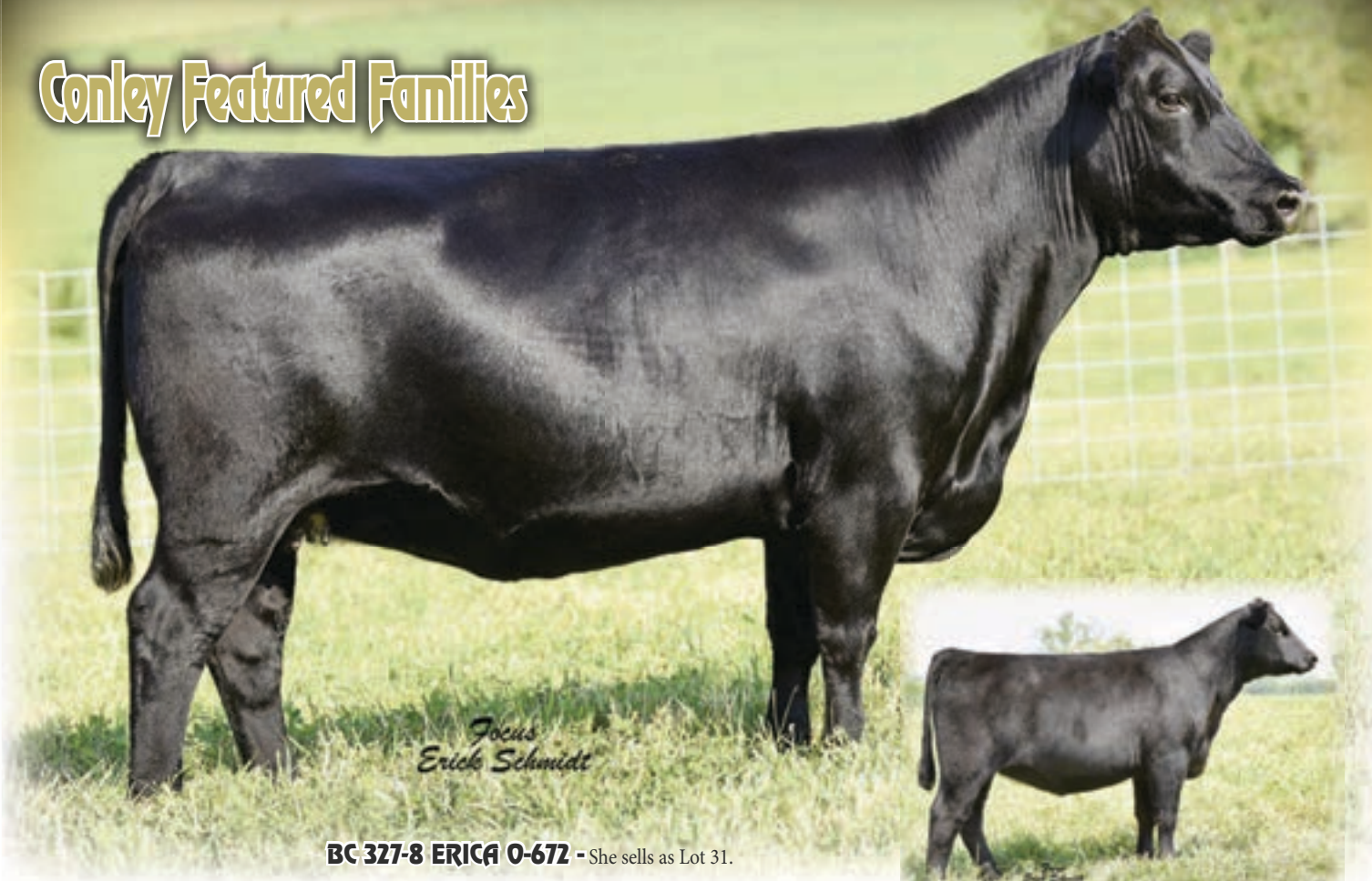
BC 327-8 ERICA 0-672 - She sells as Lot 31.