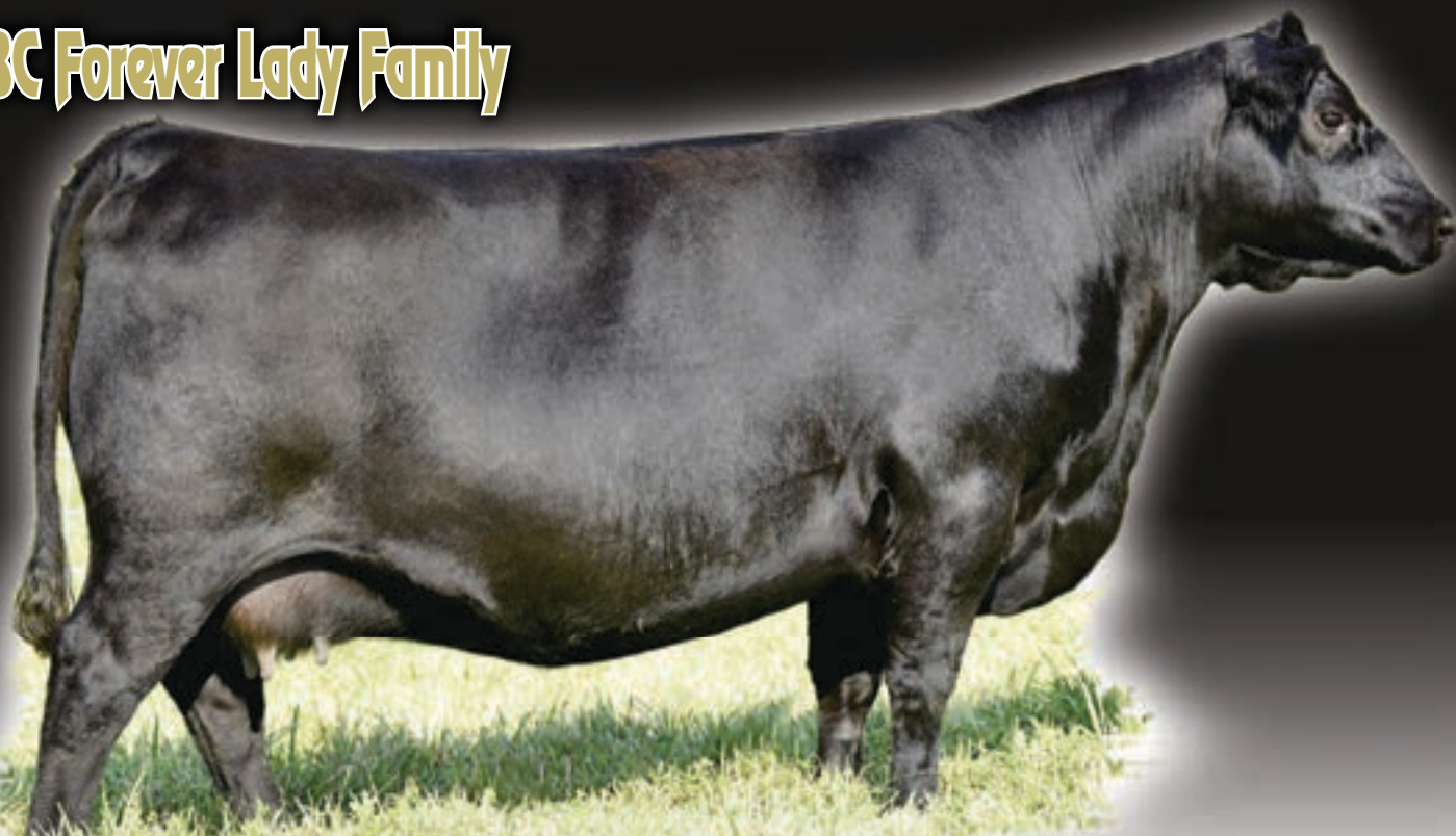
DWS BC FOREVER LADY 986 - She sells as Lot 1.