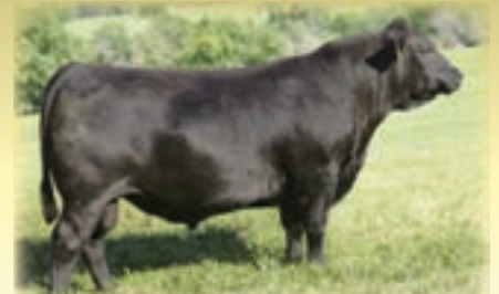
BC NAVIGATOR 141-3 - Reference Sire T.

BC PURE PRIDE 110 825J 327 OCC JET STREAM 825J #14397465 #BC PURE PRIDE ERICA D 110 CED +9 BW +.9 WW +60 YW +89 MILK +21 MARB +.34 RE +.67 $W+75.19