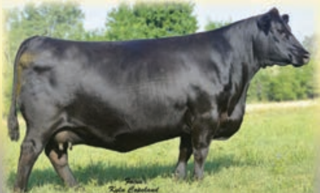
BC 418L ELGA ERICA 004 710 - The $58,000 top seller in the 2013 sale and stems from the same family as Lot 15.