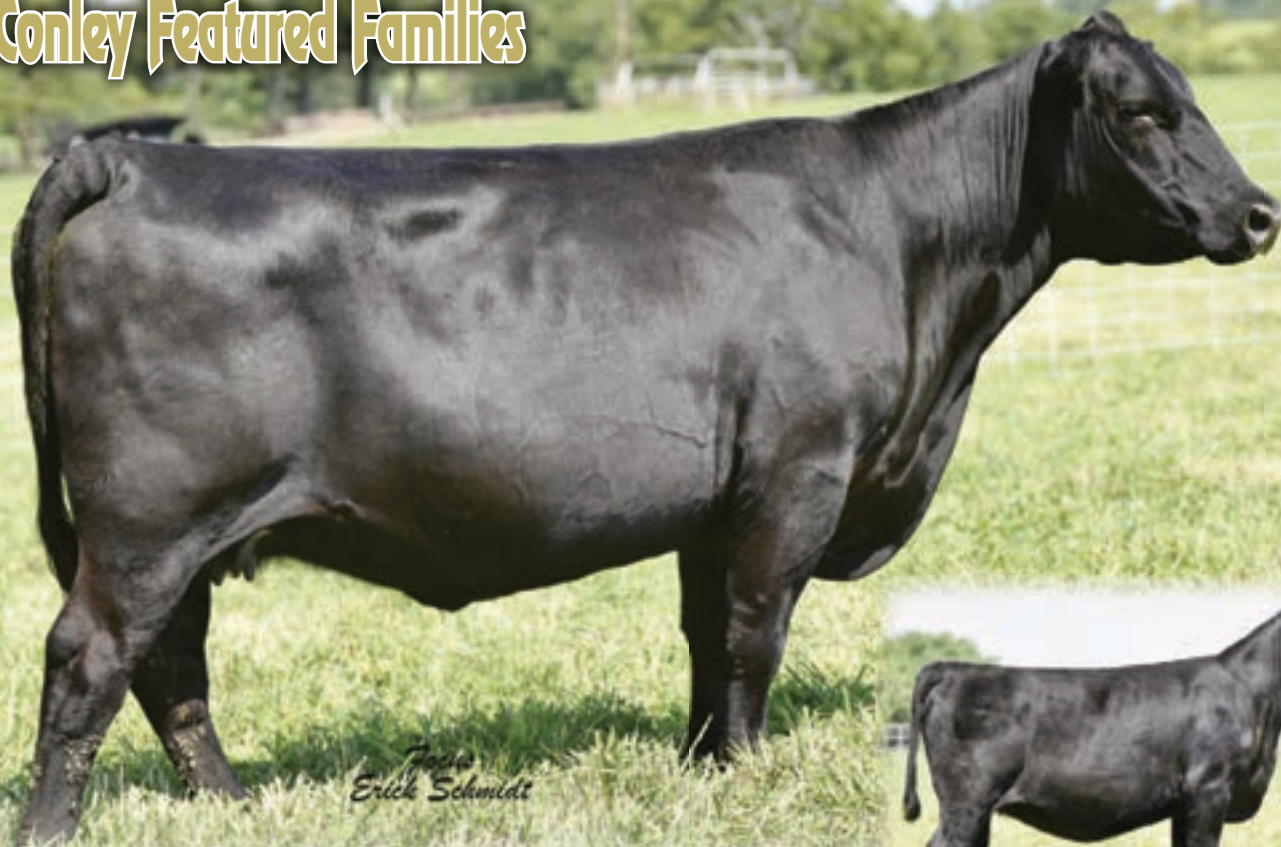
BC 327-8 ML BONNIE 0-763 - She sells as Lot 40.