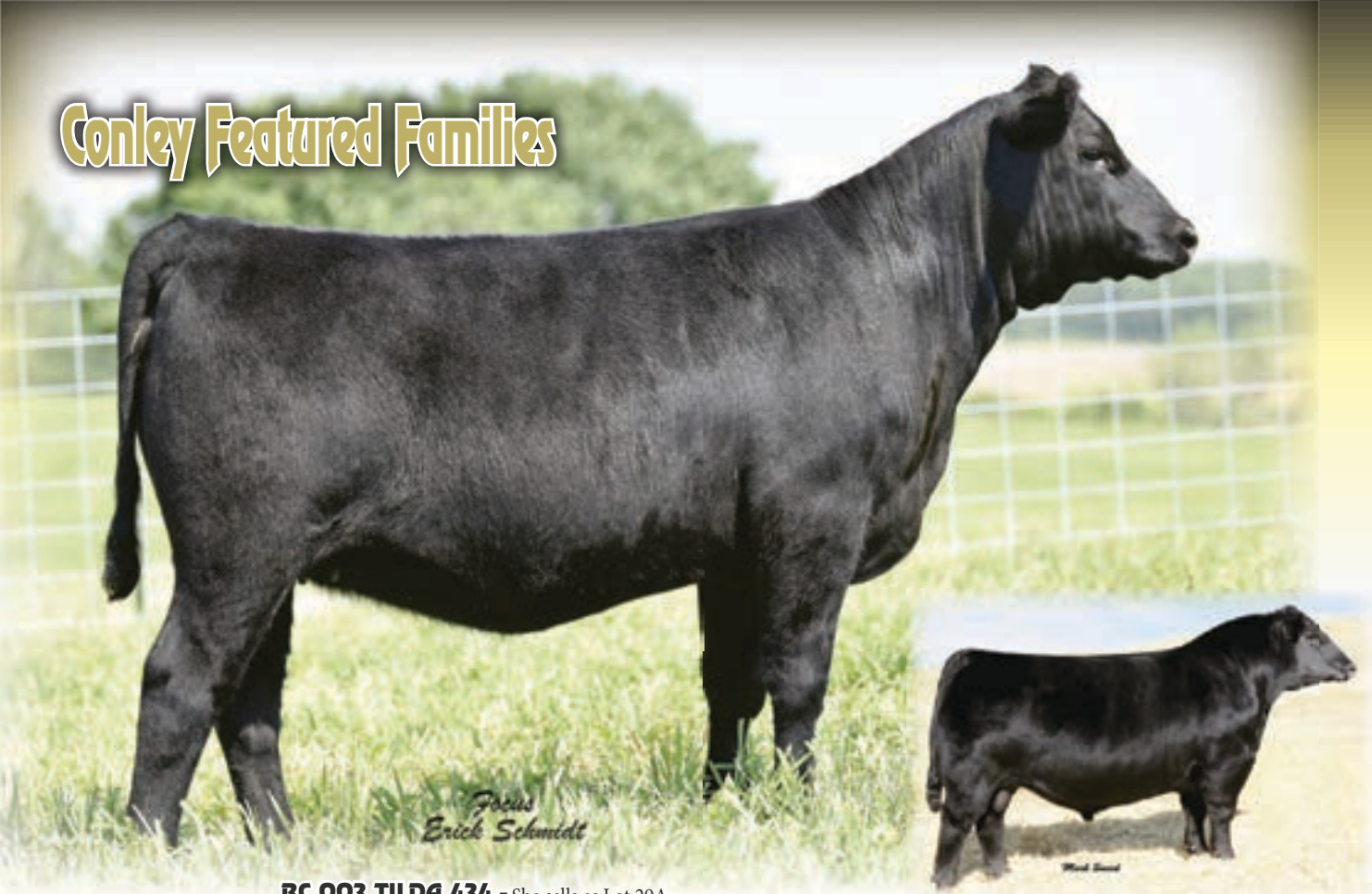
BC 003 TILDA 434 - She sells as Lot 29A.