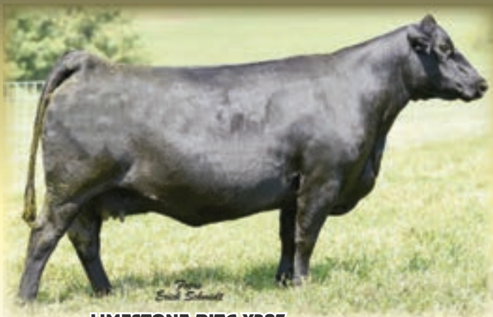
LIMESTONE RITA X387 - She sells as Lot 46.