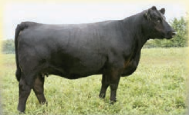
BC BLACKBIRD PALERMO 2-981 - She sells as Lot 17.