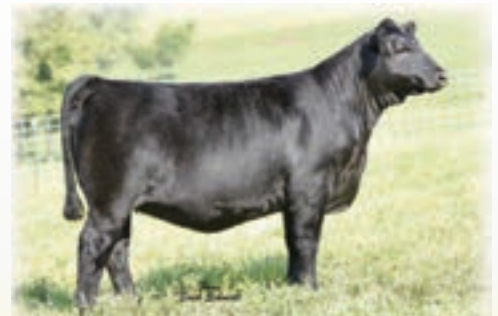
BC DIXIE ERICA 517 - She sells as Lot 22A.