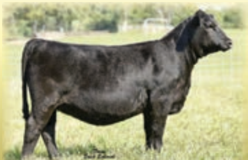
BC 0794 ROSEMARY 427 - She sells as Lot 25B.