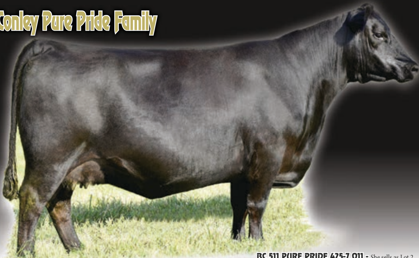
BC 511 PURE PRIDE 425-7 011 - She sells as Lot 2.