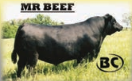
BC MR BEEF 2231 - Reference Sire S.

WOODHILL LEONA U61-X1 #CAR EFFICIENT 534 16706121 WOODHILL LEONA R55-U61 CED +16 BW -2.1 WW +48 YW +90 MILK +30 MARB +.65 RE +.51 $W+64.76