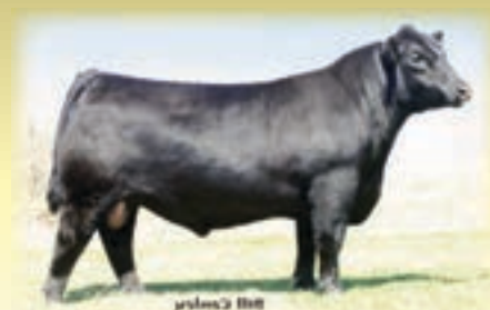
BC LOOKOUT 7024 - Reference Sire BB.