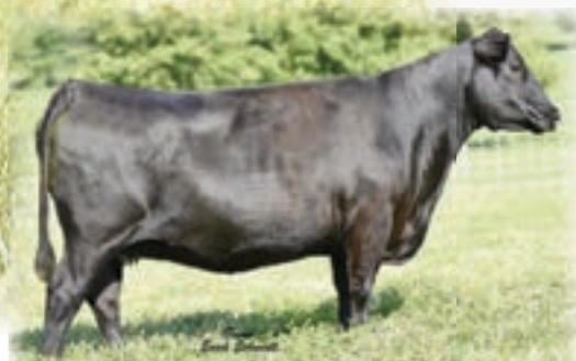
BC 327-8 ROSEMARY 0-794 - She sells as Lot 25.