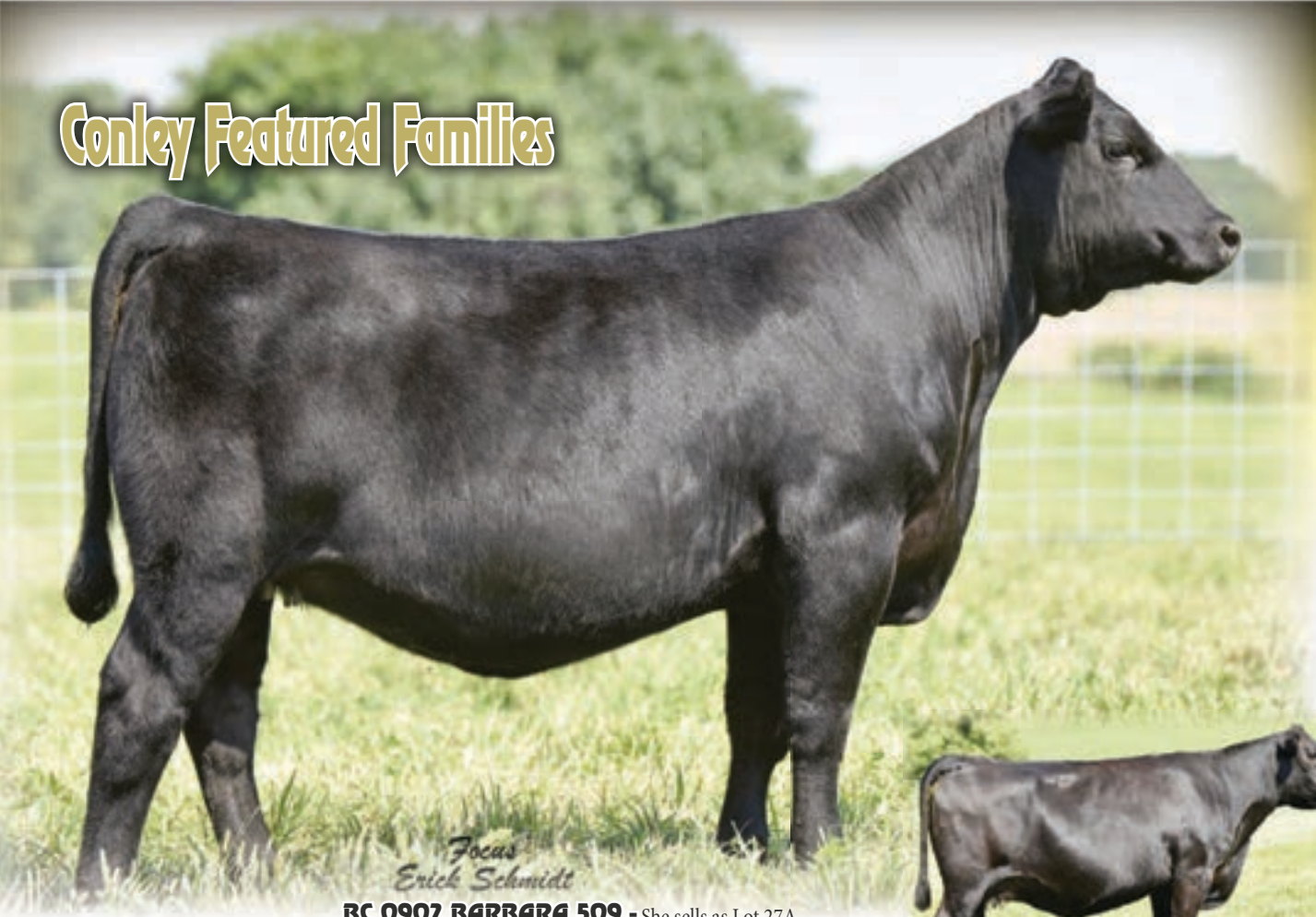
Focus Erick Schmidt BC 0902 BARBARA 509 - She sells as Lot 27A.