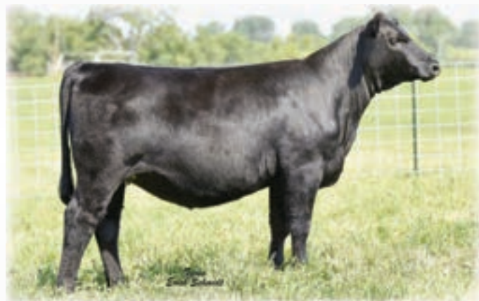
BC 0675 BLACKBIRD 442 - She sells as Lot 19B.