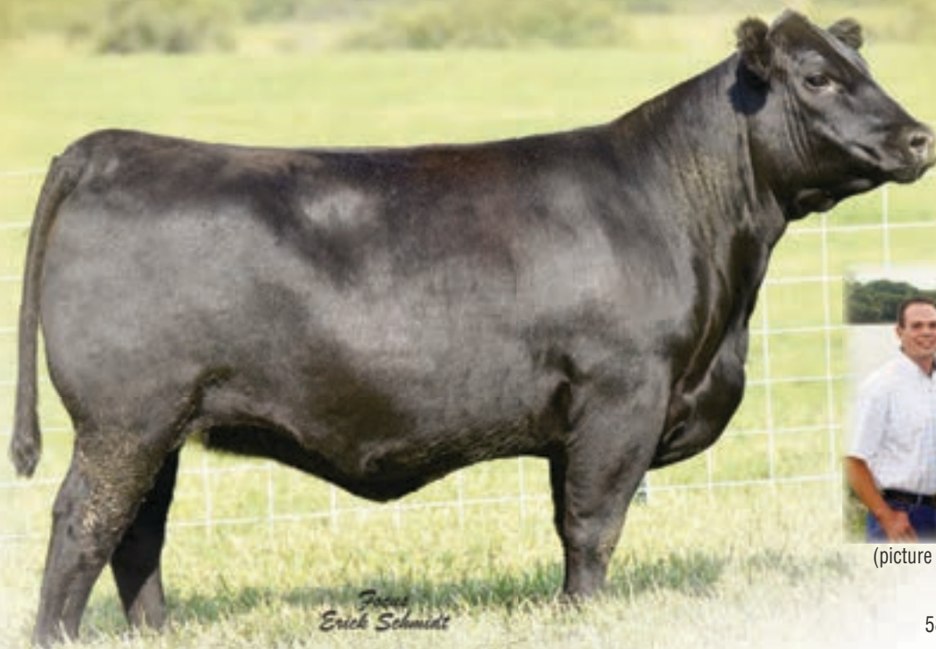
WEERS QUEEN KIMBERLY 636A - She sells as Lot 44.