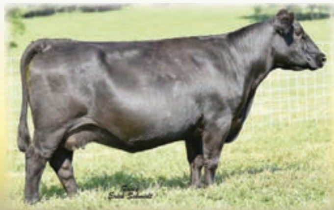
BC 523 BLACK PROGRESS EE 901 - She sells as Lot 21.