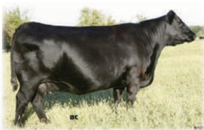
BC PURE PRIDE ERICA D 110 - The grandam of Lot 6.