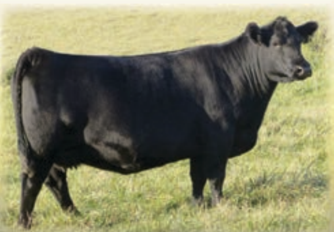
DWS FOREVER LADY 564 - Dam of Lot 1.