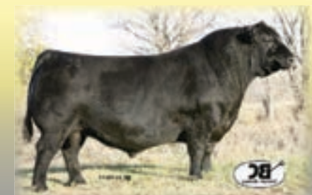
BC BALANCE 516-7 - Reference Sire DD.