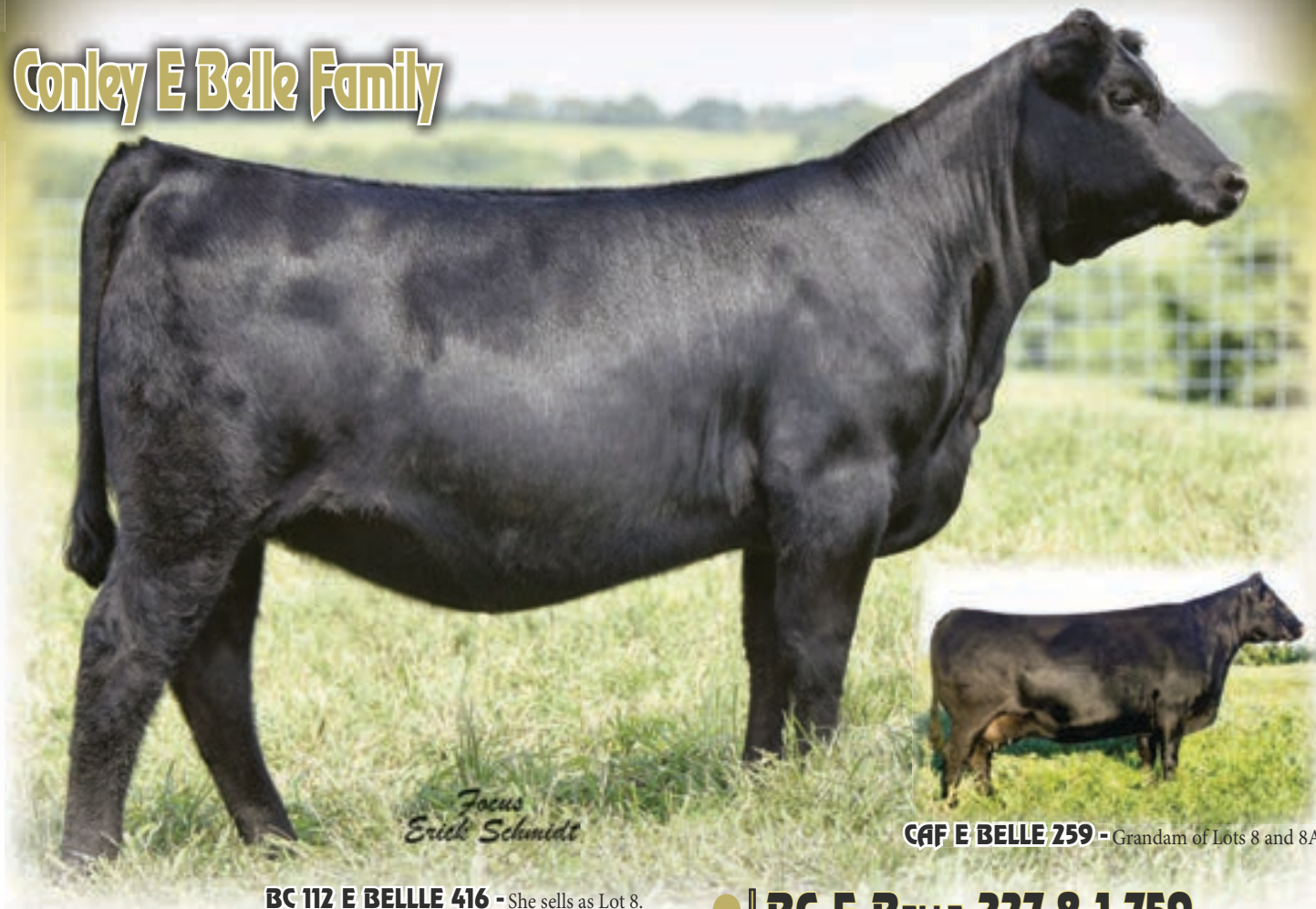
BC 112 E BELLE 416 - She sells as Lot 8.