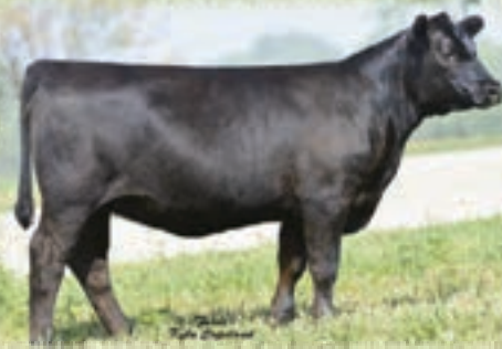
BC BONAFIDE - Daughter of Lot 36.