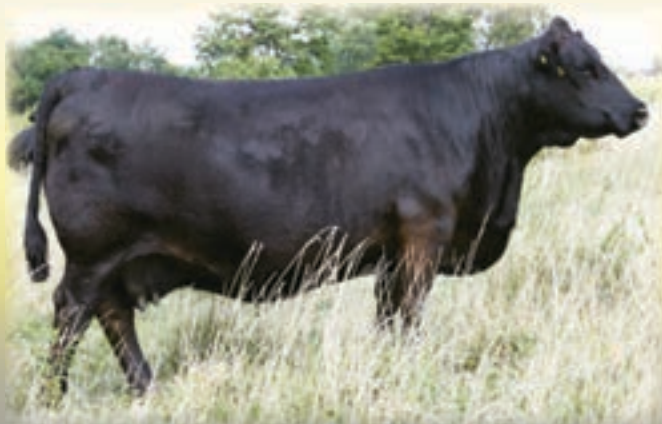
OCC DIXIE ERICA 715R - Dam of Lots 24A and 24B.