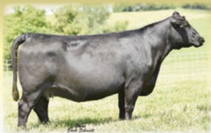
BC 327-8 BLACKBIRD 0-675 - She sells as Lot 19.