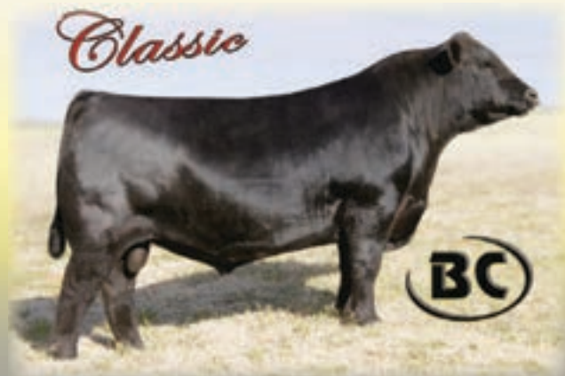
BC CLASSIC 385-7 - Sire of Lot 24B.