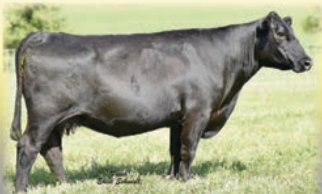
BC 825J MX MIGNONNE 0-756 - She sells as Lot 14.