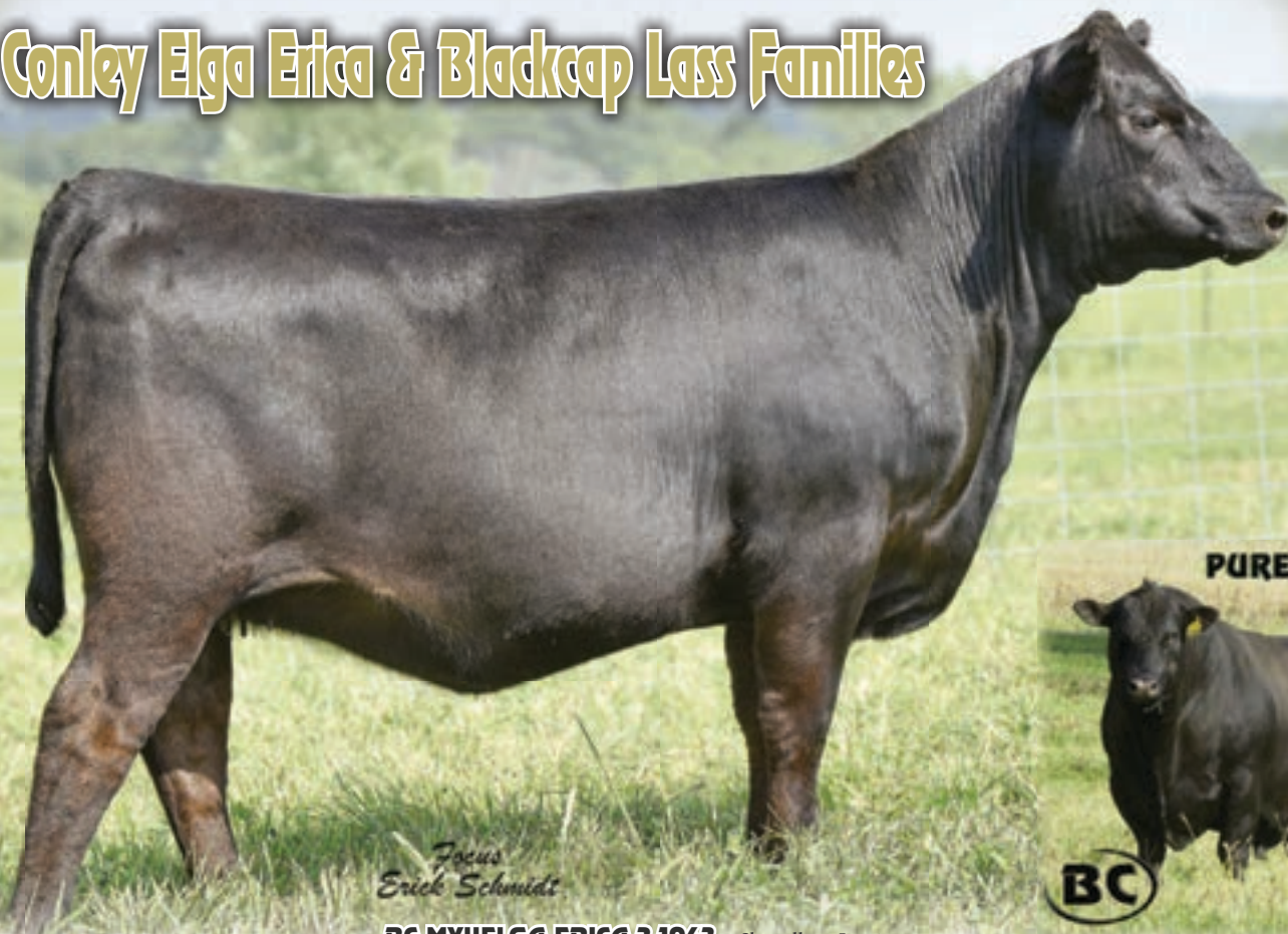
BC MXIIElGA ERICA 3-1962 - She sells as Lot 15.