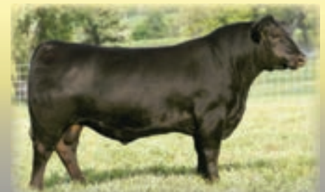
WOODHILL UPGRADE XI-A139 - Reference Sire V.

GIBBET HILL PURE PRIDE CF 86 #GDAR CASH FLOW 6203 11747861 GIBBET HILL PURE PRIDE T74 CED +5 BW +.9 WW +44 YW +82 MILK +18 MARB +.16 RE +.05 $W+42.05