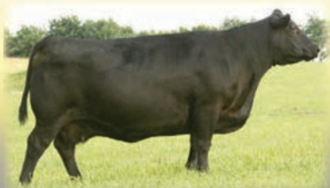
BC PURE PRIDE 110-825J 327 - Maternal sister to the dam of Lot 6.