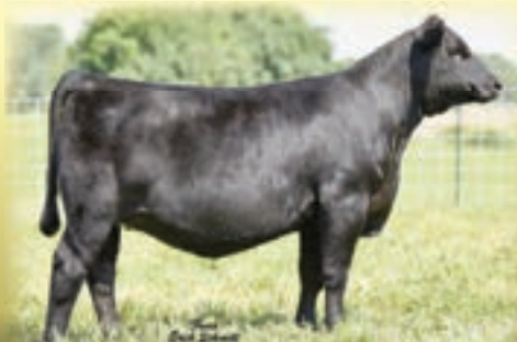
BC 0902 BARBARA 509 - She sells as Lot 27A.