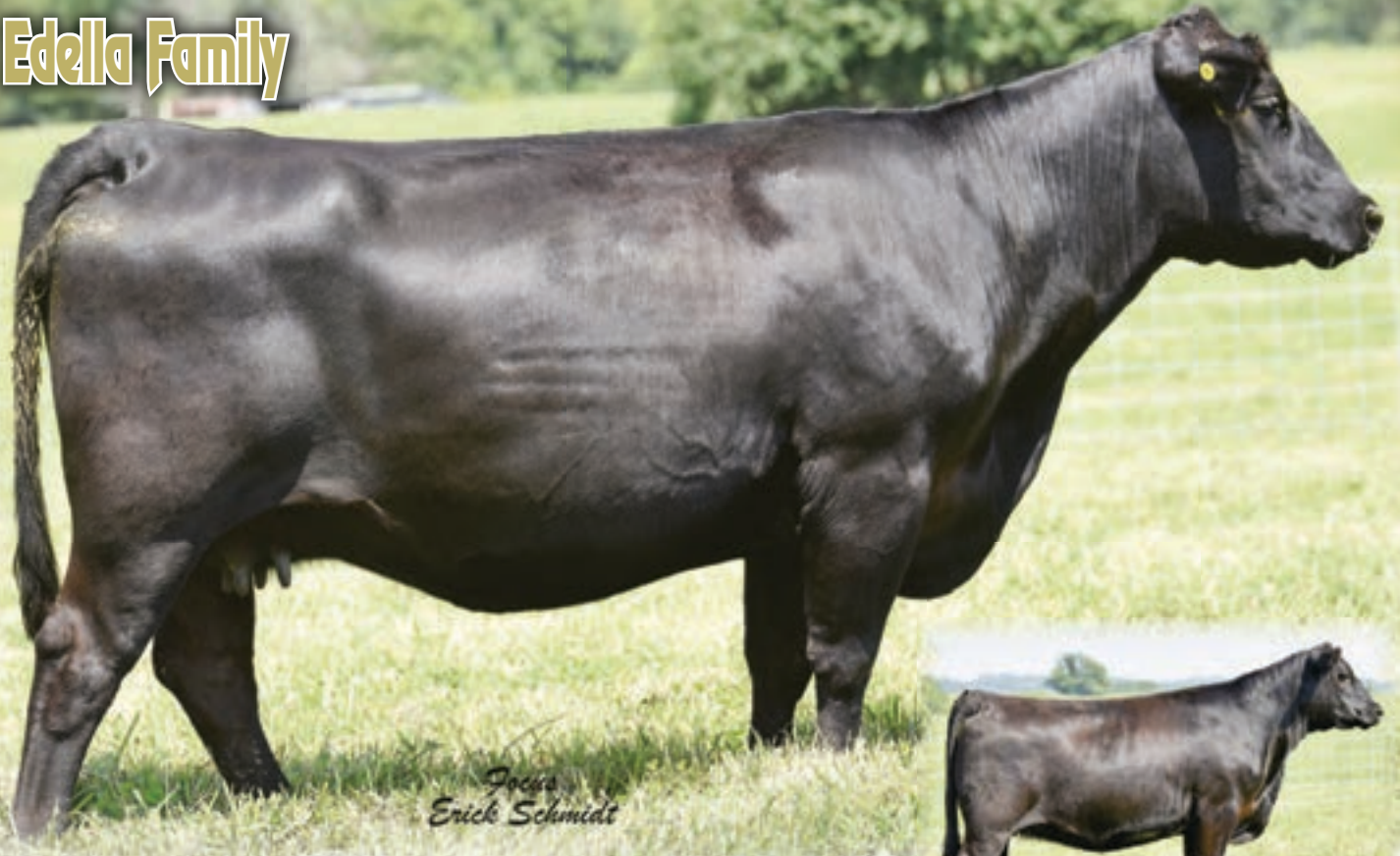
BC EDELLA 327-8 1-674 - She sells as Lot 34.