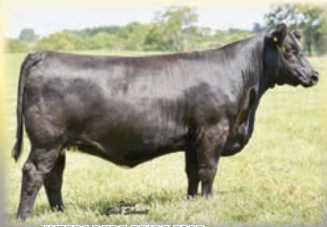
WEERS PURE PRIDE 703B - She sells as Lot 3.