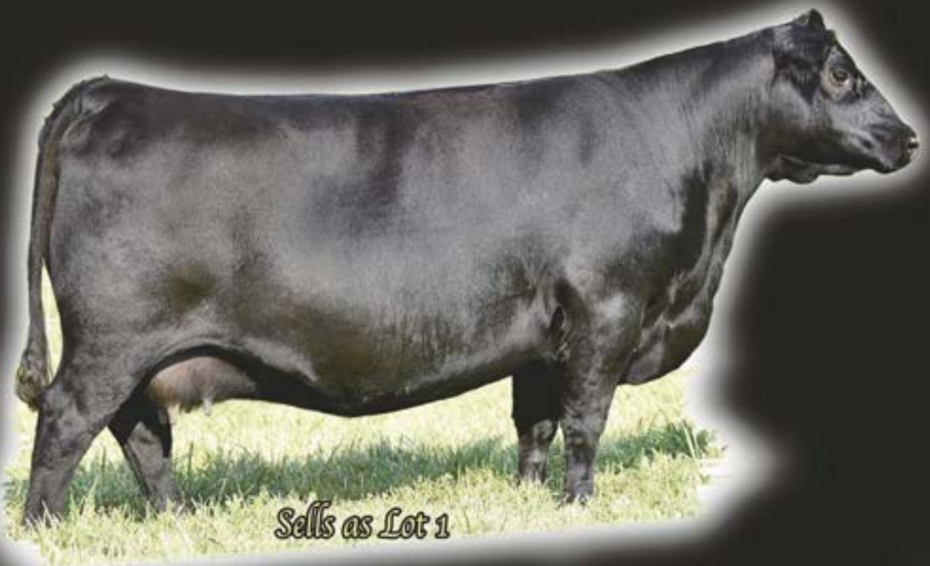
Sells as Lot 1