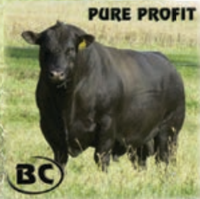
Sire of Lots 15 and 16.