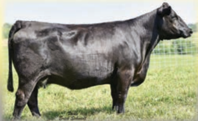
BC DIXIE ERICA TRC 0-517 - She sells as Lot 22.