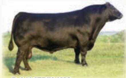
BC MATRIX 4132 - Reference Sire Z.