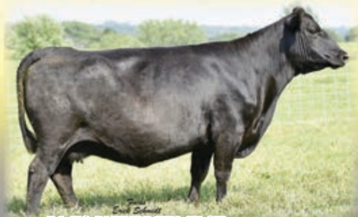
BC 610 BLKBIRD GIRL EE 912 - She sells as Lot 30.