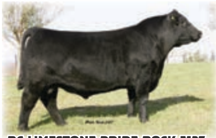
BC LIMESTONE PRIDE ROCK 5127 - Reference Sire P.

BC CLASSIC PURE PRIDE 99 141 BC CLASSIC 385-7 +17249861 CAF PURE PRIDE EXT 99 CED +7 BW +1.6 WW +51 YW +86 MILK +17 MARB N/A RE N/A $W+40.49