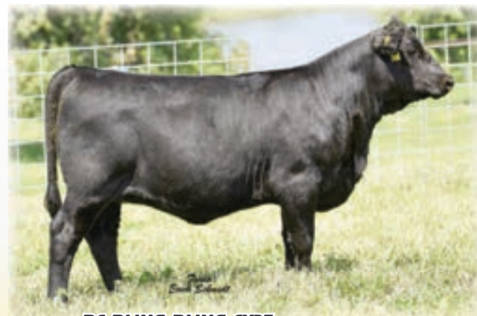
BC BLING BLING CY37 - She sells as Lot 47A.