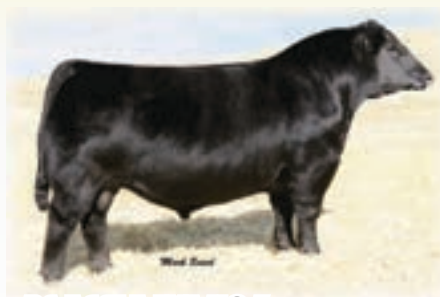
BC EAGLE EYE 110-7 - Reference Sire Y.