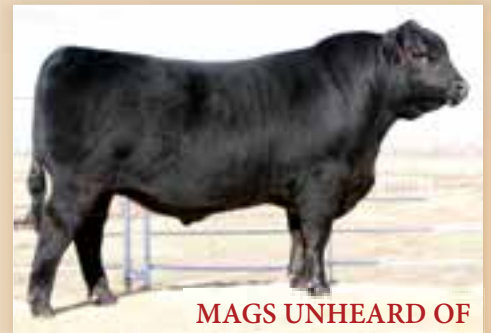
MAGS UNHEARD OF

Connealy Consensus 7229 S: MAGS ACAPULCO EXLR Luvly 821M LVLS Farmer John 7428P D: LVLS 9066U LVLS 9066R BW 3.5 WW 74 YW 113 MA 28 MS .23 $MI 61