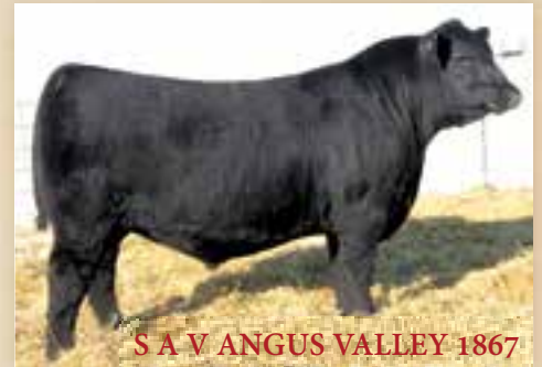
S A V ANGUS VALLEY 1867