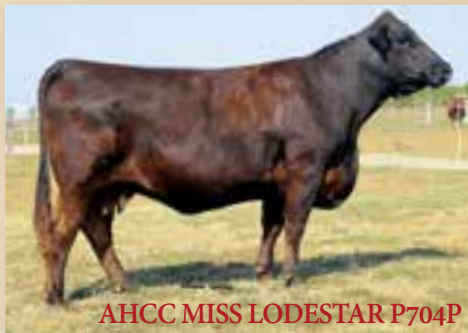
AHCC MISS LODESTAR P704P