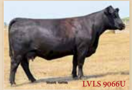
Dam of 17 lots