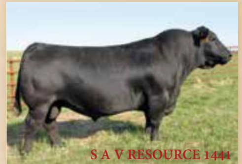
S A V RESOURCE 1441