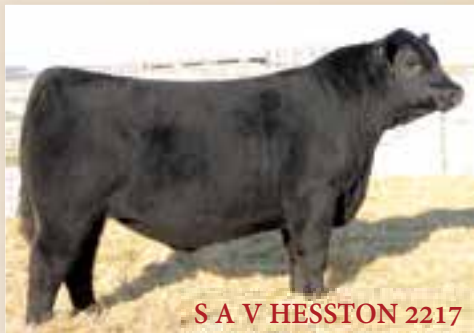
S A V HESSTON 2217