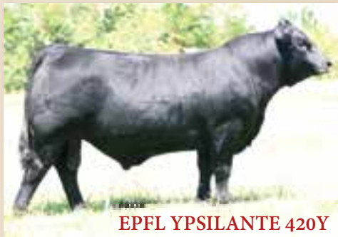
EPFL YPSILANTE 420Y