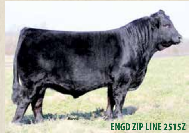
ENGD ZIP LINE 2515Z

The Zip Line bull is proving himself to be one of the most consistent sons of WestWind on the AI market. This son of his goes back to the great Angus sire, Aberdeen, and as such, has a great deal of genetic predictability bred in.