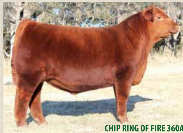
CHIP RING OF FIRE 360A

A unique Power Eye daughter who has the added benefit of selling bred to CHIP Ring Of Fire, the Firestorm son who was crowned the reserve grand champion at the 2014 NWSS.