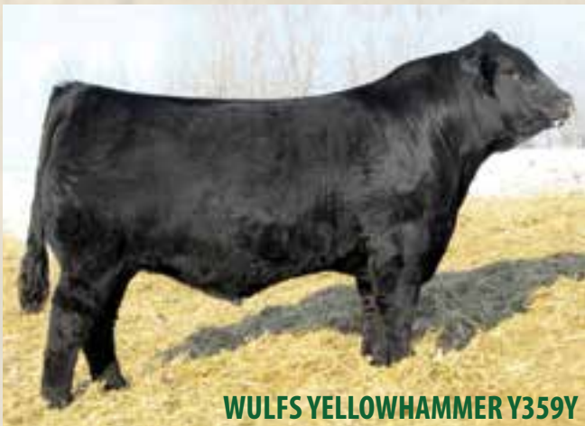
WULFS YELLOWHAMMER Y359Y