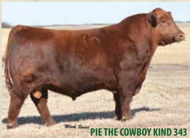
PIE THE COWBOY KIND 343