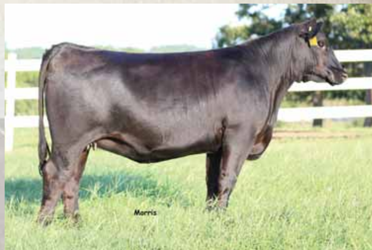
Lot 61 // P Bar S Shawnee 563

This first calf heifer is a purebred Angus female. She is sired by the big numbered and powerful Angus sire from Buford Ranches, Buford Oklahoma X239. She is from LBAF Shawnee 602, a daughter of Twin Valley Precision E161 from a daughter of SAV 8180 Traveler 004. She stands upright and very prominent in her stance. We admire her length of body and unique and desirable design.