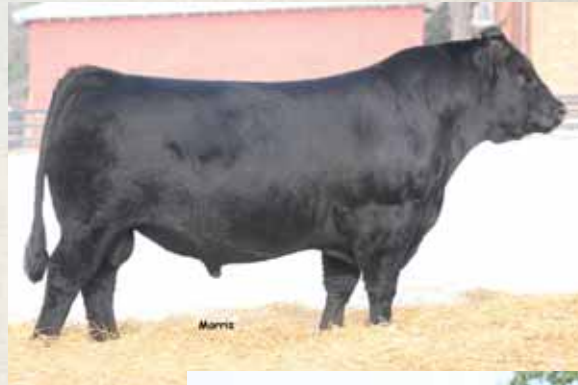
SBLX First Class, sire of Lot 5.

SBLX FIRST CLASS MAGS MANUELA DHVO DEUCE 132R PBRS WINNING WAYS 29W TYE J ROYAL LASS DAMERON FIRST CLASS EXG RS FIRST RATE S903 R3 DAMERON NORTHERN MISS 311 EXLR LIMITED EDITION 765J AUTO CITY NIGHTS 214H GPFF BLAQUE RULON AMY JO DHAN 20L MCC TRAVELER 234D WCC STEDEMS ROYAL LASS 303