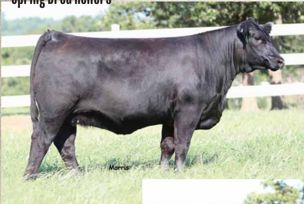
Lot 29 // PBRS Classen ET