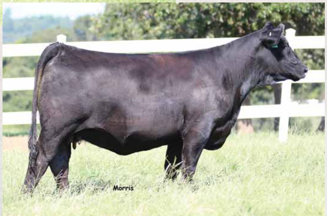
Lot 14 // PBRS Bess 4212B