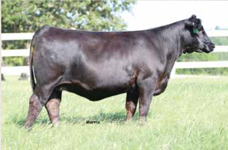
Lot 36 // PBRS Cambridge

A.I. 4.19.16 to AUTO Lucky Strike; P.E. 5.8.16 to 7.26.16 to AUTO Lucky Strike