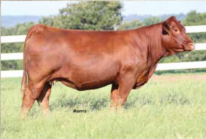
Lot 24 // PBRS Beach Babe 4146B

lot 24 PBRS Beach Babe 4146B LIM-FLEX (57) COW DOUBLE PLD / RED 09.02.14 PBRS 4146B LFF 2071291