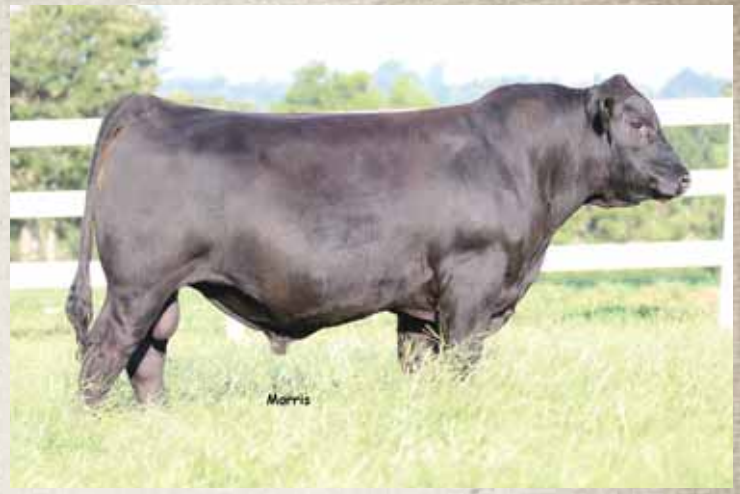
Lot 76 // PBRS 4222B ET

PBRS 4222B is a the 62% Lim-Flex herd sire prospect that is packed full of muscle and has tremendous power and performance. This son of the All American Futurity champion bull MAGS Xyloid is from the $15,000 valued female and daughter of GAR Integrity back to the Edwards Land & Cattle Co., past donor ANLC 0745K. This beef bull is homozygous polled and homozygous black and offers a 67# birth weight.