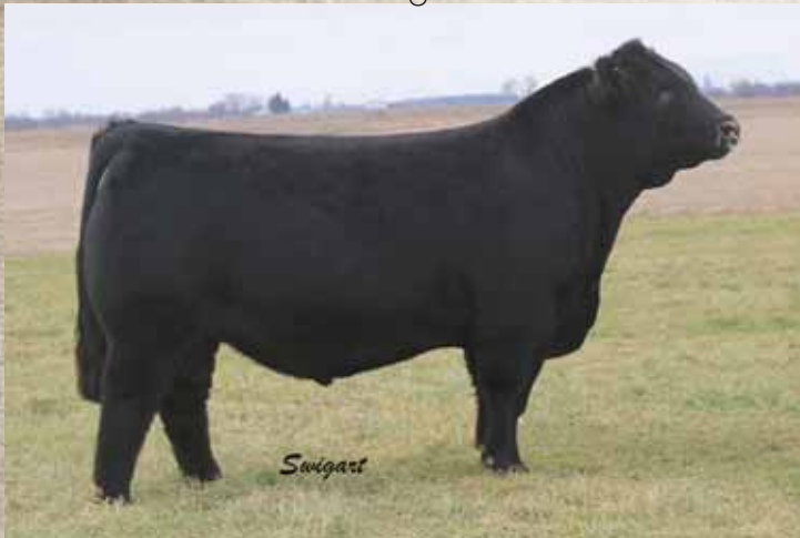
RLBH Air Force One, service sire to Lot 18.