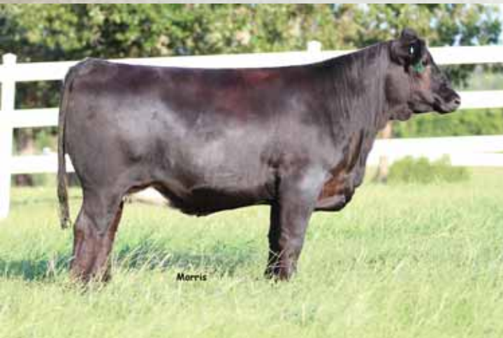
Lot 34 // PBRS Celebrate ET

A.I. 4.11.16 to HUBB Bullet Proof; P.E. 5.8.16 to 7.26.16 to AUTO Lucky Strike