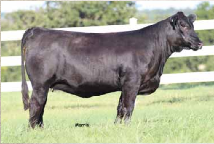
Lot 25 // PBRS 4237B

A.I. 12.26.15 to MAGS Your Faithful; P.E. 12.30.15 to 2.1.16 to AUTO Lucky Strike This red and double polled 57% Lim-Flex first calf heifer is calm, gentle, moderate in her frame and very appealing from the side profile. She is sired by the deceased sire PRBS Equinox 161Y, the son of LH U Haul 135U from the predictable donor MAGS Natasha. She is from a daughter of Sennett Predator 827U from a PBRS female, PBRS 347T. This first calf heifer represents so many positive traits and will be a great addition to any program.