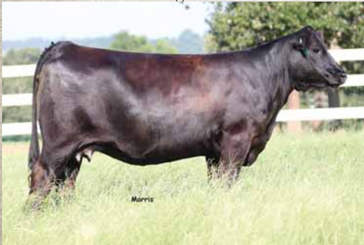
Lot 19 // PBRS Brandi 4120B ET