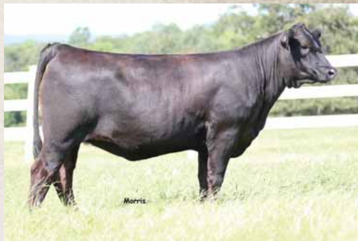
Lot 58 // PBRS Common Law

A.I. 4.10.16 to DALT Absolute Anarchy; P.E. 5.8.16 to 7.26.16 to AUTO Lucky Strike