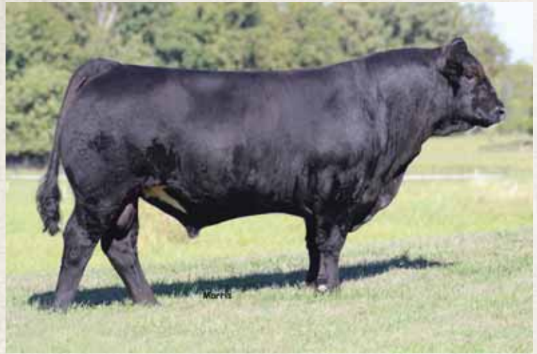
AUTO Cruze 132X, sire of Lot 3.

Terms of the purchase; Buyers pay half of the purchase price at the time of the sale and the remaining half will be paid at the time of selection (weaning time).