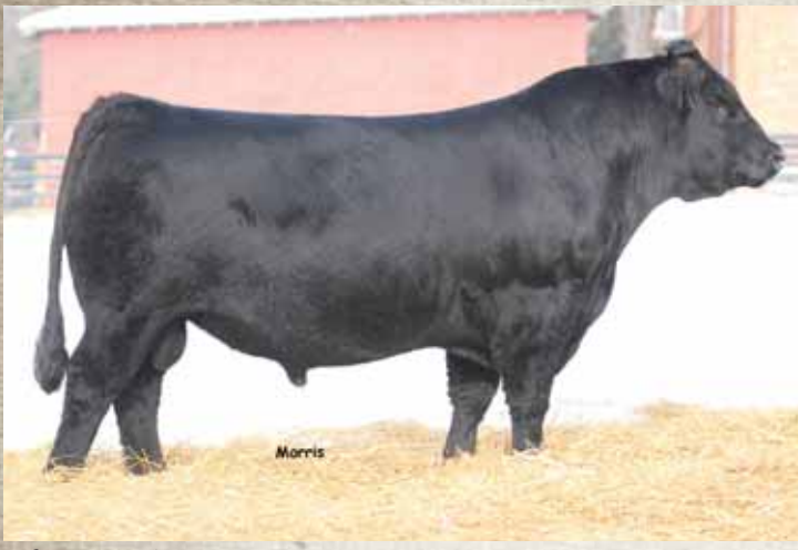
SBLX First Class, service sire to Lot 45.