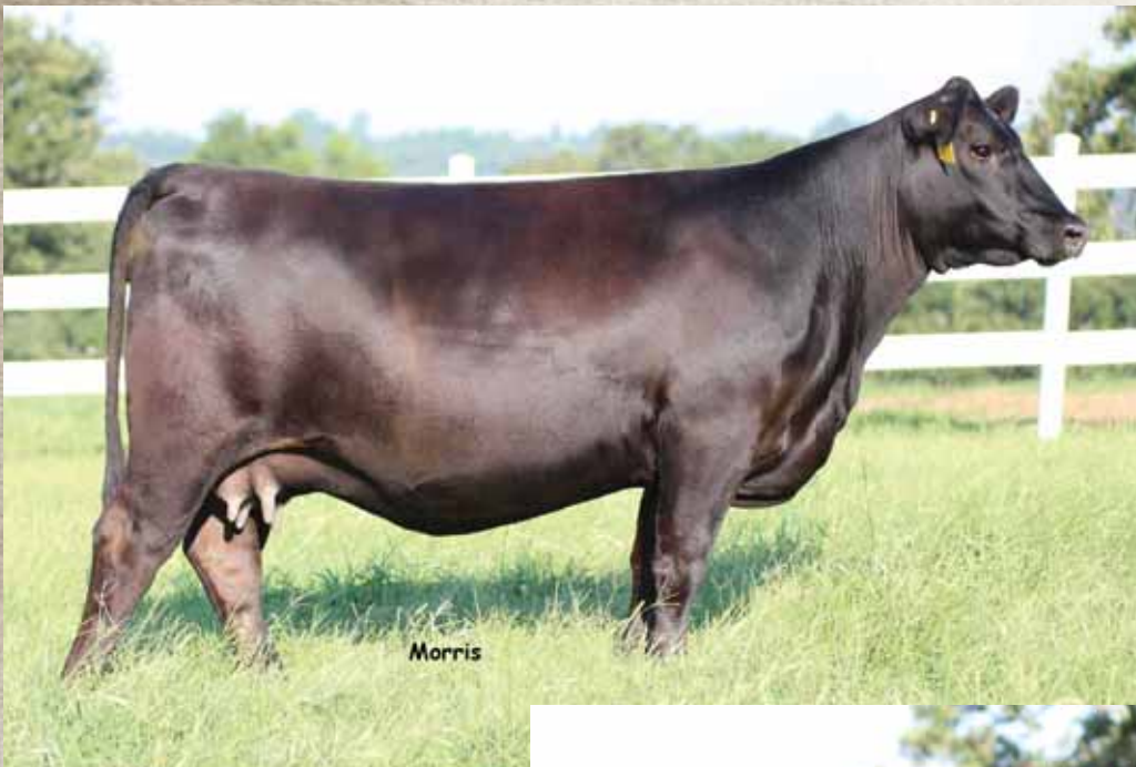
Lot 11 // P Bar S Oklahoma Wix 4165