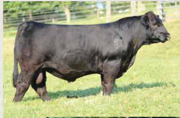
OCC Bonanza 153B

TC ABERDEEN 759 EBFL YPSILANTI 420Y MAGS RAMADA CALO BRICKYARD 902W MCBN ZAMELIA 297Z LH XCACTLY WHAT U WANT C R A BEXOR 872 5205 TC BLACKBIRD 4034 TNUH BLUE PRINT 245H MAGS MANDA SCHILLING'S TALLADEGA EXG E839 1407 M175 LS JCL LODESTAR 27L STEVENSON EMILY 7835