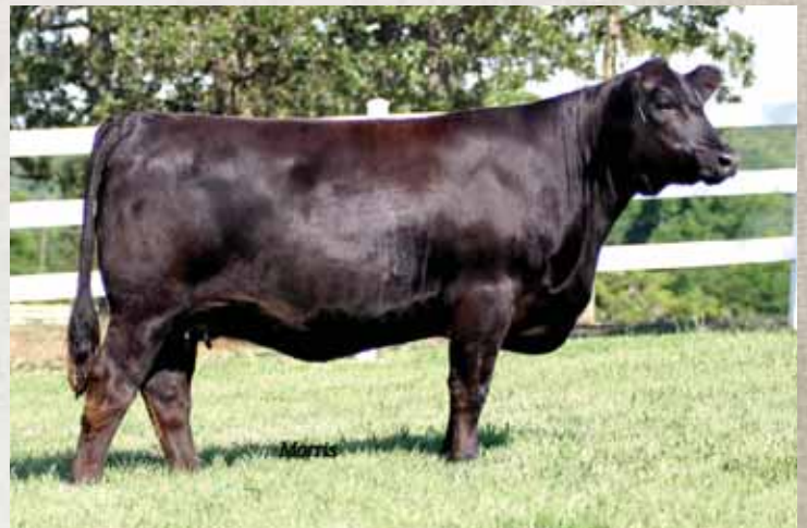
PBRS Wagon Wheel 994W, dam of Lot 32 & 33.

Sired by the syndicated sire for Double A Limousin, DALT Absolutely Anarchy. He is the prominent son of the deceased MAGS Winston. This young first calf heifer is from the elite donor PBRS Wagon Wheel 994W that is owned by P Bar S Ranch and Double A Limousin. Wagon Wheel is a daughter of GAR Predestined from WLR Rendezvous 050R. Sells bred to the once All American Futurity Grand Champion bull AUTO Lucky Strike.