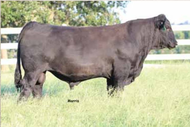
Lot 74 // PBRS Citation ET

PBRS Coal Miner 53C is one big numbered and high growth and carcass bull. He proudly carries the PBRS prefix and offers stats like you cant imagine. He scanned a 17.00 for REA and 4.30 for IMF. He ranks in the top 2% of the breed for SC with a 1.45, top 3% for REA with a .90, top 4% for SMTI with a 69.50 and top 10% for MB with a .45. This 25% double black and homozygous polled bull is sired by SAV Brand Name 9115 and is from the elite PBRS and Double A donor PBRS Wagon Wheel 994W.