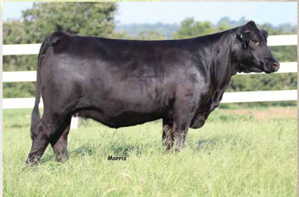
Lot 23 // PBRS 4236B