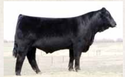
MAGS Yip Daughters