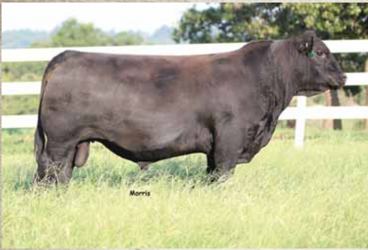
Lot 73 // PBRS Coal Miner 53C ET