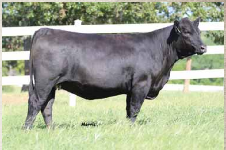
Lot 49 // PBRS 4230B

We know this 25% Lim-Flex female will make friends at the sale. She ranks in the top 2% of the breed in SC with a 1.40, top 3% for $MTI with a 71.11, top 4% for MB with a .51 and top 10% for CED with a 14 and CEM with a 9. She is sired by SAV 004 Predominant 4438 and from a daughter of SAV Bismarck 5682. We admire the EPD package, powerful pedigree and desirable conformation found here with this young first calf heifer.