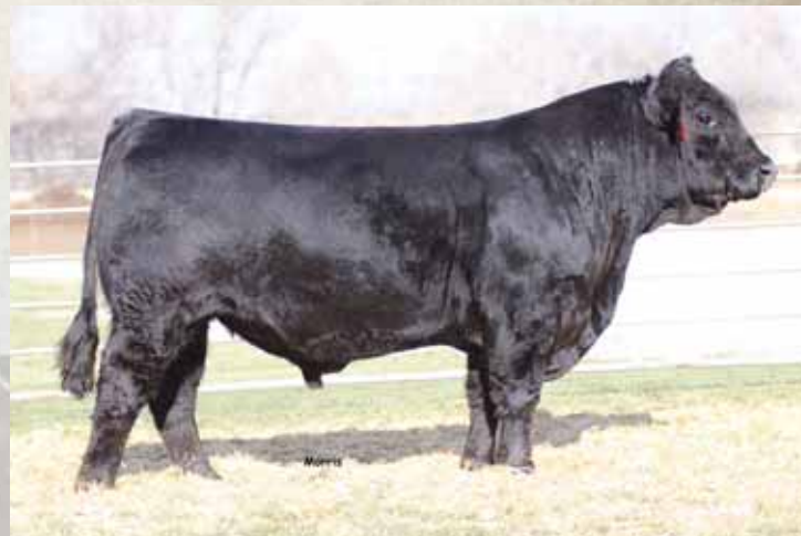
MAGS Xtra Wet, sire of Lot 72.

PBRS Consultant ET turned out exactly the way we had hoped when we created this mating. He is a 50% Lim-Flex son of MAGS Xtra Wet. He is the leading son of the national champion sire DHVO Deuce from the JCL Lodestar daughter MAGS Puddles. The dam of 510C is a purebred Angus female and daughter of SAV Traveler 004.