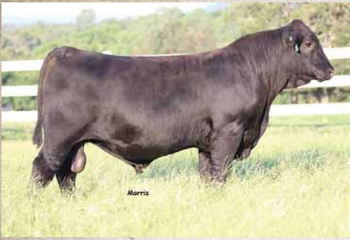
Lot 65 // PBRS Catch ET