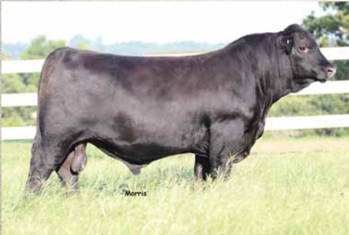
Lot 66 // PBRS Convoy ET

PBRS Catch ET is one of the top herd sire prospects of the sale and one of the favorites at the Ranch. He is the son of MAGS Anchor, the highly syndicated son of LH War Hero 195W. His dam is the elite PBRS donor FLLR Tiger Lily, the deep bodied and powerful daughter of MYTTY In Focus. This double homozygous herd sire prospect ranks in the top 10% of the breed in MB with a .42, top 15% for SMTI with a 62.83 and top 20% for SC with a 1.15. He also ranks in the top 15% for CED with a 12. He posts a 67# birth weight, 745 # weaning weight, 1130# yearling weight and scanned a 3.77 for IMF.