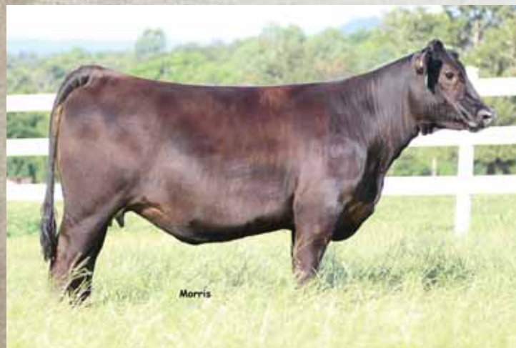
Lot 26 // PBRS Blind Date 4115B

P.E. 2.11.16 to 3.22.16 to OCCC Bonanza 158B; P.E. 05.8.16 to 07.26.16 to AUTO Lucky Strike 118B. This 68% Lim-Flex first calf heifer is homozygous polled and homozygous black. She is sired by the MAGS Unloosen son PBRS 020X. He has been widely used in the P Bar S program where he has created some very well made and productive daughters such as this one. As you will see in the picture she is very feminine and has that cool show look to her. Her dam is a daughter of the once national reserve champion bull EF Main Stay 541M.