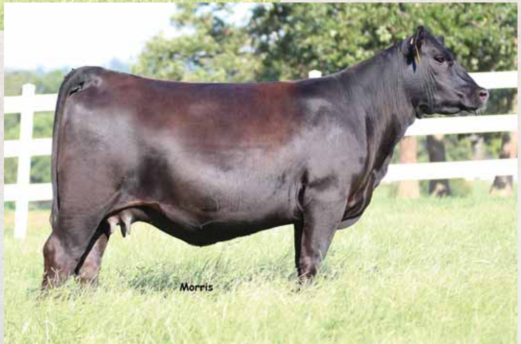
Lot 12 // P Bar S Oklahoma 4190