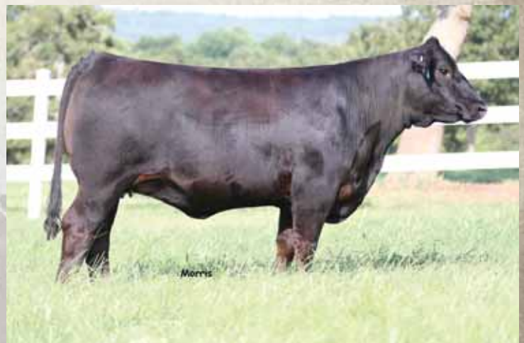
Lot 33 // PBRS Carbon Copy 54C ET

This daughter of PBRS Wagon Wheel 994W is one of the real nice replacement females in this sale offering. PBRS Wagon Wheel 994W is the partnership donor with P Bar S and Double A Limousin and proven daughter of GAR Predestined form WLR Rendezvous 050R. P Bar S Carbon Copy 54C is sired by the huge numbered Lim-Flex sire LH U Haul 135U. She ranks in the top 2% of the breed in MB with a .66 and SMTI with a 74.78.