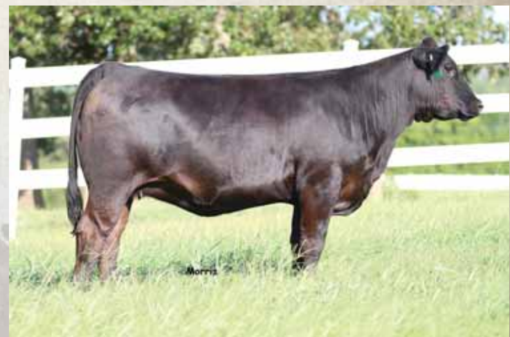
Lot 52 // PBRS Casino Winning 55C

PBRS Casino Winning 55C ranks in the top 10% of the breed in CEM with a 9, SC with a 1.15, CW with a 40 and 15% for YW with a 114 and top 25% for WW with a 70. She is sired by MAGS Y-Axis and from a big numbered Lim-Flex daughter of the deceased and $50,000 sire AHCC Westwind W544. This young heifer is double homozygous and represents nationally recognized genetics that will work well in any program.