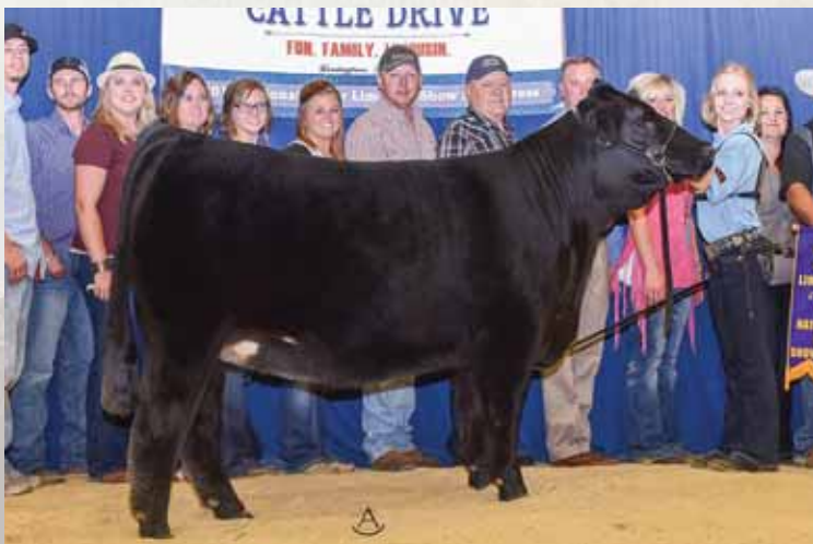
Riverstone Charmed, a full sister to Riverstone Crown Royal.