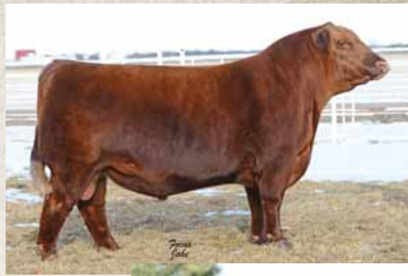
Six Mile Taurus 519A, sire of Lot 4.

SIX MILE GAME FACE 164Y SIX MILE TAURUS 519A RED SIX MILE SHAWNEE 116T SL STRAIGHT EDGE MINE PLD WATERMELON ARWL PLD PEBBLES 4152P VGW GAME PLAN 816 RED SIX MILE LAKOTO 35W 5L NORSEMAN KING 2291 RED CROWFOOT SHAWNEE 9124J GPFF BLAQUE RULON JSTH ANGELS CENTERFOLD DJ GENTLEMAN IN BLACK ARWL BRITCHES 0133K