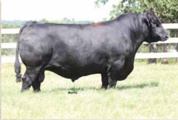
PBRS Milestone 137Y

MAGS YIP MAGS THE GENERAL AUTO DOLLAR GENERAL 122R AUTO CARMINDA 656S EXLR LUVLY 821M LBAF SHAWNEE 602 TWIN VALLEY PRECISIONE161 AUTO CARMINDA 872P SUNSET SHAWNEE 3905 GAR PRECISION 1680 WCC BLACKCAP C9 S A V 8180 TRAVELER 004 S V F SHAWNEE 608