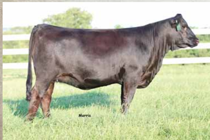
Lot 48 // PBRS Cheerful 549C

In the fall bred heifer section of this sale you will find two full sisters to this heifer. She is sired by the highly syndicated EBFL Ypsilanti 420Y. He is the big numbered son of TC Freedom from the national champion MAGS Ramada. His daughters are now in production and have proven they are very maternal and milk very well. She is from the PBRS donor ELCX Wow 219X, a big numbered daughter of the purebred Angus sire Deer Valley Direction S6118.