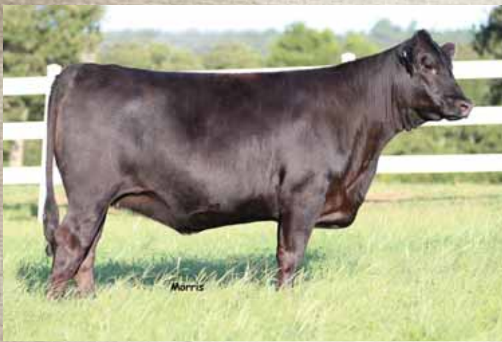
Lot 53 // PBRS Charity ET