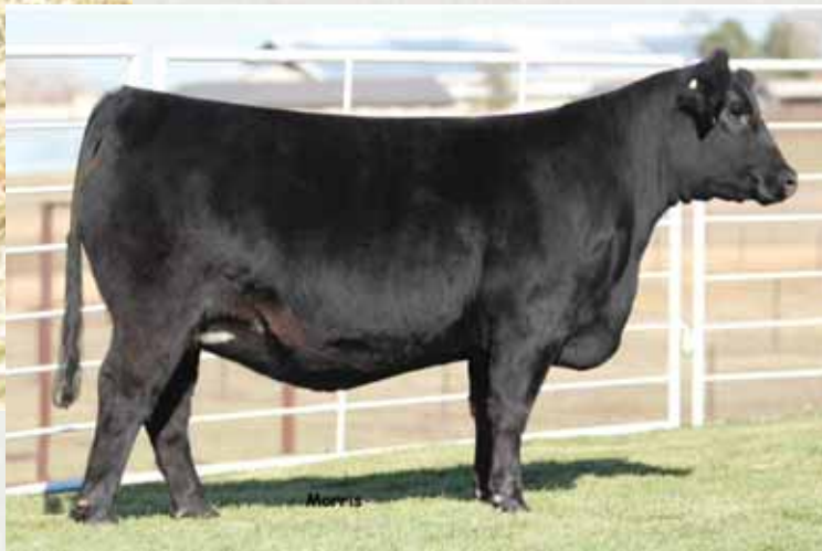
MAGS Barbie, dam of Lot 2.

40 units at $3,000 Semen will be closed for one year; after that point you have the option to buy another 40 units for $50 per unit ($2,000) with the plan to keep the bull off the open market, we are only offering set units of semen and not % ownership.