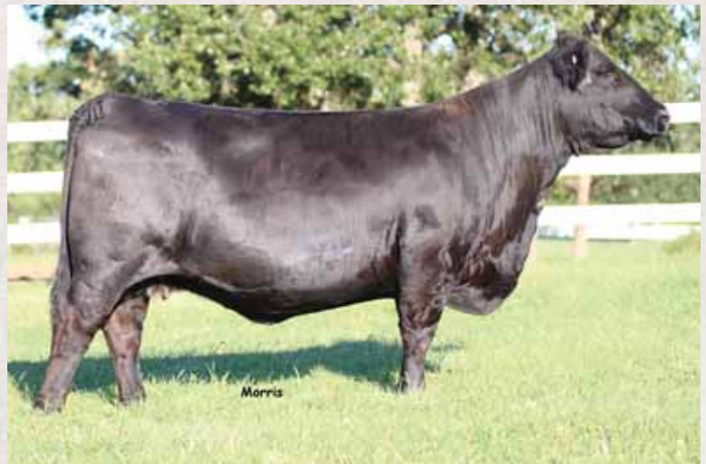
EF Up to the Challenge, dam of Lot 3.