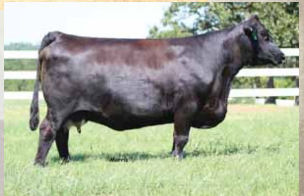
PBRS Winning Ways 29W, dam of Lot 5.

Terms of the purchase; Buyers pay half of the purchase price at the time of the sale and the remaining half will be paid at the time of selection (weaning time).