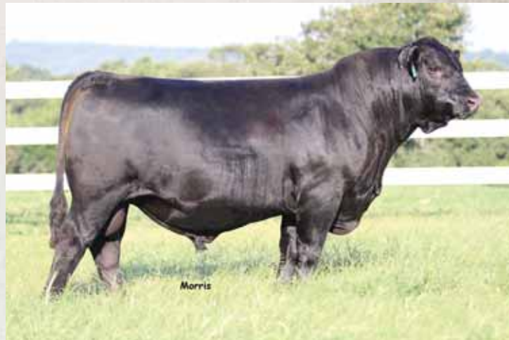
Lot 71 // PBRS Cisco 514C

PBRS Cisco 514C is a 50% Lim-Flex herd sire prospect that is homozygous polled and homozygous black. He just happens to be a maternal brother to PBRS Milestone, the $30,000 syndicated sire and a paternal sibling is the $20,000 valued donor owned with Owen Cattle Co., Hornbeak, TN. This beef bull is sired by PBRS 024X, the once PBRS senior herd sire and son of DHVO Deuce from the predictable purebred Angus donor Oak Hill Miss Wix 72S. He ranks in the top 4% of the breed for MB with a .53, top 5% in $MTI with a 68.2 and SC with a 1.22.