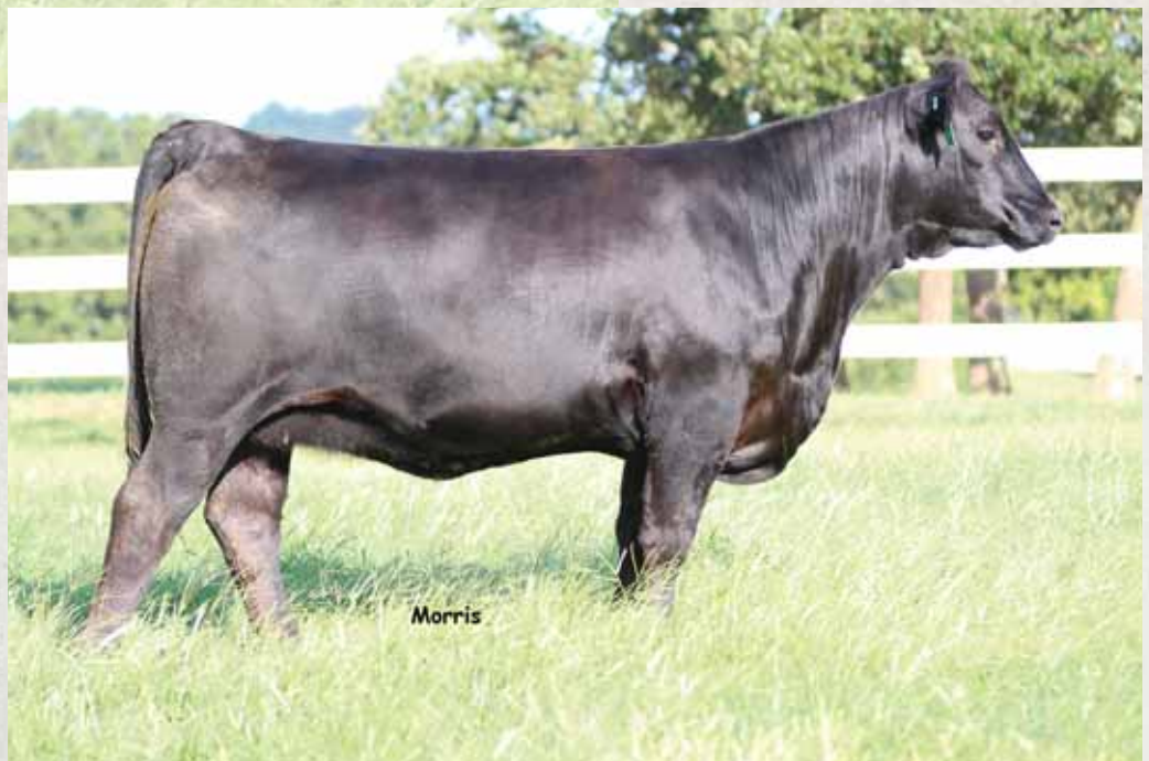
Lot 30 // PBRS Class Act ET