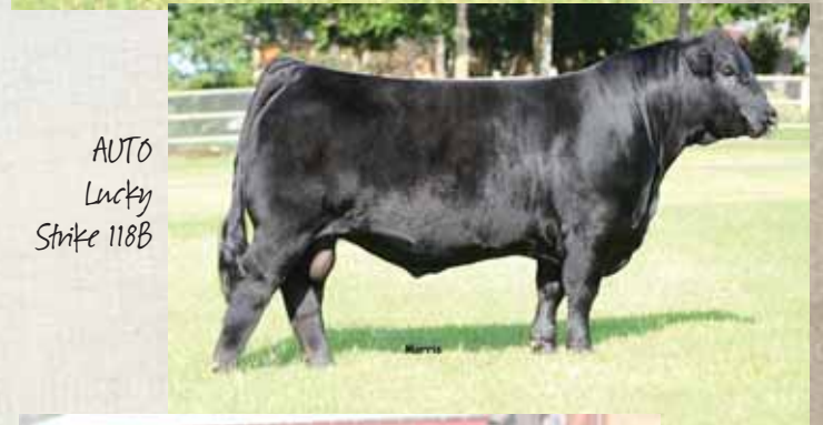
AUTO Lucky Strike 118B

BASIN FRANCHISE P142 LH U HAUL 135U EXLR DUCHESS 7129R WLR DIRECT HIT AUTO LUCKIE 246W TYEJ DB SERENITY C A FUTURE DIRECTION 5321 BASIN CHLOE 812L EXLR NEW GENERATION 071M EXLR 199H KRVN NASKAR 013N MAGS NIGHT AMBUSH LESF ASPHALT 9N TYEJ DB SIZZLE