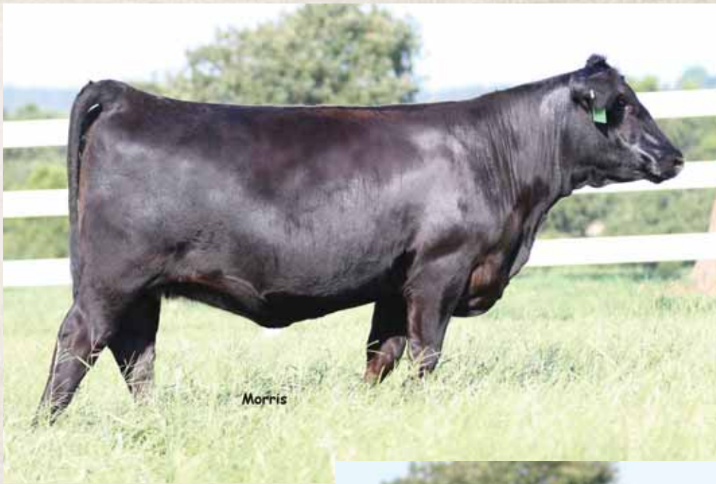
Lot 22 // PBRS 4240B ET