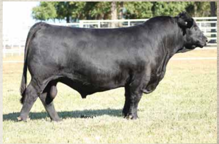
PBRS Bunk House, service sire to Lot 31.

PBRS 574C ET is a daughter of the elite P Bar S donor WLR Rendezvous 050R. She is sired by the purebred Angus sire EXAR EZX 3772B, an elite son of AAR Ten X 7008 S A. This young female not only has a pedigree that can read and write but she has a set of numbers that are ranked well above breed average. She ranks in the top 4% of the breed in CEM with a 10, top 5% for MB with a .48 and top 10% for CED with a 14, BW with -1.1 and SMTI with 66.98.