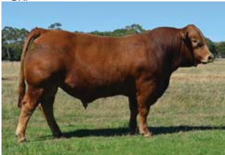
B Bar Titanium 3Z son, Warrawindi Red Label L40. Bred by Warrawindi Limousin, Australia