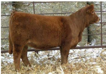
B Bar Urban Girl 2A Daughter, Miss Wasy Deported 638D. Bred by Symens Bros. Limousin, SD