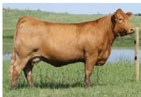
Maternal sister to Lot 23 and Lot 24

AI Bred to Hunt Credentials 37C ET :: Due January 11, 2018 (Safe) Exposed to B Bar Slate 17C from April 21 - May 17