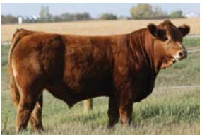
Son selling as Lot 15