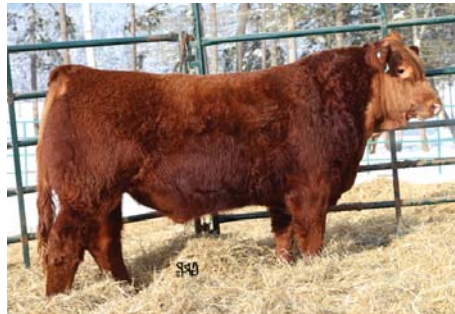
B Bar Colbalt 28Z son, Pinnacle's Boogie Nights 50B. Bred by Pinnacle View Limousin, BC