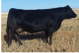
Maternal Grandam of Lot 4 & 5

B Bar November 18E is a thick, long bodied, stout made Credentials 37C son that has early maturity in a moderate package. His two year old dam is a full sister to the Semex bull, B Bar Granite 57C. November 18E has a strong pedigree, EPD tabulation, with a 80lbs birth weight and 784lbs 205 day weight to ratio 108.