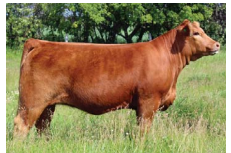
B Bar Cognac 1B daughter, Greenwood Miss PYN 25D. Bred by Greenwood Limousin, SK