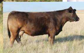
Dam of Lot 23 & 24 Grandam of Lot 20