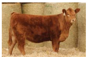
Daughter B Bar Jeopardy 2D