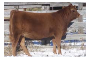
Daughter B Bar Nicole 35A