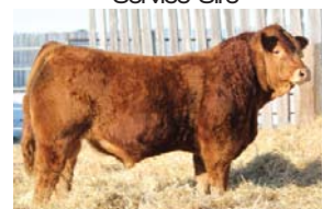
Son B Bar Quartz 19C