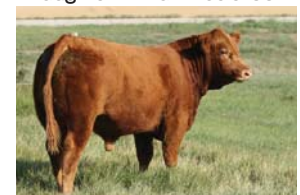
Son selling as Lot 8