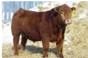
Son B Bar Baja Tango 12A