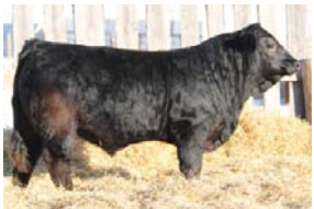
Son B Bar Onyx 4C