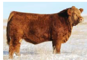
Son B Bar Rust 31B