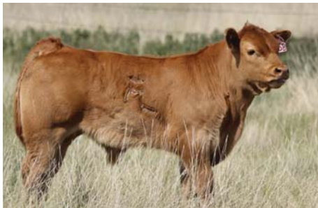
B Bar Slate 17C son, Slate WR Yur So Complete 727. Bred by Andrew Ranches, AB

B Bar Cattle, Anchor B Limousin, Carpenter Cattle Co., Eden Meadows Farm, Richmond Ranch, Venture Livestock, Payne Livestock, Greenwood Limousin, J. Yorga Farms, Jones Cattle Company, Bee Zee Acres, Pinnacle View Limousin, Hollee Limousin, Hillview Farms, Jaymarandy Livestock, Andrew Ranches!