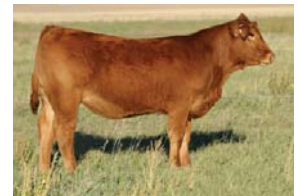
Daughter B Bar Foxtrot 29C