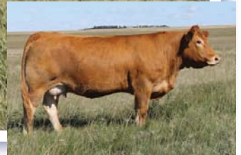
Maternal Grandam of Lot 6 & 7