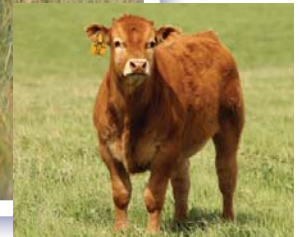
Lot 13 at 5 months