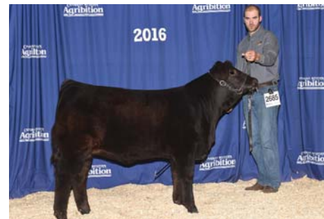
B Bar Soot 25B daughter, HLC Denver 18D. Bred by Hewson Land & Cattle Co., SK