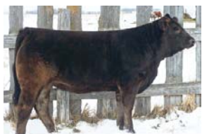
Daughter B Bar Jeopardy 13A