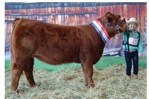
B Bar Titanium 3Z daughter, WG Montana. Bred by Western Gold Limousin, Australia