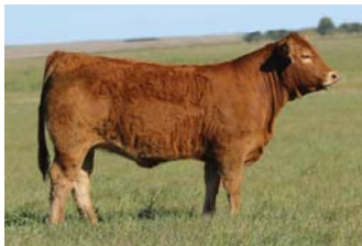
Dam as a calf

B Bar Lima 65E offers a tremendous genetic and visual package to be a major factor of our offering. He has tremendous structural integrity, great front end, deep ribbed, square stout base and great scrotal development. Lima 65E, like all Credential calves, has an easy going personality to be around and was terrific to halter break. His truly impressive young two year old dam has done a fantastic job raising him, where Lima 65E sports a 105 weaning ratio and ranks 5/18. The power of strong cow families and full sisters can be seen in our Lot 1 & Lot 2 bulls.