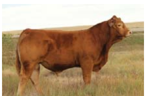
Son selling as Lot 9