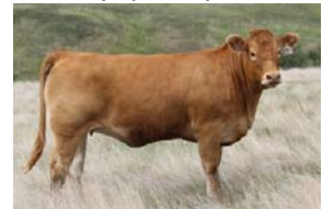
Daughter B Bar Jeopardy 11B