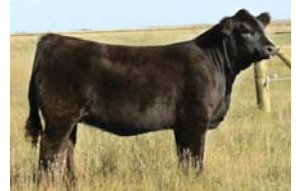
Daughter B Bar Shania 20B