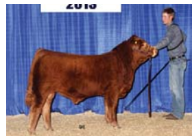
Son B Bar Chivas Regal 22A