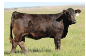
Daughter B Bar Nicole 31C