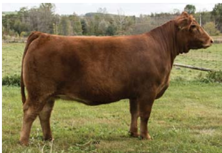
B Bar Staburst 18A daughter, Red Maple Dirty Secret 6D. Bred by Red Maple Farms, ON