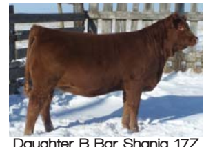
Daughter B Bar Shania 17Z