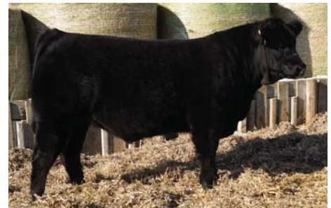
B Bar Cognac 1B son, JFAF 104D. Bred by Franseen Limousin, WI