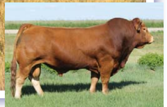
B Bar Slate 17C full brother to dam of Lot 7