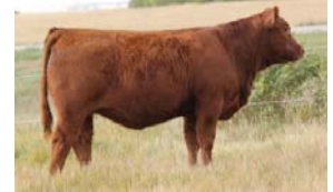
Daughter B Bar Foxtrot 32E