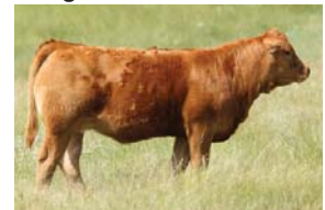
Daughter B Bar Shania 35D