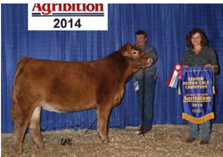
B Bar Titanium 3Z daughter, RPY Paynes Beauty 33b. Bred by Payne Livestock, SK