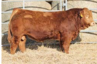
Full brother to dam

Sire: HUNT CREDENTIALS 37C ET HUNT TESTAMENT 40T JKTW WHISKEY RIVER 985 W