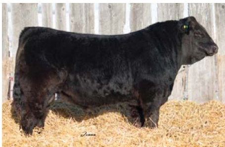
B Bar Shania 20B son, Lingley's Django 9D. Bred by Lingley Limousin, AB