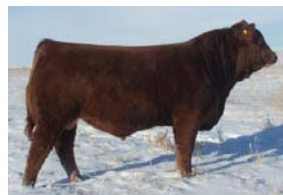
Son B Bar Brass 50Z