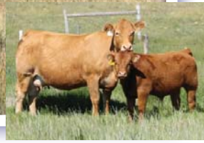
Lot 3 with dam