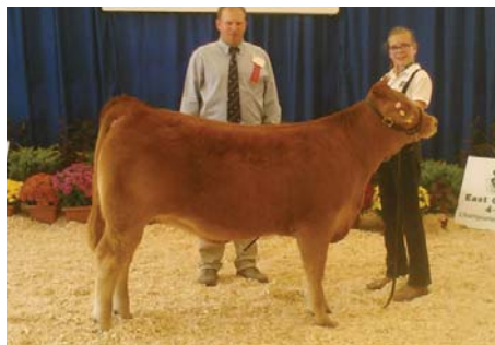
B Bar Brick 5 B daughter, Birubi Mazurka M116. Bred by Birubi Limousin Stud, Australia