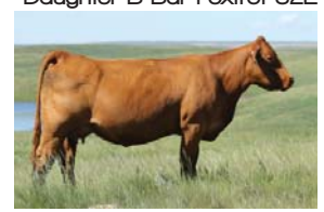
Daughter B Bar Foxtrot 22B