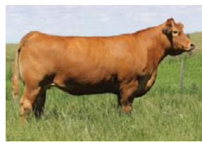
Dam of Lot 22; Maternal sister to Lot 21

AI Bred to B Bar Bentley 8D :: Due January 14, 2018 (Safe) Exposed April 21 - May 17, 2017 to DBCC Dr. Feelgood