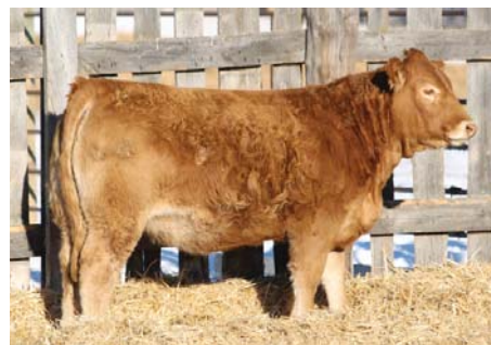
B Bar Titanium 3Z daughter, Bar 3R Cotton Jenny. Bred by Bar 3R Limousin, SK