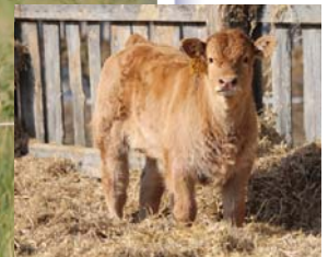
Lot 13 at 3 months