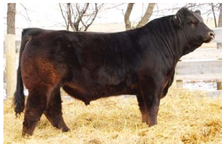
B Bar Soot 25B son, DBCC Dr. Feelgood 2B. Bred by Double B Cattle Co. SK