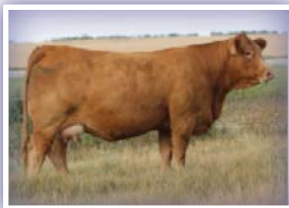
Daughter, B Bar Nicole 1D