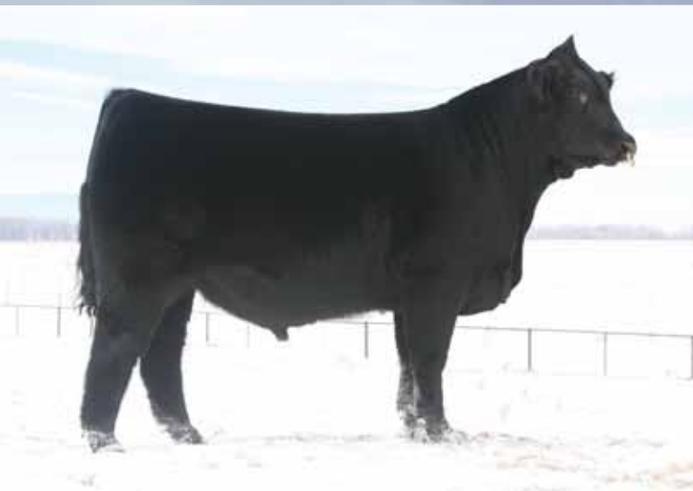
MAGS Xyloid, sire of Lot 65.