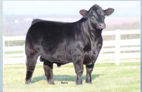
ELCX Turning Point 641Z, sire of Lot 18.