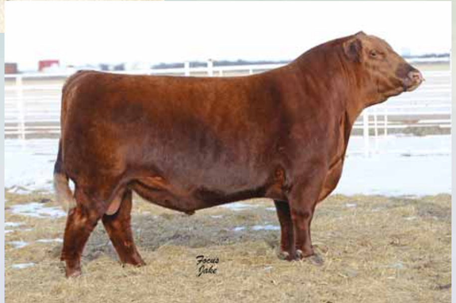
Six Mile Taurus 519A, sire of Lot 6