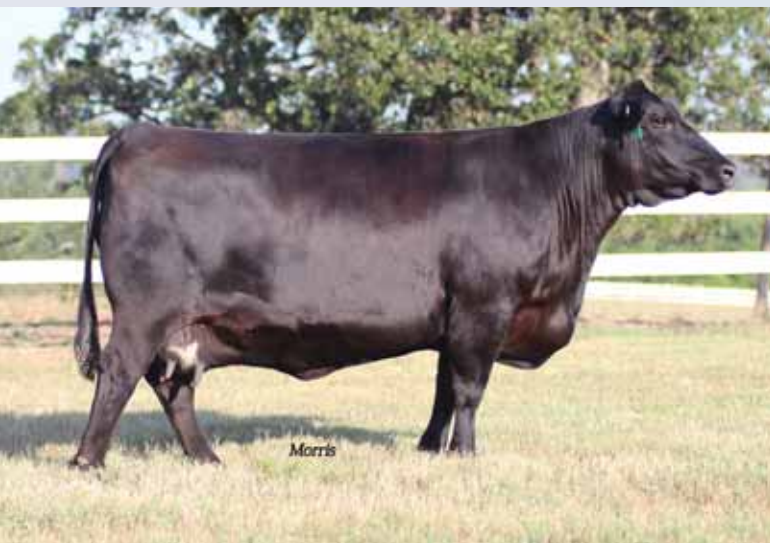
FLLR Tiger Lily, dam of Lot 92.

This bull is backed by the maternal power from his dam, AUTO Whitnee 605W. Whitnee is one of the deepest sided, easiest fleshing females of her contemporaries. PBRS 6184D is a homozygous black, 62% Lim-Flex bull that ranks in the top 20% of the breed for MB.