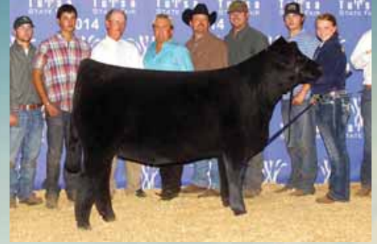
SLKF Sister Act 1322, dam of Lot 5.