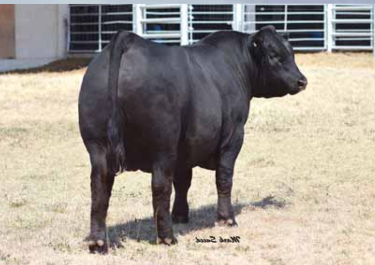
OKSU The Profit, sire of Lot 90 & 91.