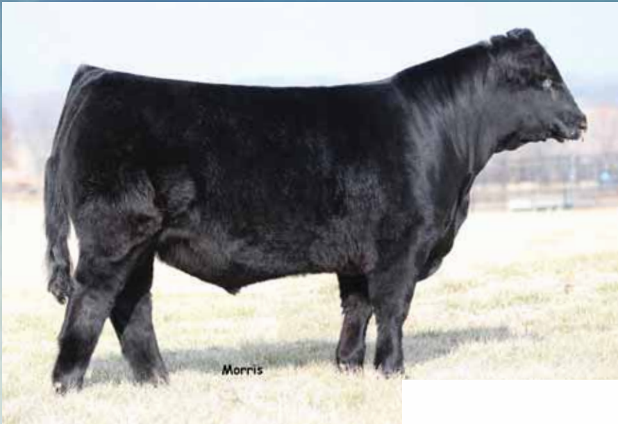
AUTO Lucky Strike 118B, sire of Lot 5.