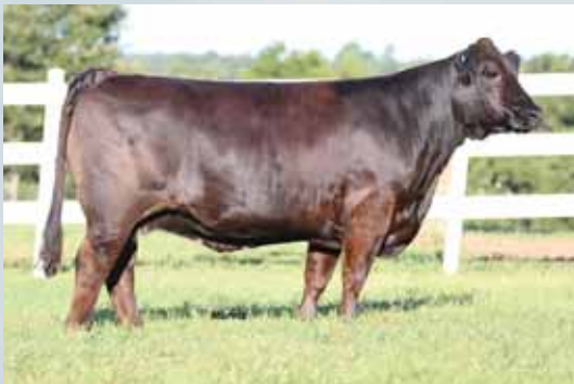
MINE PLD Watermelon, dam of Lot 6.