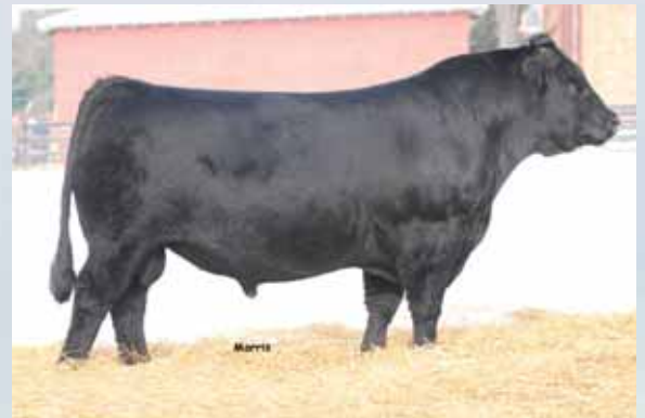
SBLX First Class, sire of Lots 19 - 23.

EXG RS FIRST RATE S903 R3 DAMERON NORTHERN MISS 311 EXLR LIMITED EDITION 765J AUTO CITY NIGHTS 214H SAF FOCUS OF ER MYTTY COUNTESS 906 TNUH BLUE PRINT 245H