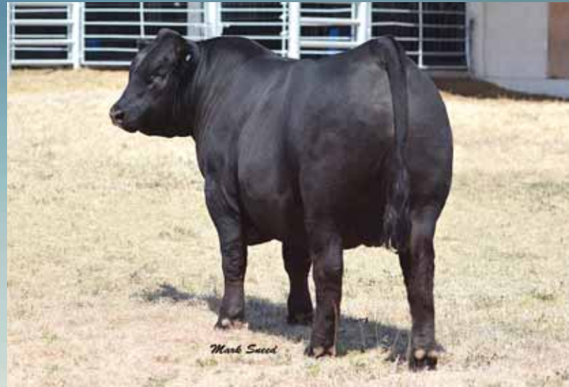
OKSU The Profit, sire of Lots 49 - 59.

This 50% Lim-Flex female is out of the P Bar S Ranch proven donor, FLLR Tiger Lilly. Tiger Lily is the big footed, big ribbed female that continues to produce superior quality for P Bar S and this daughter will follow in her footsteps.