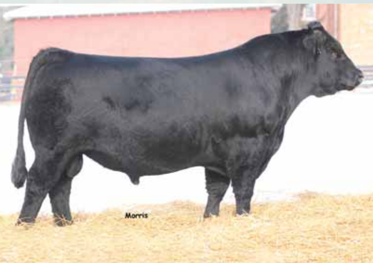
SBLX First Class, sire of Lot 92.

Here is another OKSU The Profit 3401 son that is double polled and double black. His dam is a proven calving ease producer for us time after time, sired by Wulfs Shop Talk. Mass, stoutness and masculinity is written all over this bull.