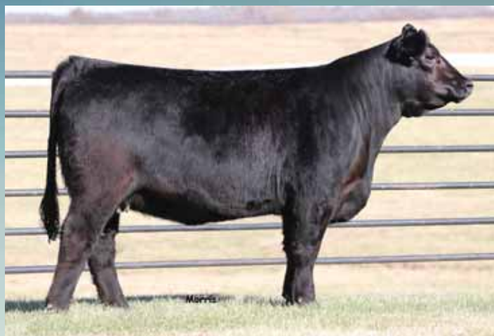
AUTO Ajay 206A, dam of Lots 15 - 17.