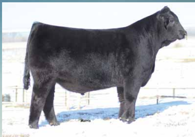
MAGS Aviator, service sire to Lots 27 - 30.

Attractive and functional in her design, this homozygous black female will be one that is front pasture material. She ranks in the top 10% of the breed for MB and will make efficient, eye appealing offspring.