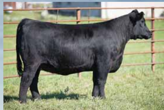
ADLL 5125C ET, dam of Lot 3.