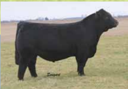
RLBH Air Force, a full brother to RLBH Days of Thunder.