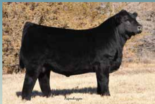
Cottage Lake Border Agent, sire of Lot 88 & 89.