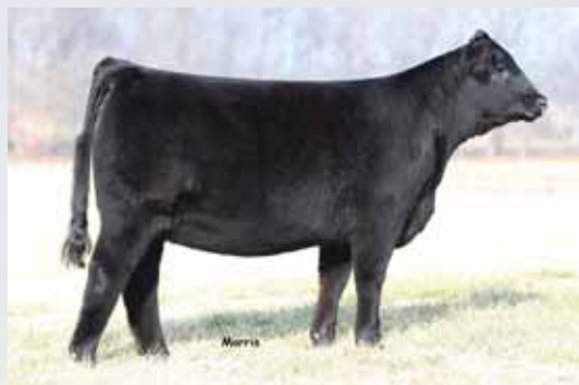
AUTO Classy 272B, dam of Lot 4.