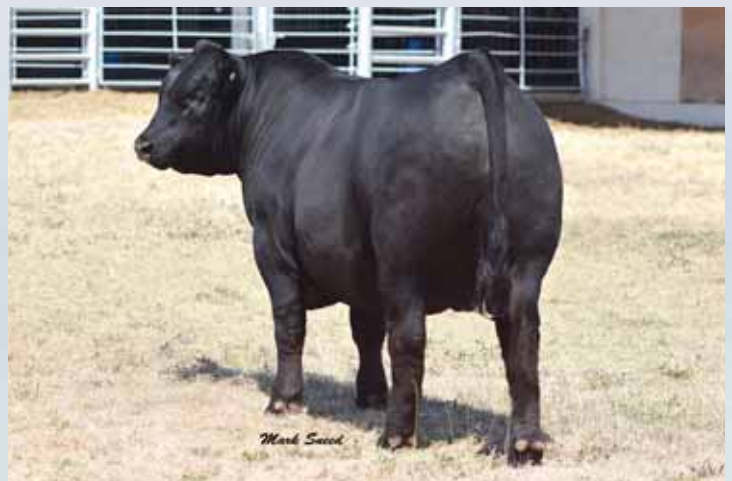
OKSU The Profit, sire of Lots 23 - 29.

This female will be a workhorse in your operation. She is extremely broody in her phenotype and full of substance. Sired by one of the breeds hottest sires, LH Rodemaster 338R son, OKSU The Profit 3401. Her dam is a MAGS Wazowski daughter with an impressive EPD profile. PBRS 5202C ranks in the top 15% of the breed for YW and MB.