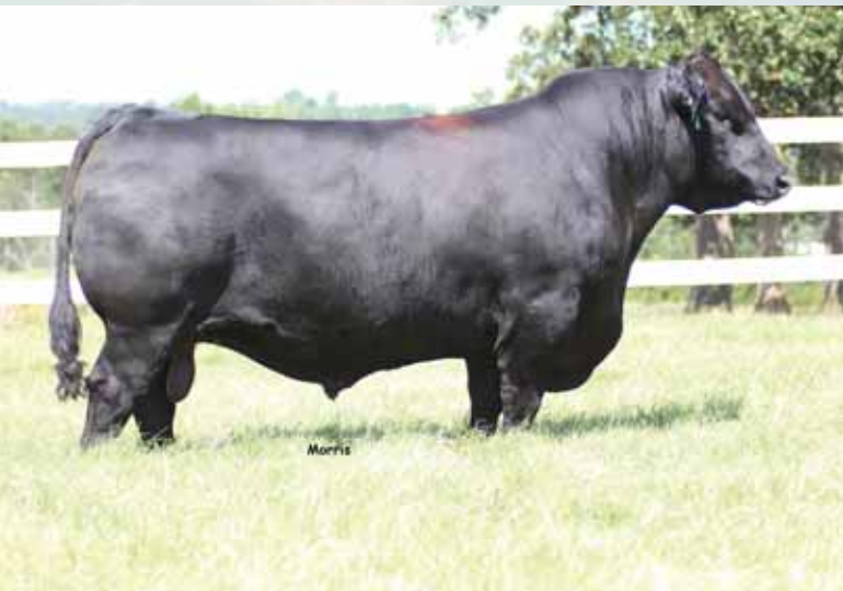
PBRS Milestone 137Y, maternal brother to Lot 34.