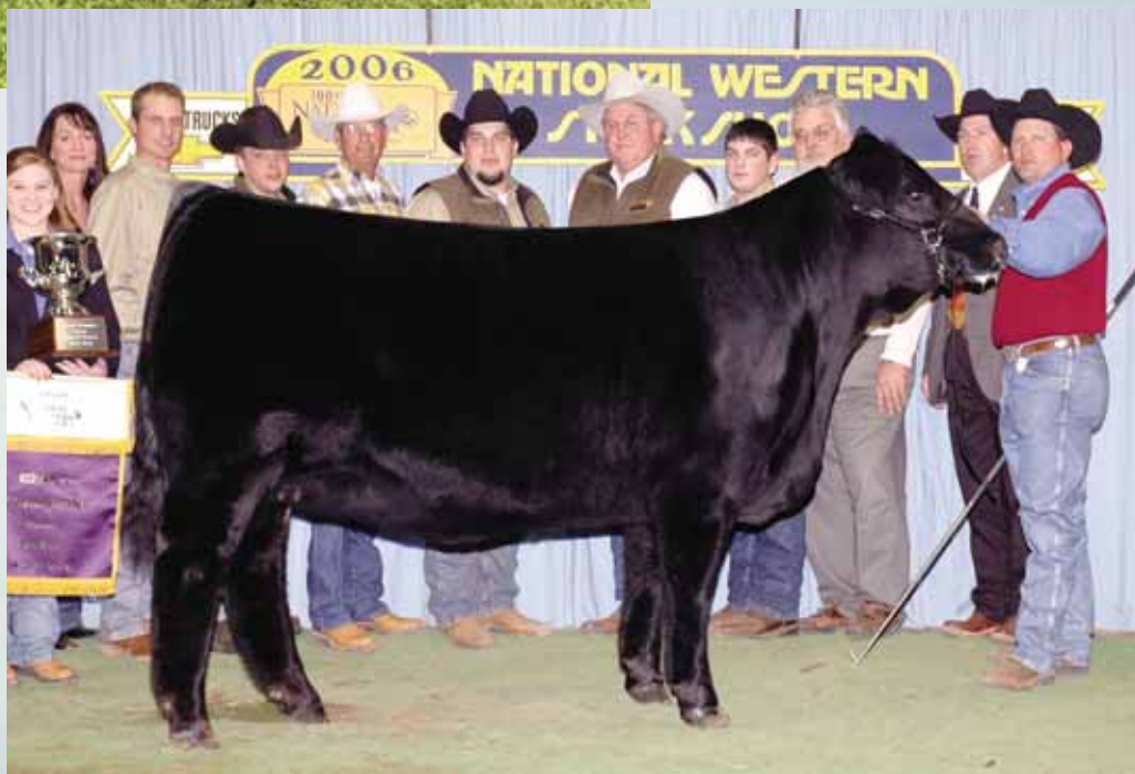
Carrouels Pina Colada