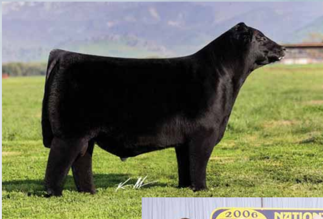
Colburn Primo 5153

Colburn Primo is stamping his progeny nationwide within the Angus breed and the hybrid sector. If you are interested in the future and diving into Lim-Flex show cattle head first, this is the one to do it on.