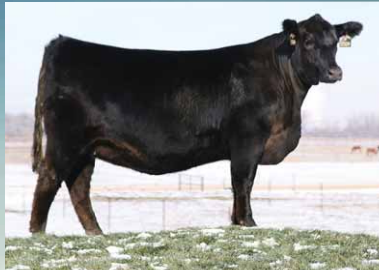
MAGS Universal Time, dam of Lot 34 & 35.

Another MAGS Anchor x MAGS Universal Time daughter that ranks in the upper 2% for MB. She is a 56% Lim-Flex female that will make offspring that will appeal to many.