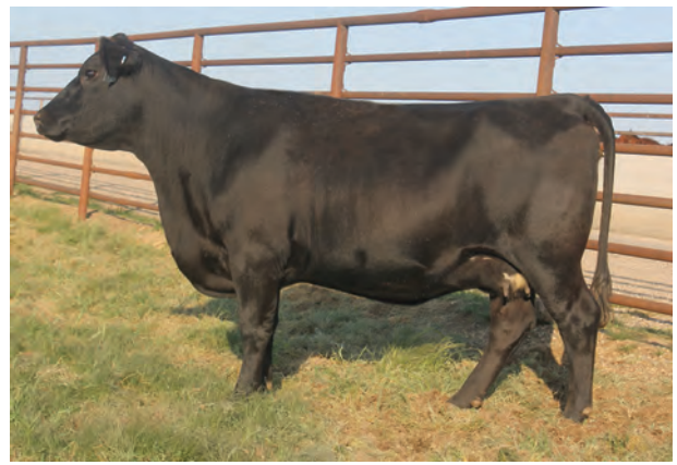
Wulfs Persephone 5901C - Sells as Lot 38