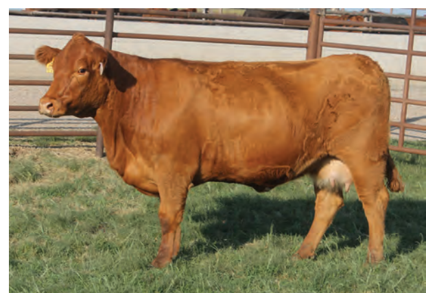
Wulfs Bee Line 4760B • Sells as Lot 1