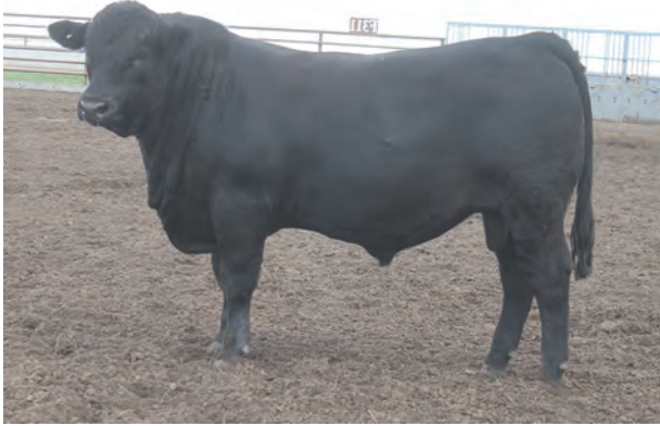
Wulfs Double Bond 1921D • Sells as Lot 43