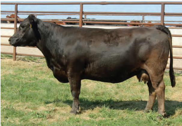
Miss Wulfette 2265Z • Sells as Lot 26

AI Bred 06/30/2017 to WULFS XCELLSIOR X252X due 04/09/2018, Checked Safe