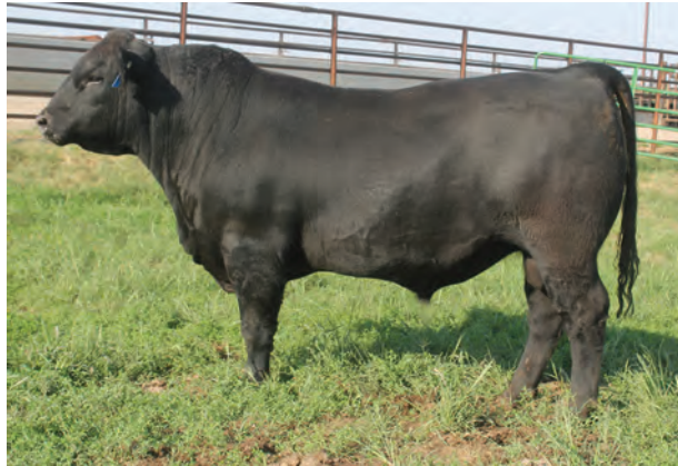
Wulfs War Party A415D - Sells as Lot 57