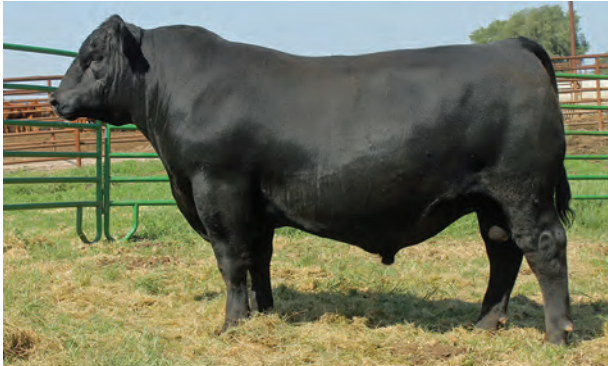
Wulfs Tital A026D - Sells as Lot 62