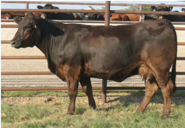
Wulfs Breann 4154B ET • Sells as Lot 8