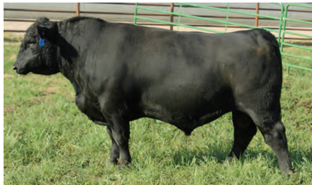
Wulfs Investment A244D • Sells as Lot 51