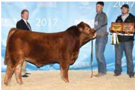
B Bar Martens Kilo 60E ET