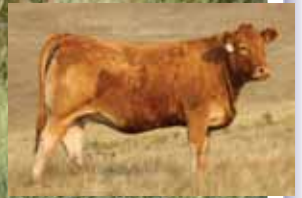
Daughter B Bar Shania 68E