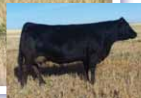
Maternal Grandam of Lots 19 & 20