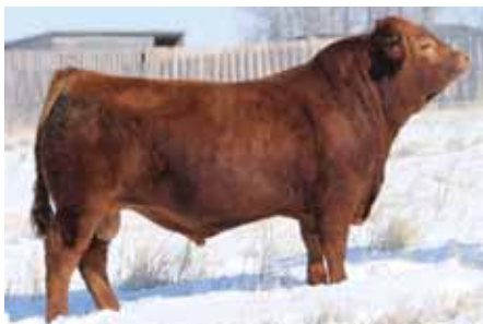
2017 Sale Lot 2 to Roslin Enterprises, ON