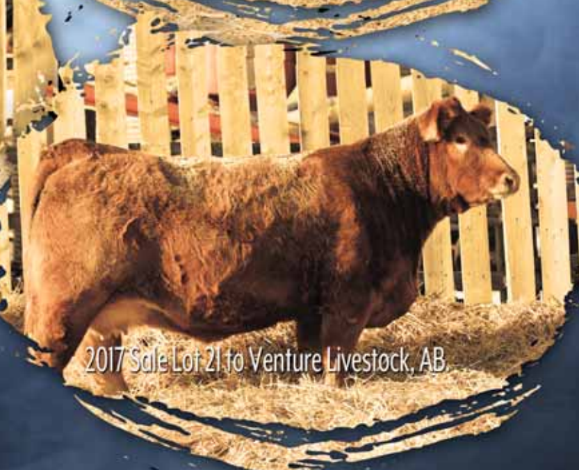
2017 Sale Lot 21 to Venture Livestock, AB