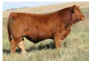
Son B Bar Lionheart 63F Sells as Lot 8