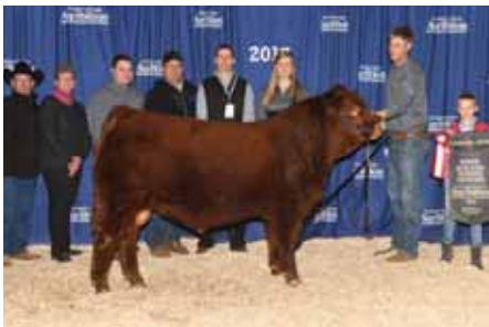
RPY Paynes Cracker 17E