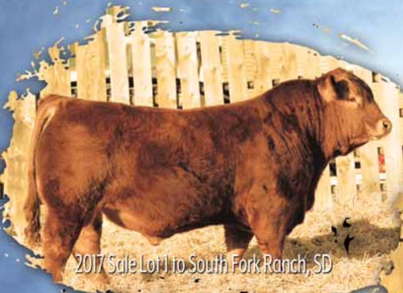
2017 Sale Lot 1 to South Fork Ranch, SD

RETURN POSTAGE GUARANTEED PORT DE RETOUR GARANTI