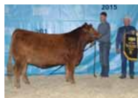
Dam, Reserve Champion Female FarmFair