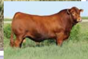
Service Sire of Lots 26 & 27

Sire: HUNT CREDENTIALS 37C ET HUNT TESTAMENT 40T JKTW WHISKEY RIVER 985 W