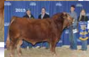
Sire of 23b