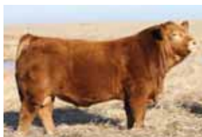
$15,000 son and 2016 National Reserve Champion