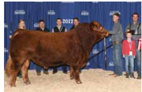
JYF Chunk 35C