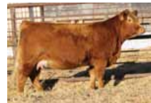
Maternal Sister B Bar Shania 100C