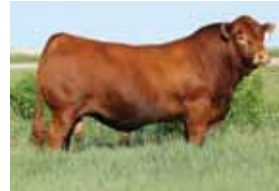
Service Sire of Lots 24 & 25