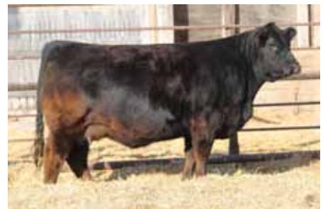
2017 Sale Lot 24 to Guthmiller Limousin, SD