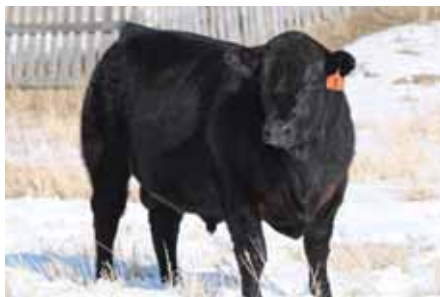
2017 Sale Lot 5 to Campbell Land and Cattle, and NYK Cattle Co, MB