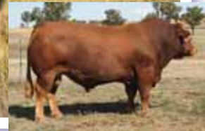
Sire of 23a