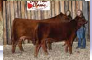
Dam alongside Grandam