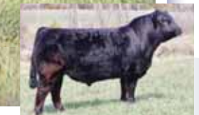
Service Sire of Lots 28 & 29