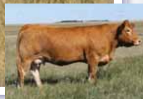
Paternal Grandam of Lots 17 - 21