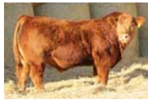
Son B Bar Dusenbergy 3D