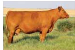
Maternal Sister B Bar Shania 234X