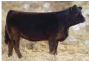
Daughter B Bar Shania 25A