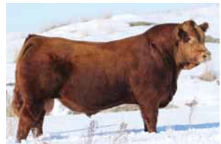
2017 Sale Lot 6 to Yandell Limousin, TX