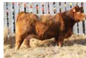
$35,500 valued daughter