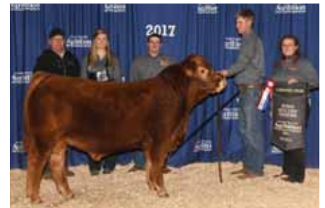
B Bar Martens Kilo 60E ET