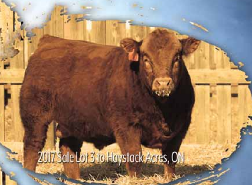
2017 Sale Lot 3 to Haystack Acres, ON