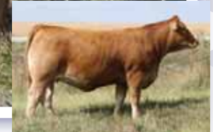
Maternal Sister Sells as Lot 26