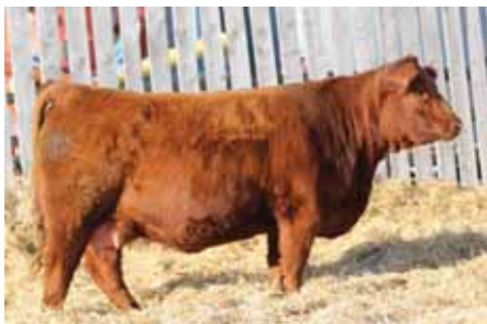
2017 Sale Lot 18 to J. Yorga Farms, SK