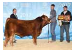
Son, 2017 National Reserve Champion Bull