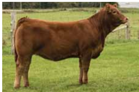
2017 Sale resulting calf from Lot 28 to Red Maple Farms, ON