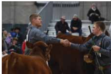
2017 National Champion Bulls