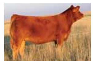
Dam, September 2014