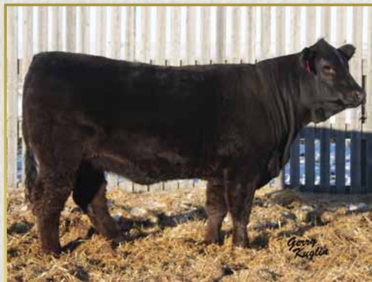
JYF Mgmt Rating: 3