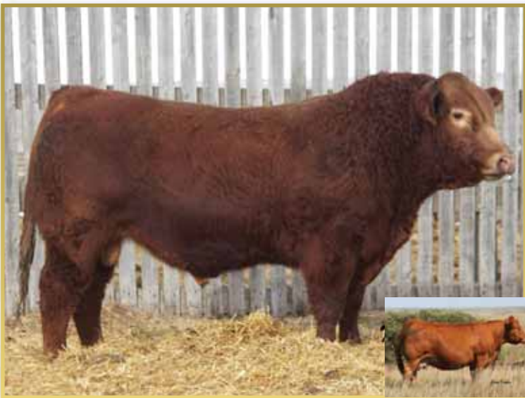
Full Sib of Lots 5, 6, 7