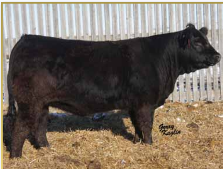
JYF Mgmt Rating: 2