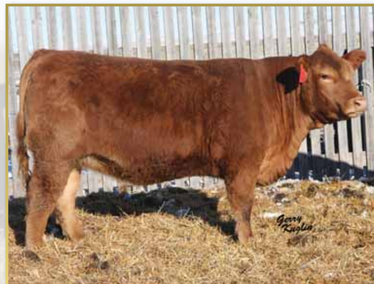
JYF Mgmt Rating: 3