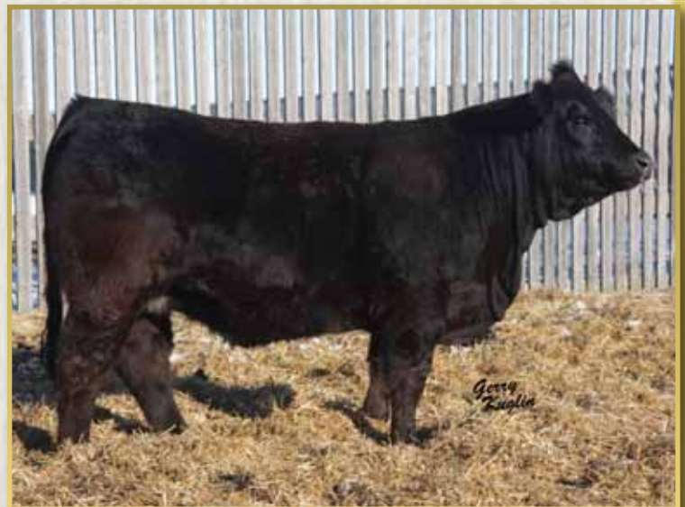
JYF Mgmt Rating: 2

HC FINAL TIME 407 WULFS SOLOIST 6284S CLLL NEW DIRECTION 394P TOP MEADOW 412M ROMN MADE TO ORDER JYF KIMBERLEY MR SYES GRID IRON 113G MISS TELSTAR