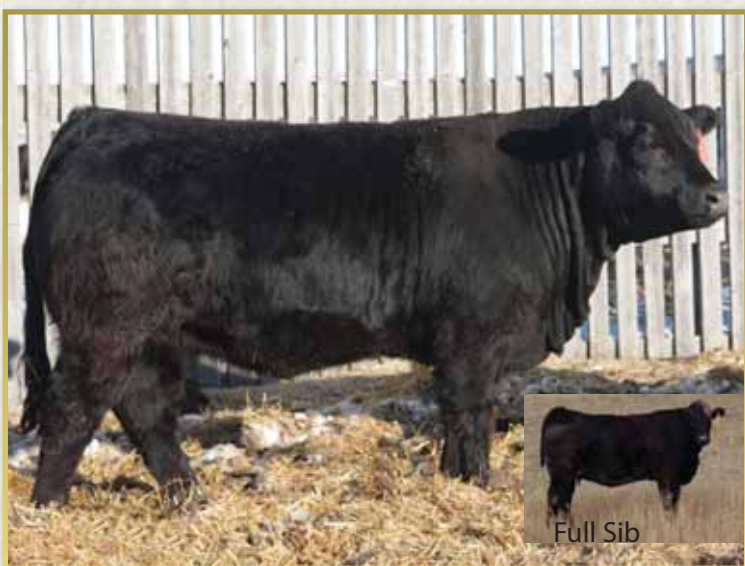
JYF Mgmt Rating: 2