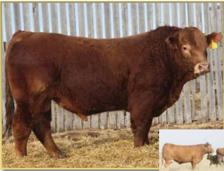
Dam of Lots 17 & 18

We are offering the successful buyer of Lot 17 the opportunity to buy Lot 18 or Lot 19 or both for the price paid for Lot 17