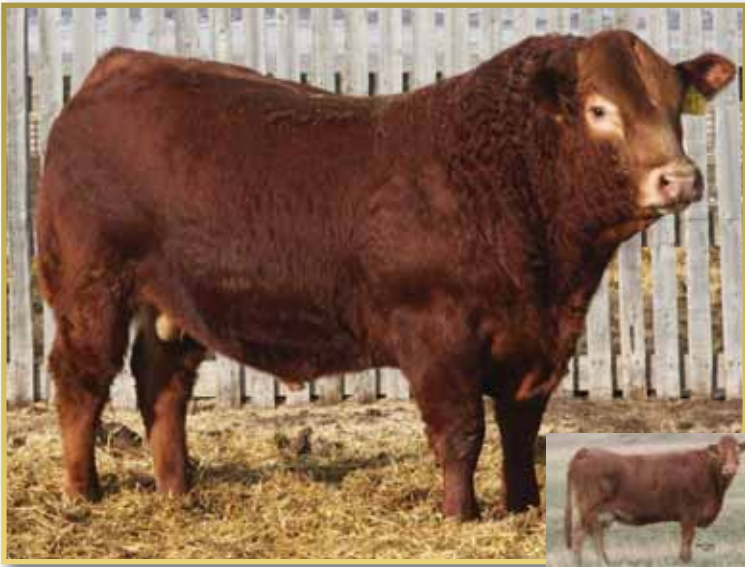
Dam of Lots 5, 6, 7

We are offering the successful buyer of Lot 5 the opportunity to buy Lot 6 or Lot 7 or both for the price paid for Lot 5