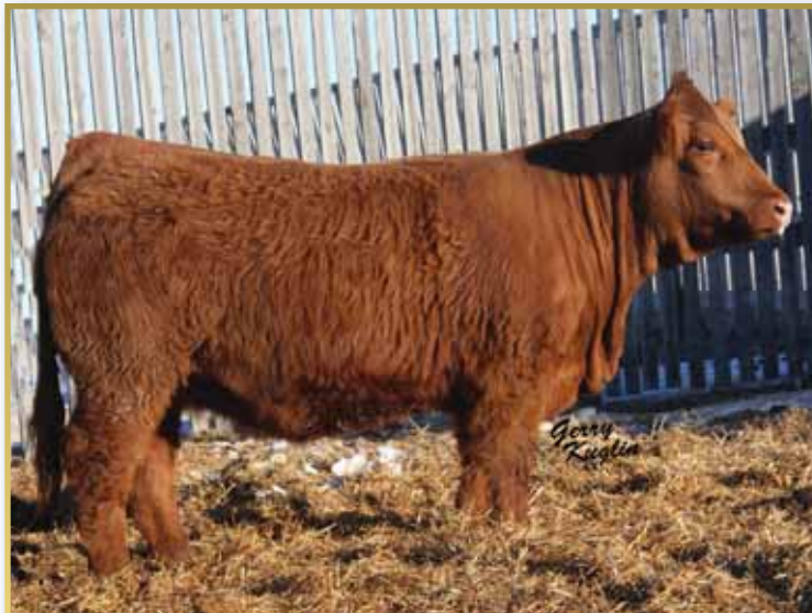
JYF Mgmt Rating: 4