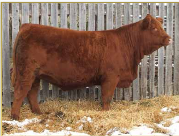
JYF Mgmt Rating: 2