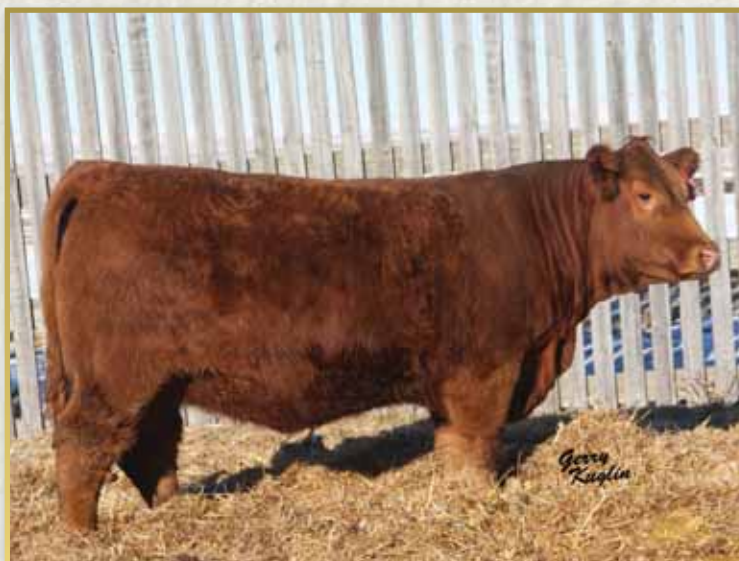
JYF Mgmt Rating: 2