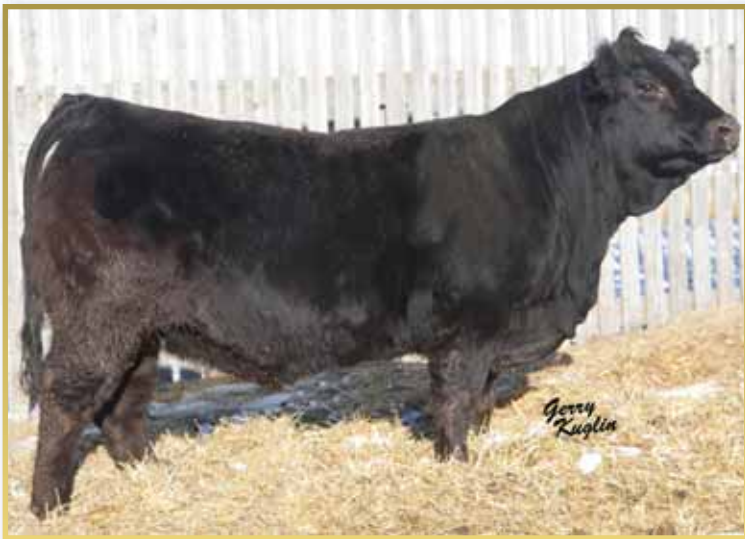
JYF Mgmt Rating: 2