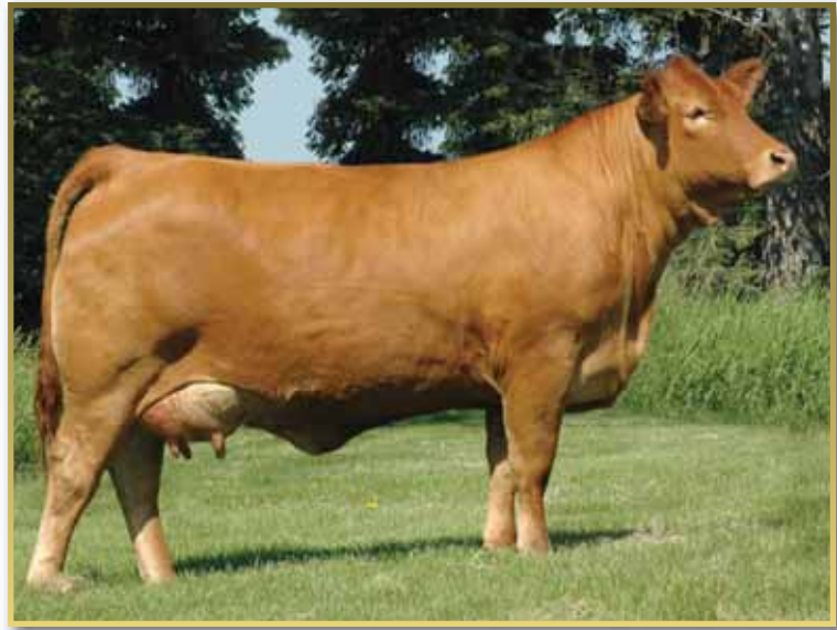
JYF Passion 443P

We are very proud of the females on offer and expect them all to make a significant contribution to the Limousin breed.