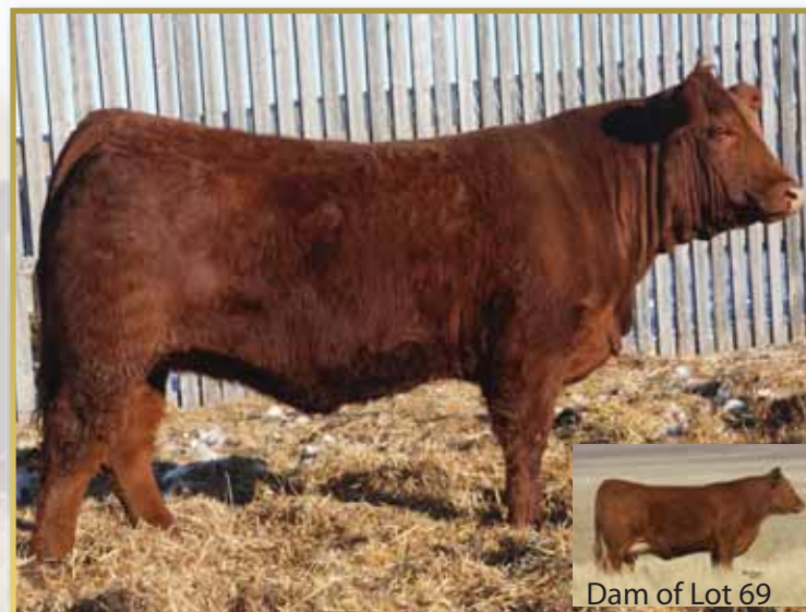
Dam of Lot 69