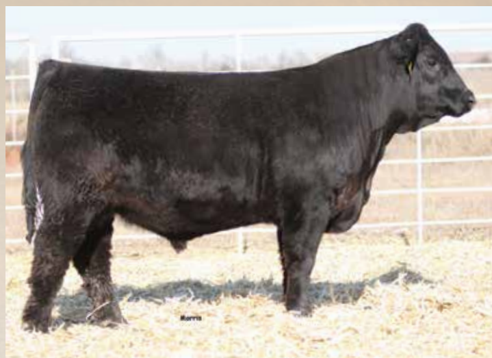
LOT 141 • MAGS 381F