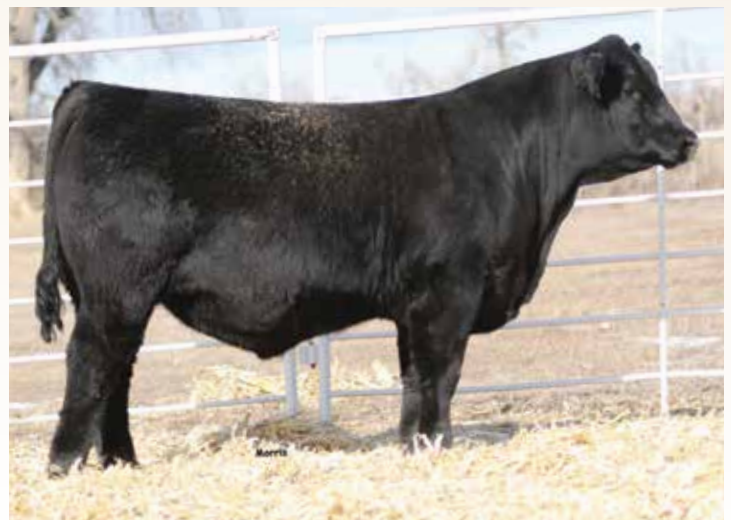
LOT 127 • MAGS 3344F