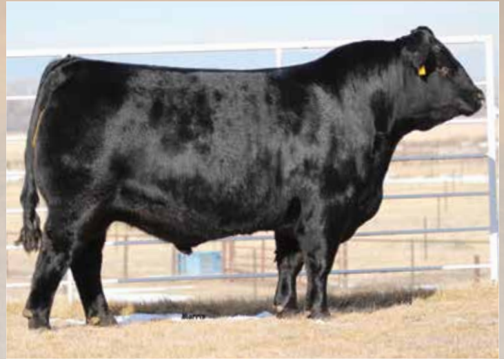
LOT 162 • MAGS 735E