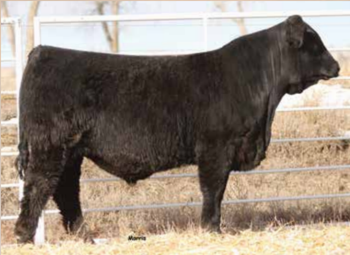
LOT 155 • MAGS 471F