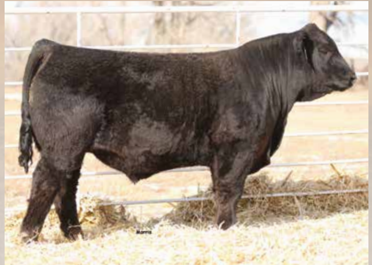
LOT 125 • MAGS 3001F