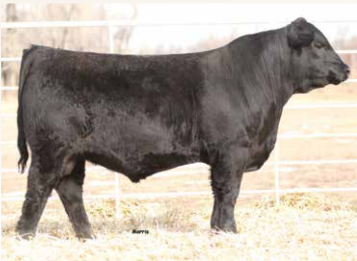
LOT 126 • MAGS 3004F