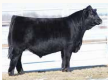
MAGS CABLE COWBOY