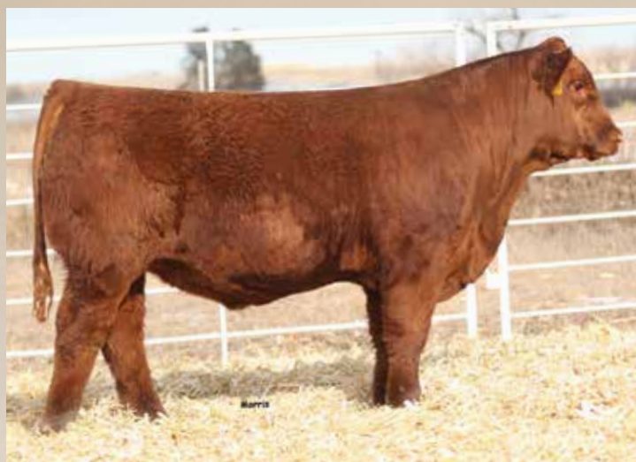
LOT 132 • MAGS 346F