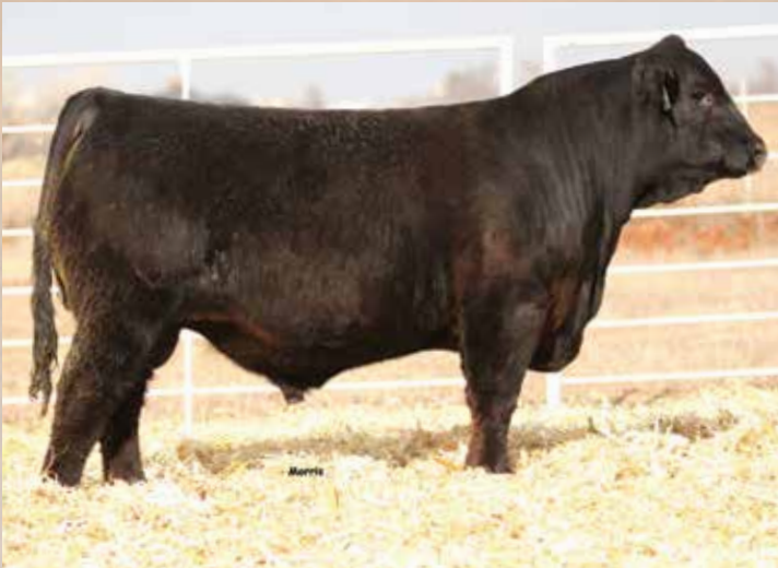
LOT 117 • MAGS 302F