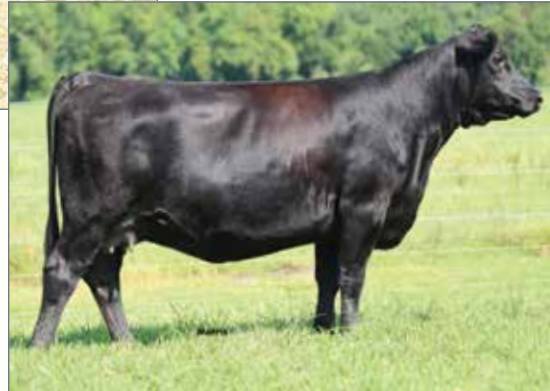
PBRS BELL 4100B • Dam of Lot 21