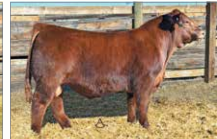
WULFS EDGE 5045E • Sire of Lot 11D