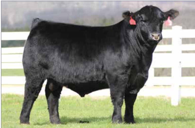
AHCC HEMI 0901E