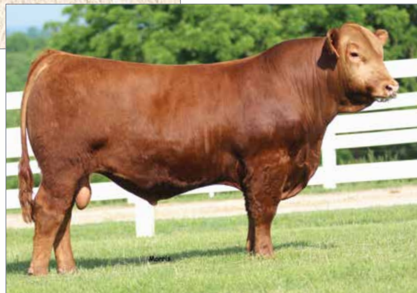
WULFS OZARK K115E • Sire of Lot 23

This consignment epitomizes the crossroads of where phenotypic quality, huge numbers and genetic diversity meet. This designer RED Lim-Flex mating represents the opportunity to invest in some of the breed's freshest and highest quality genetics. They young donor female that highlighted the 2018 Stowers Limousin production sale is absolutely amazing in terms of her phenotype and pedigree predicability. The sire, Wulfs Ozark, was a standout and high seller at the acclaimed Wulf Opportunity Sale of 2018 where he commanded much attention for his massive amount of dimension in a moderate made package. We feel this mating speaks itself and represent the progressive direction of the Graven Land & Cattle and Glendenning J Bar J programs. Folks, the results of this unique embryo package promise to be an asset to any genetic arsenal.