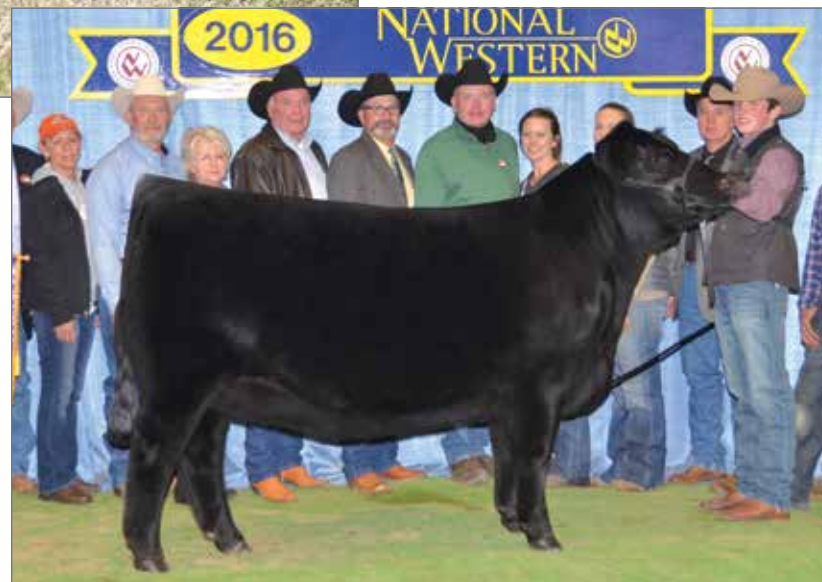
LH BELLE 015B • Maternal sister to Lot 1