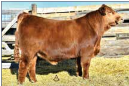
WULFS ENVOY K116E • Sire of Lot 11A