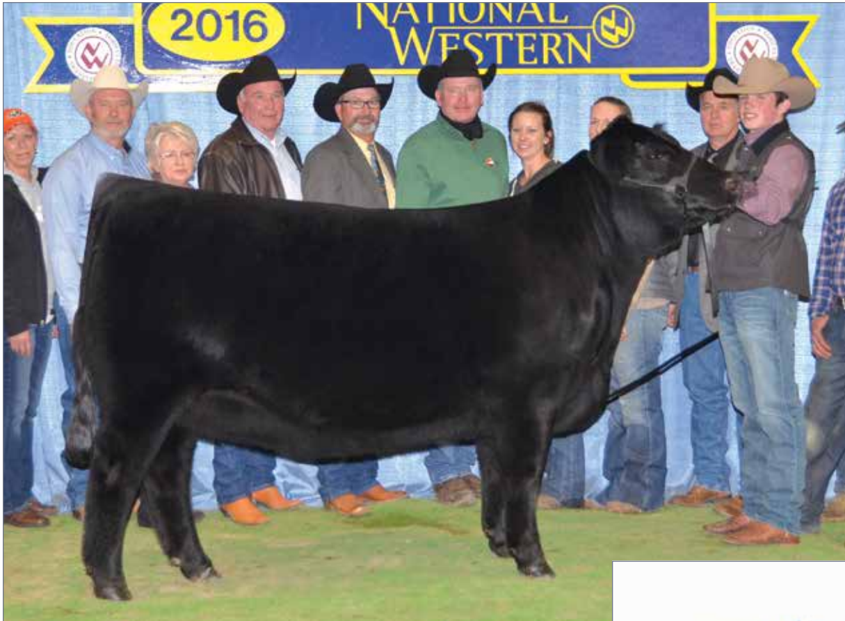
LH BELLE 015B • Dam of Lot 24