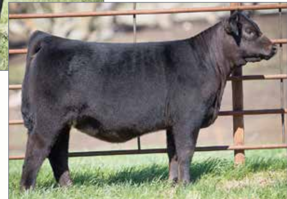
Tootsie Pop Daughter