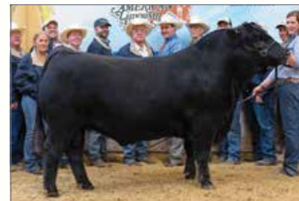
ELCX CABIN FEVER • Maternal sibling to Lot 7