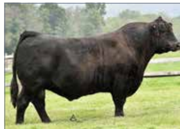
CJSL CREED 5042C • Sire of Lot 22A