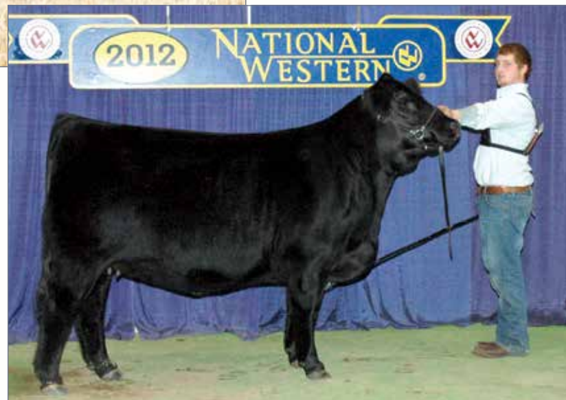
MAGS XESTURGY 0163 • Fill sister to dam of Lot 15

What an exciting opportunity here with these future heifer calves. Sired by the $30,000-valued and deceased Cottage Lake Border Agent bull. His calves have been some of the finest in the breed. Their dam, CFLX Robin 25OZ, is a superb daughter of AUTO Black Dakota from the first-ever Lim-Flex grand champion female and big-league donor, BOHI Red Robin. The blending of these two genetic masterpieces are for sure going to create something very special for the buyer.