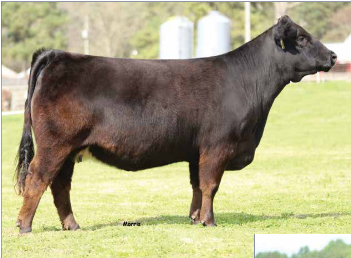
FBFL PRINCESS KATE 406C • Full sibling to Lot 28