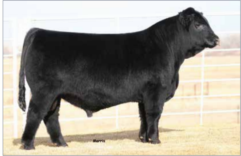
AHCC EARNING POWER 900E