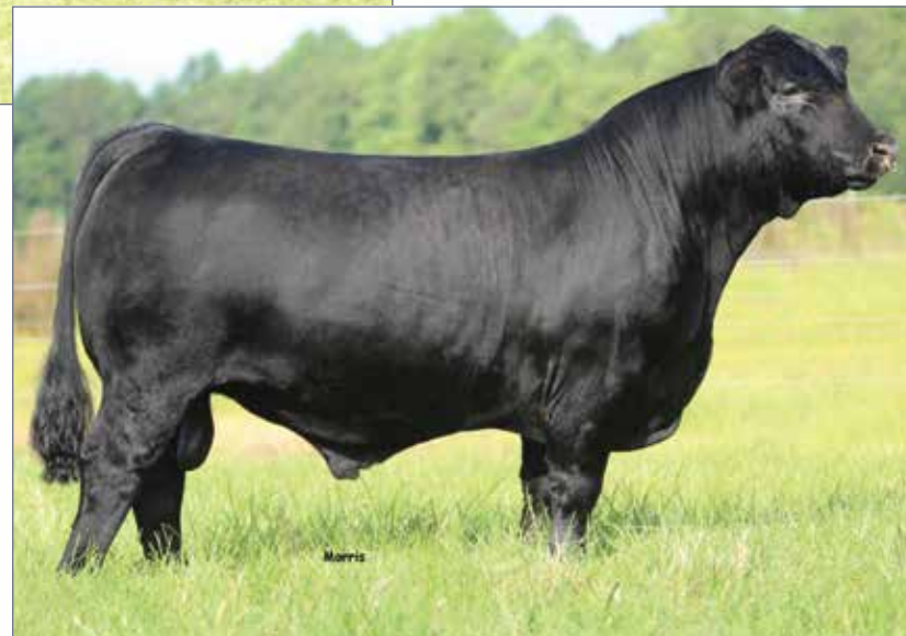
HWCB EYE OF THE STORM 406E • Son of FBFL Princess Kate

These embryos will be full sibs to FBFL Princess Kate, the dam of the 2017 NAILE grand champion bull, 2018 North Carolina State Fair Supreme Champion bull and the 2018 NAILE reserve grand champion bull, HWCB Eye Of The Storm 406E owned with Edwards Land & Cattle Co. These future calves are sired by the deceased MAGS Xyloid, a past All-American Futurity Supreme Champion bull.