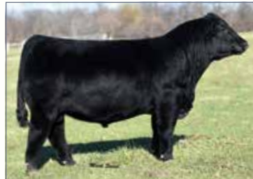
DAMERON BEST IN CLASS • Sire of Lot 16 embryos