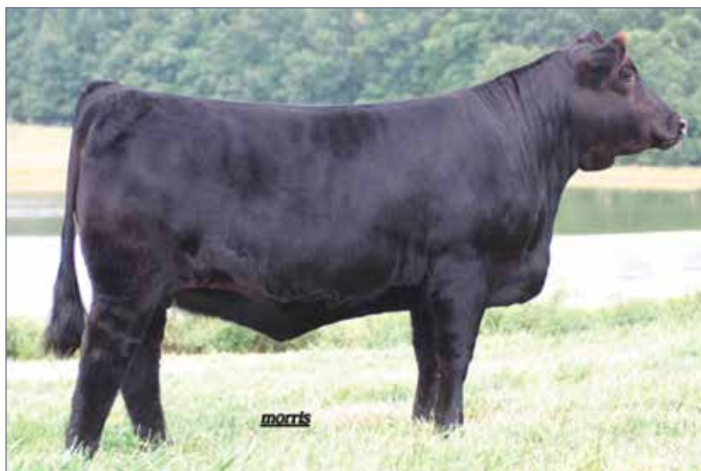
WLR UGLY BETTY • Full sibling to dam of Lot 14