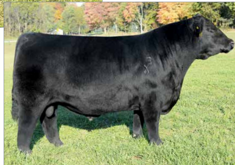
EXAR CLASSEN 1422B • Sire of Lot 12

RARE OPPORTUNITY ABOUND! The resulting embryos will be full sibs to the 2018 American Royal and 2018 Louisville Open Show champion female! This represents one of the very few chance to invest in genetics out of the famed AUTO Peyton donor cow, that carries the moniker of a many times champion female. The bottom-line is, this elite mating promises to produce double homozygous, phenotypically exceptional calves that project the ability to compete at the highest level. Bid with assertion.