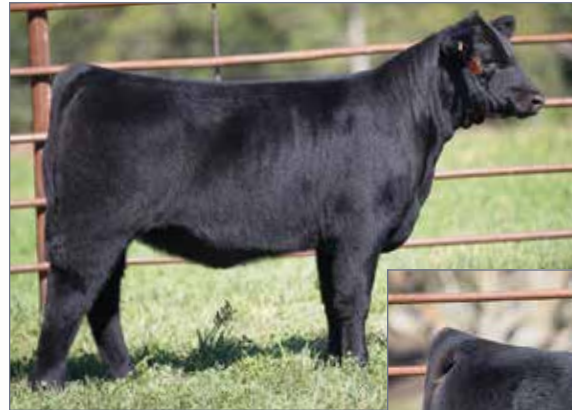
Tootsie Pop Daughter