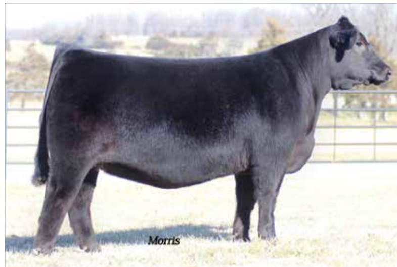
AUTO BLISS 266Y • Full sibling to Lot 14