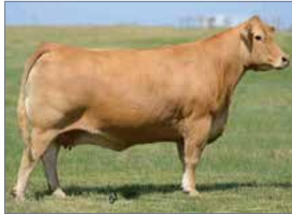
WULFS UNIQUE 8217U Dam of Lots 11A-11D embryos

Study this amazing genetic feature! This is your opportunity to attain genetics by this exceptional purebred Limousin female that's presented by the esteemed Wulf Cattle company program. This homozygous polled donor carries a combination of rib shape, muscle pattern, udder conformation and structural integrity that even the most discriminating cattlemen would appreciate. Unique is an own daughter of the ever-popular donor Wulfs Myriene 2332M. Unique is also the dam of Wulfs Billy The Kid and Wulfs Claim. The blending of this donor dam's genetic predictability and the 4 red Lim-Flex bulls that highlighted the 2018 Wulf's Opportunity sale, promises to excite! Note, many of these sires can be found in the National Western yards on display in 2019. The bottom line is, these genetic combinations project to produce, big numbered, fresh pedigreed, 75% offspring that are built to meet the ridge demands of today's mainstream beef industry. Bid with confidence January 13.