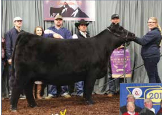
ELCX ELEVATE 684E Full sister in blood to Lot 20