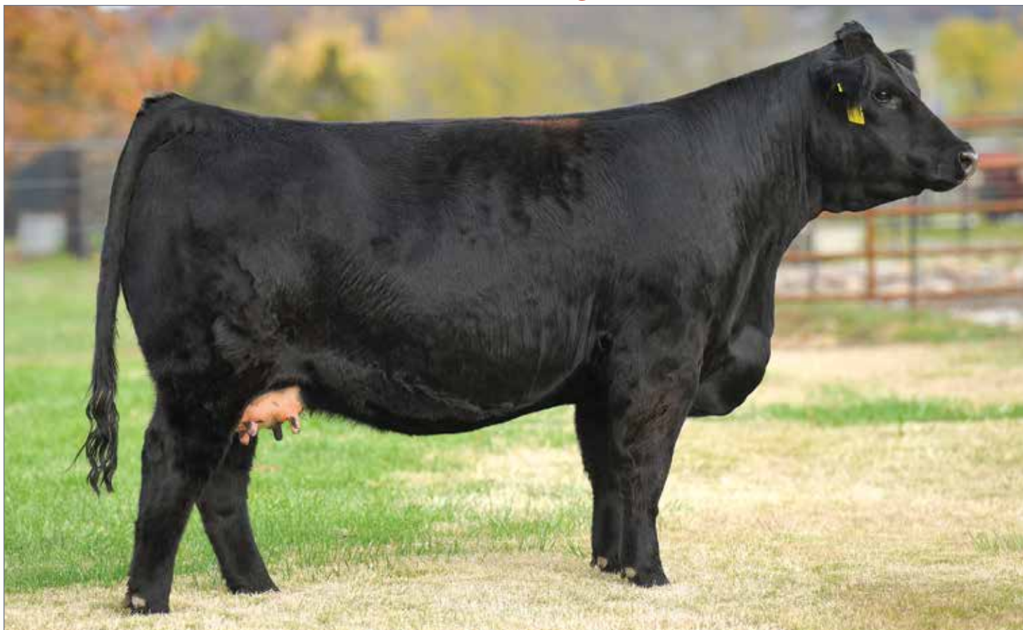
AUTO 411D • Dam of Lot 25