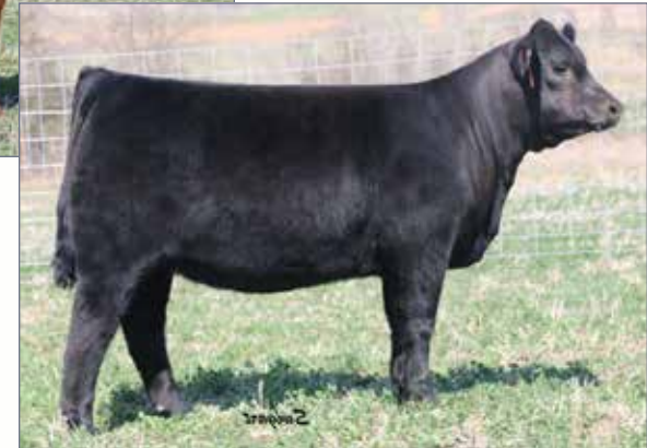
Tootsie Pop Daughter