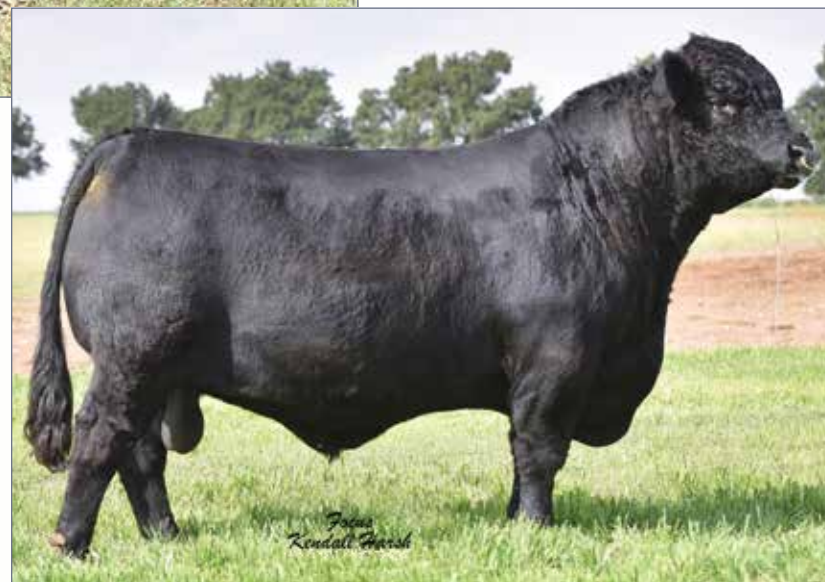
LFL DELUXE EDITION 6029D • Sire of Lot 27