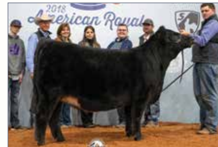
ELCX EXTREME 710E • Full sibling to Lot 7