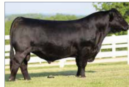
ELCX BULLETPROOF • Full sibling to Lot 7