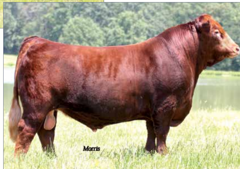
MAGS WLR USUAL SUSPECT 538U • Sire of Lot 6

J6 Tempest B300 is one unbelievable purebred Red Angus donor in the making. She is just now in production nursing her first calf where she is doing a terrific job. B300 is a daughter of WEBR Card Shark 1015 and from the female listed in this catalog as the previous lot, SLGN Stony's Temptest 778T. This young female will join a long and appealing list of proven Red Angus donors in the growing P Bar S Ranch operation. She created a tremendous amount of attention at the J6 sale. She was recognized by noted cattlemen as a near-perfect female! Her structure is sound, her design is flawless and her femininity is spot on. This future heifer, due 9/23/19, will have a tremendous amount of respect and attention when she hits the ground for the new owner. The recipient is a commercial black Angus-cross cow.