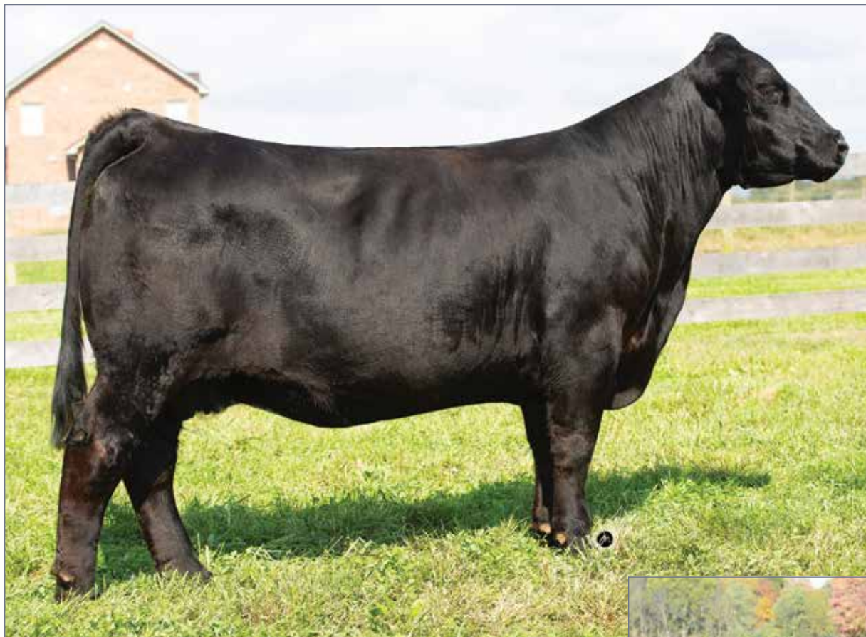
AUTO PEYTON 206Y • Dam of Lot 12