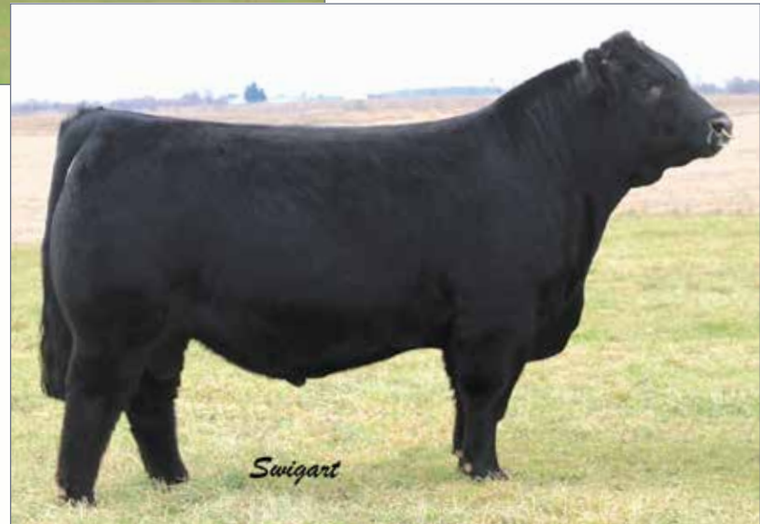
RLBH AIR FORCE ONE • Sire of Lot 24