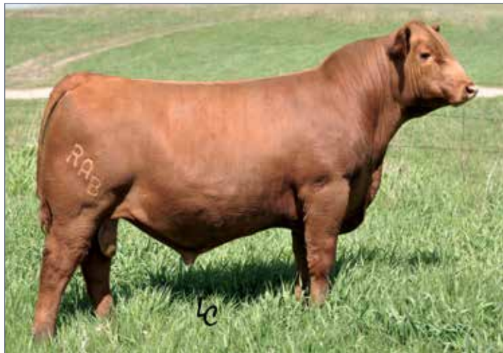
BIEBER HARD DRIVE Y120 • Sire of Lots 13A & 13B

Truthfully, a book could be written on the producing power of AUTO Tootsie Pop 2272T. She has produced high-sellers and show-ring champions when mated to a variety of genetic combinations. The sire represented in this mating is the ever popular Red Angus AI sire Bieber Hard Drive that's known for maintaining a combination of structure and muscle and adds tons of rib shape. We think the unique genetic combination of these two high power individuals promise to produce exceptional results. Bid with confidence.