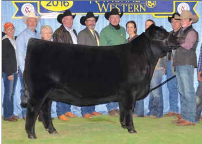
LH BELLE O15B • Maternal sister to Lots 16, 17 & 18

Touch Me Gently has worked extremely well with EXAR Upshot, HA Cowboy Up and PVF Insight, thus we have confidence in this mating.