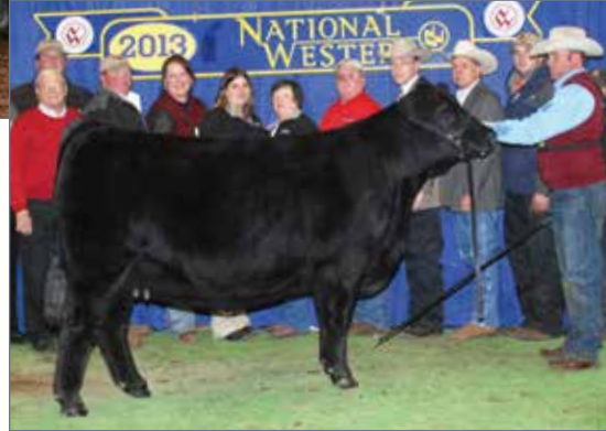
ELCS TWILIGHT • Maternal sibling to Lot 20