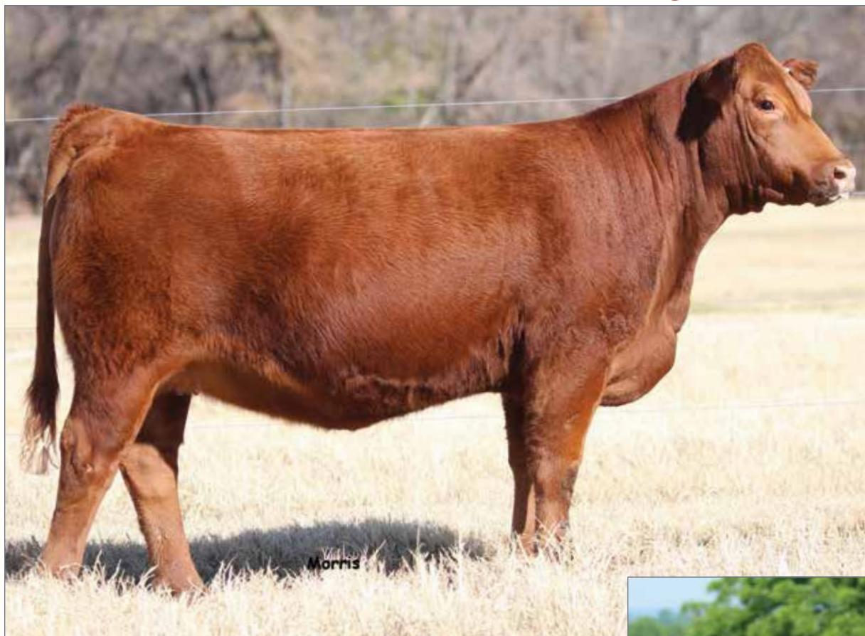
SSTO DARLA 603D • Dam of Lot 23