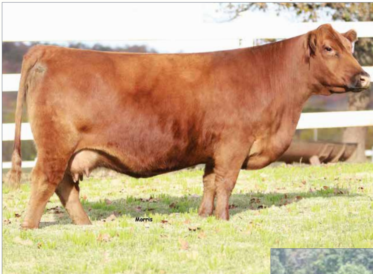
J6 TEMPEST B300 • Dam of Lot 6