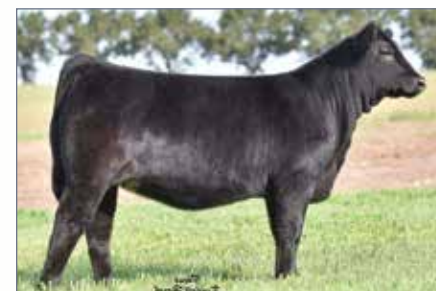
TKJP FELICIA • Full sibling to Lot 27

MAGS De Lorean, a daughter of the UR Salina cow, is beginning to write her pages of breed history just like her dam, grandam and great-grandam—both in performance and on the tanbark.