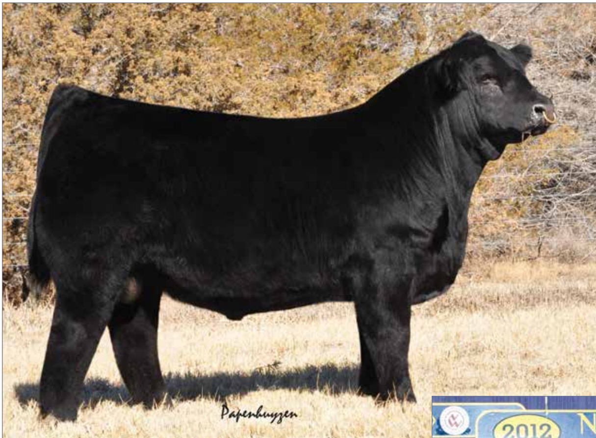
COTTAGE LAKE BORDER AGENT • Sire of Lot 15