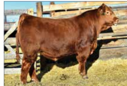
WULF OZARK K115E • Sire of Lot 11B