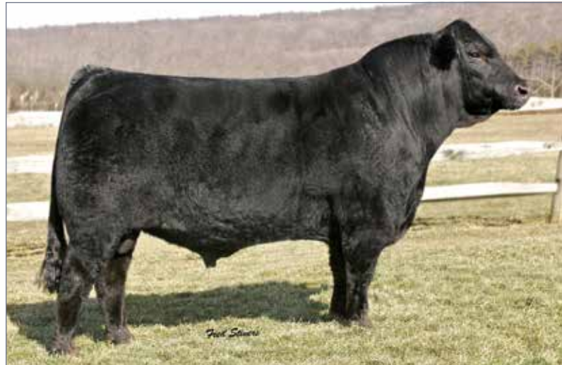
AHCC WESTWIND W544