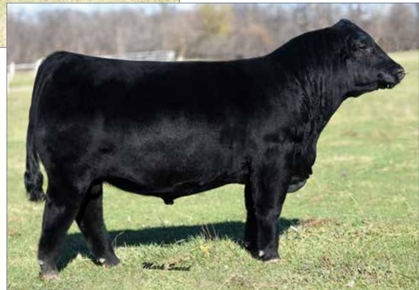
DAMERON BEST IN CLASS • Sire of Lot 26

Usually Yours was a dominate female on the 2014 show circuit being crowned grand champion in the junior and open shows at the American Royal. She is a full sister to the highly acclaimed donor WLR Prada. The sire of this mating, Best In Class, is a full brother to Dameron First Class. Make a wise investment in the future of your program.