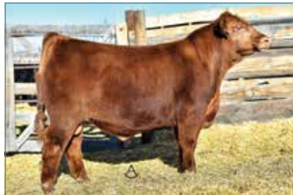
WULFS EASTERN 5002E • Sire of Lot 11C