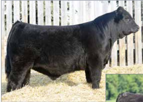
RIVERSTONE CROWN ROYAL Sire of Lot 21