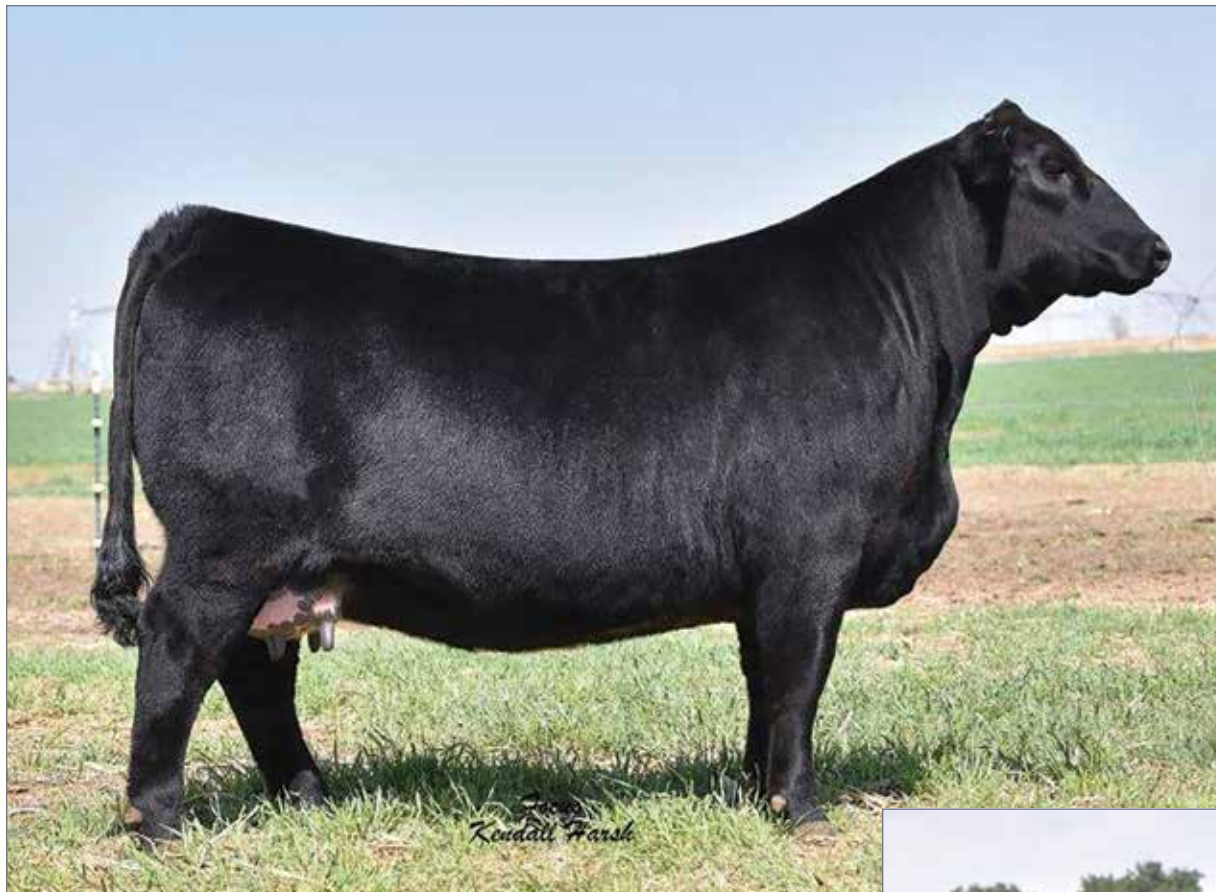
MAGS DE LOREAN ET • Dam of Lot 28