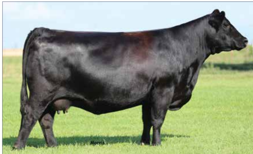
MAGS ZALIA • Dam of Lots 22A, 22B & 22C