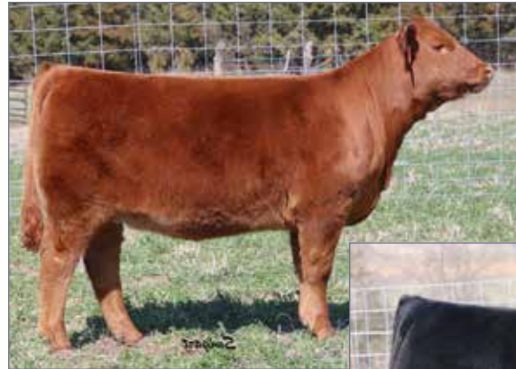
Tootsie Pop Daughter

CCF GOLD BAR 0251 LACY MS CHEROKEE 557P LJC MISSION STATEMENT P27 BASIN LAURA 5301 GPFF BLAQUE RULON AMY JO DHAN 20L EXLR DAKOTA 353G EXLR MOLLY 343G