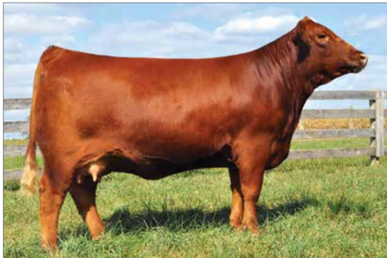
AUTO BETTE 266Y • Full sibling to Lot 14