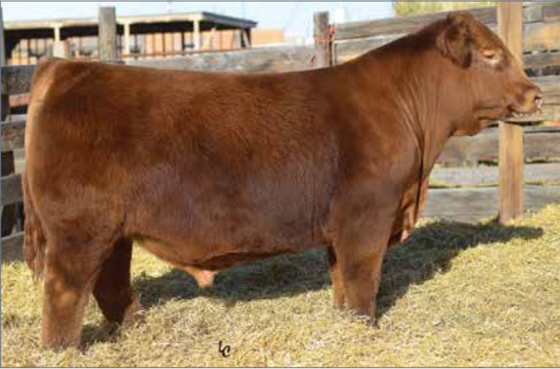
AHCC COWBOY KIND C595