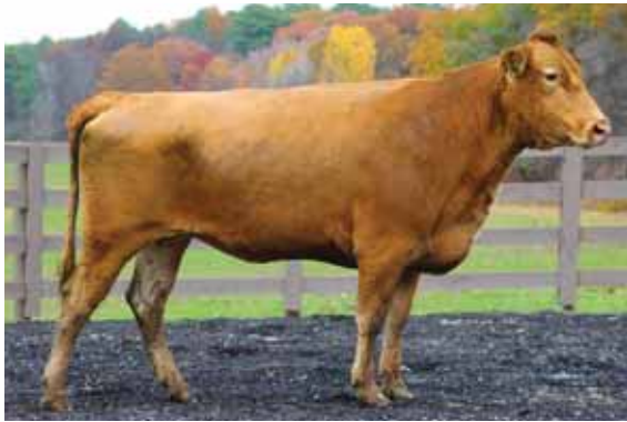
Heartbrand 9315, dam of Lots 31 - 33 embryos.