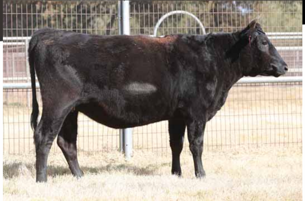
STF MS Itomichi 321E, Lot 52

CONSIGNED BY STEPASIDE FARM, LLC, SANGER, CA