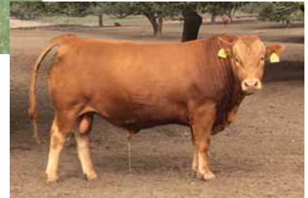
Heartbrand JPrime 2132A, sire of Lot 24.