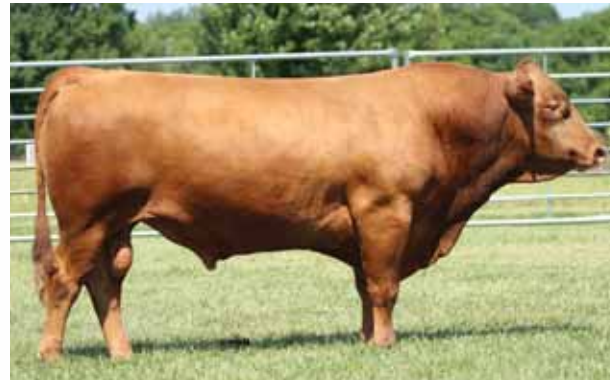
JC Rueshaw 92, sire of Lot 23.