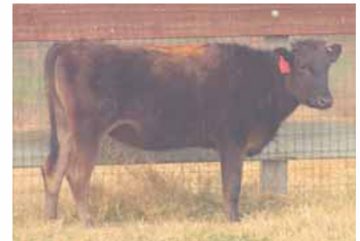
STF MS Shigefuku Seth F011, Lot 63

CONSIGNED BY STEPASIDE FARM, LLC, SANGER, CA