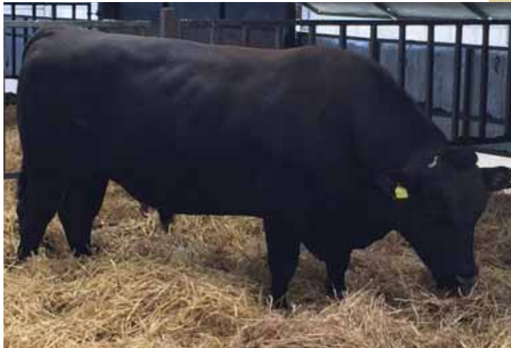
Highland Wagyu Kenzo, sire of Lot 12 embryos.