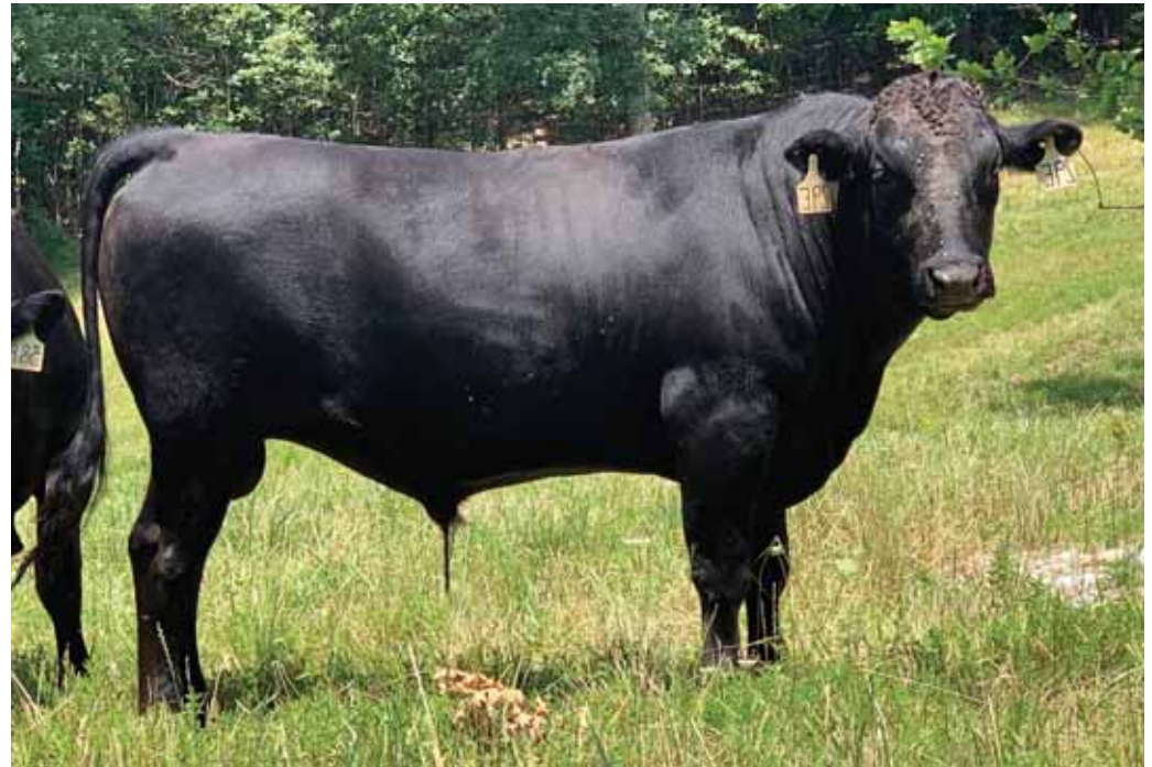
DCR Haruse 29E, Lot 58

CONSIGNED BY DRURY CATTLE RANCH, ROGERSVILLE, MO