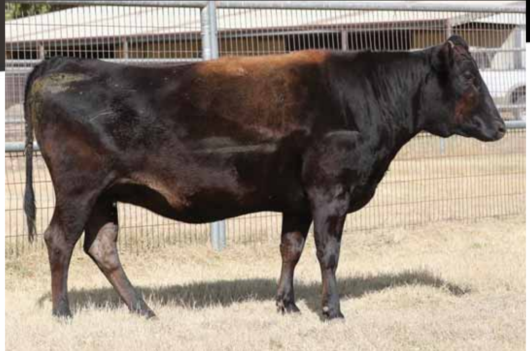
STF MS Takazak Shigeshige 304A, Lot 50.

CONSIGNED BY STEPASIDE FARM, LLC, SANGER, CA