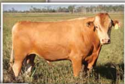
Sumo Cattle Co Tamamaru K406