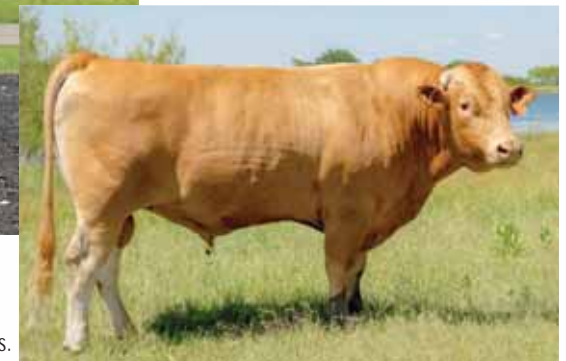
GK4 Rueshamaru, dam of Lot 27 embryos.