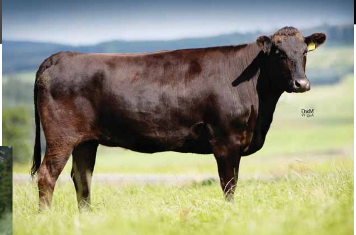
Highland Wagyu Aizatziriko 7, dam of Lot 13.