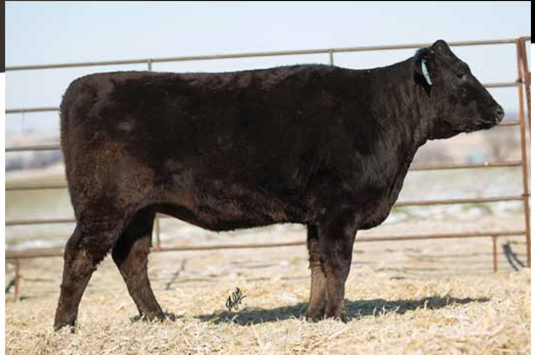
JDH 63Y 337F, Lot 60