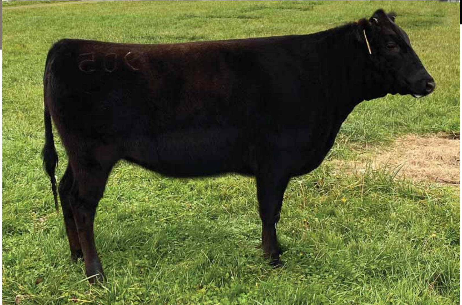
CHR MS Sanjirou 905F ET, Lot 1