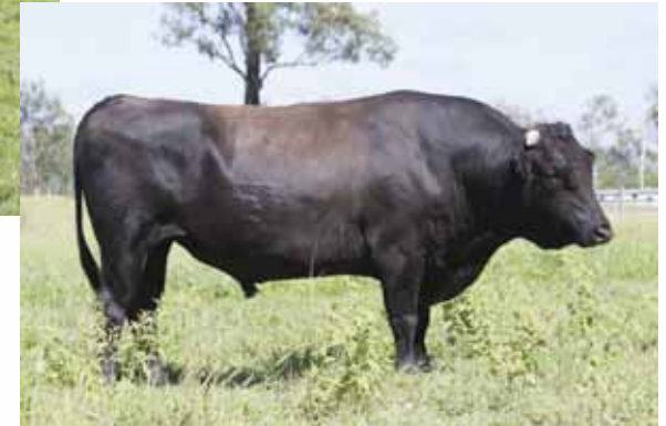
SMO Sumocattle Co Michifuku F126, sire of Lot 9 embryos.