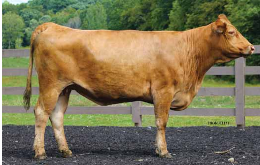
Heartbrand 7805W, dam of Lot 26 embryos.

CONSIGNED BY CLIMAX AKAUSHI FARMS, CLIMAX, NY