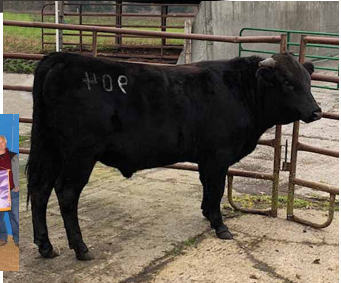
CHR Sanjirou 904F, Lot 5