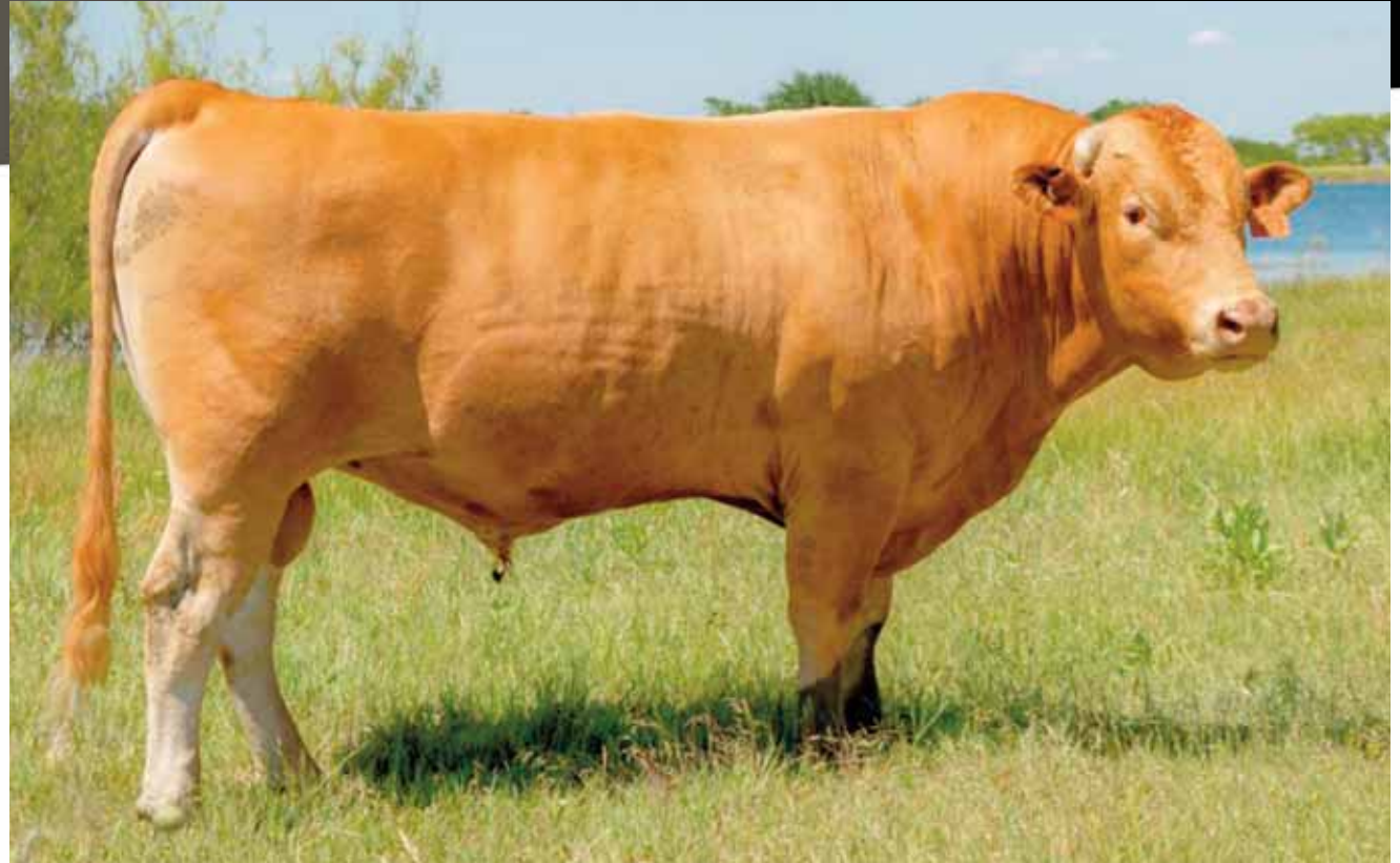
GK4 Rueshamaru, sire of Lots 31 - 33 embryos.