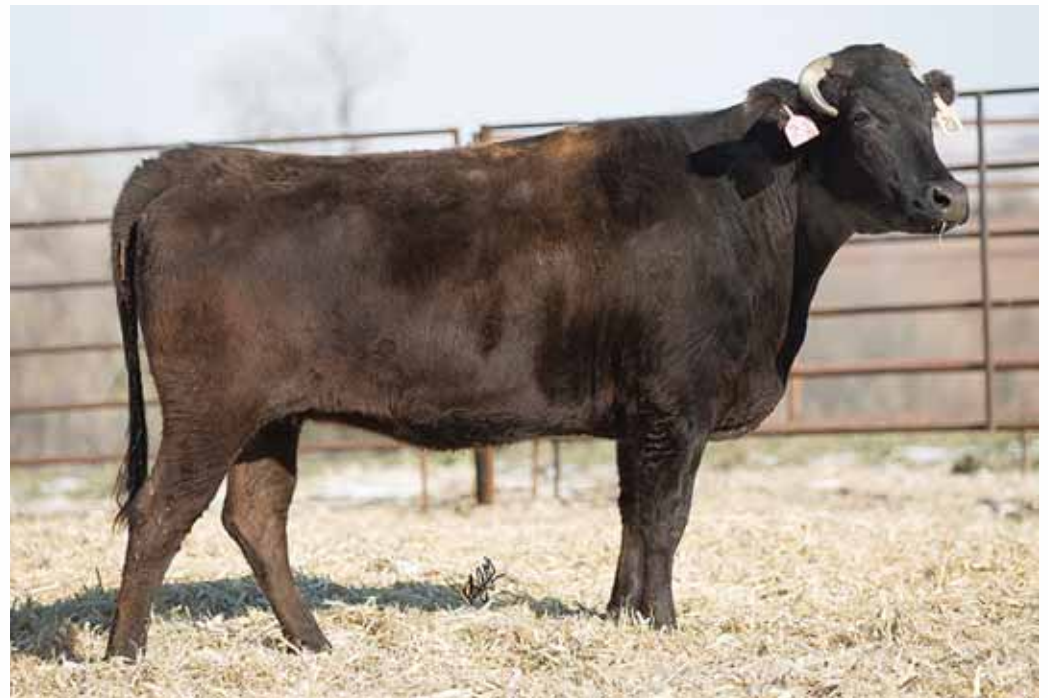
JDH MS Hirakaoru 65D, Lot 55