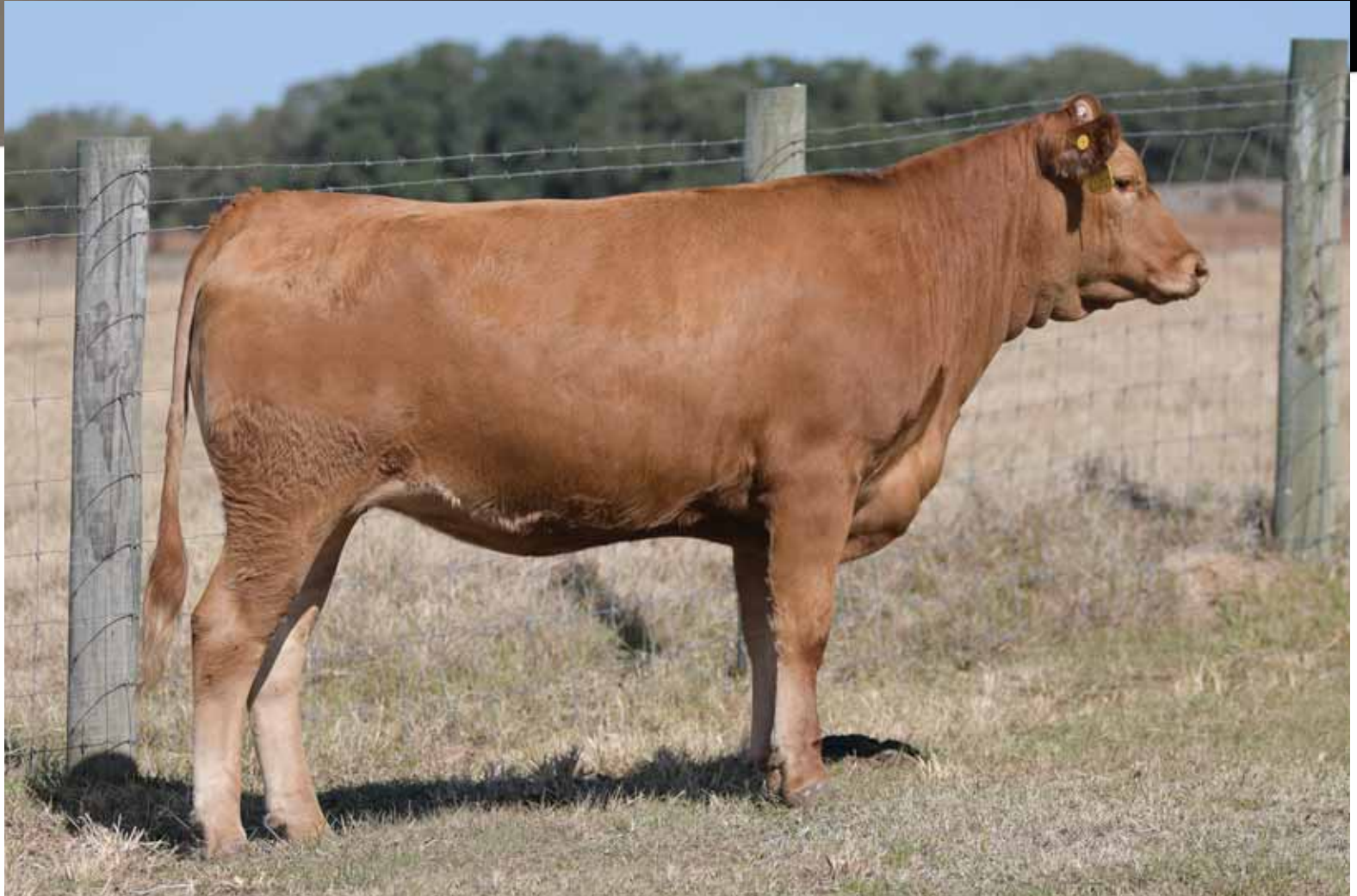
LG 2069F, Lot 16