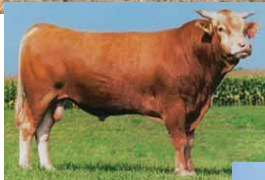
Shigemaru, sire of Lot 18 embryos.

CONSIGNED BY LEGENDARY AKAUSHI, FLATONIA, TX