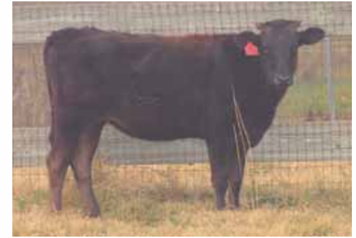
STF MS Shigefuku Seth F010, Lot 62

CONSIGNED BY STEPASIDE FARM, LLC, SANGER, CA