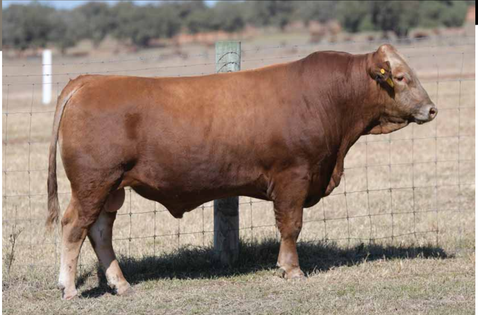
LG 2078F ET, Lot 17