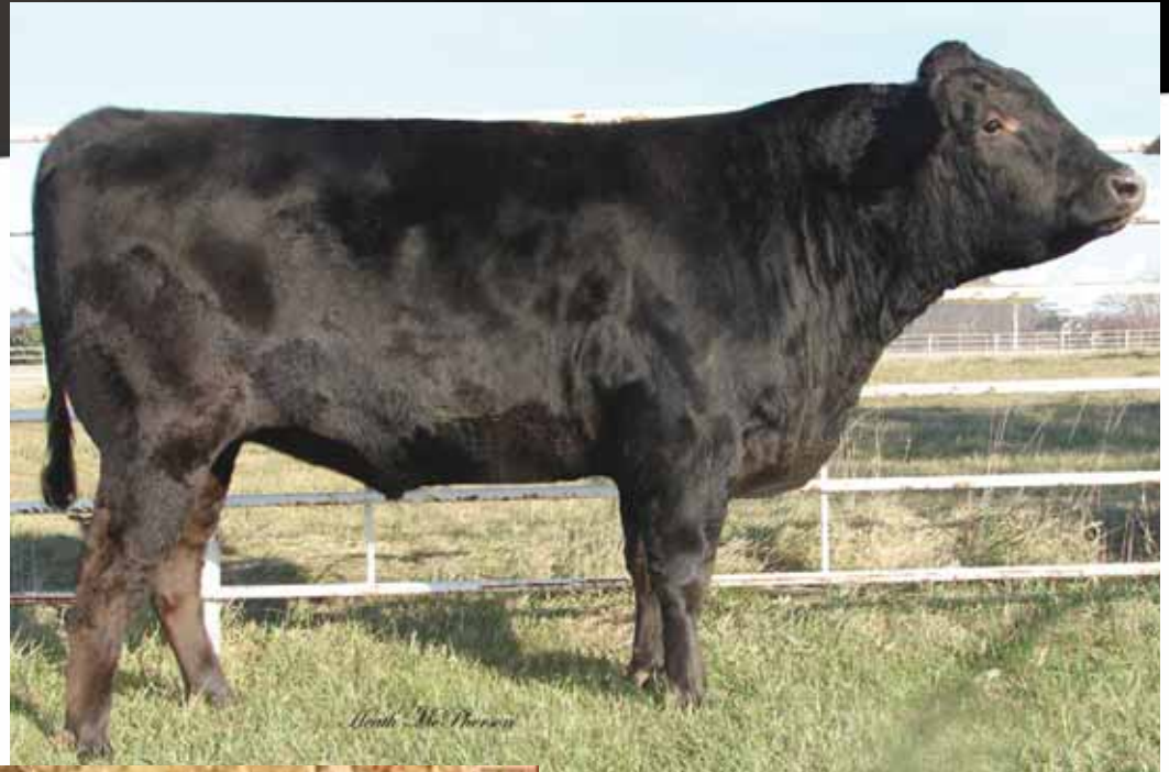
SR Y13 Sanji, sire of Lot 44 embryos.

CONSIGNED BY TALLY WINDHAM WAGYU, CLYDE, TX