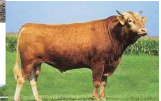
Tamamaru, sire of Lot 22 embryos.