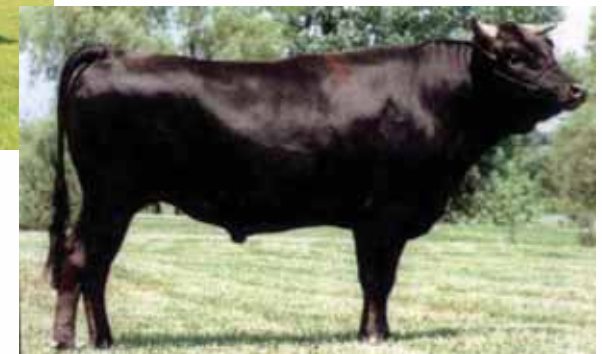
World K's Michifuku, sire of Lot 10 embryos.