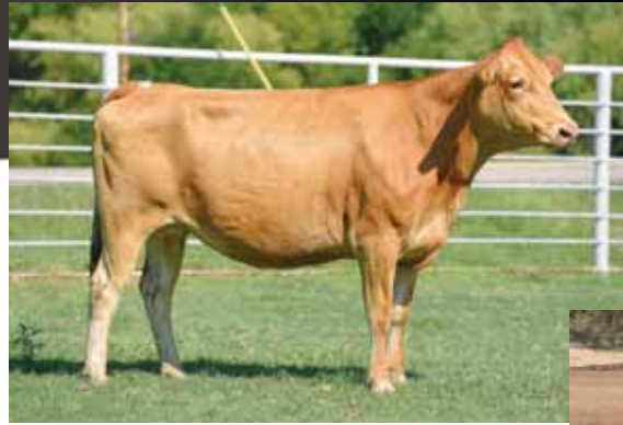
Myers-Cooper Diamantina 7863W, dam of Lot 24.