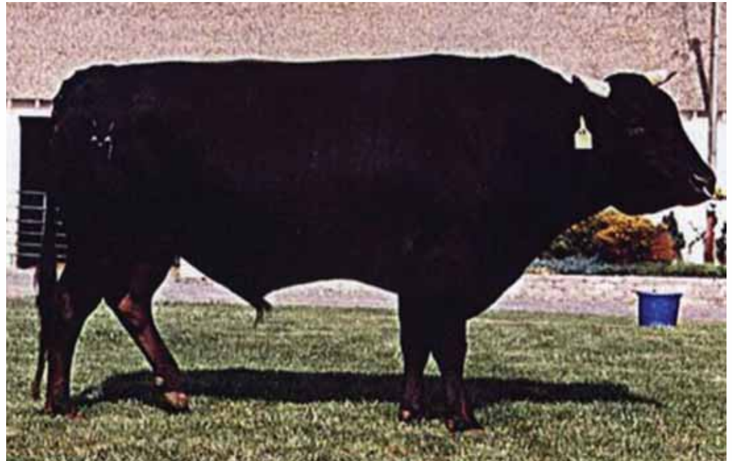
World K's Kitagui Jr., sire of Lot 47.

CONSIGNED BY RAGLAND WAGYU, HAZEL GREEN, AL AND GRANKEWING, TN