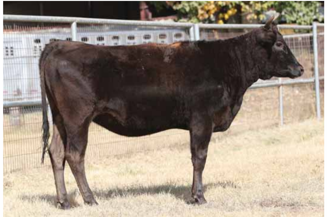
STF MS Shigeshige ETJ F008, Lot 53

CONSIGNED BY STEPASIDE FARM, LLC, SANGER, CA