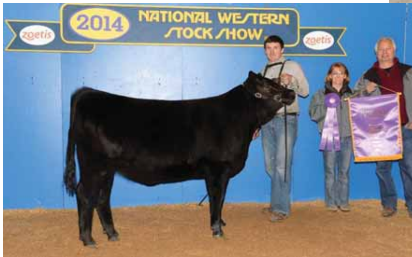
CHR Ms Itomoritaka 584, dam of Lot 5.