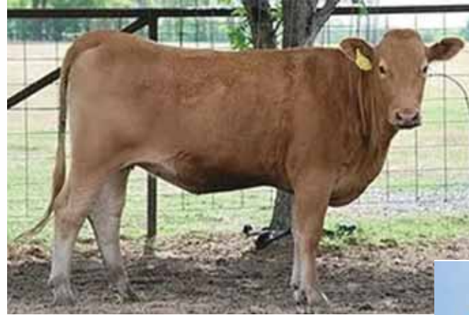
ROWE MS Red Star, dam of Lot 22 & 23.