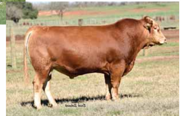
Heartbrand Raymond Reddington 3186A, sire of Lot 25 embryos.