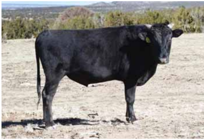
LMR Kitaguni 1441Y, sire of Lot 4