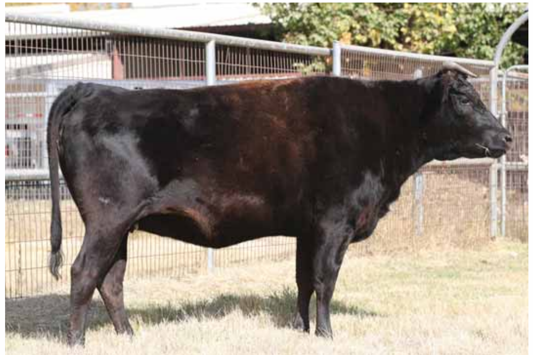
STF 205D ET, Lot 51.

CONSIGNED BY STEPASIDE FARM, LLC, SANGER, CA