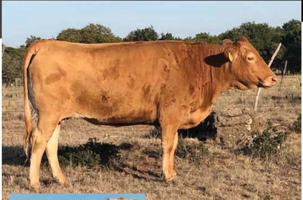
Heartbrand B1345P, dam of Lot 18 & 19 embryos.

CONSIGNED BY LEGENDARY AKAUSHI, FLATONIA, TX