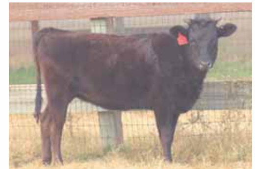
STF G001 ET, Lot 64

CONSIGNED BY STEPASIDE FARM, LLC, SANGER, CA