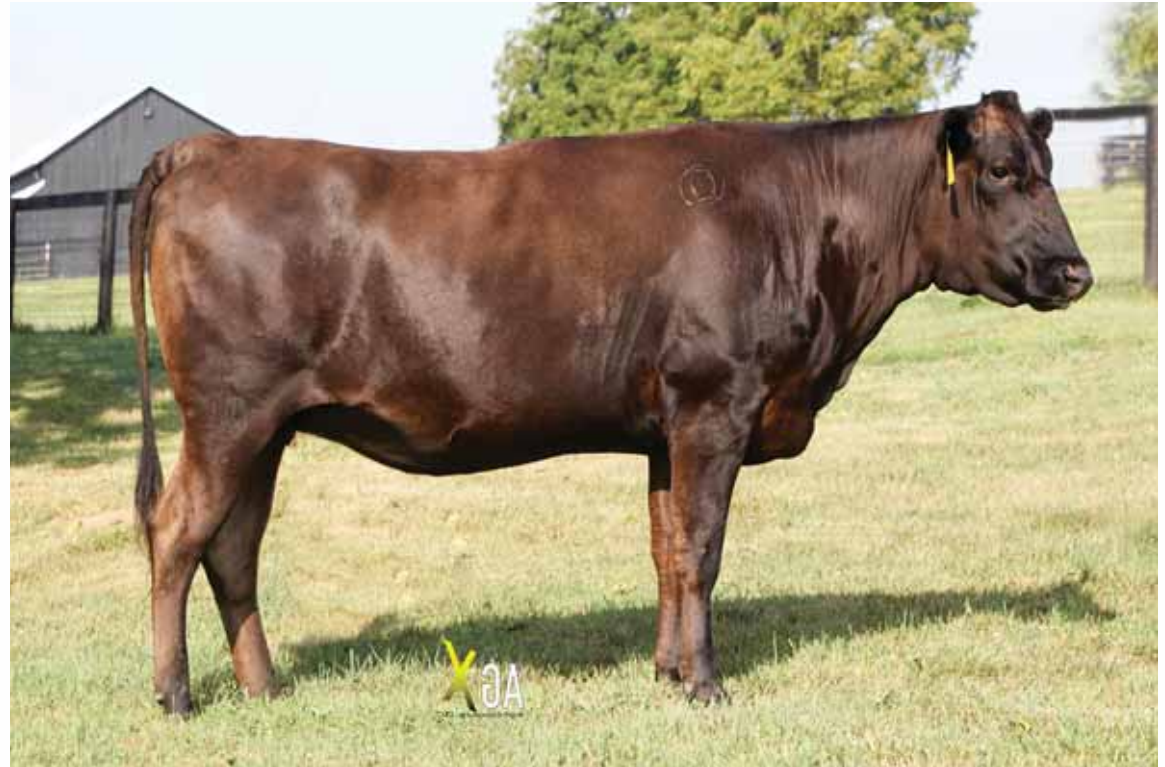
GAF Suzanne 12D, donor dam of Lot 43.

CONSIGNED BY M&M RANCH, MECHANICSBURG, PA