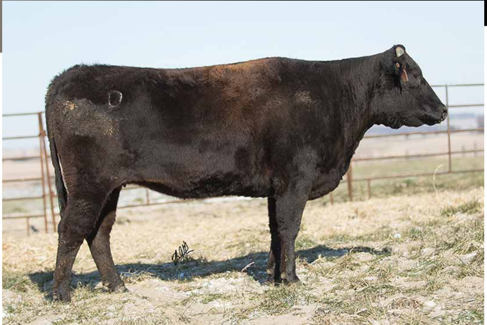
JDH MS Suzifuku 73D, Lot 56