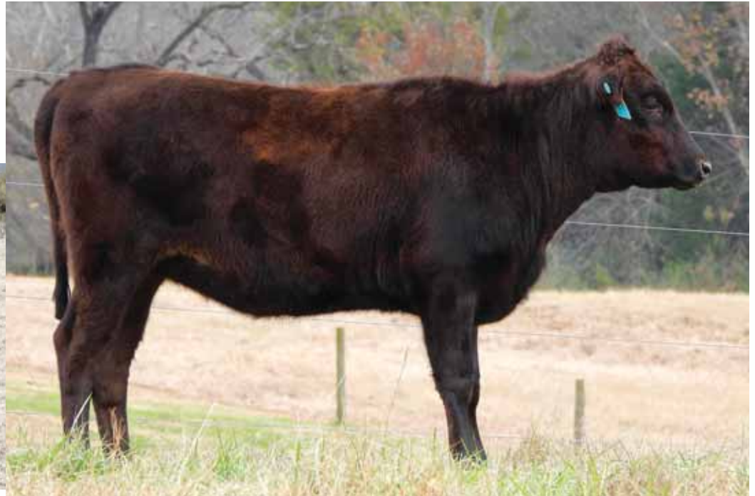
BFC Kitaguni 10G, Lot 4