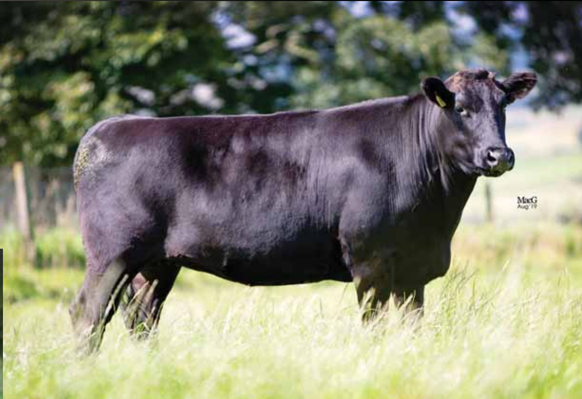
Highland Wagyu Carra, sire of Lot 11 embryos.