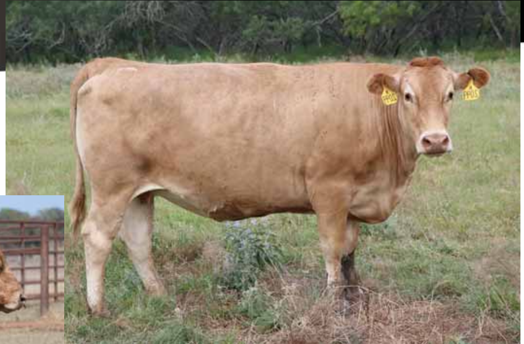
Heartbrand 2099A, dam of Lot 20 embryos.