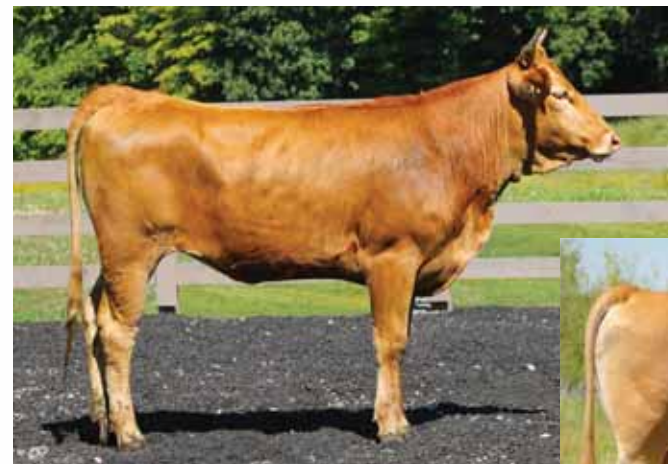
7754F, dam of Lot 27 embryos.

CONSIGNED BY CLIMAX AKAUSHI FARMS, CLIMAX, NY