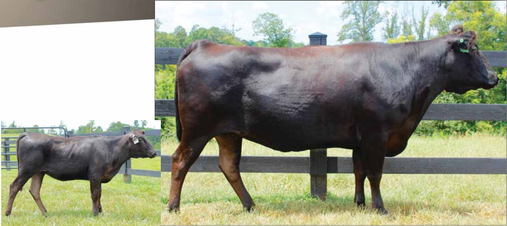
BFC Sanjirou 3 43F, Lot 3