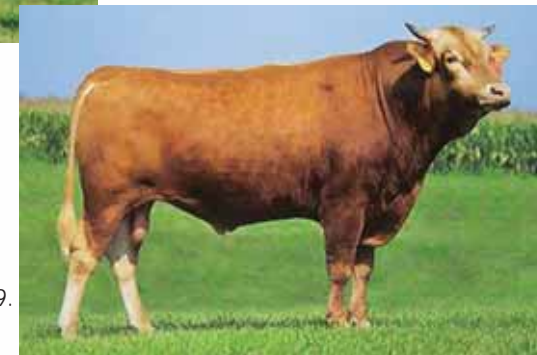
Tamamaru, sire of Lot 19.