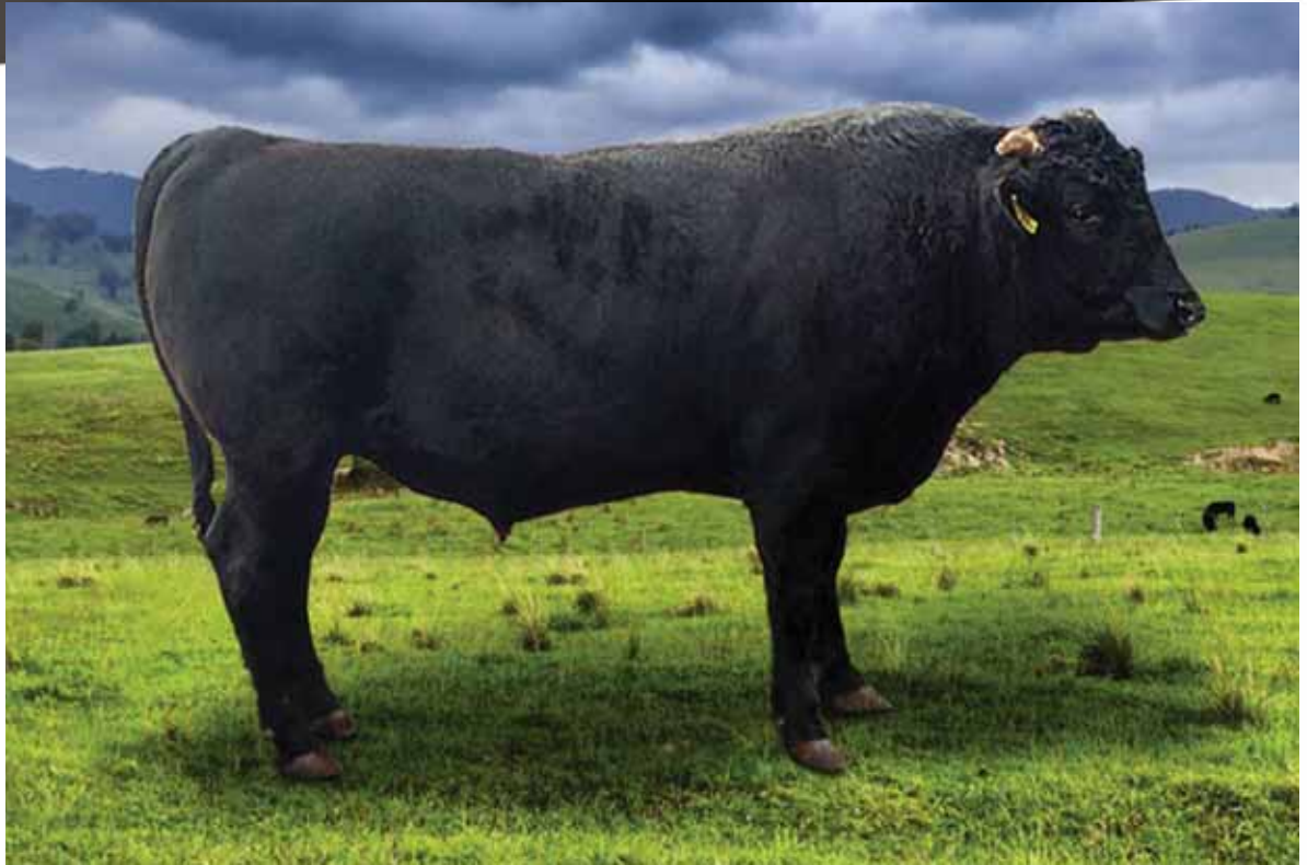
OKB Cabassi Manifesto V1 ET, sire of Lot 48 embryos.