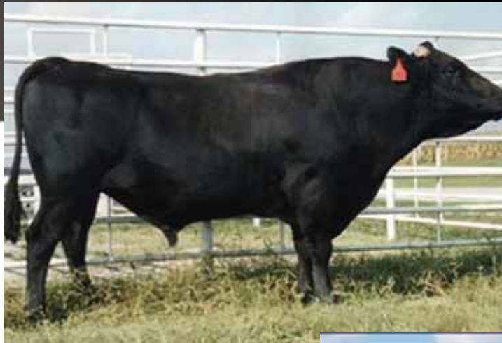
Itozuru Doi, sire of three embryos sellign as lot 6.

CONSIGNED BY CRESCENT HARBOR RANCH , OAK HARBOR, MI