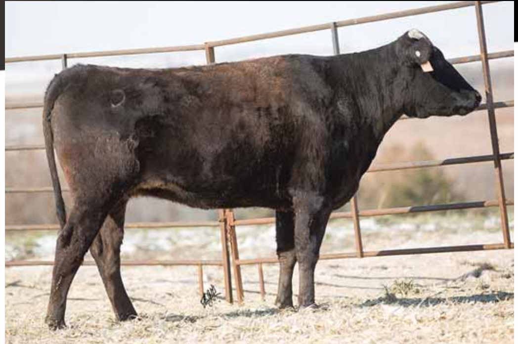
JDH MS Kyoryokuna 106D, Lot 54