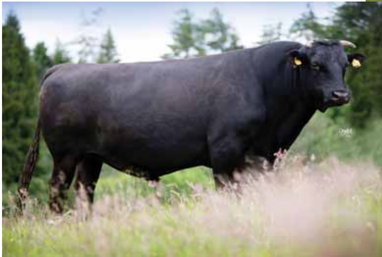
Highland Wagyu Carra, sire of Lot 13 embryos.