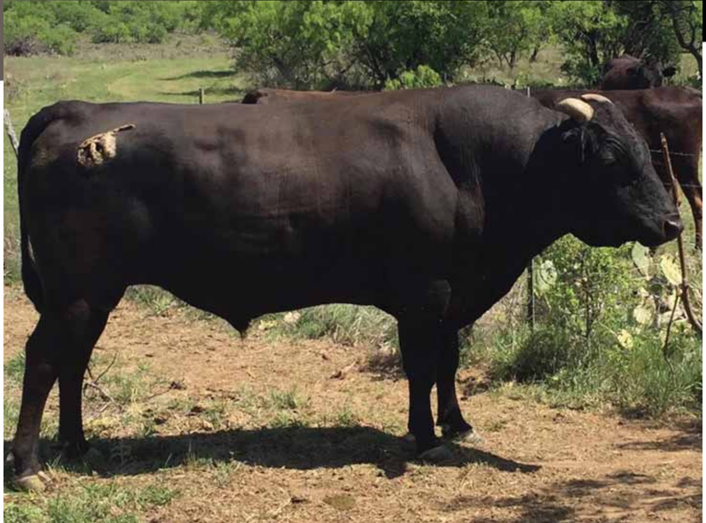
Maverick, sir of Lot 46 embryos.