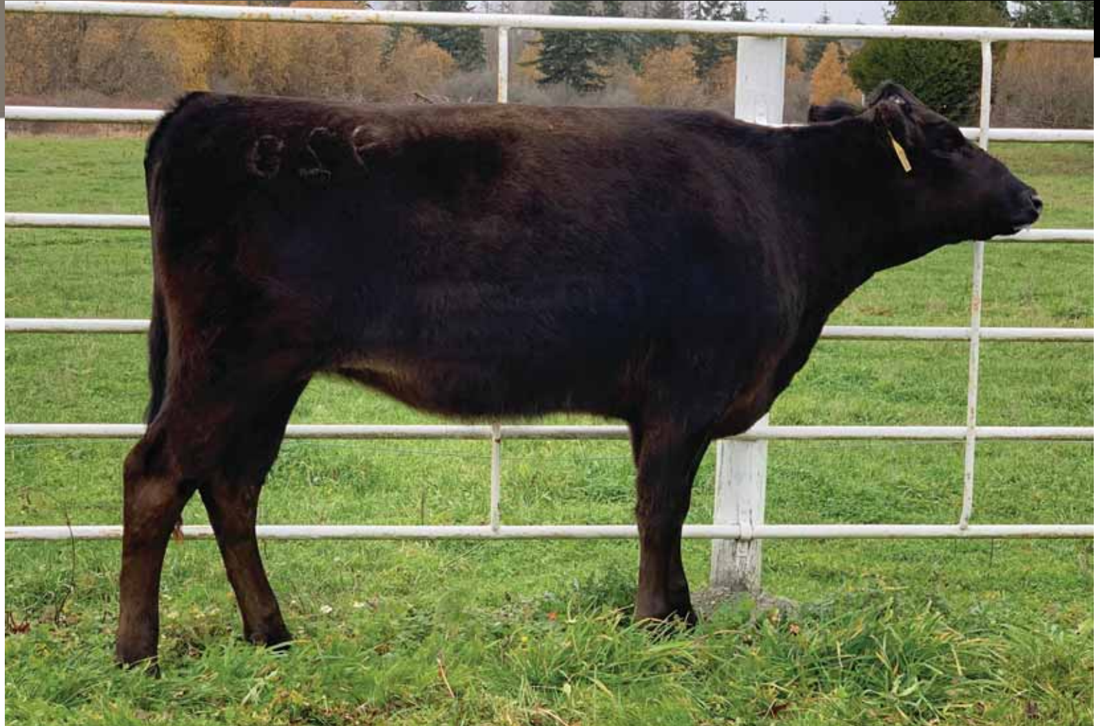
CHR MS Sanjirou 920F ET, Lot 2