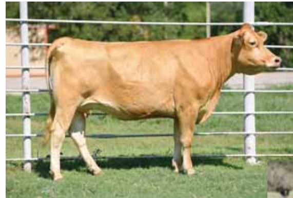
Myers-Cooper 7767W, dam of Lot 25.