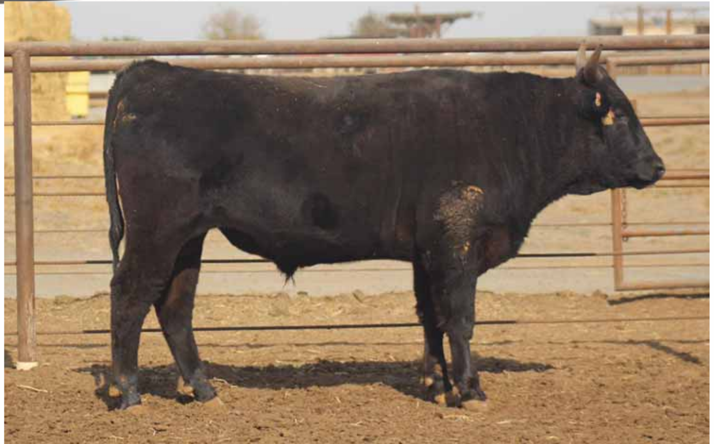
STF One Sanjirou F009, Lot 59