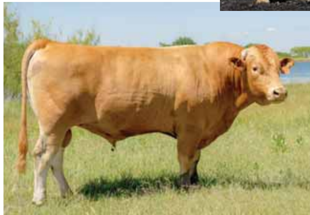
GK4 Rueshamaru, sire of Lot 28, 29 & 30 embryos.