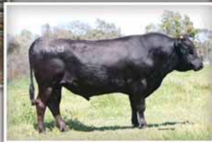
Ginjo Marblemax Hiranami B901