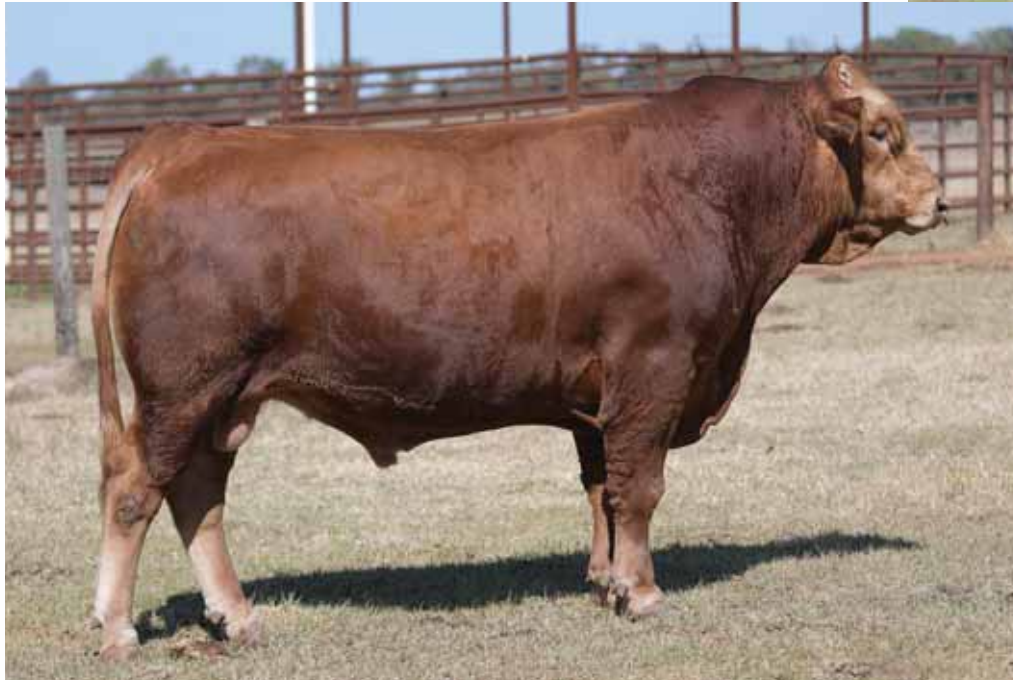
LAG Alamo 04E ET, sire of Lot 20 embryos.