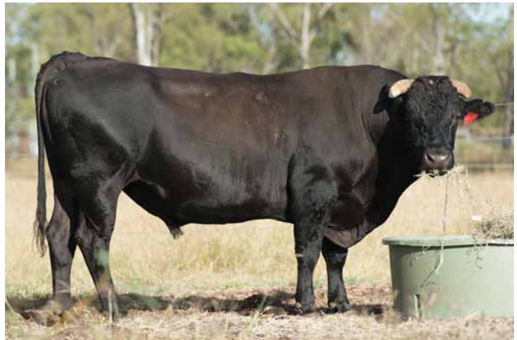
Westholme Hiramichi Tsuru, Lot 15