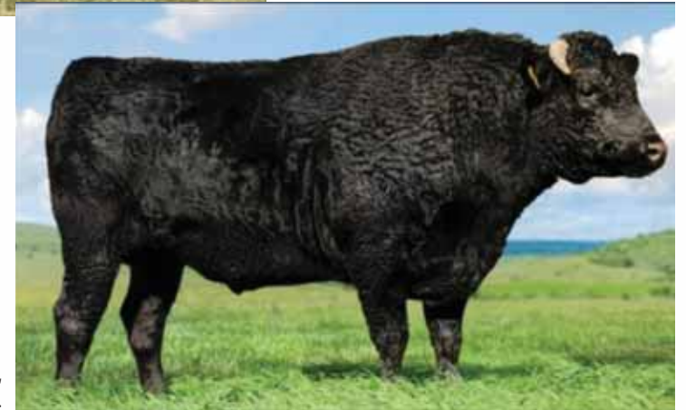
HP Mayura L0010 ET, sire of Lot 7 embryos.

CONSIGNED BY CRESCENT HARBOR RANCH , OAK HARBOR, MI