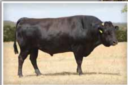
Sumo Cattle Co Michifuku F154