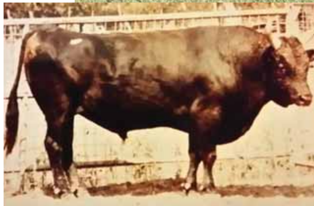
Mazada, sire of Lot 45 embryos.