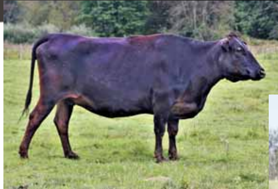
MS Sigenami, dam of Lot 9 embryos

CONSIGNED BY SYNERGY WAGYU , SPRING CITY, PA