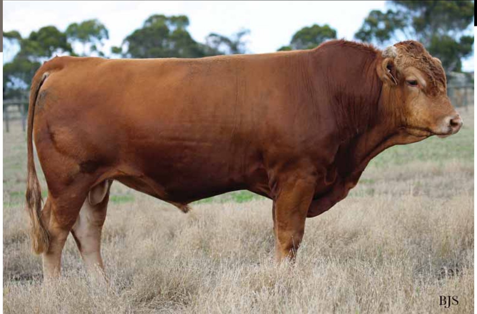
BRW Bald Ridge Proximo L0126