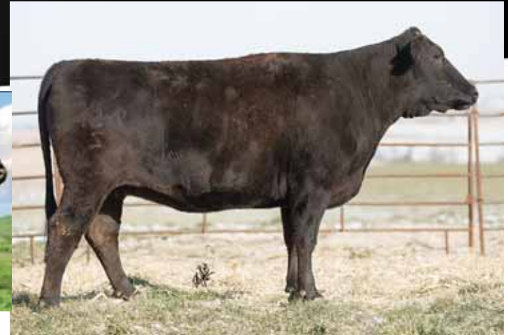
HP Mayura L0010, sire of Lot 38 & 39 embryos.