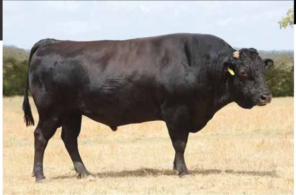
SMO Sumocattle Co Michifuku F154, sire of Lot 40 & 41 embryos.