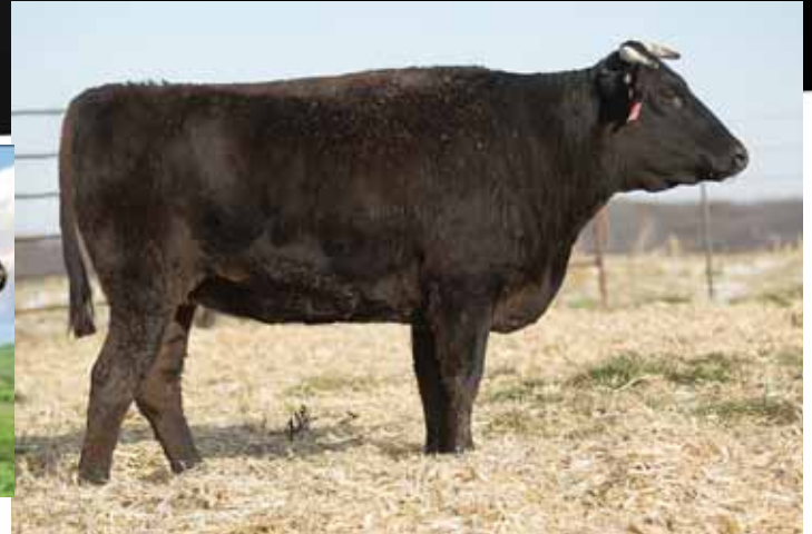
HP Mayura L0010, sire of Lot 36 & 37 embryos.