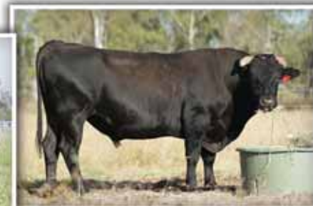
Westholme Hiramichi Tsuru