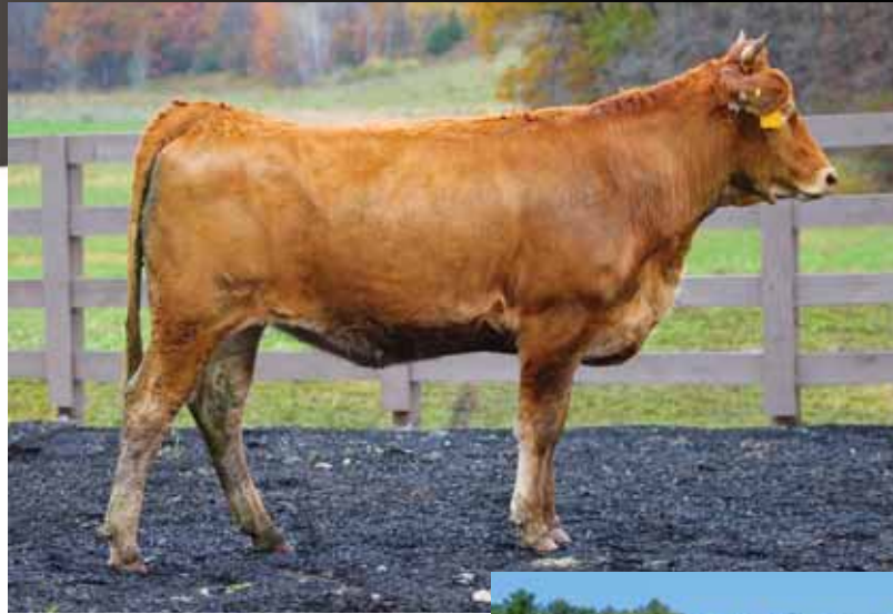
7519F, dam of Lot 28 embryos.

CONSIGNED BY CLIMAX AKAUSHI GARMS, CLIMAX, NY