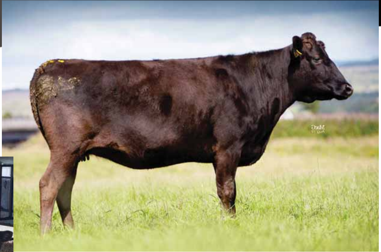
Highland Wagyu Aizatake 7, dam of Lot 12.