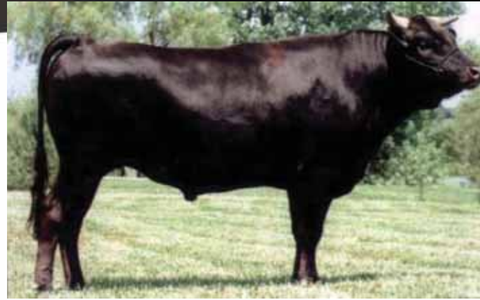
World K's Michifuku, sire of Lot 57.

CONSIGNED BY DRURY CATTLE RANCH, ROGERSVILLE, MO