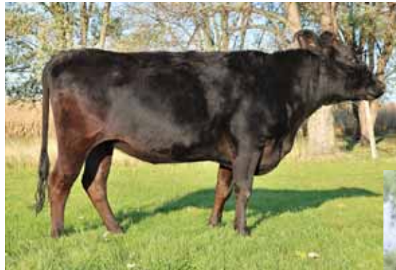
SYN Synergy Itomichi Hiko 35C, dam of Lot 10 embryos.

CONSIGNED BY SYNERGY WAGYU , SPRING CITY, PA