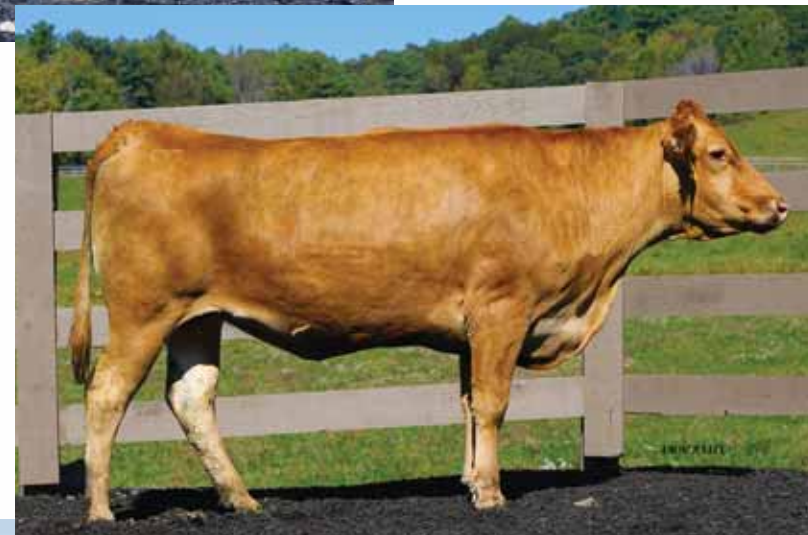
Heartbrand 9166X, dam of Lot 29 & 30 embryos.