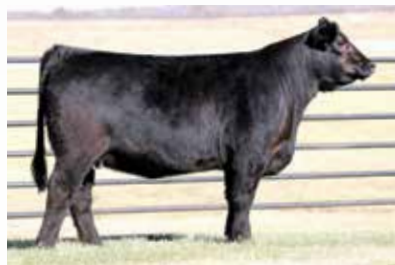
AUTO AJAY 206A DAM OF LOT 50