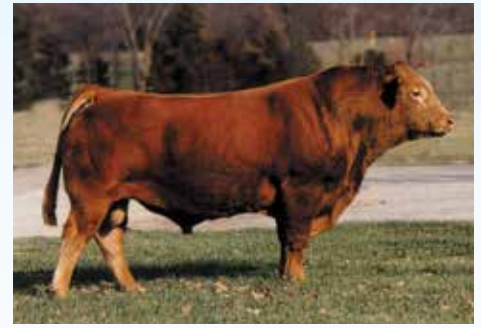
AUTO CLIFF HANGER 194D

Ref AUTO 521E LIM-FLEX(68/60.8) BULL | HOMO POLLED (T) | HOMO BLACK (T) 3/29/2017 | AUTO 521E | LFM2142809