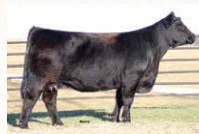
AUTO GEMINI 248T DAM OF LOT 48