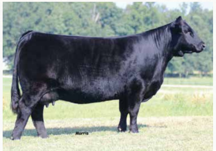
AUTO LUCKIE 246W • DAM OF LOTS 60-62

This Colburn Primo daughter is special. AUTO Haven 208H is out of a TMCK Durham Wheat daughter, AUTO Fedora ET, who is out of the great WLR Prada and owned by KLS Farms in Louisiana. Prada is one of the hottest Limousin females in the business. She continues to produce herd sires, donor females and numerous champions. She is double homozygous and 50% Lim-Flex. This female has a stacked pedigree that you'll see value in for years!