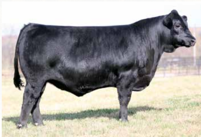
AUTO ACE VENTURA 557C • SIRE OF LOTS 22 & 23

AUTO Fairest 419F is a full sister to AUTO Frilly 431F. They are from the highly productive mating of AUTO Ace Ventura 557C x AUTO April 202A. This female's weaning weight ranks in the top 15% of the breed and her milk EPD ranks in the top 2% of the breed. She is homozygous black and polled.