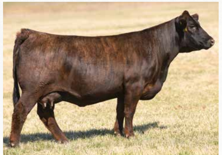
AUTO REMI 674D • DAM OF LOTS 52-54

This MAGS Aviator daughter is a full sister to AUTO Haisley 204H. Their dam is AUTO Remi 674D. She is homozygous black and double polled. You'll want to study these three full sisters' pedigrees for several generations back because they're packed full of some of the most elite names in the breed. AUTO Harriet 206H is an exciting January heifer calf that you'll want to add to your program.