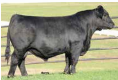
AUTO POWER PLUS 133B ET SIRE OF LOT 50