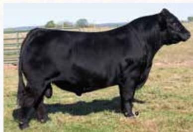
TASF CROWN ROYAL 960C ET SIRE OF LOT 48

GPFF BLAQUE RULON AMY JO DHAN 20L EXLR NASDAQ 380R TMCK MISS THICK 37T BLACK DIAMOND QUAIL RUN RAMONA BP EXLR LIMITED EDITION 765J AUTO CITY NIGHTS 214H