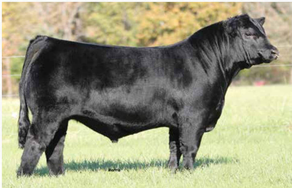
AUTO DENALI 746F • SERVICE SIRE OF LOTS 10-13

This is a full sister to AUTO Founder 270F—AUTO Fleece 273F has the elite genetic backing of BSF Opportunist Z5 and MAGS Manuela. She is a 50% Lim-Flex female that is homozygous black. Her marbling EPD ranks in the top 25% of the breed. If you missed your chance with AUTO Founder 270F, here's your shot! We love this female's unique design, her powerful pedigree and her production-oriented nature.