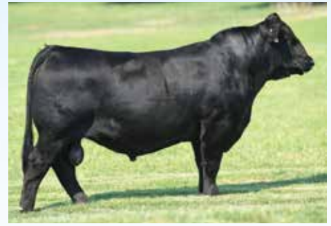
HBRL DELUXE PACKAGE 6114D

Ref AUTO REAL STRIKE 141D ET PERCENTAGE(79/70.1) BULL | HOMO POLLED (T) | HOMO BLACK (T) 4/28/2016 | AUTO 141D | NXM2120333