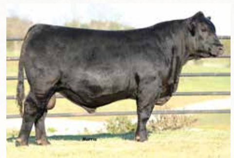
AUTO POWER PLUS 133B ET