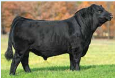
AUTO KING DAVID 120E ET SIRE OF LOT 49