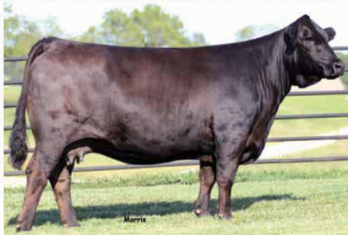
MAGS MANUELA • DAM OF LOTS 3 & 4

This EXAR Powersource 4723B daughter is tough to put a hole in! AUTO Florida 265F is out of the legendary MAGS Manuela female and is a granddaughter of EXAR Denver—so quality genetics run deep. This female is probably the most powerfully built female in this offering. She is expressively muscled, explosive in her rib shape and depth of body and she's as stout as they make females today. Her marbling ranks in the top 4% of the breed with a 0.39 figure. She is 50% Lim-Flex, black and polled.