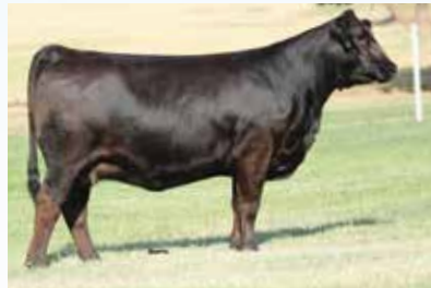
SSTO 662D ET DAM OF LOT 49