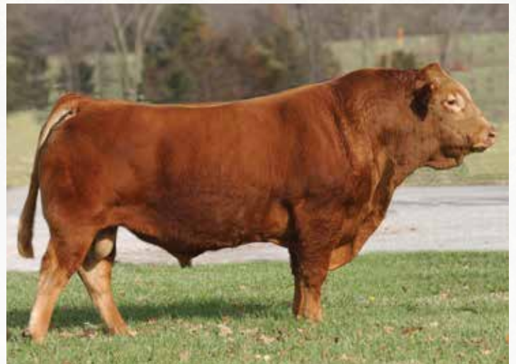
AUTO CLIFF HANGER • SIRE OF 37A & 38

ACHH Polled Bayo 99B is a heck of a powerful female! She's a wagon load of muscle expression and massive body shape. This homozygous polled female is dead level down her top and maternal in her type. If you want a heifer calf backed by extreme maternal power, AUTO Bayo II 653H is for you. She ranks in the top 25% for milk.