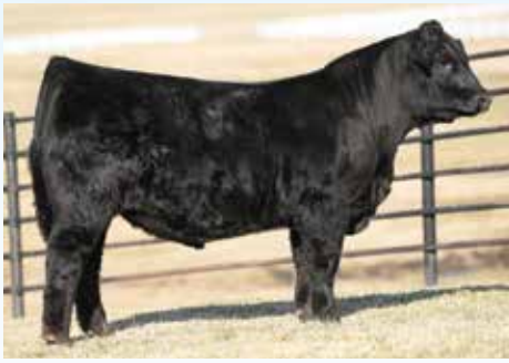
AUTO BLAQUE BLAZER 100F ET