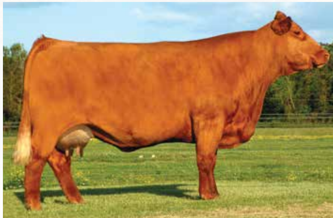
CARROUSELS PEACHES 4330P • DAM OF LOT 31

AUTO Poppy 456D is a daughter of AUTO Air Strike, a LH U Haul son. Her dam, AUTO Angel is an LVLS Secret Weapon daughter. This female's milk EPD ranks in the top 10% of the breed and her weaning weight and yearling weight both rank in the top 15%. She is homozygous polled. Her calf, AUTO Hilda 658H, is an impressive heifer calf. She is a daughter of AUTO Denali, an AUTO Lucky Strike son. Her milk EPD ranks in the top 10% of the breed. She is homozygous polled.