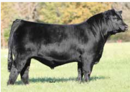
AUTO DENALI 746F