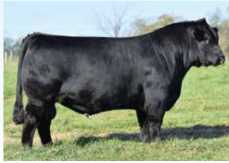
CJSJ DAUNTLESS 6257D ET