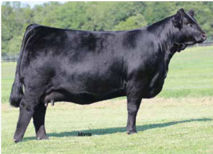
AUTO LUCKIE TOO 423Y • DAM OF LOT 51

LIM-FLEX(50/43) BULL | HET POLLED (T) | HOMO BLACK (T) 3/1/2020 | AUTO 1219H | LFM2276105