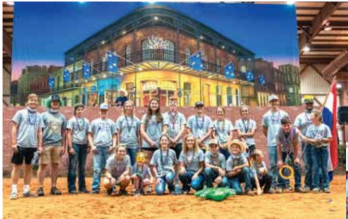
NATIONAL JUNIOR LIMOUSIN SHOW MISSOURI JUNIOR EXHIBITORS