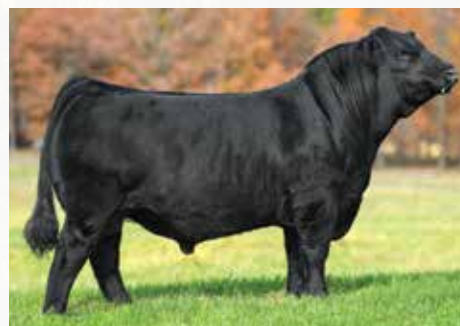
AUTO KING DAVID 120E ET