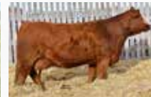
JYF 318D - Dam