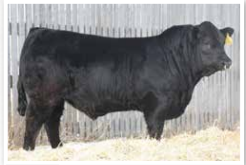
JYF Dimension 602D