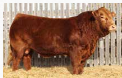
Big Timber - Sire of Dam