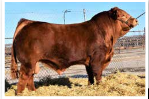
JYF Extra Chunk 518E