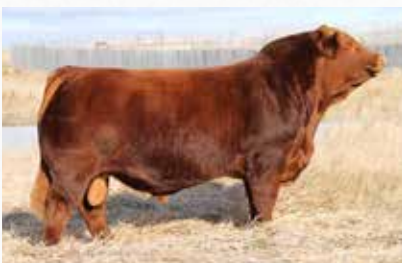
Credential - Sire