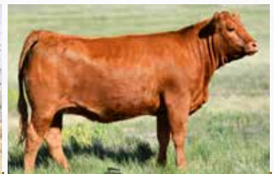
JYF Ginger 502G - Paternal Sister