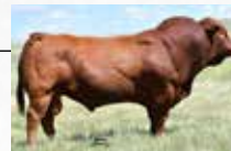
Freeman - Sire

Homo Polled Freeman daughter. Her dam sells as lot 7! Should add muscle with a ribeye EPD in the top 1% of the breed. She had a birth weight of 75# and a weaning weight of 731! Hedvig is an interesting breeding piece that will be fun to work with into the future.