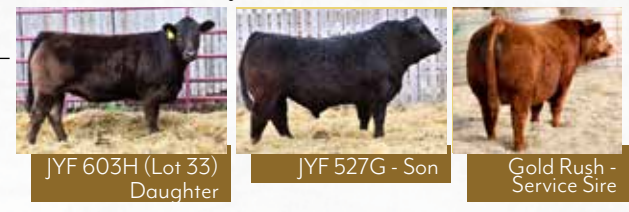
JYF 603H (Lot 33) Daughter

Homo Polled daughter of Wulfs Yalton, with a pedigree twist that includes D&M Endzone. All of her progeny have above average ribeyes. A daughter sells as Lot 33. Gold Rush should add even more performance and milk to the mating. Observed bred to Gold Rush April 12. Exposed April 1-30