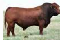
Edmonton - Sire

This is the youngest heifer in this group, and would make a fun junior project. She has a pedigree loaded with milk and should turn into a great cow. She also has a great disposition. The breeding possibilities are limitless.