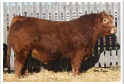
JYF Bookmark 115B