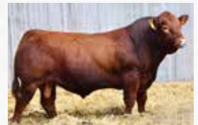
Hacker - Service Sire