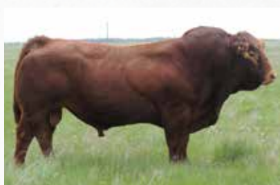
Yieldmaster - Sire of Dam