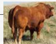
Zephyr - Sire

A.I. Anchor B Gold Rush June 30. Exposed Anchor B Gold Rush July 1 – Aug 25