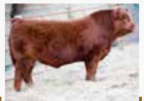
Gold Rush Service Sire

JYF JENNY 321J Red Double Polled BW: 87 JYF 321J CPF4111462 93% 14 April 2021