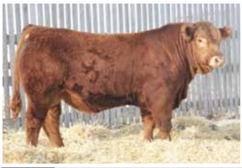
JYF Debonair 604D