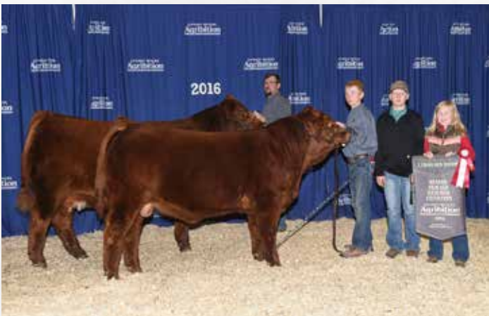
Dam of Gold Rush - Anchor B Bailey