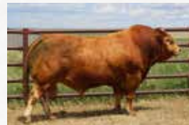
Enigma - Sire