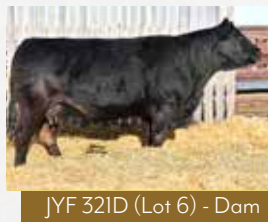
JYF 321D (Lot 6) - Dam