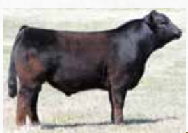
Checking Account - Service Sire

JYF GERDA 501G Black Homo Polled (T) BW: 68 Adj WW: 600 Adj YW: 785 JYF 501G CPF4101983 93% 08 Sept 2019