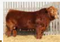
Big Timber Maternal Brother