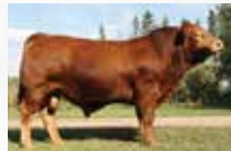
Axel Rose Sire of Dam