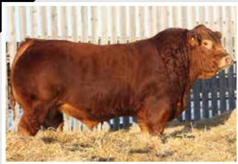
JYF Cornwall 28C