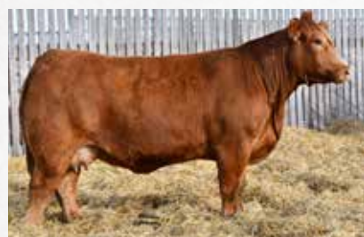
JYF 24E - Dam