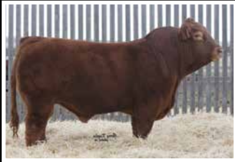
JYF Yaggermeister 150Y