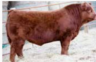
Gold Rush - Service Sire