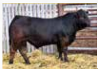
JYF 618H - Maternal Brother