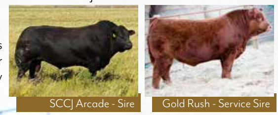
SCCJ Arcade - Sire

Homo Polled cow out of a big milking 1038U daughter with a +39 for Milk. Arcade sons have been in high demand by commercial cattleman. We felt we had to include a daughter in our Piece of the Pie sale, and Emotion 30E is one of the best. Bred March 24 for an early January Gold Rush coupon. AI bred Gold Rush March 24. Exposed April 1-30.