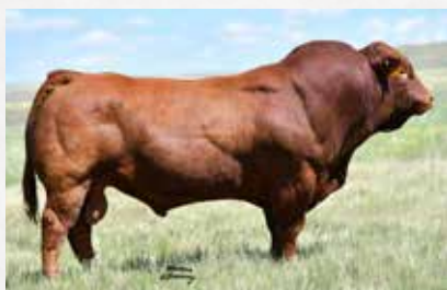
Freeman - Sire

Check out the numbers on Heidi! Out of a picture perfect Zephyr x Made to Order daughter that is a standout in early production. A maternal brother JYF Greenlight 519G sold to Albert Hapke at the top of our 2021 bull sale. Buy with confidence.