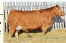
JYF 121B (Lot 2) Dam

Red Homo Polled (T) BW: 75 Adj WW: 642 Adj YW: 786