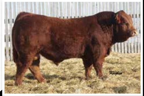
JYF Big Chunk 510E