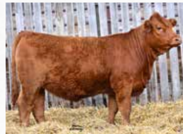
JYF 638H - Daughter