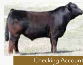
Checking Account Service Sire