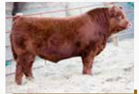
Gold Rush - Service Sire