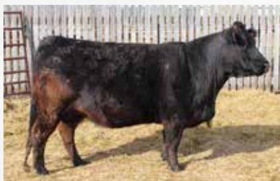
CCM 26B - Dam