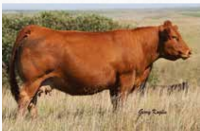
SY JBAK Right One 641R - Dam