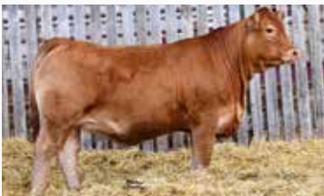
JYF 613H (Lot 34) - Maternal Sister