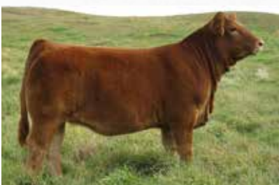
RPY Emotion 29E - Dam