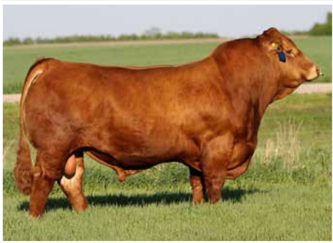
JYF Chunk 35C