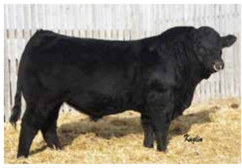
JYF Entity 524E