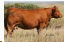
SY 642R Granddam