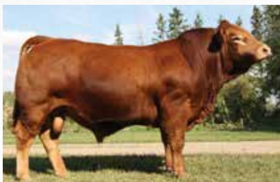
Excel Polled Axel Rose - Sire