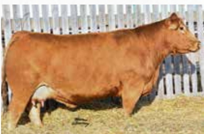
JYF 121B (Lot 2) - Maternal Sister