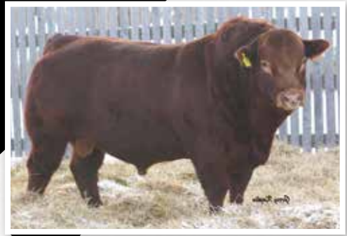
JYF Yieldmaster 80Y