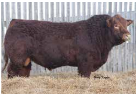
JYF Campbell 3C