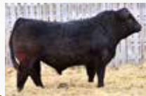
JYF 527G Maternal Brother