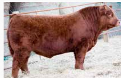
Gold Rush - Service Sire