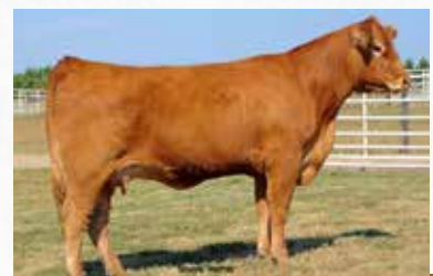
Wulfs Your Choice - Maternal Sister