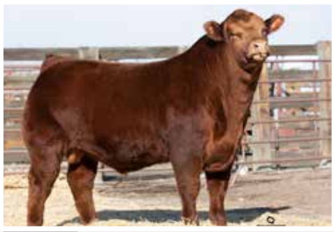
JYF Franchise 612F