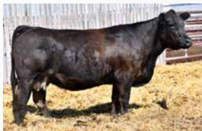
JYF 2E - Dam