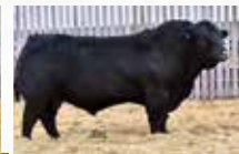
Executioner - Sire