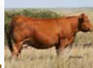
641R - Full Sib to Dam