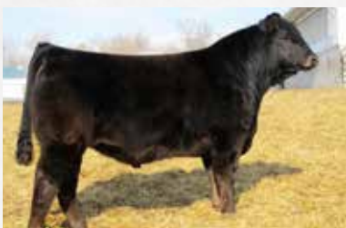
Wulfs Yankee - Maternal Brother