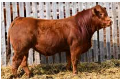
JYF 622H - 2021 Son