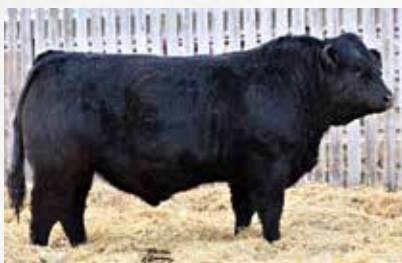
JYF 504G - Son for Darcy Champion