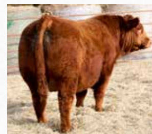
Gold Rush - Service Sire