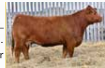
JYF 331D (Lot 3) Dam

Black Homo Polled (T) BW: 65 Adj WW: 564 Adj YW: 731