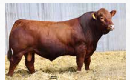
JYF Hacker - Service Sire