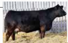
JYF 23E - Dam

AI LFLC Checking Account April 7 (Safe) Exposed JYF Fiddler 201f April 20 - May 15