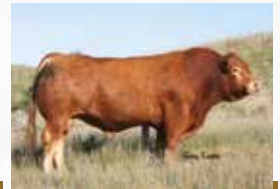
Zephyr - Sire of Dam