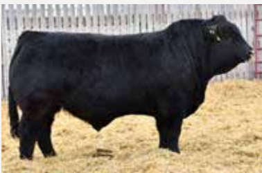
JYF Gentry 507G - Paternal Brother