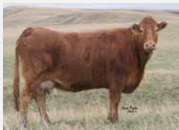
JBAK 671 - Dam