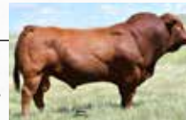
Freeman - Sire

A beautiful Homo Polled Freeman daughter. She is out of an excellent Axel Rose female who raised a calf with a broken leg that we included in our weaning groups which really hurt her numbers. I know her dam is a great one, but on paper she will be a long time proving it because of our mistake. This heifer is going to make a great cow.