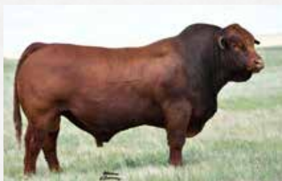
Edmonton - Sire