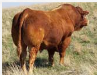
Zephyr - Maternal Brother