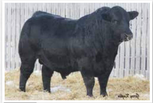
JYF Zeek 151Z