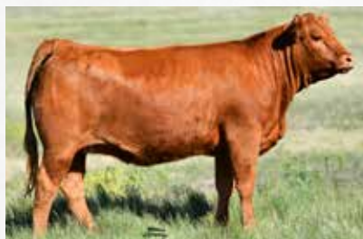
JYF 502G (Lot 9) - Daughter

Observed bred Gold Rush April 23. Exposed April 1-30.