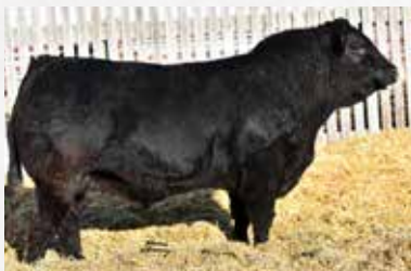
JYF Governor 301G - Paternal Brother