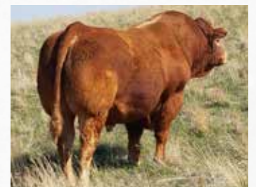
Wulfs Zephyr - Sire