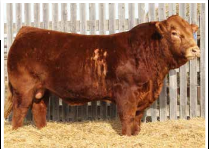
JYF Big Timber 47B