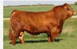
Chunk - Sire