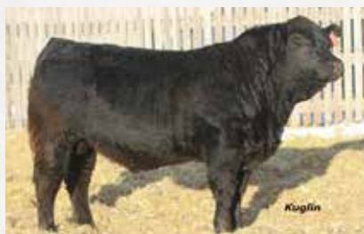
JYF 615F - Son at Highland Stock Farms