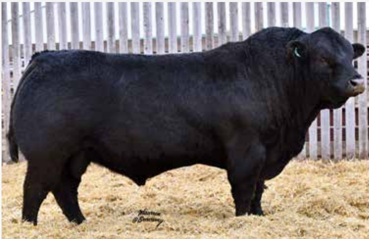
Plains Polled Executioner - Sire

We think this flush has the potential for greatness and are proud to offer 4 embryos out of this mating. Embryos stored at Bow Valley Genetics and are available in Canada and the US.