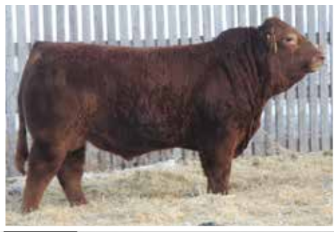
JYF Deadeye 624D