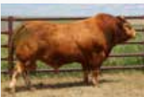
Enigma - Sire