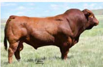
Freeman - Sire