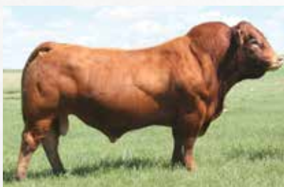
ROMN Made to Order - Sire

Observed bred to Gold Rush April 7. Exposed April 1-30