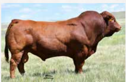
Freeman - Sire

We flushed Haddie's granddam several ways and Elsa 24E is her natural calf by Big Timber. We think that Freeman has moderated the huge performance on the dam side to create a beautiful breeding opportunity. Haddie is Homo Polled with an excellent EPD profile.