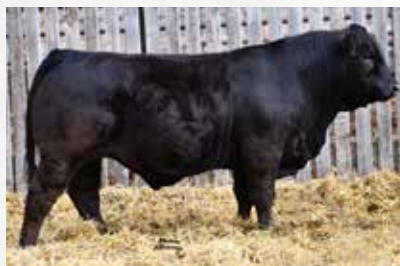
JYF 607H - Son