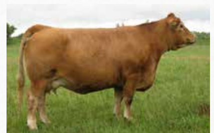
RPY 23W - Granddam