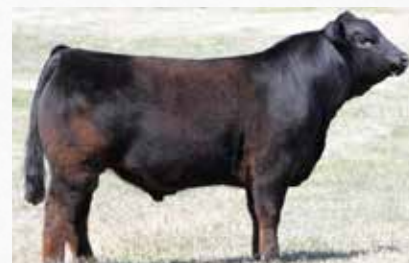
Checking Account - Service Sire