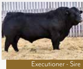
Executioner - Sire

AI April 6/21 to LFLC Checking Account 701C (safe) Exposed JYF Fiddler April 20-May 15