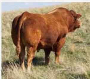
Wulfs Zephyr - Sire

AI Gold Rush March 26 (Vet opinion safe) Exposed April 1-30