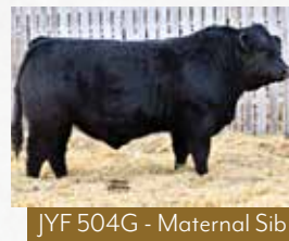
JYF 504G - Maternal Sib