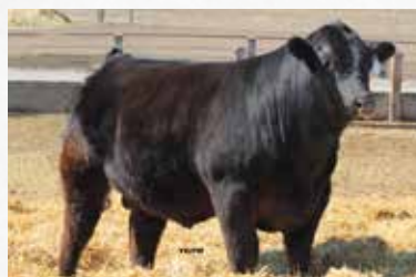
Compliant - Maternal Brother