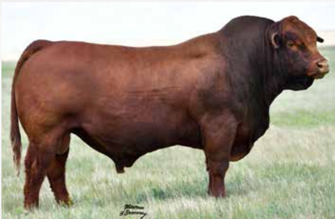
JYF Edmonton - Sire