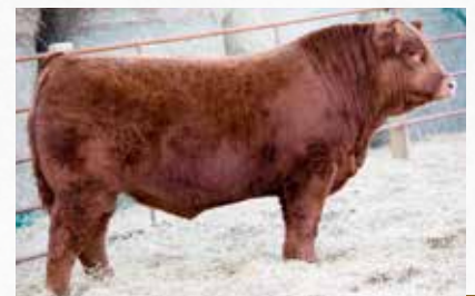
Gold Rush - Service Sire