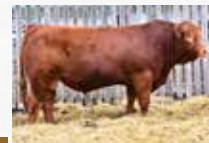
JYF 167H - Son