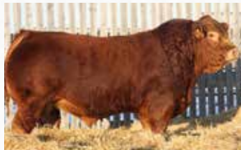
JYF Cornwell - Maternal Brother