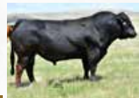
Fiddler Service Sire