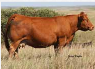
SY JBAK Right One 641R - Full Sib