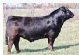
LFLC Denver - Sire

AI LFLC Checking Account April 7 (Safe) Exposed JYF Fiddler April 20-May 15