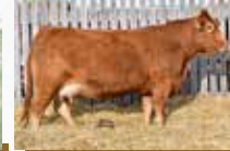
JYF 713E - Dam