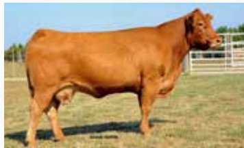
Wulfs Soloist - Paternal Granddam