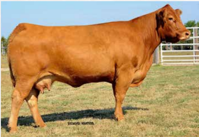
Wulfs Soloist - Dam

We feel very fortunate to be able to offer your choice of the three heifer calves by JYF Edmonton and Wulfs Soloist. These progeny were born in late April at MTC Cattle Co. in Derwent Alberta. Your final selection does not have to be made until March 1, 2022. We want to wean the heifers and grow them out so you have the ability to make the best decision possible. We hope that your selection will follow in one of the greats footsteps and continue her legacy.