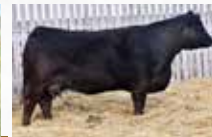
506C (Lot 7) - Dam