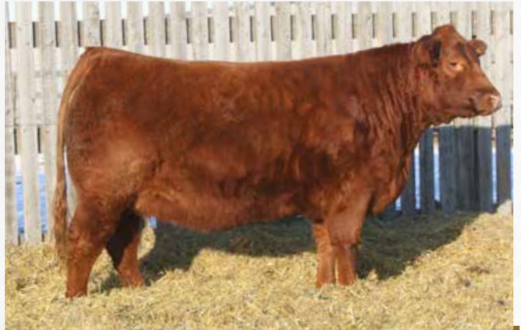
JYF Fancy 816F - Dam