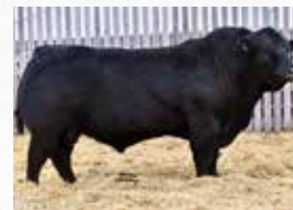
Executioner - Sire

A.I. Checking Account April 7 (safe) Exposed JYF Fiddler April 20-May 15