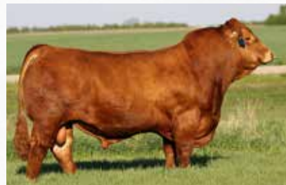
JYF Chunk - Sire

Right from the middle of our transplant program comes Hello Dolly. Her depth of body and straight lines make her extremely attractive from end to end. Add in a disposition second to none and she has unlimited potential. We would like to campaign Hello Dolly this fall for the new owner at our expense.