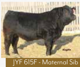
JYF 615F - Maternal Sib