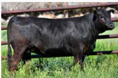
JYF 503G (Lot 11) - Daughter