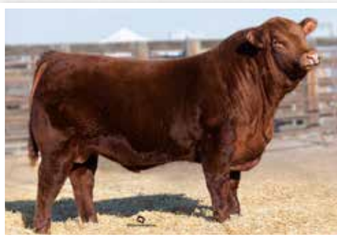
JYF Federal 614F