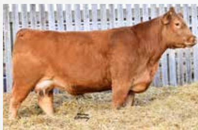
JYF 612D - Dam