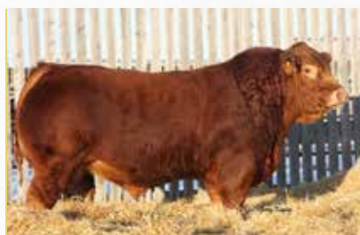
Cornwell - Maternal Brother