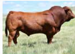
Freeman - Sire

Heirleen's dam is another Zephyr daughter out of EXLR Gina 502P from Express Ranches. She has been a consistent producer every year. Heirleen is homo polled with a bright future.