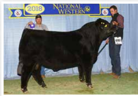
JYF Dead Head 296D