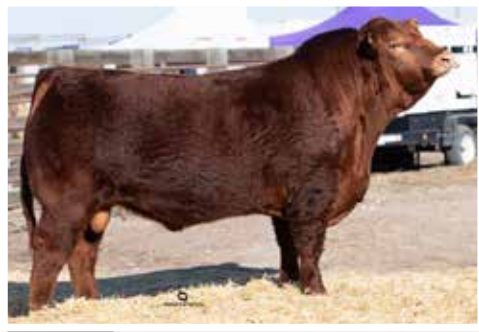
JYF Dedicate 217D