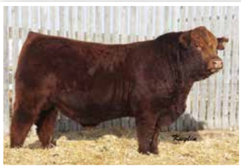
JYF Edmonton 519E