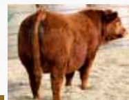
Gold Rush Service Sire