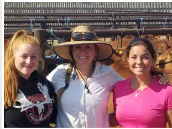
“2021 Halter Breaking Crew”

In order to make this a true “Piece of the Pie” sale we are offering a slice of all parts of our program. Our open fall heifers are offered as early breeding opportunities for your program. The majority are the first progeny offered out of SYES Freeman 104F. He was the lead off and high selling bull in the Symens Brothers sale in South Dakota. His first sons will sell in the 2022 bull sale.