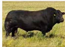
Arcade - Sire

A.I June 30 Anchor B Gold Rush. Exposed Anchor B Gold Rush July 1- Aug 25.