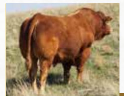
Zephyr - Sire of Dam