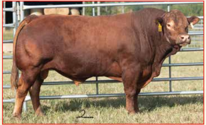
AR EXECUTIVE 7173E