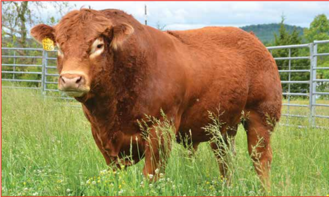
AR ZILLION 226Z • Sire of Lots 22 & 23