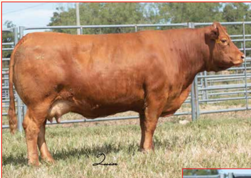
LOT 36 • Maternal sib to Lot 50