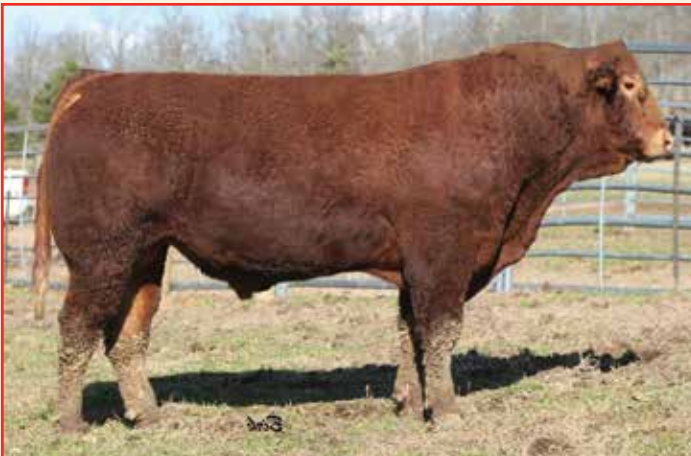
AR COLONEL 531C • Sire of Lots 27 & 28