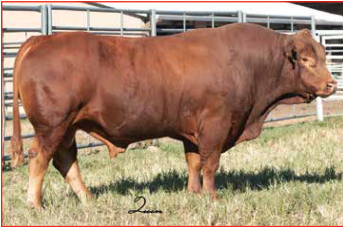
AR EXPRESS CARD 7129E • Sire of Lot 47A Semen sells as lot 74