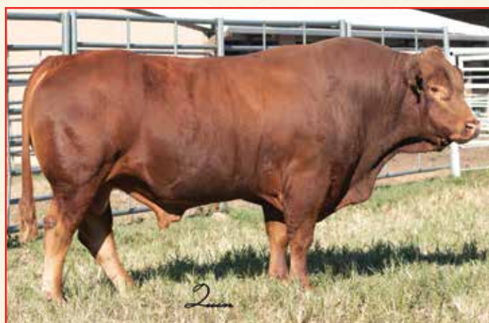
AR EXPRESS CARD 7129E • Service sire of Lots 59, 61 & 62

AR Fine Milly-O traces back to the Wick 7K cow on the bottom side and by AR Zillion, a sire who has done a heck of a job siring daughters cattlemen desire and sons they demand. Lots of rich heritage in this young female who totes a lower birth weight EPD. A maternal sister sells as Lot 62. She sells safe to AR Express Card for a spring 2022 polled Fullblood.