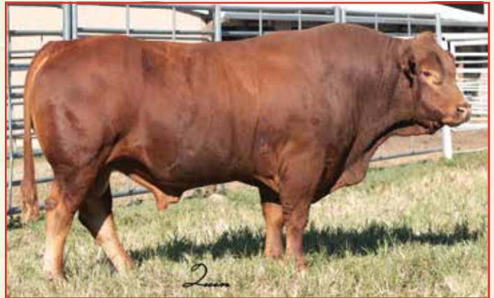
AR EXPRESS CARD 7129E