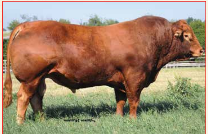
CF JIM DANDIE 216U • Sire of Lot 28A