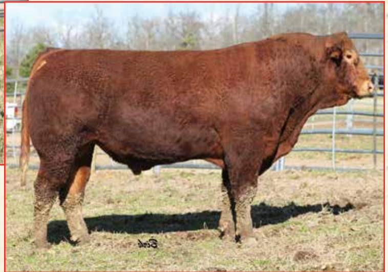
AR COLONEL 531C • Sire of Lots 7 & 8