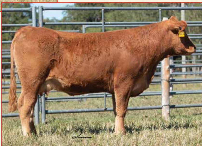
LOT 16 • Maternal sib to Lot 51