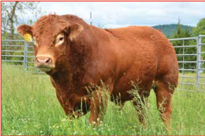
AR ZILLION 226Z • Sire of Lots 48 & 49