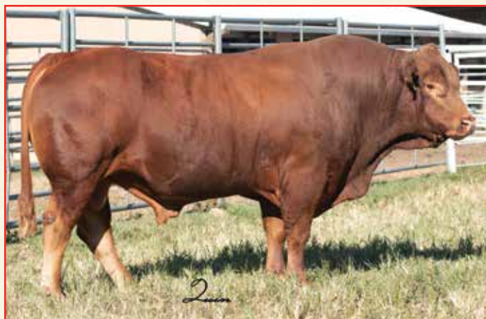
AR EXPRESS CARD 7129E • Sire of Lots 68 & 69

AR Hot Milly is a double polled Fullblood from our resident herd sire, AR Express Card, a Zillion son who carries on the powerful heritage of his sire. Her dam, AR Yilly Milly, a fantastic producing female who goes back to the McKown cow, MK Kathleen, a cornerstone in our herd. Maternal sisters sell as Lot 58 and 61. Sells open.