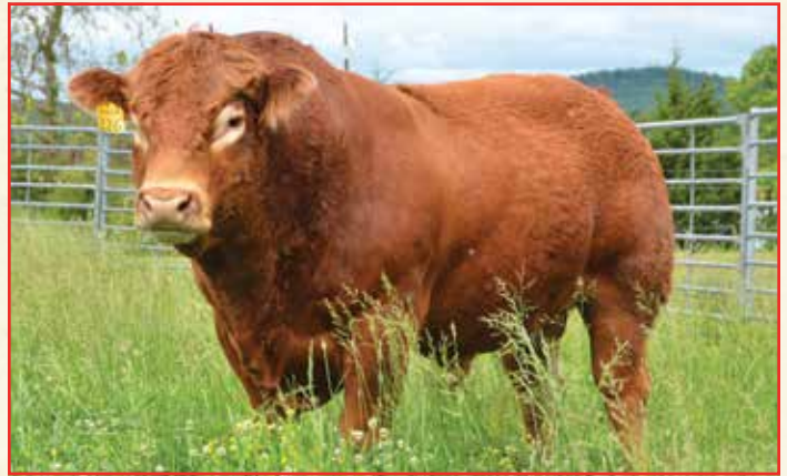
AR ZILLION 556Z