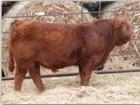
SYES BACKWOODS 75B