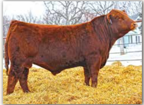
WULFS GARFIELD T937G