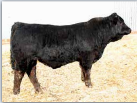
CHTT BLACK BEAR 6471B