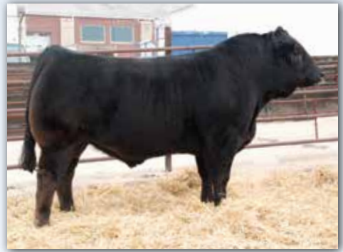
RUNL ALLIANCE 272 A