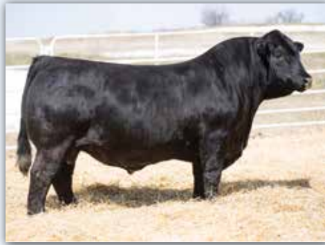
CJSJ DATA BANK 6124D ET