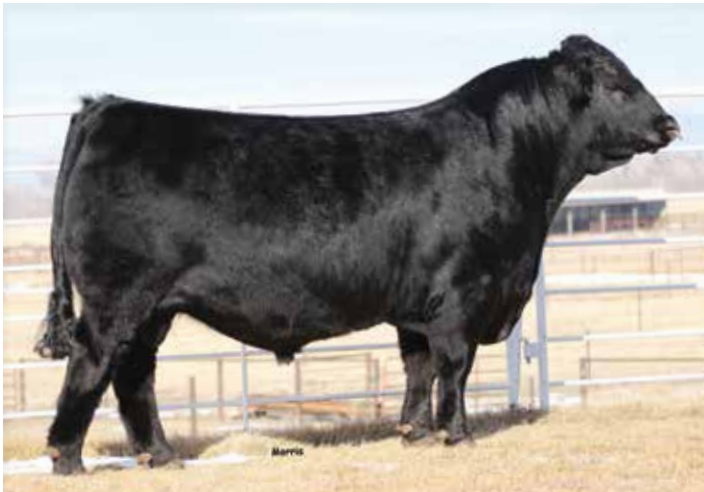
MAGS EVEREST • Sire of Lot 1