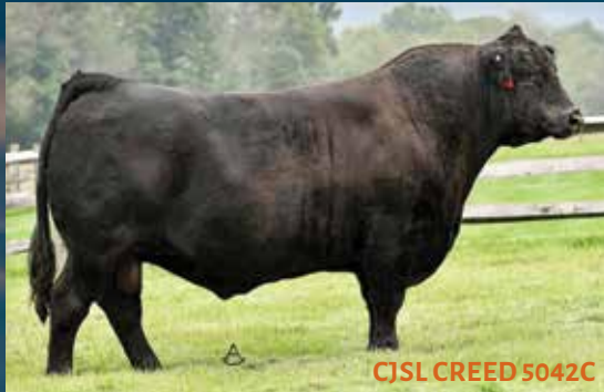
CJSI CREED 5042C