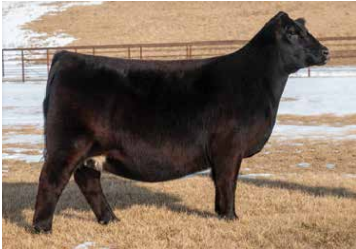
CELL FASCINATION 8231F ET • Dam of Lot 1