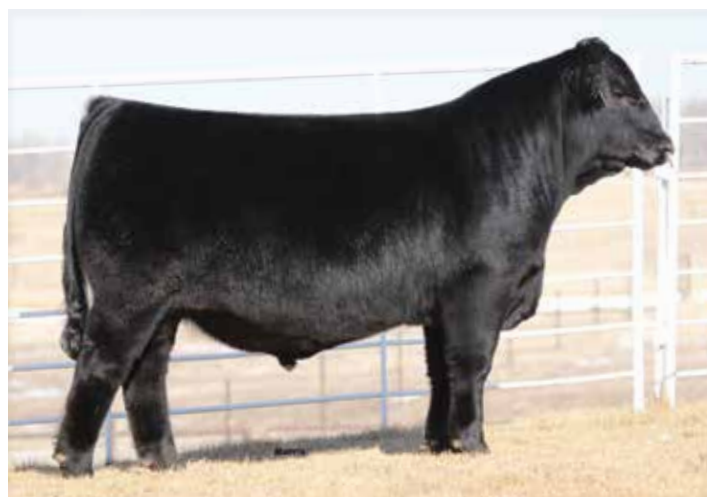
MAGS FIRESTONE 218F · Sire of Lots 2A & 2B

These two full brothers are absolute standouts in the offering. CELL Keepin Score 2239K is heavily muscled, ruggedly designed, big-bodied and sound on the move. His sire, MAGS Firestone 218F, was the 2019 NWSS Grand Champion Limousin Bull who is siring standout progeny across the country. Firestone progeny have tremendous base width, center capacity and muscle expression. These brother's donor dam is a maternal patterned PVF Insight 0129 daughter, out of the extremely popular AUTO Luckie 815X donor female. On paper, he ranks in the top 35% for weaning weight and top 25% for yearling weight paired with high rankings in numerous industry relevant traits. CELL Keepin Score 2239K has everything completely stacked in his favor!