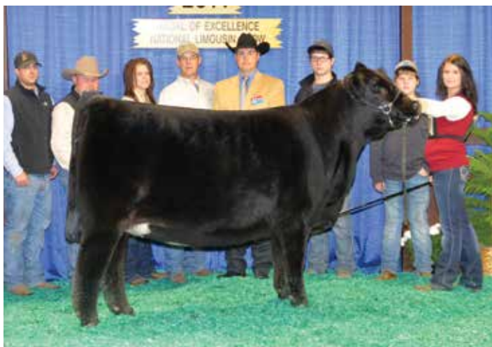
LLJB ABSOLUTE STYLE 3056A · Dam of Lot 4