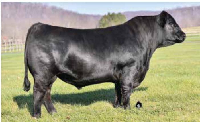
COLE GENESIS 86G · Sire of Lots 30 & 32