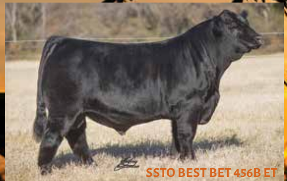
SSTS BEST BET 456B ET