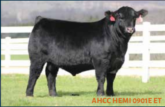
AHCC HEMI 0901E ET