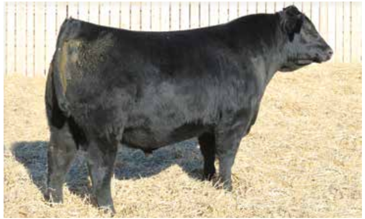
MUSGRAVE HEADWAY · Sire of Lots 53, 54 & 55