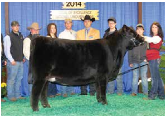
LLJB ABSOLUTE STYLE 3056A · Dam of Lot 45