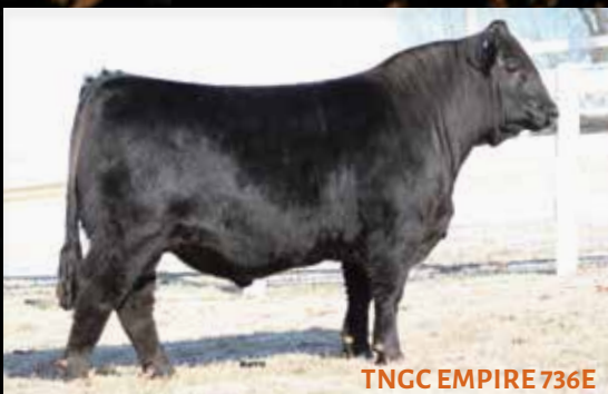
TNGC EMPIRE 736E