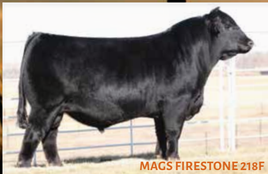
MAGS FIRESTONE 218F