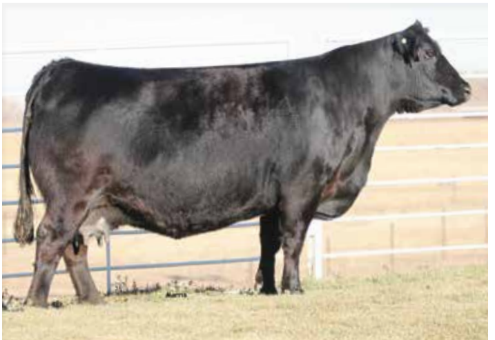
CJSL 4357B ET · Dam of Lots 3A & 3B

CELL TMCK Kingpin 2267K is a full sib to lot 3A. He brings power, thickness and muscle expression. Study this herd sire prospect and put him at the top of your list sale day. On paper, he offers a balanced, yet impressive EPD profile. Ranking in the top 15% for both weaning weight and yearling weight. Also, take note of his breed-leading marbling. He has the data and pedigree to do big things for your operation.