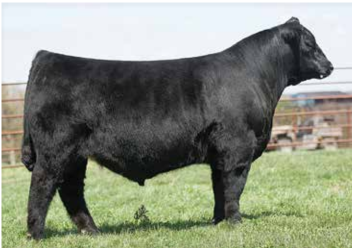
CELL FREEDOM 8208F • Full sib to dam of Lot 1

Exposition in the MOE National Limousin Show. This female was then paired with the proven MAGS Ali and the results will live in the Limousin history books for a long time, with many other notable progeny that are a product of this great pairing. CELL Fascination 8231F was the dam of the of CELL Jade the $105,000 top-selling female from our 2021 Fall Harvest Female Sale. Phenotypically, this herd sire prospect is smooth patterned, long-bodied, wide-based and truly impressive when set into motion. Aside from his visual advantages, on paper, he presents a set of breed-leading EPDs highlighted by ranking in the top 25% for both weaning weight and yearling weight. What's more, he is double homozygous. Don't miss out on your chance to own this remarkable individual that will predictably advance your breeding program to new heights.