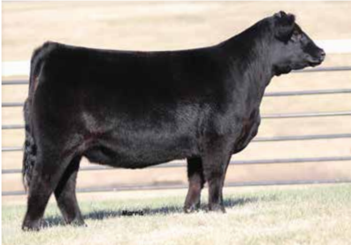
AUTO LUCKIE 815X · Maternal grandam of Lots 2A & 2B

Here is the full sib to lot 2A. Study this heavyweight, homozygous polled, homozygous black Lim-Flex that grabs your attention due to his length of body, wide top, hind quarter dimension and performance. Don't miss this herd sire prospect that will add pounds and dollars to any operation.