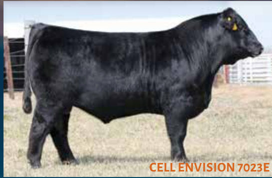
CELL ENVISION 7023E