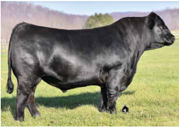
COLE GENESIS 86G · Sire of Lots 3A & 3B

Here are two brothers that are sure to be a crowd favorites sale day. Visually, CELL TMCK Known 2265K is heavily structured, level topped and free moving off both ends with extra muscle expression. Sired by COLE Genesis 86G, the HUNT Credentials son that was the $40,000 top seller in the 2020 Coleman Limousin Bull Sale going to Tubmill Creek Farms. This sire caught the attention of many since he was at top of the breed for growth, docility and marbling. His donor dam is a S A V Hesston 2217 daughter that is doing a super job. On paper, he offers impressive growth, ranking in the top 10% for weaning weight and top 15% for yearling weight. Also, take note of his breed-leading marbling. Make no mistake and be sure to have these two on the top of your list sale day.