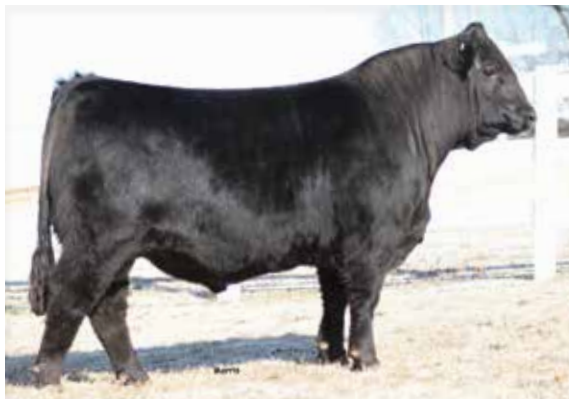
TNGC EMPIRE 736E · Sire of Lot 45