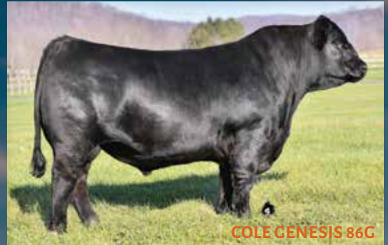
COLE GENESIS 86G