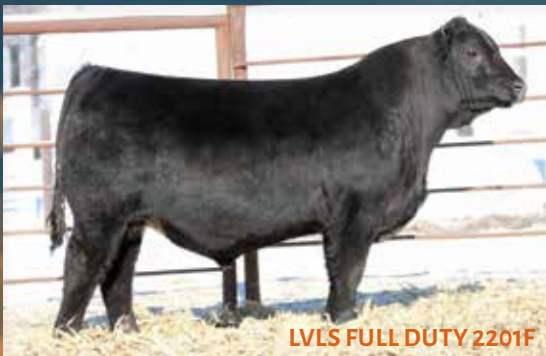
LVLS FULL DUTY 2201F