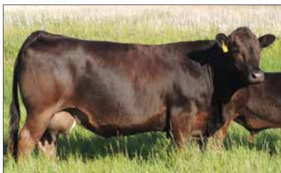
TREF YELLOW JELLO 712Y • Dam of Lot 25