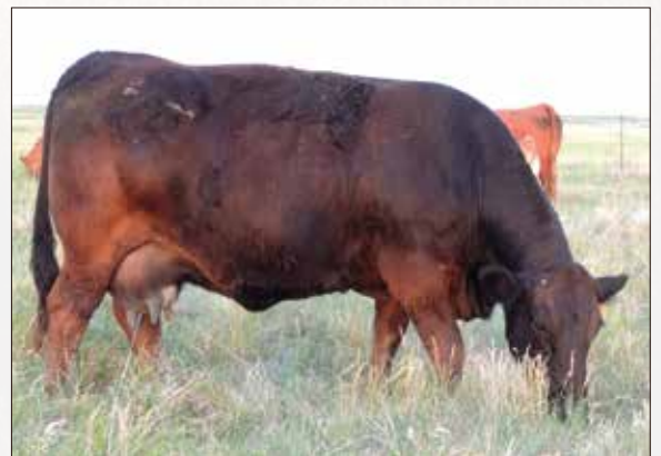
TREF ZAYLIE 807Z • Dam of Lot 6