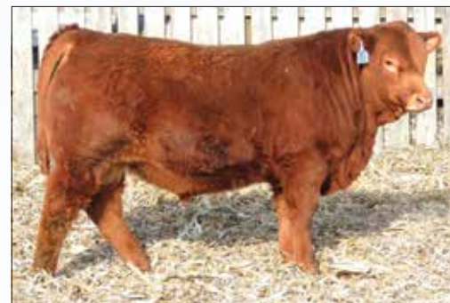
TREF GRAND SLAM 111G Sire of Lots 47,48,50,51 & 52