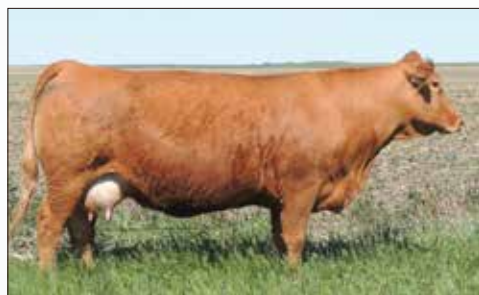
TREF ALEXANDRIA 984A Dam of Lot 33