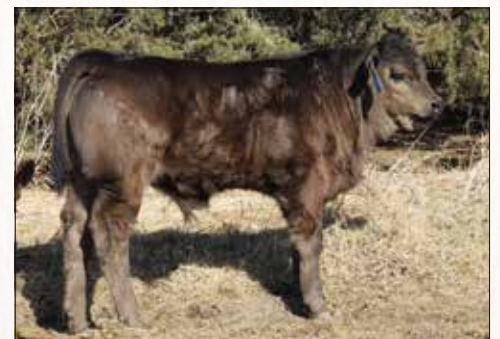
LOT 7 • Pictured as one-month-old