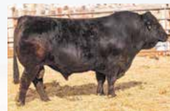
SYES EASY GOING 77E