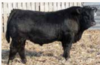
TREF GUNPOWDER 290G