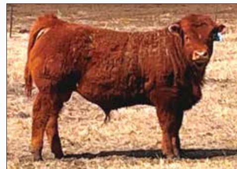
LOT 23 • Pictured as calf