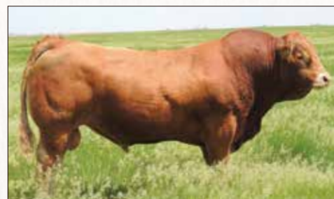
TOMV DIESEL 619D • Sire of Lots 1-4