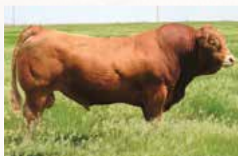
TOMV DIESEL 619D