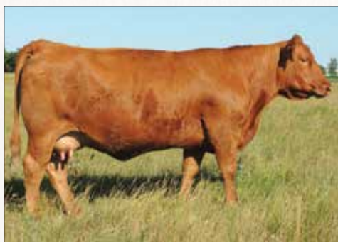
Maternal grandam of Lots 1-5