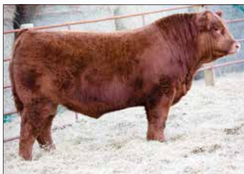
ANCHOR B GOLD RUSH 48G Sire of Lot 5