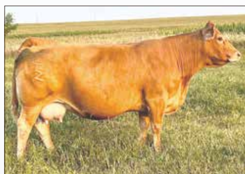
TREF BLOOM 059B • Dam of Lot 14