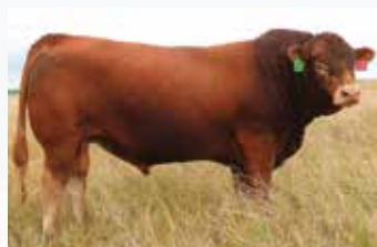
DLVL GUARDIAN 967G