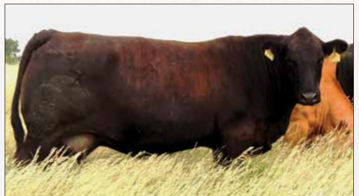
TREF DAKOTA GIRL 292D • Dam of Lot 19