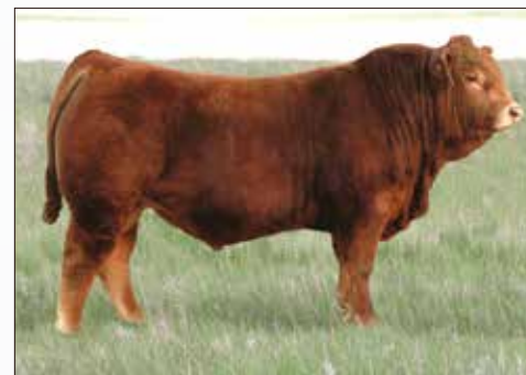
TREF Hardcore 204H • Sire of Lot 11