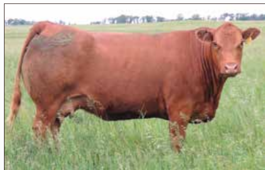
TREF BABY DOLL 034B • Dam of Lot 35