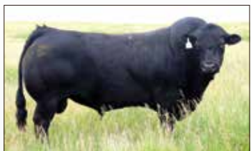
TREF DONE RIGHT 707D Maternal brother of Lot 9