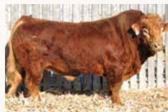
TREF EZ STREET 107E