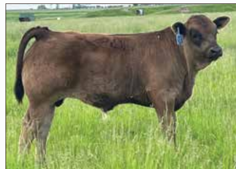
LOT 38 • Pictured as calf