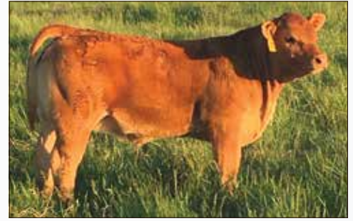
2021 full sister to Lots 1-3