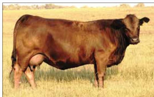
TREF DAKOTA DIXIE 283D • Dam of Lot 13