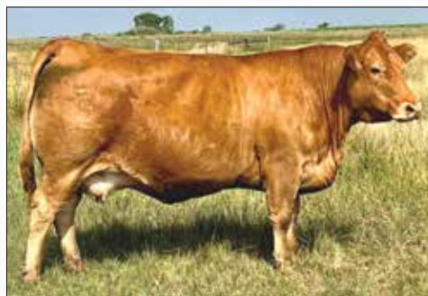
TREF CUPCAKE 125C • Dam of Lot 15