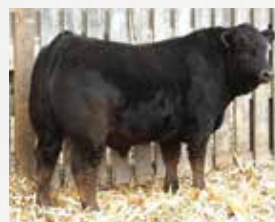
TREF HOTSHOT 345H