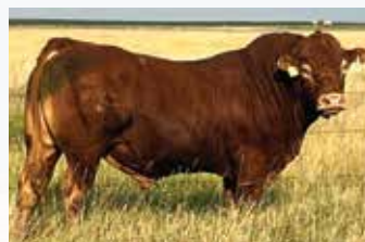
GV GRID IRON 862G