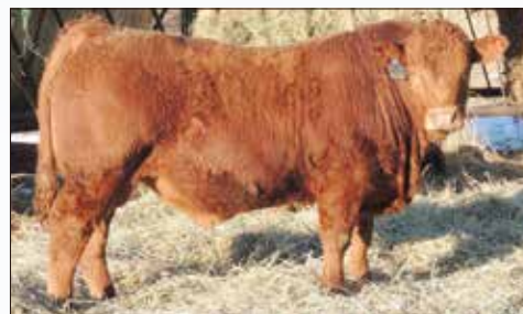
LOT 4 • Pictured in November