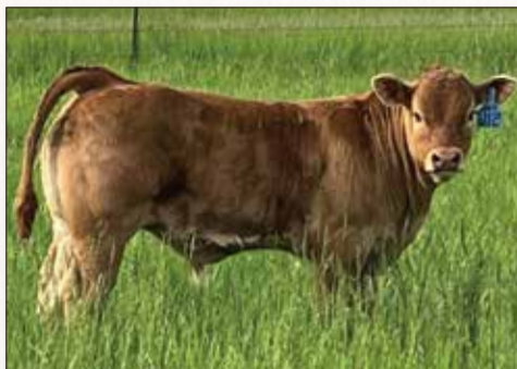
LOT 10 • Pictured in June