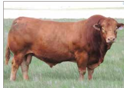
TREF ZEUS 232Z • Sire of Lot 33