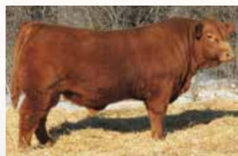
TREF COMMANDER 766C