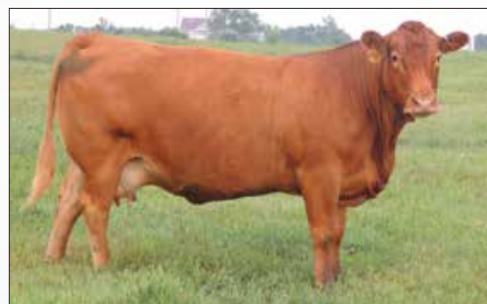
TREF BRIELLE 064B • Dam of Lot 24