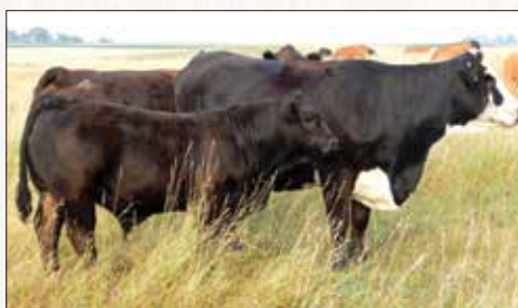
LOT 7 • Pictured with recip dam