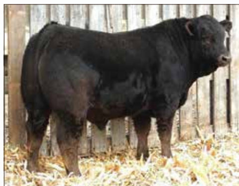
TREF HOTSHOT 345H • Sire of Lots 38 & 39