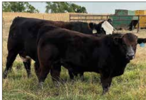
LOT 8 • Pictured with recip dam