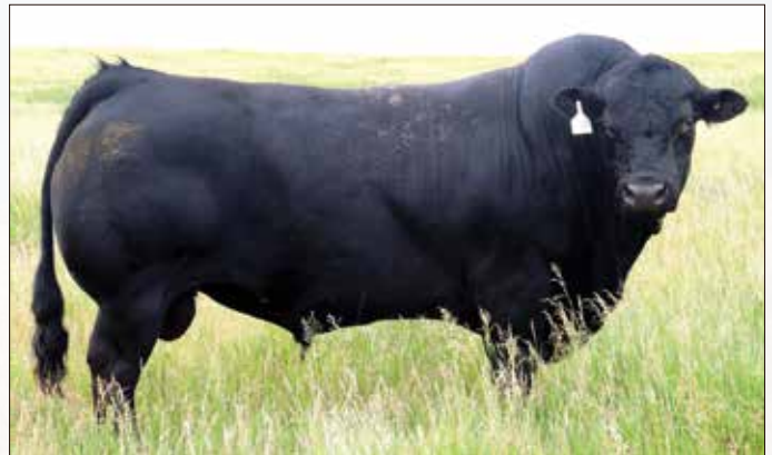
TREF DONE RIGHT 707D • Sire of Lot 19