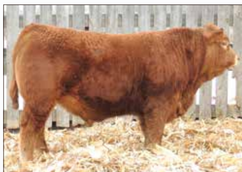
TREF JAMMER 117J • Full brother to Lot 48