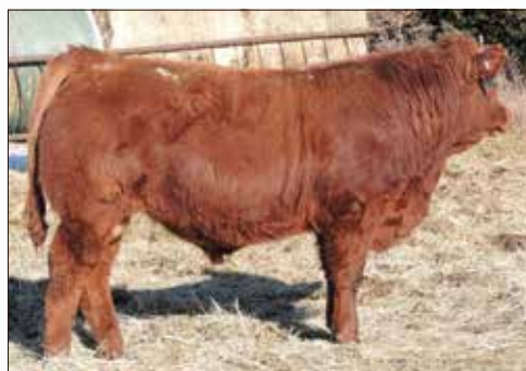
LOT 11 • Pictured in November