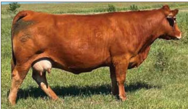
TREF FLICKER 491F • Dam of Lot 20