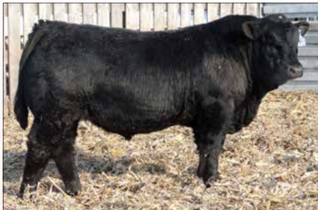
TREF GUNPOWDER 290G • Sire of Lots 20,21 & 22