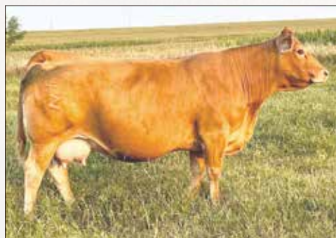
TREF BLOOM 039B Maternal grandam of Lot 10

CALVING EASE: EE F94L MYOSTATIN 2 RETAINING 1/3 INTEREST