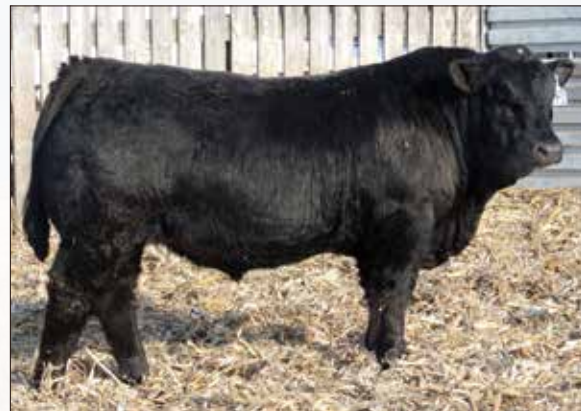
TREF GUNPOWDER 290G • Sire of Lot 6