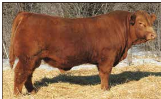
TREF COMMANDER 766C • Sire of Lot 25