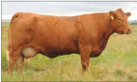
TREF BRYNN 075B • Dam of Lots 2 & 3