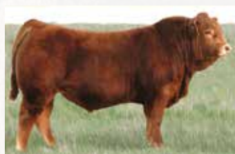
TREF HARDCORE 204H