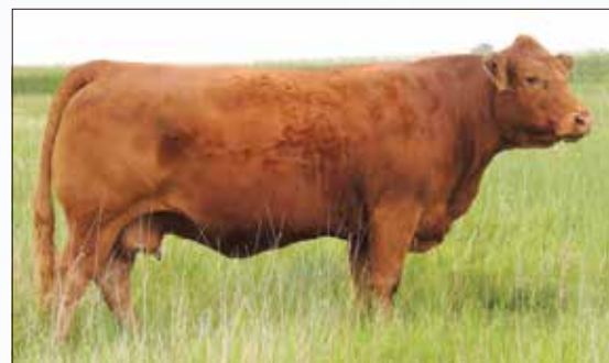
TREF YAKIRA 766Y • Dam of Lot 17