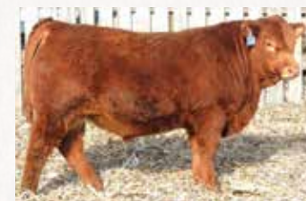
TREF GRAND SLAM 111G