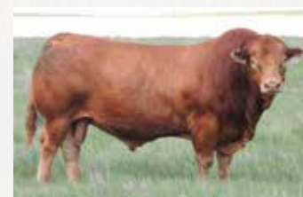
TREF ZEUS 232Z