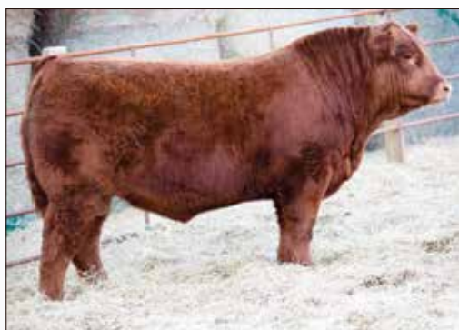
ANCHOR B GOLD RUSH 48G