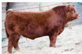
ANCHOR B GOLD RUSH 48G