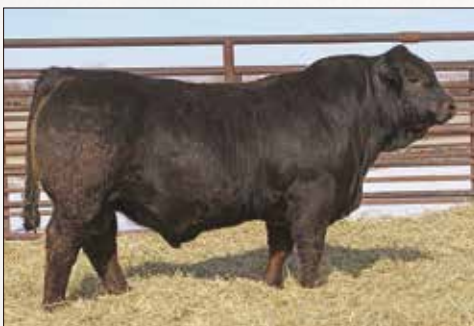
WULFS HANDIWORK T027H Sire of Lots 7 & 8

CALVING EASE: EE F94L MYOSTATIN 2 RETAINING 1/3 INTEREST