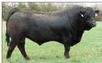
TREF COAL TRAIN 707C Maternal brother of Lot 9