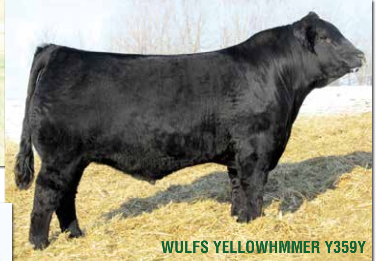
WULFS YELLOWHAMMER Y359Y