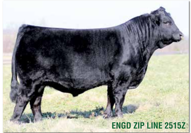
ENGD ZIP LINE 2515Z

Top 15% YW, CW Top 25% WW, MA, CM, MS Top 30% $MI