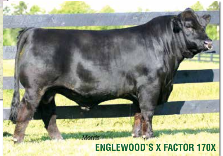
ENGLEWOOD'S X FACTOR 170X