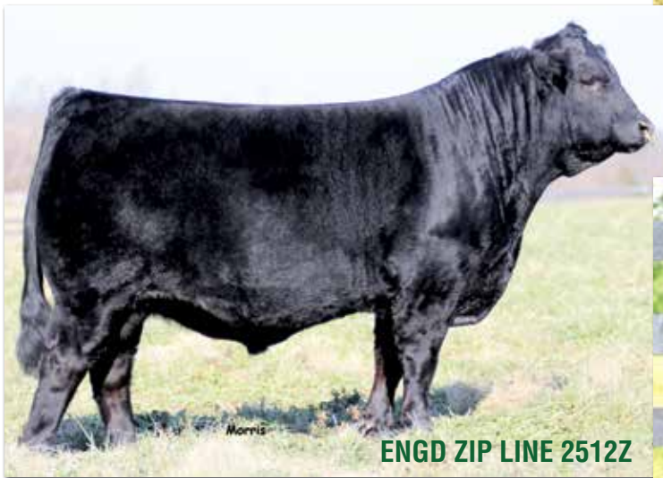
ENGD ZIP LINE 2512Z