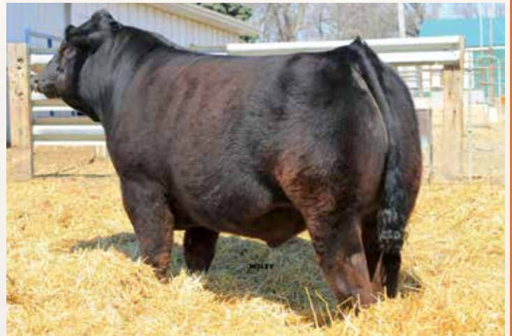
WULFS COMPLIANT K687C ET • Sire of Lot 2B