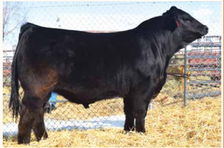
COLE CADILLAC 05C • Sire of Lot 1A