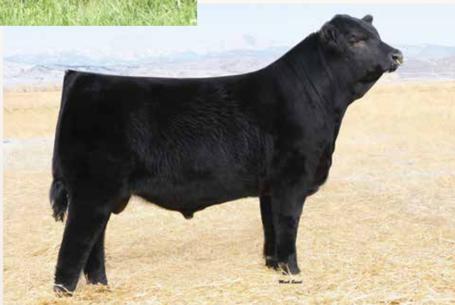
AHCC WESTWIND W544 • GRANDSIRE OF LOTS 11-15