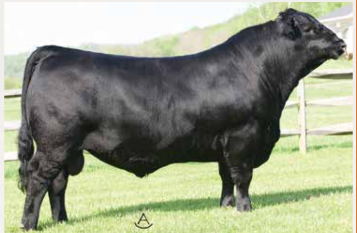
TMCK CASH FLOW 247C • Sire of Lot 1C

WULFS ZANE X238Z----- WULFS XCLUSIVE 2458X TMCK CASH FLOW 247C WULFS MYRENE 2332M TMCK JADE 935Y----- AHCC WESTWIND W544 EXLR JADE 309R COLE 132T----- LESF ASPHALT 9N COLE BEAUTY 276Z CARROUSELS HAPPY GIRL COLE MISS KATYMAY 9105W----- HC FINAL TIME 407 COLE 50K