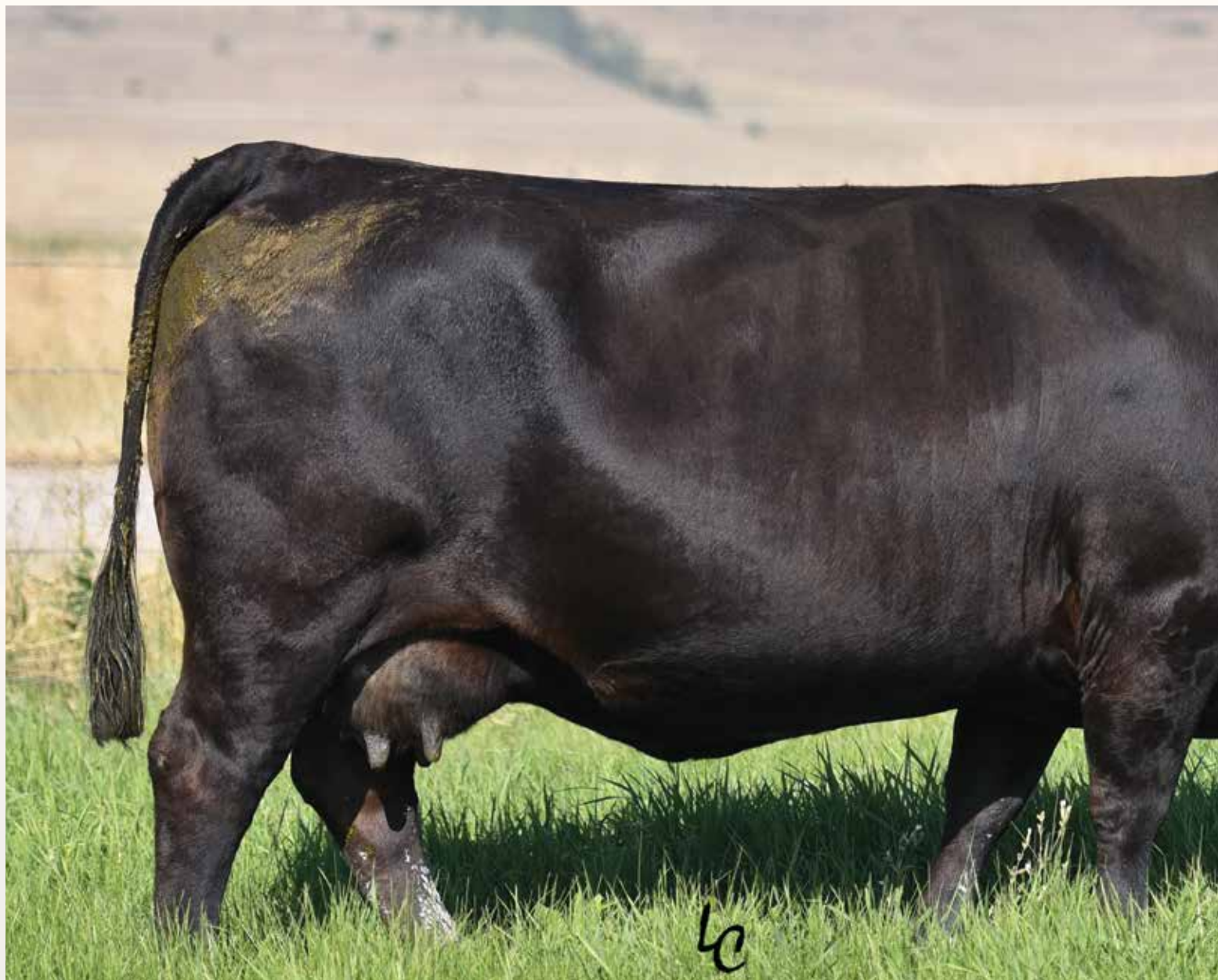
COLE MISS TRAVELER 029X • Dam of Lots 2A, 2B & 2C