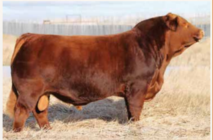
HUNT CREDENTIALS 37C ET • Sire of Lot 1B