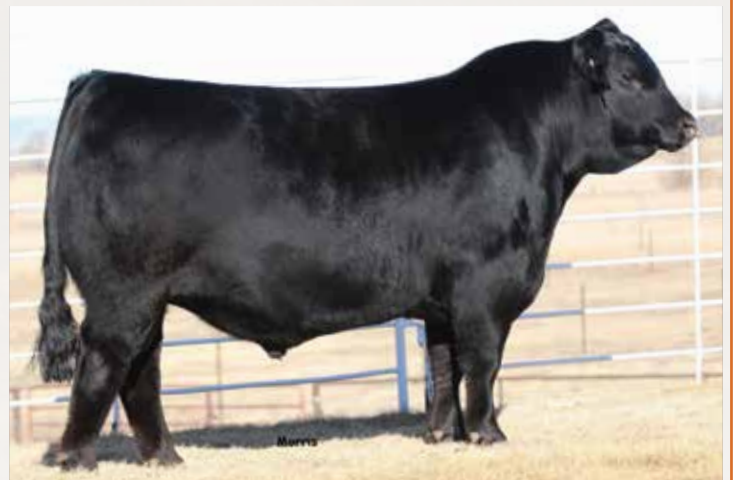
MAGS CABLE • Sire of Lot 2C