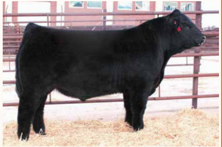
COLE ARCHITECT 08A • Sire of Lot 2A