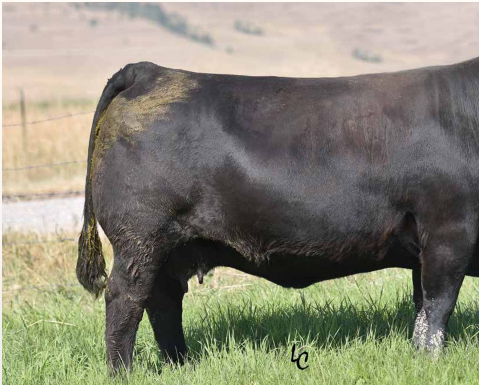
COLE BEAUTY 276Z • Dam of Lots 1A, 1B & 1C