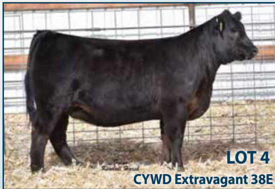
LOT 4 CYWD Extravagant 38E

4/20/17 • LF 50% • DP/DB • Open CYWD Continental Divide 4C x CYWD Undercover 33U BW: 75 • Adj. WW: 763 CD: 12 BW: 0.1 WW: 74 YW: 103 MK: 21 CM: 5 SC: 1.1 DC: 15 YG: -.05 CW: 32 RE: .53 MB: .14 $MI: 58