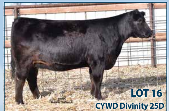
LOT 16 CYWD Divinity 25D

3/8/16 • PC 77% • DP/DB • Bred TMCK Architect 031A x CYWD Azalea 29A BW: 78 • Adj. WW: 649 CD: 8 BW: -0.1 WW: 67 YW: 90 MK: 25 CM: 5 SC: 0.8 DC: 12 YG: -.10 CW: 19 RE: .36 MB: .07 $MI: 53