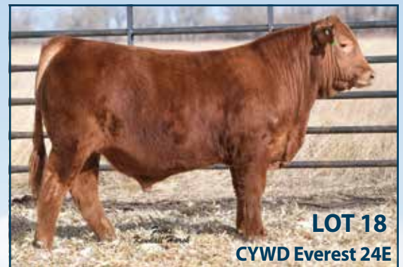
LOT 18 CYWD Everest 24E

3/8/16 • PC 77% • DP/DB • Bred TMCK Architect 031A x CYWD Azalea 29A BW: 78 • Adj. WW: 649 CD: 8 BW: -0.1 WW: 67 YW: 90 MK: 25 CM: 5 SC: 0.8 DC: 12 YG: -.10 CW: 19 RE: .36 MB: .07 $MI: 53