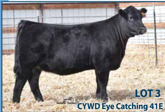
LOT 3 CYWD Eye Catching 41E

4/20/17 • LF 50% • DP/DB • Open CYWD Continental Divide 4C x CYWD Undercover 33U BW: 75 • Adj. WW: 763 CD: 12 BW: 0.1 WW: 74 YW: 103 MK: 21 CM: 5 SC: 1.1 DC: 15 YG: -.05 CW: 32 RE: .53 MB: .14 $MI: 58