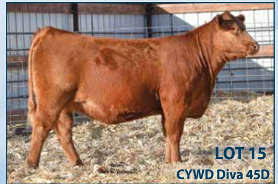
LOT 15 CYWD Diva 45D

2/25/17 • LF 65% • DP/DB • Open TMCK Architect 031A x CYWD Xoxox 12X BW: 80 • Adj. WW: 696 CD: 7 BW: 1.1 WW: 74 YW: 108 MK: 22 CM: 4 SC: 0.8 DC: 13 YG: -.29 CW: 35 RE: .84 MB: -.14 $MI: 50