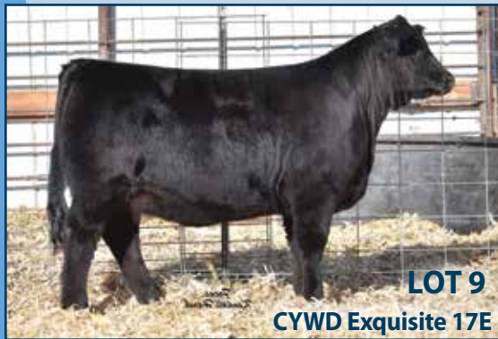
LOT 9 CYWD Exquisite 17E

3/24/17 • LF 65% • DP/DB • Open TMCK Architect 031A x CYWD Xeres 29X BW: 74 • Adj. WW: 687 CD: 10 BW: -0.6 WW: 70 YW: 103 MK: 21 CM: 6 SC: 0.9 DC: 11 YG: -.10 CW: 31 RE: .33 MB: .02 $MI: 53