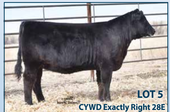
LOT 5 CYWD Exactly Right 28E

4/10/17 • LF 59% • HP/B • Open CYWD Continental Divide 4C x CYWD Zaida 17Z BW: 80 • Adj. WW: 715 CD: 10 BW: 0.8 WW: 62 YW: 92 MK: 27 CM: 5 SC: 0.7 DC: 7 YG: -.18 CW: 26 RE: .72 MB: .00 $MI: 50