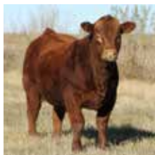
Lot 3 - Front angle

The cattlemen's kind right here! Invictus 21J is a powerful herdbull with his presence and raw power. He is long bodied, bold ribbed, stout hipped and good haired.