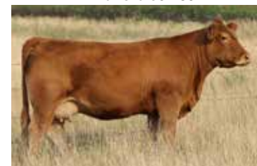
Dam of B Bar Stetson 35H