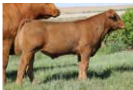
Lot 5 - 4.75 months

Gladiator 7J has been appreciated for his balance and completeness. He is level topped, stout hiped with a masculine herdbull front end. He carries one of the more moderate birthweights and a balanced set of EPDs.