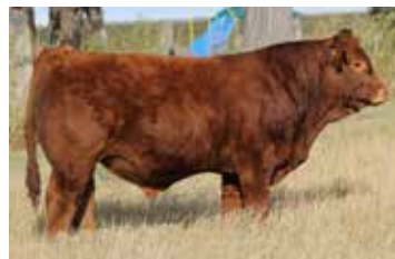
Maternal Sib to Embryos