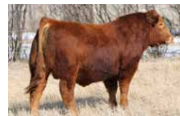
B Bar Warhawk 11G