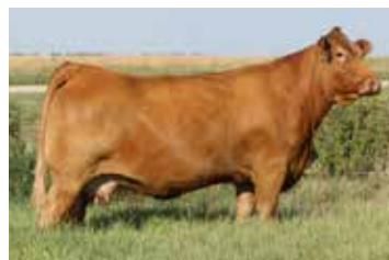
B Bar Foxtrot 21B