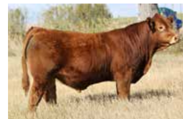
B Bar Stetson 35H