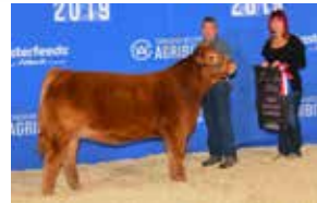
RPY Paynes Gypsy 76G ET - $11,750 daughter to Circle T Limousin, SK & CWA Jr. Hfr. Calf Champion

WULFS WALCOTT F711W Sire: LFLC ACE 750A LFLC YO GO 750Y