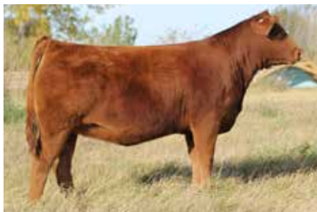
Flushmate - UZX 10J sells on choice at CWA