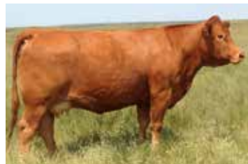
Dam of B Bar Nicole 9E