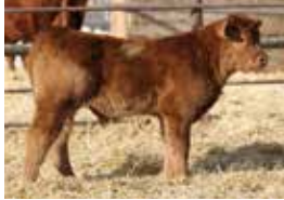
Lot 7 - 1 month

Lots of style and presence in this deep ribbed and square hipped bull. Fugitive 8J gets out and moves freely on a strong foot, has an easy going nature and is good haired.