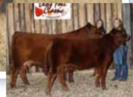
Maternal Granddam & Great Granddam