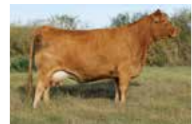
Dam of Lots 21 & 22

The donor dam extends back to our Foxtrot cow family and has been a strong producer for us which landed her in our donor program. She's explosive in her rib shape, elegant in her design, with a sound udder and moves freely on a strong foot. Full brother was a highlight in our 1st Annual Sale to Haystack Acres, ON which went on to be Reserve Senior Bull at the 50th National Show and is now working at Andrew Ranches, AB.