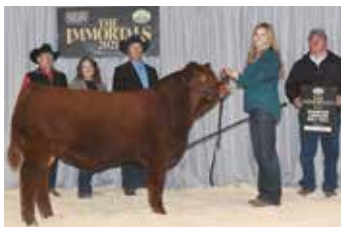
Lot 13 - Immortals Breed Champion

Recommended for Heifers. B-Bar Empire 4j is tremendous herd bull in the making and deserves some serious attention! He has a proud powerful herd bull front end, a smooth shoulder that blends into his fore rib, and continues on into a stout hip. He moves with ease and flexibility and stands on a strong foot. To add to the package he has an easy going nature, great scrotal development and that deep cherry red color. Numerically he is well balanced both in actual numbers and projected numbers. Empire's 2 year old dam is moderate framed, long bodied, level topped, bold sprung with a sound udder. She is a natural daughter off our donor 118W who is most noted for naturally producing the $30,000 B-Bar Slate 17C and $32,000 B-Bar Bentley 8D. The Nicole cow family is known for producing some influential herd sires within the breed and we feel Empire 4j is going to follow suit!