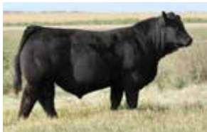
B Bar Phantom 67G - $11,000 son to Wulf Cattle, MN