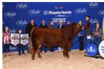
Maternal Sib to Embryos