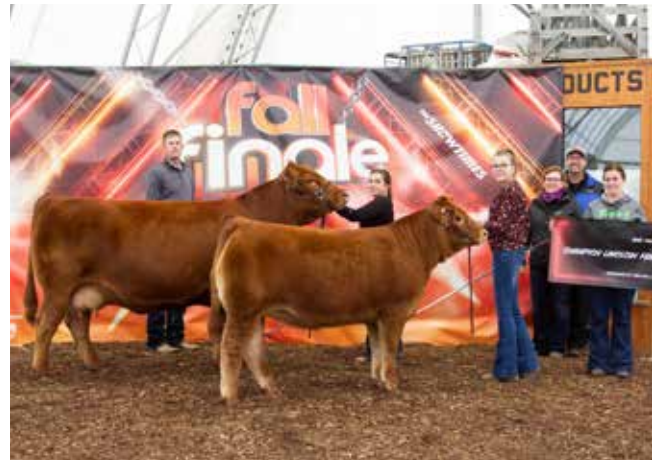
Dam as a 3 year old. Champion Limousin Female at Fall Finale