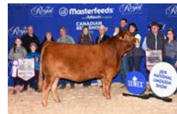
Maternal Sib to Embryos