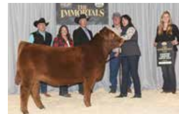
Paternal Sib to Embryos