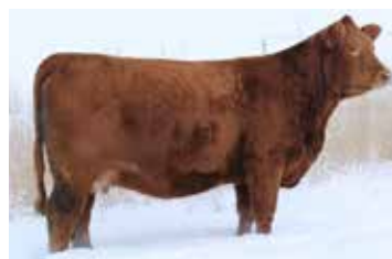
B Bar Nicole 9E