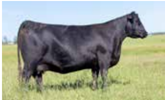
Full Sister to Maternal Granddam

*AI Bred to B-Bar Stetson 35H Due January 3, 2022 (Vet's opinion safe)