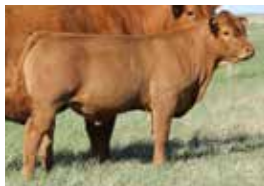
Lot 4 - 4.5 months

Notorious 1J is moderate framed and chock full of meat and muscle. He is good haired and has an easy going nature. He has a moderate birthweight, short gestation and balanced set of EPDs