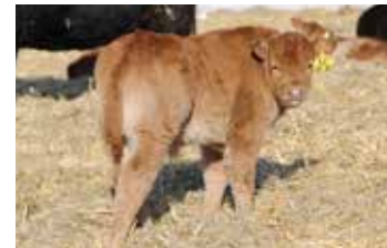
Lot 20 - 1 month