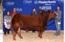
Full Brother to Lots 21 & 22