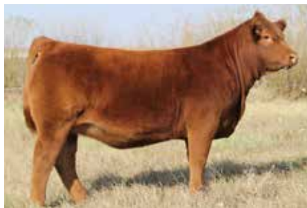
Flushmate - UZX 16J sells on choice at CWA