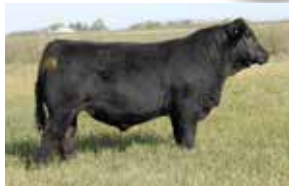
B Bar VLE Conquer 206F ET - $11,250 son to Stoll Limousin, WY