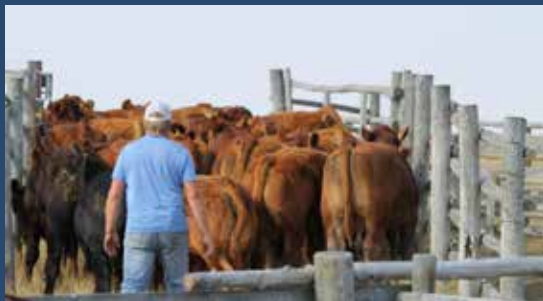
Processing bull calves on pasture