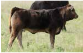
Dam as a calf