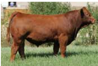
Lot 13 - 8 months