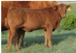
Lot 8- 4.75 months

Samurai 17J is a real beef bull, ripped with muscle and thickness complete with volume, extra length and massive dimension. He ranked 1st out of 11 at weaning and indexed 113 and has continued on being the heavyweight of the bull pen.