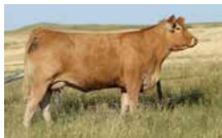
Full Sister to Dam

* AI Bred to B-Bar Bentley 8D Due January 4, 2022 (Vet's opinion safe)