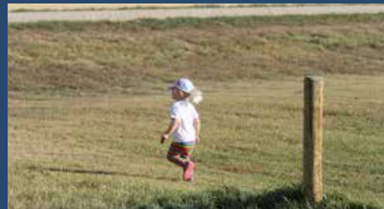
Roz helping picture