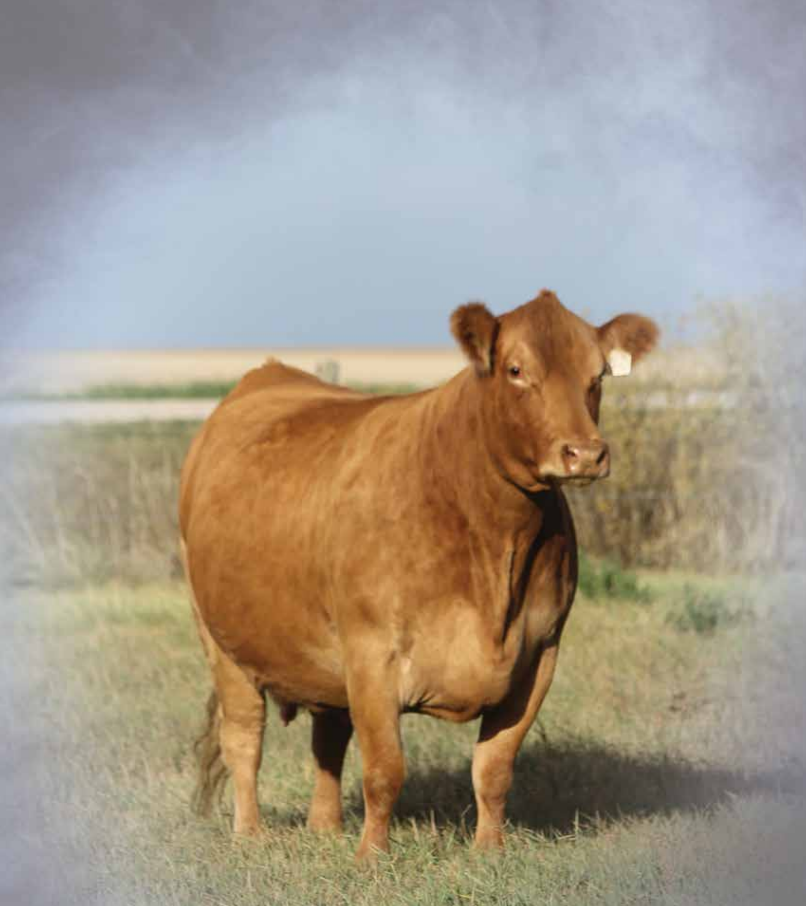
B Bar Foxtrot 52B Dam of Lot 21 & 22 Grandam of Lot 33