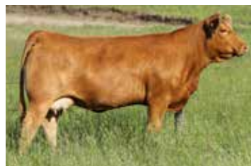
Maternal Sib to Embryos