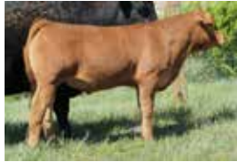
Lot 1 - 4.5 months

A powerful, complete, well balanced herd sire in the making. Matrix 13J has always been admired for his herd bull demeanour and structural integrity. He is long made, level topped, deep ribbed and carries plenty of muscle shape.