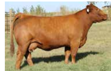
Dam of B Bar Warhawk 11G