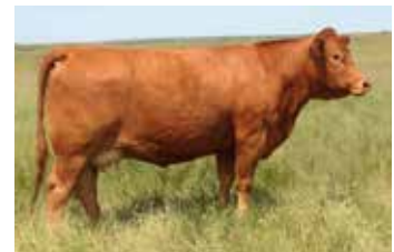
Maternal Great Granddam