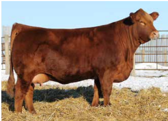
Dam as a 2 year old