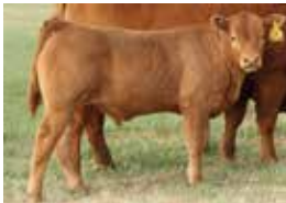
Lot 2 - 4.5 months

Sniper 19J has always had a ton of presence about him. He has been appreciated for his head and extended front end that blends into his shoulder and moves into a bold rib and stout hip. He carries the lightest birthweight and a nice set of calving ease EPDs that could potentially make him heifer friendly.