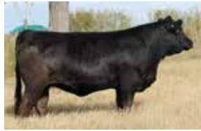
Maternal Sister to Dam