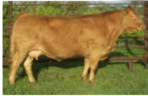
Maternal Great Granddam