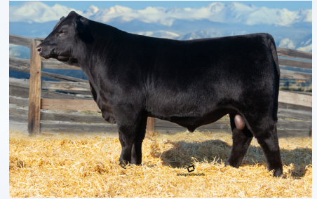
SPRING CREEKS ACCLAIM 7049 Sire of Lot 20