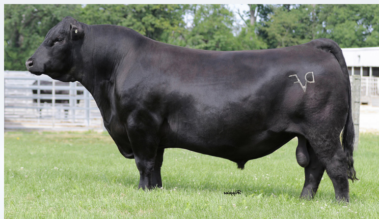
DEER VALLEY GROWTH FUND Sire of Lot 32 & 33