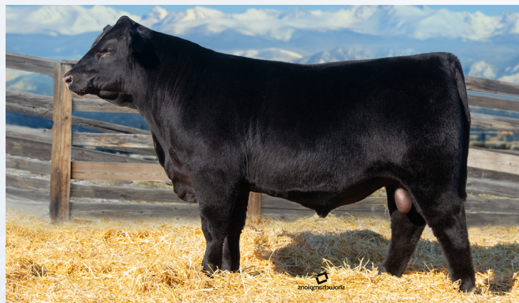
SPRING CREEKS ACCLAIM 7049 Sire of Lot 29