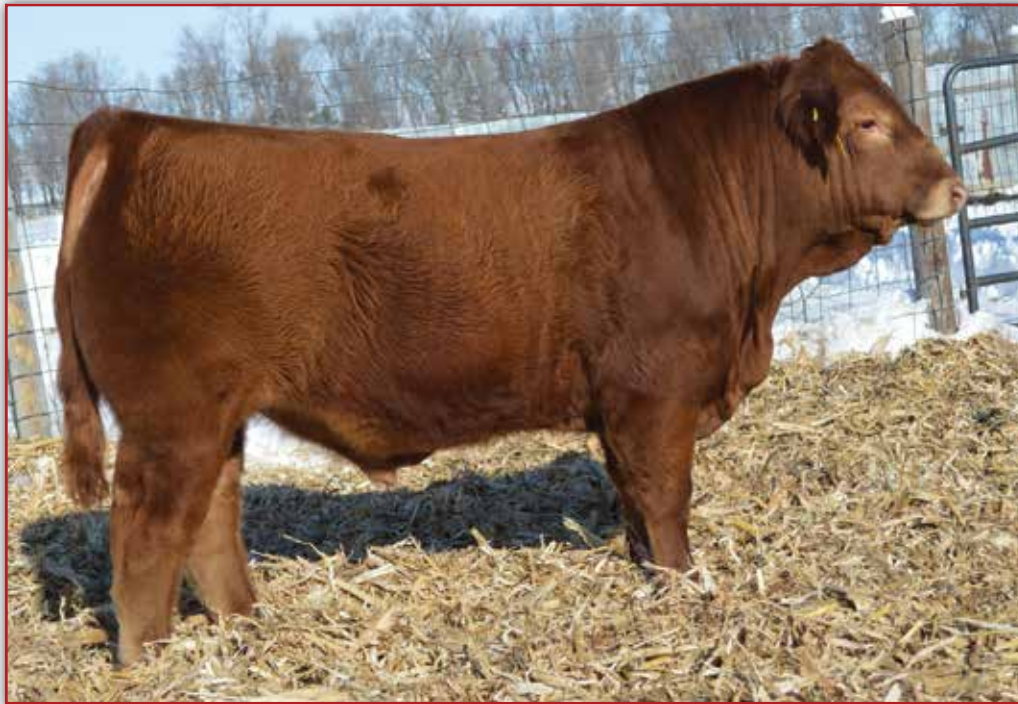
ROMN CADILLAC JACK 101C • SIRE OF LOTS 21 & 22

If you are looking for an aged bull capable of covering more cows per breeding season, this group of 2-year-old bulls fit the bill. These bulls are stout, athletic and ready to go to work. These herd sires have not been picked over and were held over with the sole purpose of providing our customers bulls with added breeding capacity. Buy with confidence.