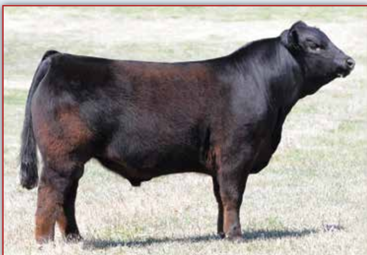
LFLC CHECKING ACCOUNT 701C • SIRE OF LOT 39

Calving-ease alert! SYES Juggler 547J will ensure you get a good night's rest during calving season with his top 4% birth weight EPD of -2.2. This homozygous polled, red bull should also pass along his quiet disposition.