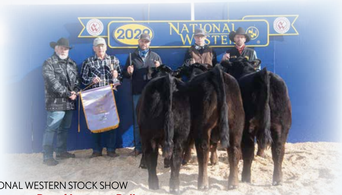
2022 NATIONAL WESTERN STOCK SHOW Reserve Champion Pen of Limousin Bulls

Kicking off our 42nd sale is the lead-off bull from our reserve champion pen of Limousin bulls at the 2022 National Western Stock Show. SYES Jump Start 317J is chock-full of muscle, style and overall balance. This purebred is loaded with all the convenience traits cattlemen demand. Backed by generations of predictability and leading genetics, Jump Start is just the bull to rev up your program. Calving-ease with growth is the perfect combination to sleep at night and put money in your pocket coming weaning time. Lots to admire in this double homozygous SYES Easy Going son who weighed in at an impressive 787 pounds at weaning! Jump Start was a favorite of every one who stopped by our pen. You'll definitely want to have him circled in your catalog.