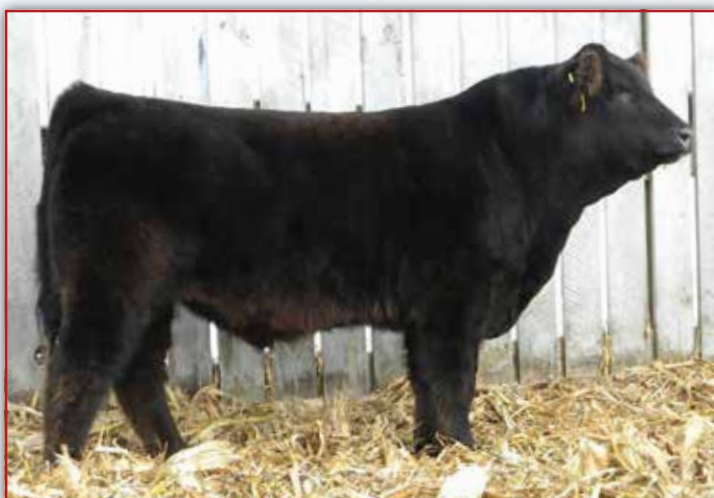
SYES GRAND SLAM 104G

THURSDAY, FEBRUARY 24, 2022 • 1 PM • AT THE FARM • AMHERST, SD