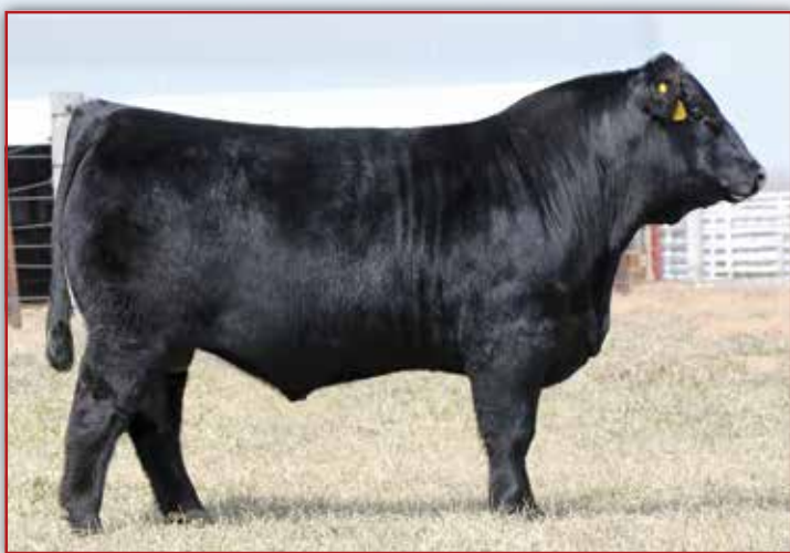
CELL ENVISION 7023E • SIRE OF LOTS 15 & 18

SYES Joash 246J is a rugged purebred with tons of middle. This homozygous polled son of LFLC Checking Account has a light birth weight with plenty of milk and positive carcass traits. We expect a lot from our cows, insisting they are productive out of the gate. His dam has done her part with her first calf.