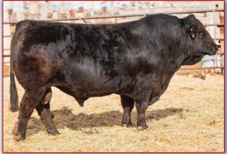
SYES EASY GOING 77E • SIRE OF LOTS 49 & 54

If you're looking for uniformity, then you'll want to check out this son of SYES Easy Going. High growth and high carcass balance out this deep ribbed bull.