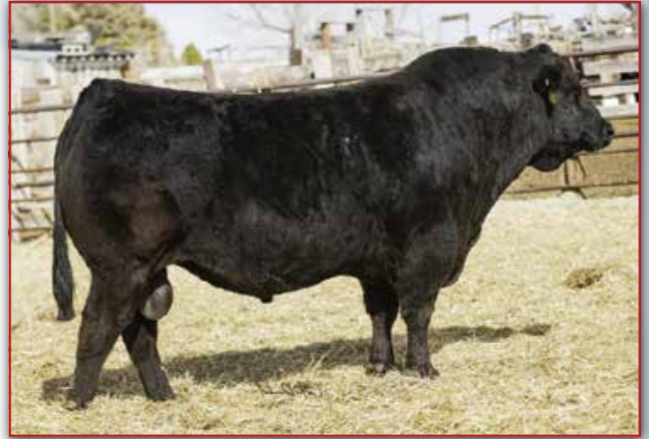
SYES ENCORE 315E • SIRE OF LOT 82

That great combination of double-digit CED and a minus BW EPD equals calving-ease for your convenience. Combine that with added growth and a top 1% YG EPD and you have a bull with versatility. He's homozygous black to boot.