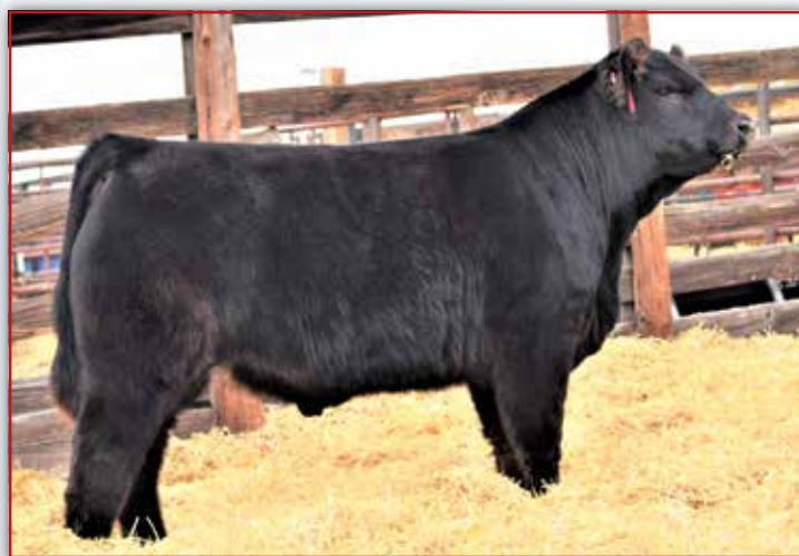
LFLC EMPIRE 903E • SIRE OF LOT 27

The Empire sons are loaded with calving-ease, added milk and docility. SYES Hadley 825H does that line proud and hails from a top-producing Work Time daughter.