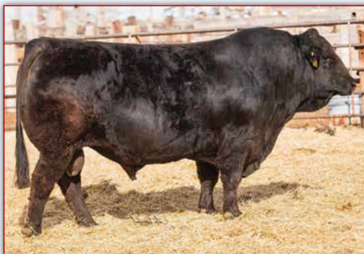
SYES EASY GOING 77E