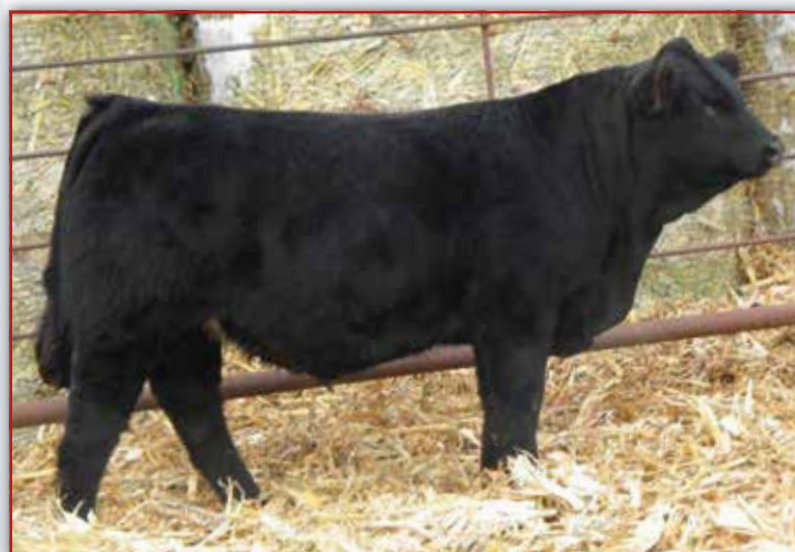
SYES DOUBLE AGENT 175D