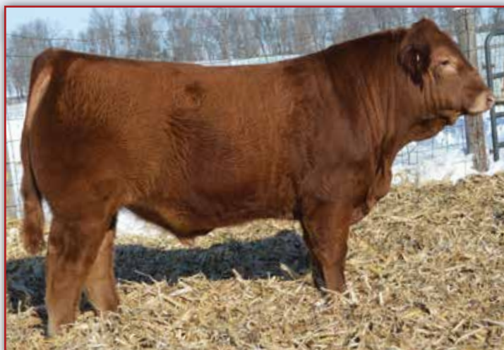
ROMN CADILLAC JACK 101C