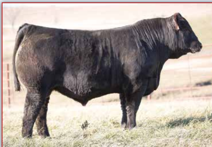
CELL ENVISION 7023E