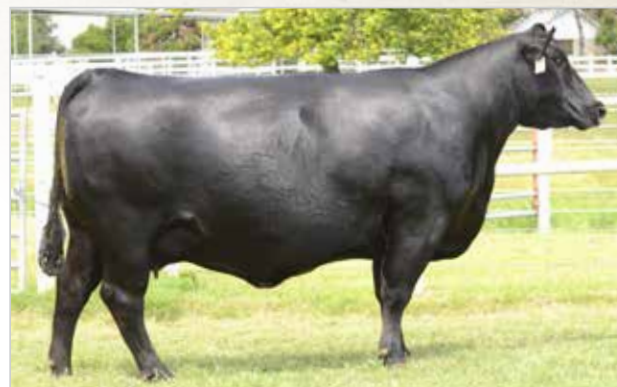
Dam of Lots 1-2, 4, 6-9, 10-13 - EXAR Miss Beauty 2819