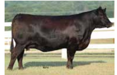
HBRL BOOTYLICIOUS 486B Dam of Lot 57