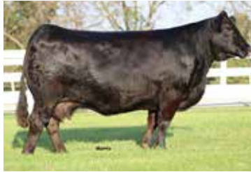
AUTO EXCEPTIONAL 282S Maternal Granddam to Lot 52