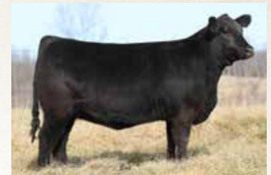
BRCC JELLY ROLL 1534J Maternal Sister to Lot 55