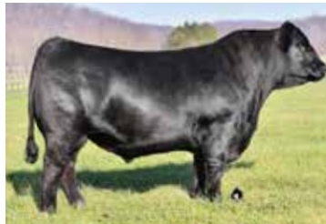
COLE GENESIS 86G Sire of Lot 58