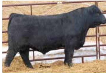
AHCC DAKOTA THUNDER 363D Sire of Lot 55