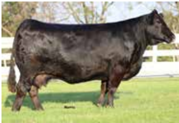
AUTO EXCEPTIONAL 282S Maternal Granddam to Lot 53