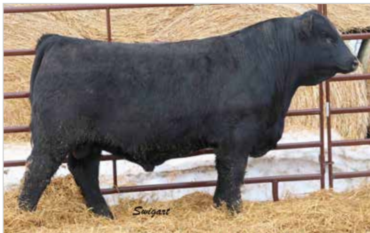
Sire of Lot 30 - AHCC Dakota Thunder 363D

BRCC Jetsetter 1520J is a special individual that rises to the top of the Lim-Flex bull offering. He has herd sire written all over him.