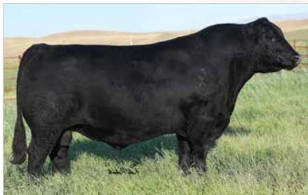
Reference Sire - EXAR Monumental 6056B