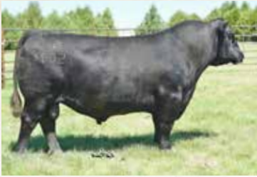
BALDRIDGE GUARDIAN Sire of Lot 51