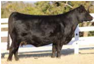
HBRL FLAMBOYANT 8521F Dam of Lot 54