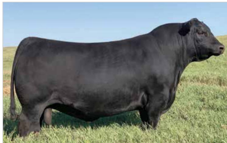
Sire of Lots 31-32 - S A V America 8018

Just like his brother, Lot 31, he is the last of our 282S sons that have been so popular at BRCC. His dam, 282S, is responsible for building the Buck Ridge Lim-Flex cowherd. It is bittersweet for us to see these last 2 sons sell. 1571 is wide-topped and stout made. His length of body is impressive and will add additional pounds at weaning. He boasts an 81 for weaning weight and a 126 for yearling weight. If you're searching for a bull that will improve growth and carcass merit look no further.