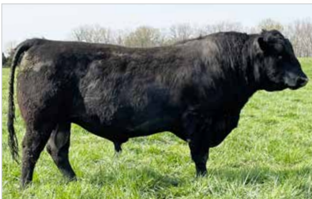
Reference Sire - BRCC Foreman 8512