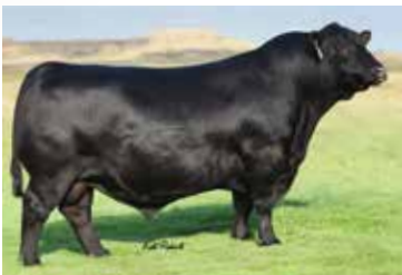
V A R POWER PLAY 7018 Sire of Lot 53

Selling as one lot EPDs available sale day