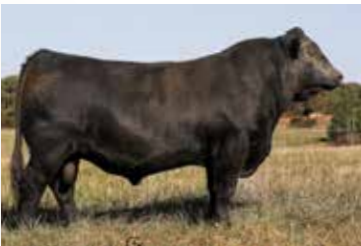
HBRL FOUNDATION 8507F Sire of Lot 54