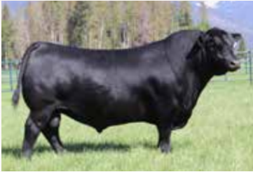
S A V DIMENSION 7092 Sire of Lot 52