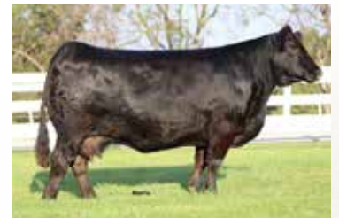
AUTO EXCEPTIONAL 282S Maternal Granddam to Lot 58