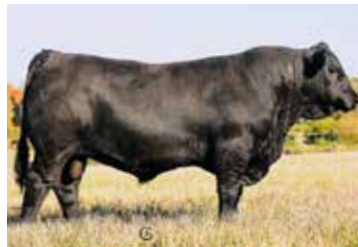
HBRL GATEWAY 9511G Sire of Lot 57