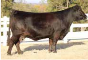
HBRL COVERIGRL 563C ET Dam of Lot 51