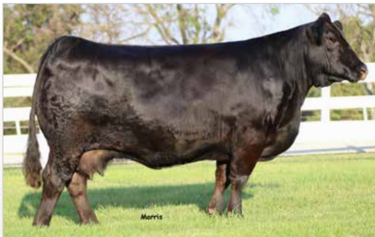
Dam of Lots 31-32 - Auto Exceptional 282S