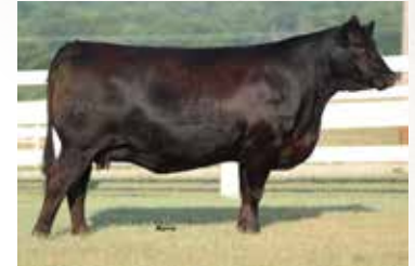
HBRL BOOTYLICIOUS 486B Dam of Lot 56