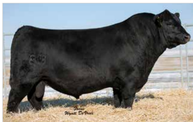
Sire of Lots 1-2 - BUBS Southern Charm AA31