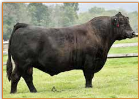
CJS� CREED 5042C