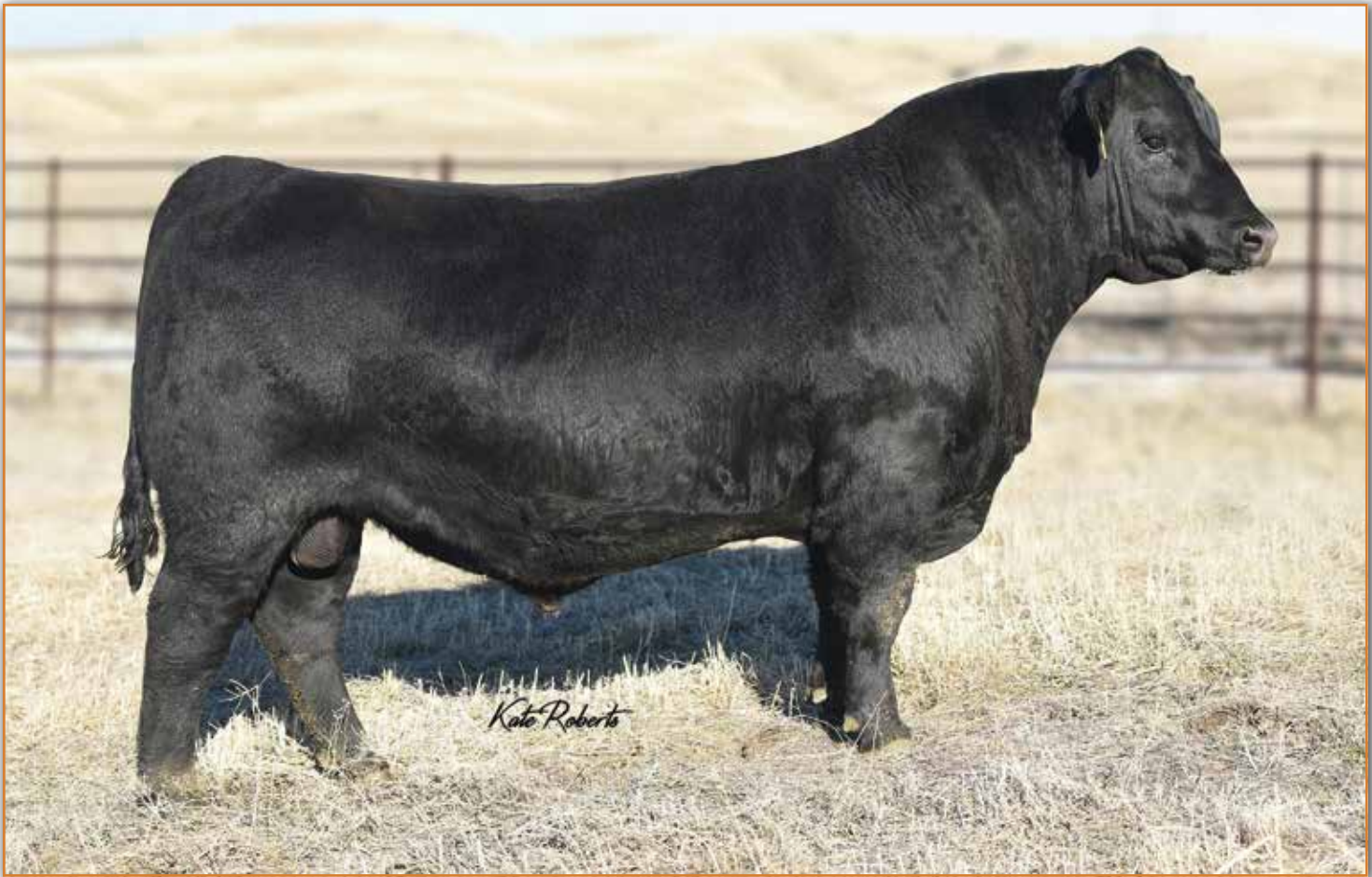
POSS ACHIEVEMENT • SIRE OF LOT 24