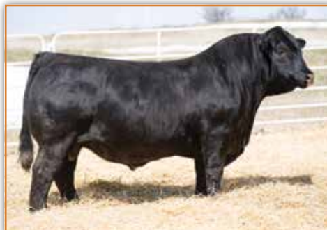
CJS� DATA BANK 6124D ET