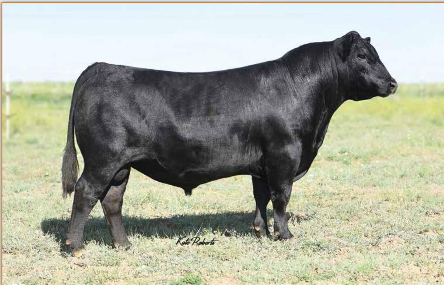
4M ACE 709 • SIRE OF LOT 15