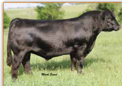
YARDLEY HIGH REGARD W242