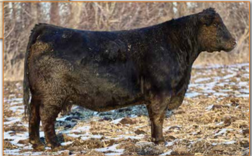
WULFS ABLAZE • DAM OF LOT 12