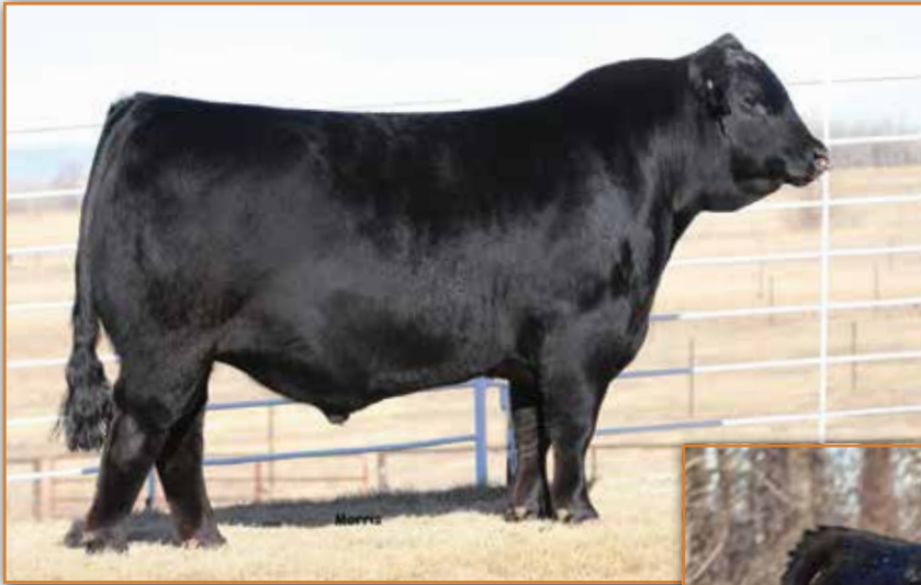
MAGS CABLE • SIRE OF LOT 12