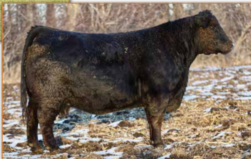
WULFS ABLAZE 3012A • DAM OF LOT 26