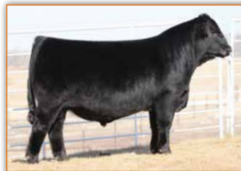
MAGS FIRESTONE 218F