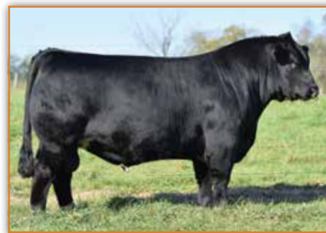
CJS� DAUNTLESS 6257D ET