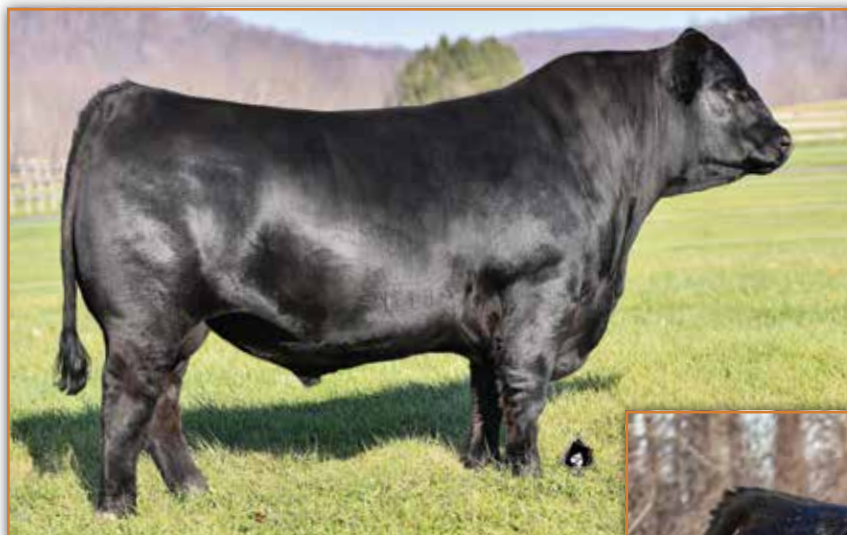
COLE GENESIS 96G • SIRE OF LOT 26