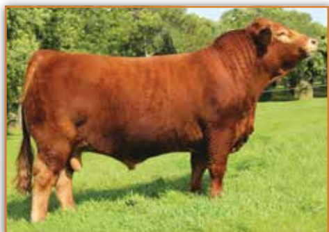
WULFS FIFTY T804F