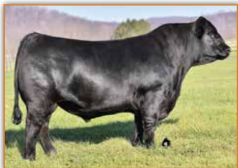
COLE GENESIS 86G