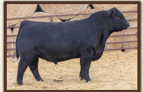
MAGS FEDERAL RESERVE