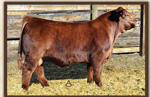
WULFS EDGE 5045E