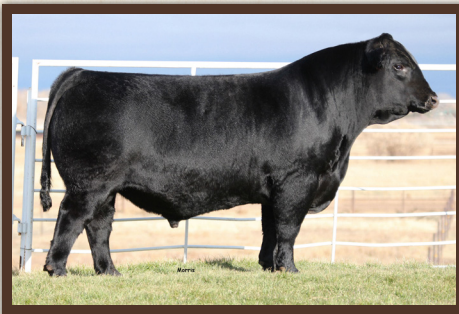
AHCC EARNING POWER 900E ET