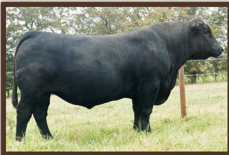
AHCC EASY RIDER 5594E