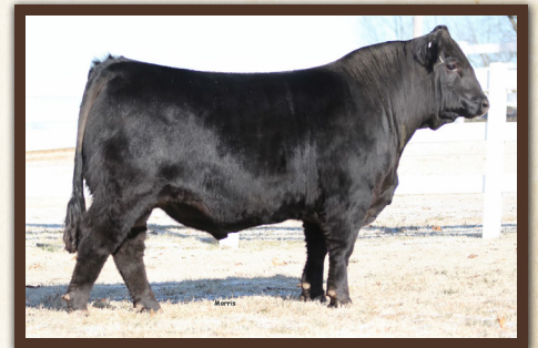
TNGC EMPIRE 736E