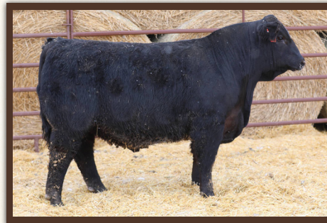
AHCC HIGH STAKES 376H