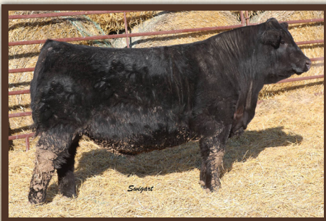
AHCC LEGENDARY 266G