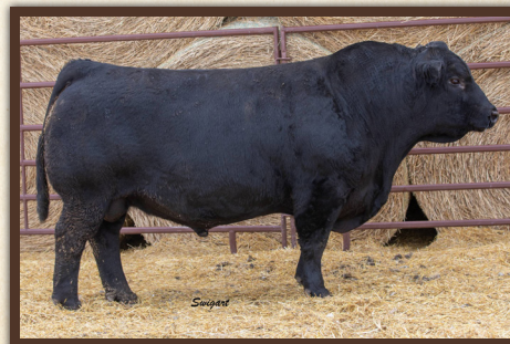
AHCC DAKOTA GROWN 408D