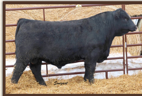
AHCC DAKOTA THUNDER 363D