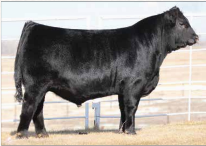
MAGS FEDERAL RESERVE • Paternal grandsire of Lot 5