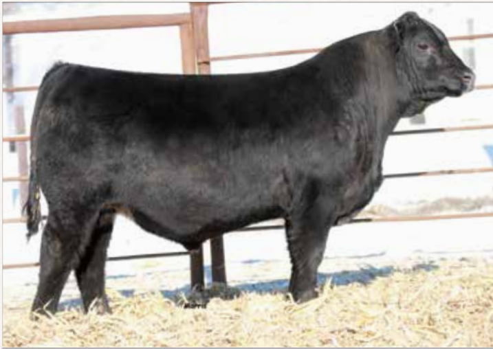
LVLS FULL DUTY 2201F • Sire of Lot 28