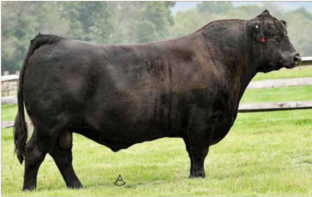
CJSL CREED 5042C • Sire of Lot 16