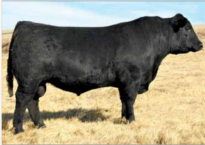
TMCK ALFALFA 35X • Paternal grandsire of Lot 29

Study this attractive made herd sire prospect that combines rib and muscle to the highest degree. To the eye, CELL Kareem 2041K is long-backed, big-bodied, muscular and easy fleshing. Numerically he ranks in the 15% or better for 8 economically relevant traits. Given his moderate birth and top growth, you have the complete package.