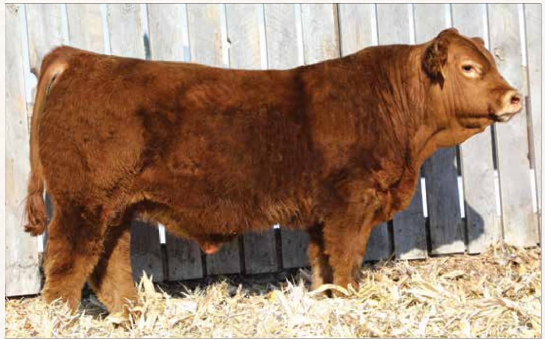
SYES KARAT 80K • Paternal brother to Lot 9