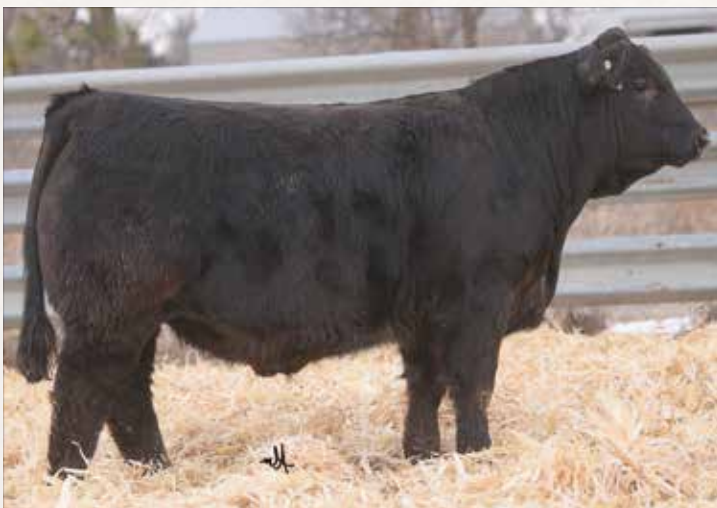
WZRK HEAVY WEIGHT 4063H • Sire of Lot 30

If you are looking for a heifer bull look no further than Lot 29. Numerically, AHCC Alfalfa 848K has a 13 calving-ease direct, a 7 calving-ease maternal and a 0.3 birth weight figure that ranks in the top 35% of the breed. Continue to read and find breed-leading marbling. Double polled, double black and ready to go to work for you.