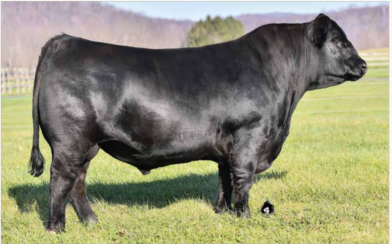
COLE GENESIS 86G • Sire of Lot 7