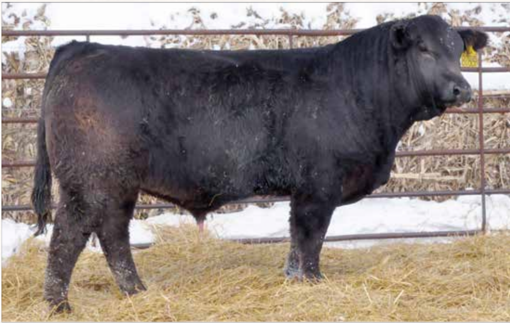
L7 FALCON 8055F • Sire of Lot 8