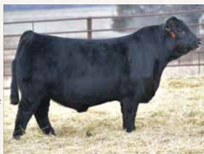
CELL TMCK KINGPIN 2267K Paternal brother to Lot 7 Purchased by Hager Cattle Co. of Karlsruhe, ND, for $14,500.