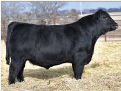
CELL TMCK KICKIN UP DUST 2261K Paternal brother to Lot 7 Purchased by Wieczorek Limousin of Mount Vernon, SD, for $23,500