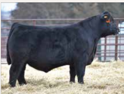
CELL TMCK KNOWN 2265K Paternal brother to Lot 7 Purchased by Middleton Limousin of Bourbon, MO, for $8,000.