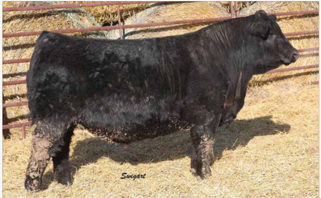
AHCC LEGENDARY 266G • Sire of Lot 17