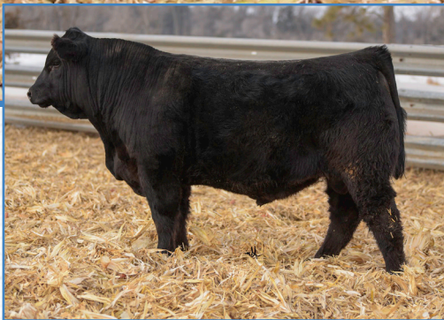
WZRK GHANDI 3018G