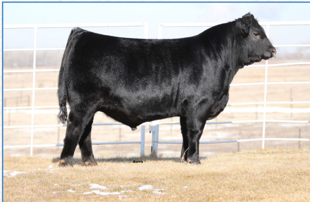
MAGS FEDERAL RESERVE ET