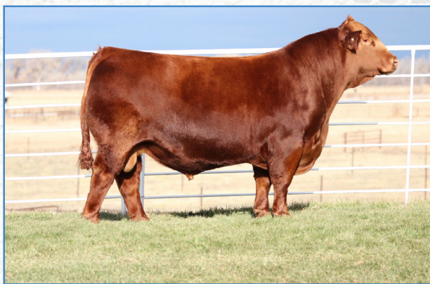
WULFS EMPRIZE 2424E