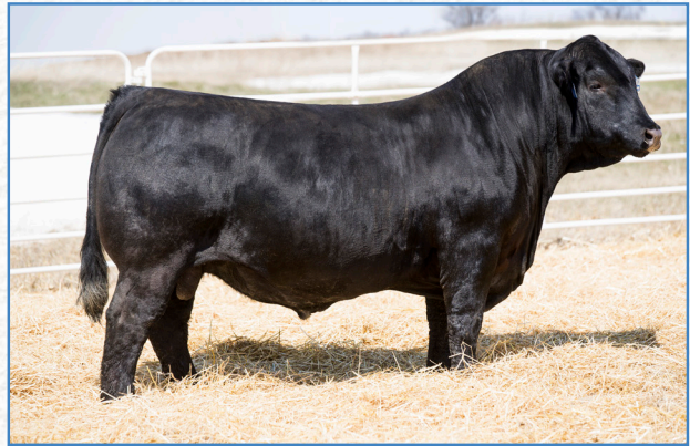
CJSL DATA BANK 6124D ET