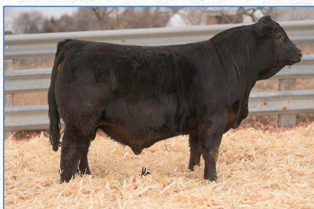
WZRK HARD TO FORGET 1040H