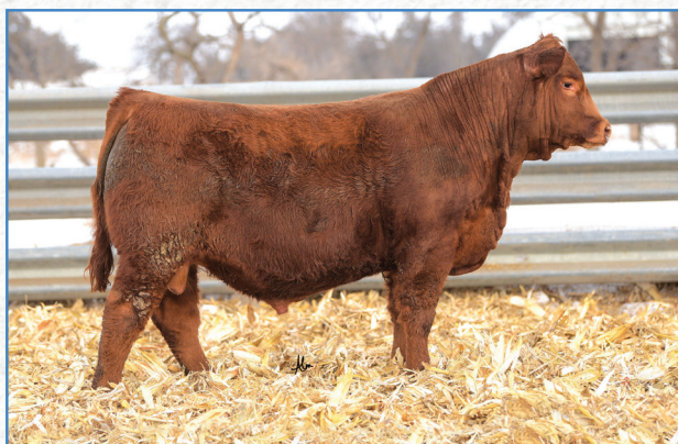
WZRK GAME CHANGER 4015G