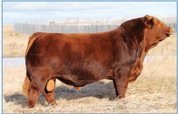
HUNT CREDENTIALS 37C ET