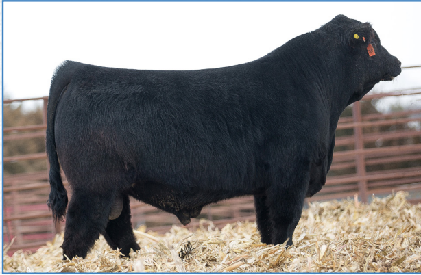
CELL HISTORY BUFF 8245H ET