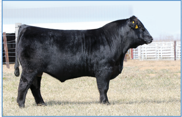
CELL ENVISION 7823E