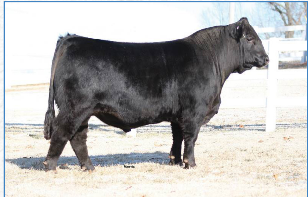
TMGC EMPIRE 736E