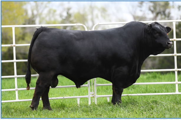
WULFS EISENHOWER 3616E