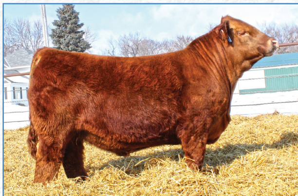
WULFS GALLAGHER 7056G