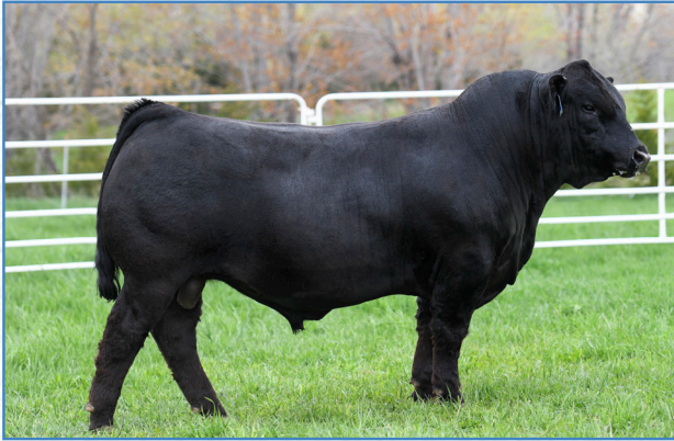
COLE FORTUNE 12F