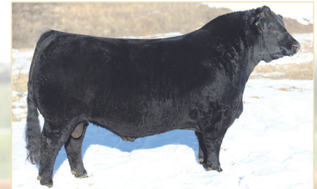
NGDB Structure 34D : Grandsire to 210

Videos of each group selling can be viewed at dorranmarketing.com or DLMS .