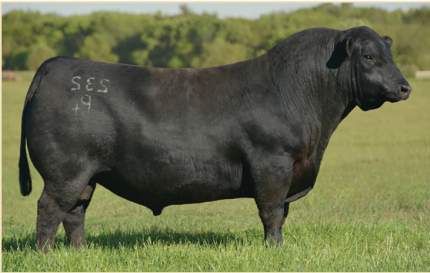
Duff Napoleon 232 : Grandsire to 238, 239, 240, 241, 242, 243, 244, 245

Safe to Anchorage Missouri 1062 or Anchorage Self Made 2060