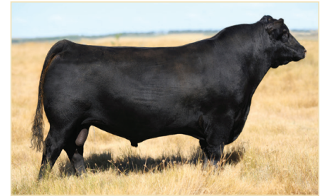
Soo Line Motive 9016 : Grandsire to 208, 209, 211, 214, 206 and 207