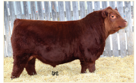
Red Ter-Ron Showdown 9G : Sire to 219 and 220