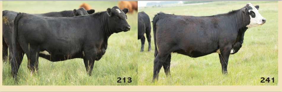
213 • Black Blaze | Sire: LFE BA Lewis 801F (S A V Sensation 5615) { Due Feb. 23 }