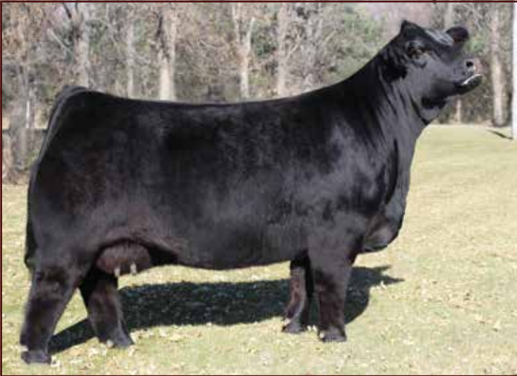
Boss Lake Ms Molly 812F • Full sib to Boss Lake Ms Molly 814F ET