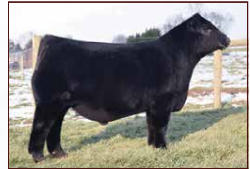
TASF Heineken 405H • Sire of Lot 5B