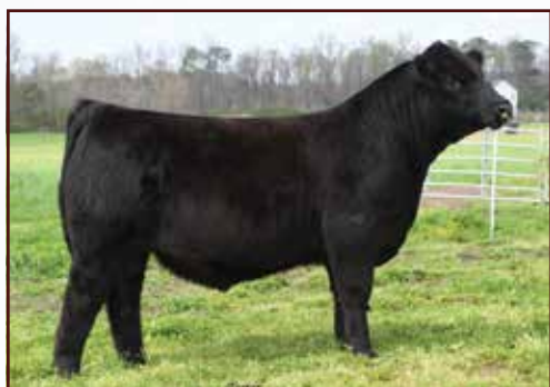
ELCX Gone Fishin 929G ET • Sire of Lot 22

AUTO Poem 273Y • Paternal grandam of Lot 22