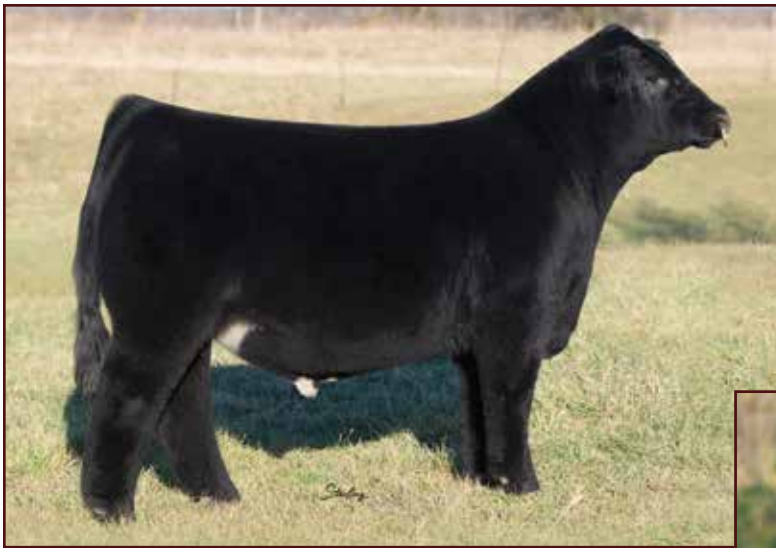
Ratliff Jump Start 340J • Sire of Lot 7