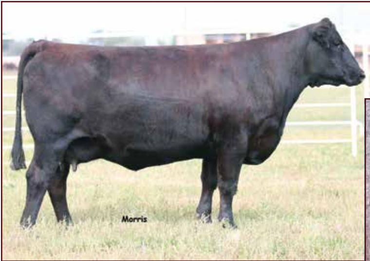
MAGS Zaneeta • Dam of Lot 18