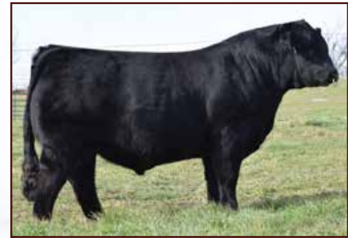
TASF Grey Goose 333G • Sire of Lot 6B