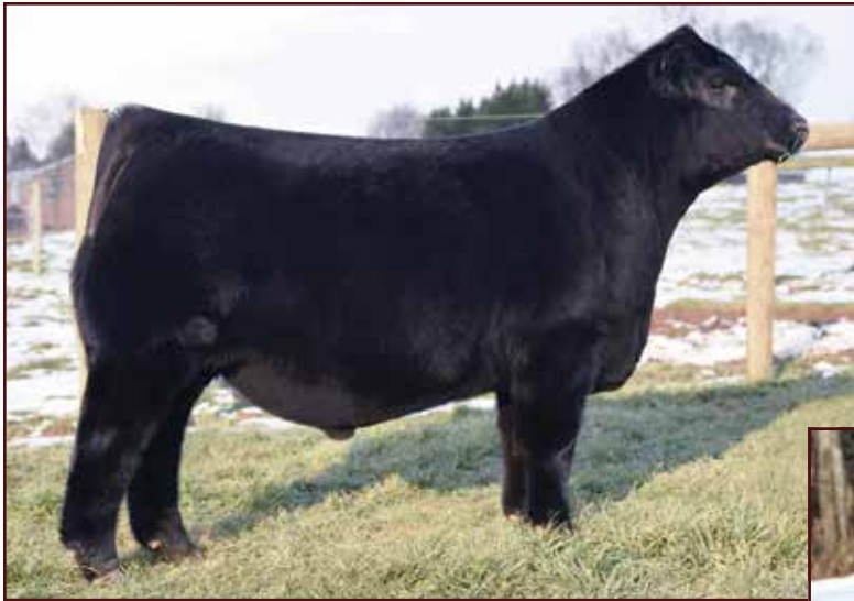
TASF Heineken 405H • Sire of Lot 3