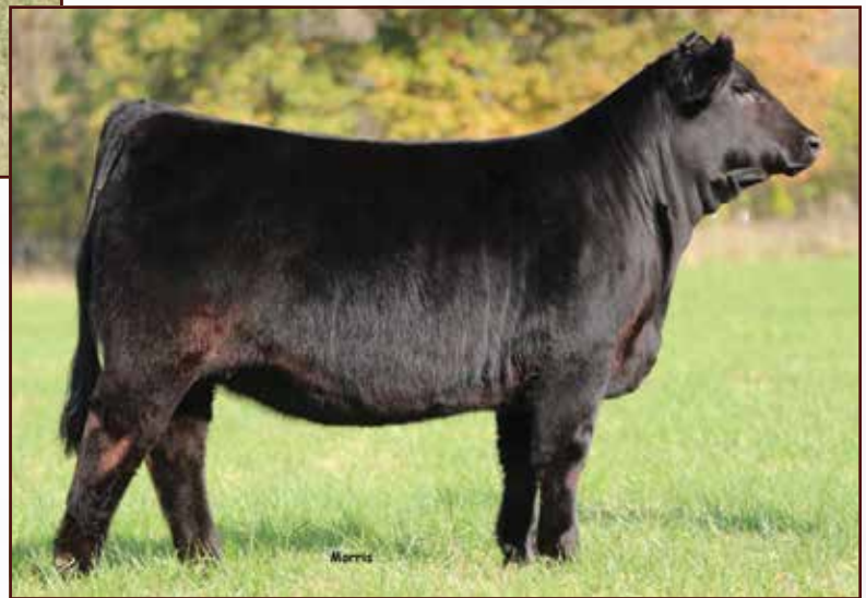
SEEE Eternity • Dam of Lot 7