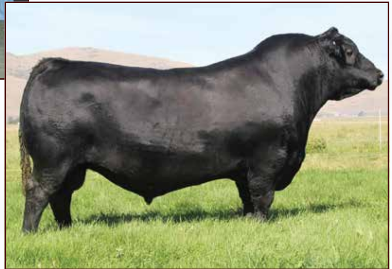
Coleman Bravo 6313 • Paternal grandsire of Lot 8