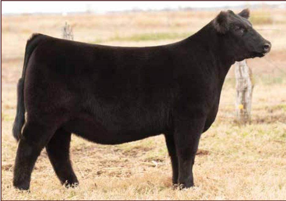
PF Forever Princess 9055 • Dam of Lots 6A & 6B