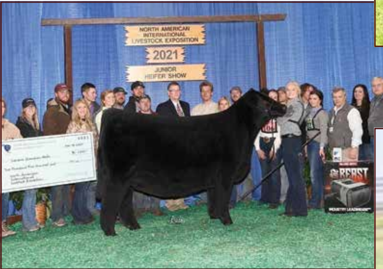
Ratliff Houboutit 008H • Daughter of Riverstone Charmed