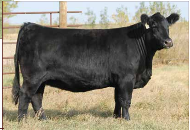
B-Bar Georgina 17H • Dam of Lot 9