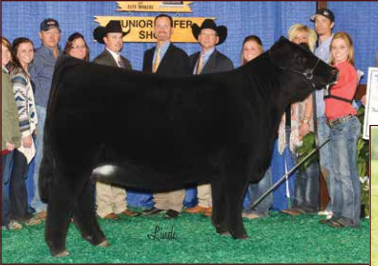
Riverstone Charmed • Daughter of HSF Your Fantasy