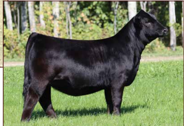
Boss Lake Ms Molly 144J • Full sib to Boss Lake Ms Molly 814F ET