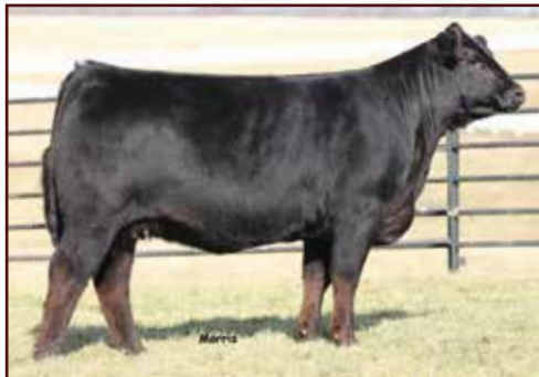
AUTO Lucky III 210B • Dam of Lot 10