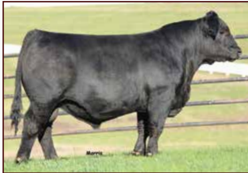
AUTO Power Plus 133B ET • Sire of Lot 10