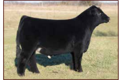
Ratliff Jump Start 340J • Sire of Lot 6A