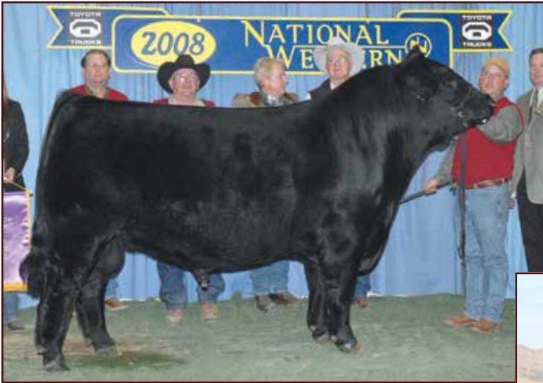
DHVO Deuce 132R • Sire of Lot 8