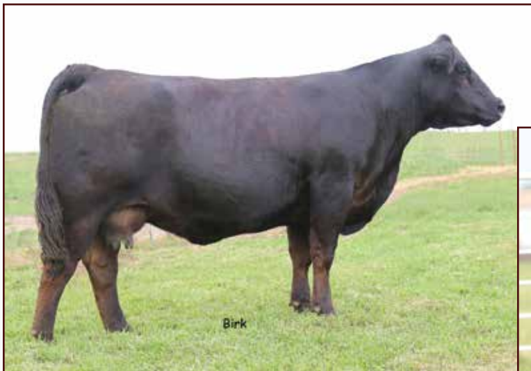
L7 Yuma 122Y • Paternal grandam of Lot 23