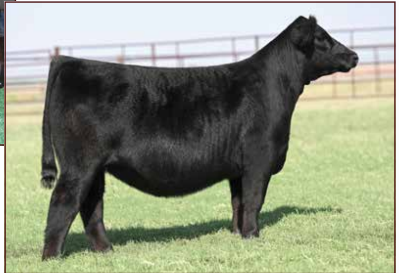
PCC JKSM Fantasy 506K • Daughter of HSF Your Fantasy