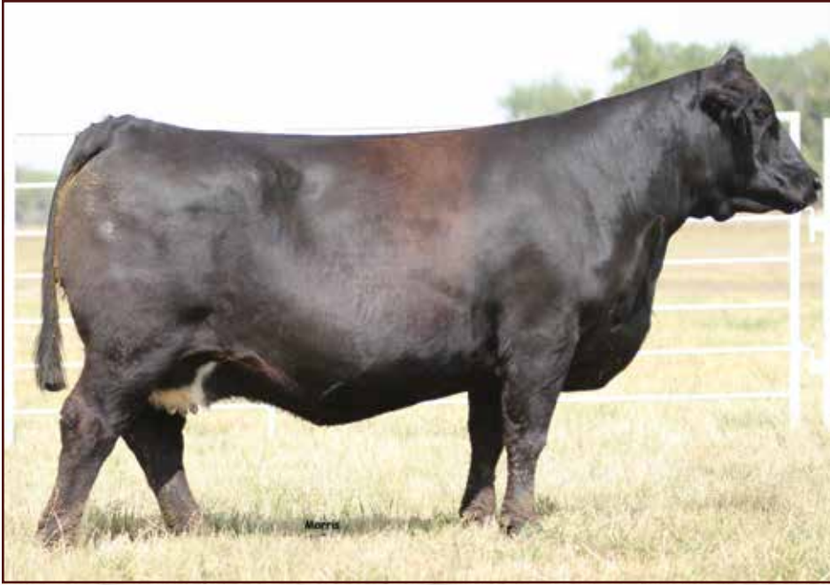
MAGS Constance • Dam of Lots 4A & 4B