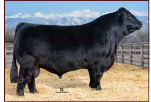
ELCX Kings Landing 599 D • Sire of Lot 4A