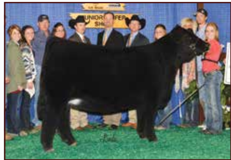
Riverstone Charmed • Paternal grandam of Lot 7