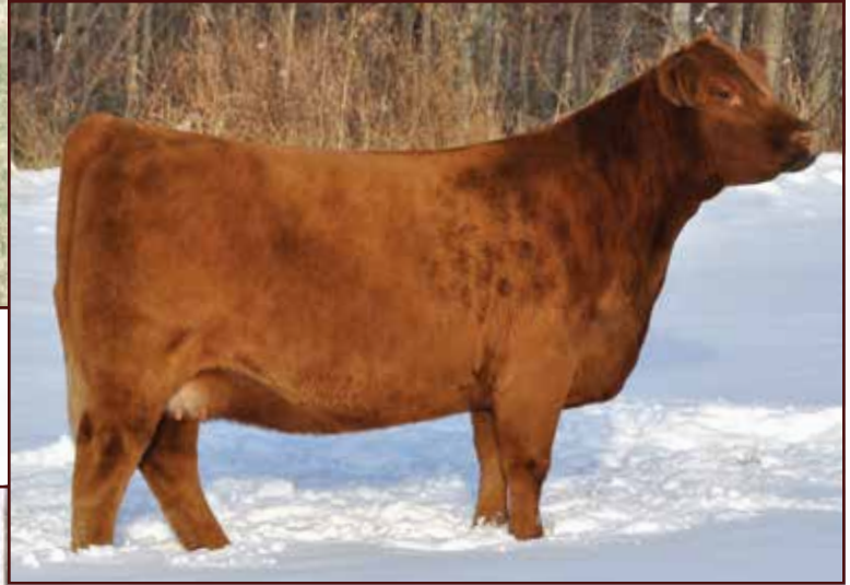
Boss Lake Ms Molly 814F ET • Dam of Lot 1