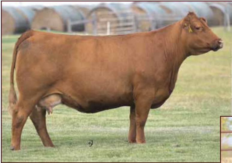
Wulfs Edwinna 7056E • Paternal grandam of Lot 9