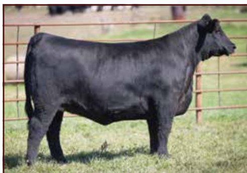
CELL 5092C • Dam of Lot 22