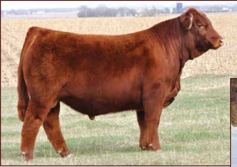
LFLC Bank Account 701B • Sire of Lot 1