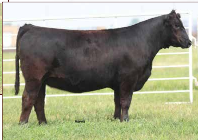
MAGS Ela • Dam of Lot 24