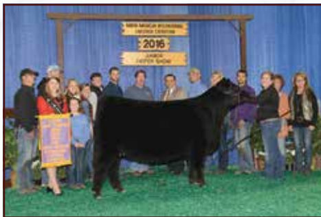
KDJ Queen Ruth 502 • Maternal grandam of Lot 8