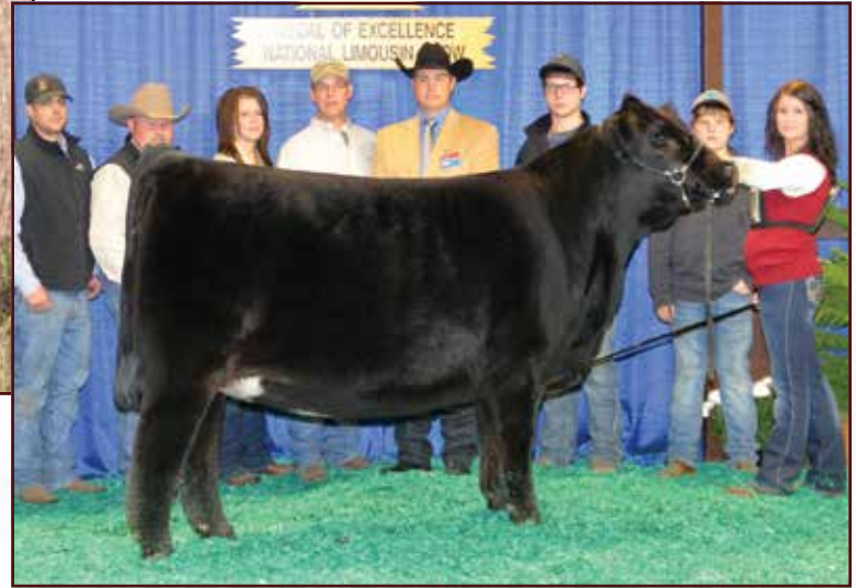
LLJB Absolute Style 3056A • Dam of Lot 12