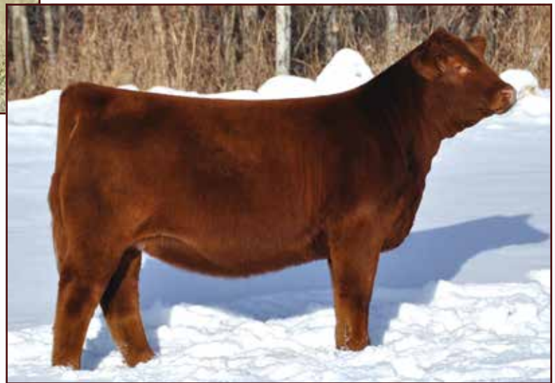
Boss Lake Ms Molly 068H • Dam of Lot 3