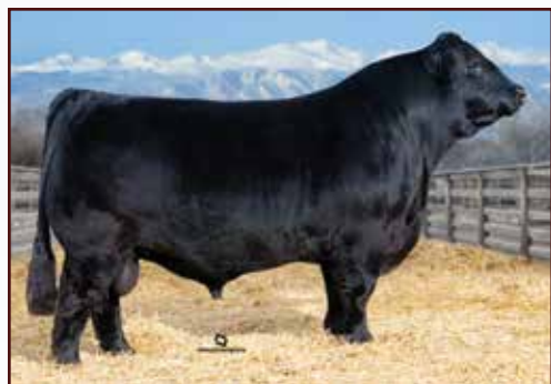
ELCX Kings Landing 599 D • Sire of Lot 13