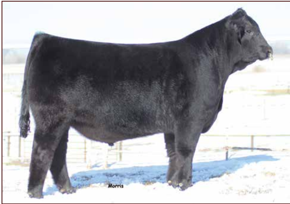
MAGS Aviator • Full sib to CELL Amelia Earhart 8212F