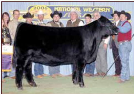
Carrouels Pina Colada • Maternal grandam of Lot 7