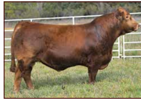
Wulfs Hickok 7056H • Sire of Lot 9