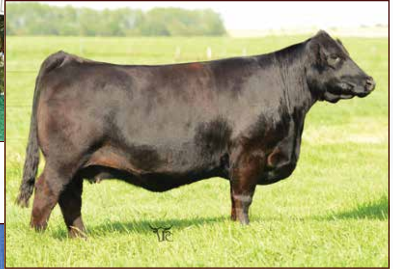
HSF Your Fantasy • Daughter of HSF Tinkerbelle