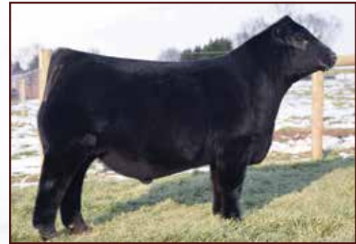
TASF Heineken 405H • Sire of Lot 4B