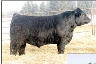
Riverstone Exodus ET