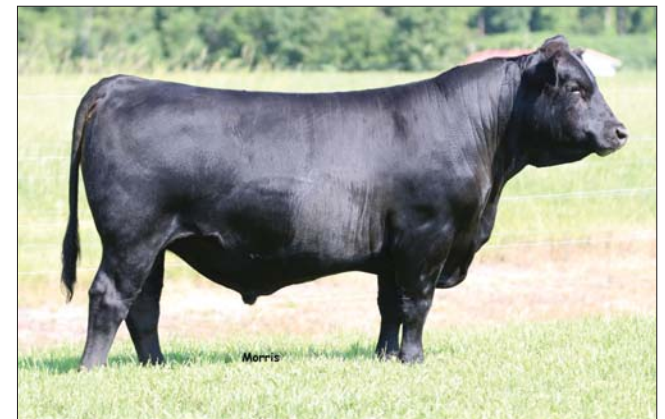
ELCX Camp Fire 508C, sire of Lot 58.

Stout, powerful and massive- all words that we would use to describe this female. ELCX Keepsake 361K is a 53% Lim-Flex daughter of ELCX Camp Fire 508C ET. He is a son of OKSU The Profit 3401 and out of the EBFL San Jose 170X donor. This female's dam is JEPS Savannah 361Z, a daughter of LH Rodemaster 338R and out of the WLR Tiny Dancer female. On paper she ranks in the 35th percentile for her birthweight figure. She is sure to be a quick return on your investment. She is homozygous black.