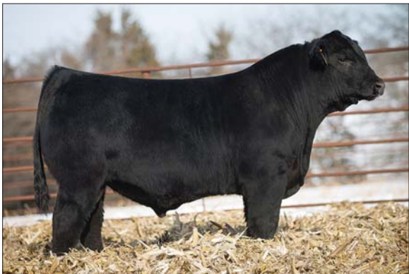
CELL History Maker 0256H ET, sire of Lot 11.

Three IVF heifer embryos from the CELL History Maker 0256H x AUTO Poem 273Y mating. CELL History Maker 0256H was the top-selling lot in the Linhart Limousin 2021 Business Done Right Bull Sale. He is the son of the great purebred and performance AI sire, CELL Envision 7023E and is out of a CELL Miss Responder 6078D, a highly productive donor female for Pinegar Limousin. Very few bulls in the business are able to combine body capacity and overall thickness into a structurally correct package this impressive. What's more, his EPD profile is extremely balanced ranking it the top one percent of the breed for weaning, yearling, scrotal and mainstream terminal index plus, he ranks in the top 25% or better for both ribeye and marbling. This double homozygous PUREBRED bull is one that has the potential to make a huge impact on even the most progressive programs. The dam in this mating, AUTO Poem 273Y needs no introduction. She is the daughter of SAV Bismarck 5682 and the legendary MAGS Phantoms Prize donor. These embryos will be 68.5% Lim-Flex, homozygous polled and double black.