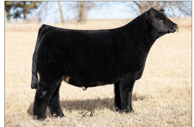
Ratliff Jump Start 340J ET, sire of Lot 12 & 13 embryos.

Three IVF heifer embryos from the Ratliff Jump Start 340J x ELCX Extra Special 701E mating. Ratliff Jump Start 340J is an impact sire out of FWLY Can Do and from the influential Riverstone Charmed donor female. FWLY Can Do is the RLBH Air Force One son from a great female, CLLL Crystal 334W. The breed has tremendous momentum and attention due in large part from Jump Start's legendary dam "Riverstone Charmed," who won Supreme Female at the 2016 North American International Livestock Exposition. Jump Start's full sister won Supreme Junior Female in 2021 for Sara Sullivan. They are the only mother/daughter duo to win the Supreme Junior female title at the North American International Livestock Exposition in Louisville. Ratliff Jumpstart 340J was selected Grand Champion Limousin bull at the 2022 Cattleman's Congress. The donor female in this mating is ELCX Extra Special 701E, a daughter of PVF Insight 0129 and out of the great AUTO Poem 273Y donor female. She was the $25,000 second high-selling lot in our 2022 Fall Production Sale purchased by Wilder Family Limousin of Snook, Texas. These embryos will be 54.5% Lim-Flex, double black and double polled.