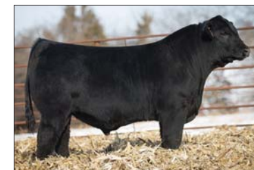
CELL History Maker 0256H ET

YON FINAL ANSWER W494 SAV FINAL ANSWER 0035 YON HIGH COTTON D885 YON SARAH N170 YON WITCH X360 YON FUTURE FOCUS T219 YON WITCH R88 LEMMON NEW DESIGN 5050 Z35 G A R NEW DESIGN 5050 BRITTS ELINE E28 JARRELL SKYMERE 67R LEMMON ELINE A197 A A R TEN X 7008 S A JARRELL ELINE 6U