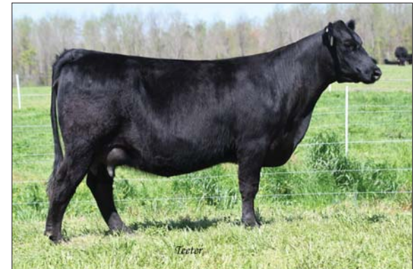
ELCX Extra Special 701E, dam of Lot 12.