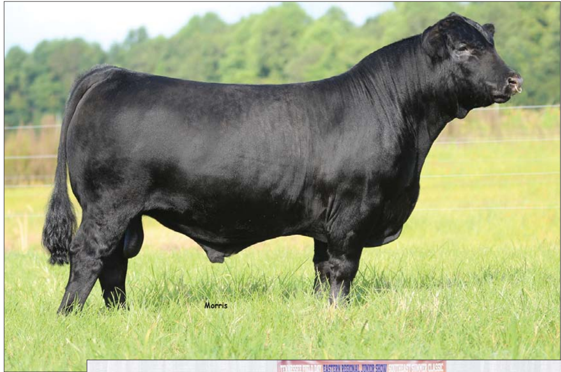
HWCB Eye of Storm, sire of Lot 8A.

We love the functional build of this HWCB Eye of the Storm x AUTO Poem daughter. ELCX Kimmy 177K is so unique in her design, sound from the ground up and built with maternal power in mind. It's cattle built like these three sisters that take programs to the next level. She is homozygous polled and heterozygous black. She is 60% Lim-Flex. Her birthweight figure ranks in the 15th percentile.