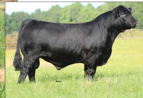
HWCB Eye of the Storm 406E, sire of Lot 8B.