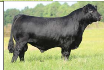
HWCB Eye of the Storm 406E