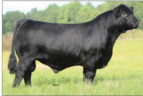
HWC Eye of the Storm 406E, sire of Lot 22A.