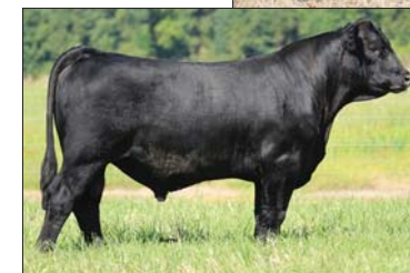
ELCX Ethan 718E