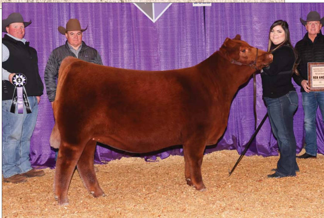
TW Candice 062H, dam of Lot 14A & 14B.