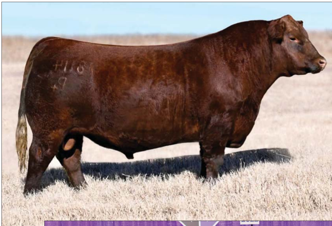
Duff Red Blood 18114, sire of Lot 14A & 14B.