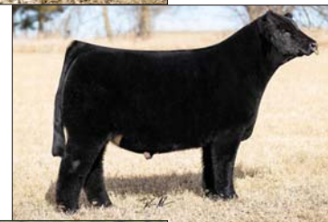
Ratliff Jump Start 340J