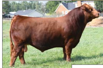
ELCX Englishman 769E