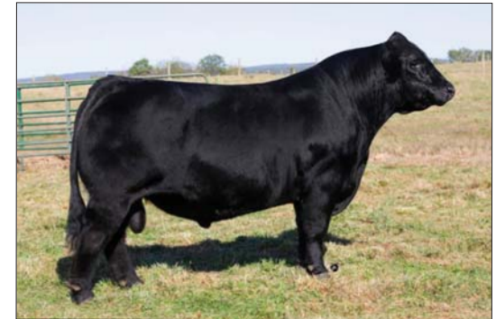
TASF Grey Goose 330G, sire of Lot 20A.

TASF CROWN ROYAL 960C ET TASF X-TASY 488X AUTO REAL DEAL 150B ELCX CHARMER 566C ET