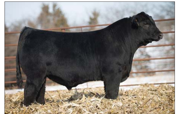
CELL History Maker 0256H ET, sire of Lot 13.