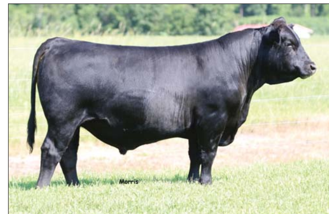
ELCX Camp Fire 508C, sire of Lot 35

Another tremendous opportunity that comes in the form of a young female that has her entire production career on the horizon. ELCX Jazzed Up 170J is a 56% Lim-Flex daughter of ELCX Camp Fire 508C ET, a son of OKSU The Profit 3401. Her dam is ELCX Joyce 133A, a female sired by MAGS Winston and out of an LH Rodemaster 338R daughter, LH Yesterday's Dream 133Y. You'll want to note this female's athleticism and structural correctness. She is homozygous black and double polled.