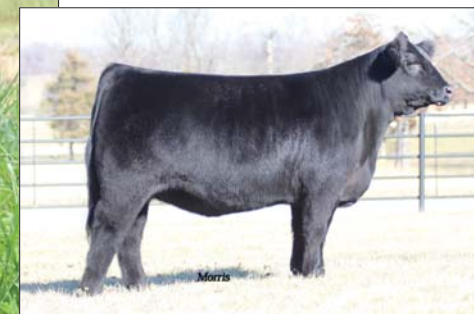
AUTO Poem 273Y, dam of Lot 63.

Lim-Flex (60) Bull Polled / Black ELCX 176K LFM2494900 01.13.2022