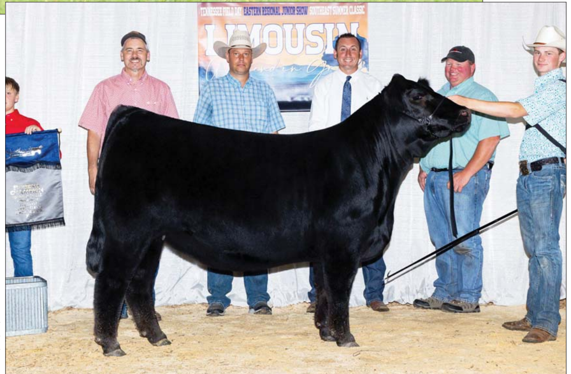
ELCX Kissed 206K, SESC Limousin Show Supreme Champion Limousin Female, Champion Overall Limousin Female and full sister to Lot 8A.