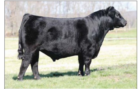
AUTO Real Deal 150B, sire of Lot 19 & 20.

TASF CROWN ROYAL 960C ET TASF X-TASY 488X AUTO REAL DEAL 150B ELCX CHARMER 566C ET