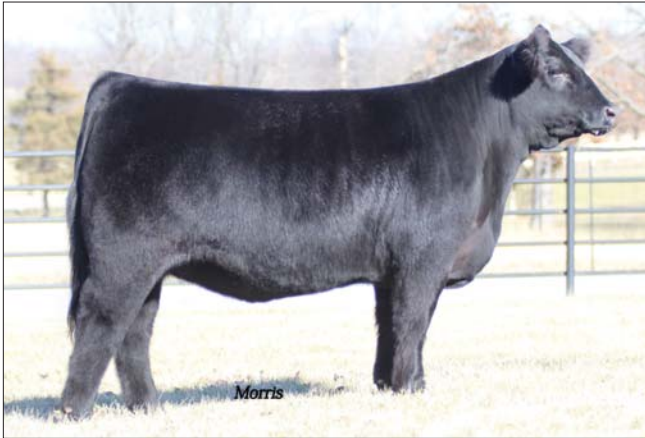
AUTO Poem 273Y, dam of Lot 10 & 11.