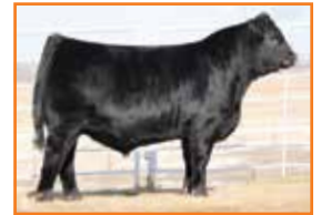
MAGS FEDERAL RESERVE ET