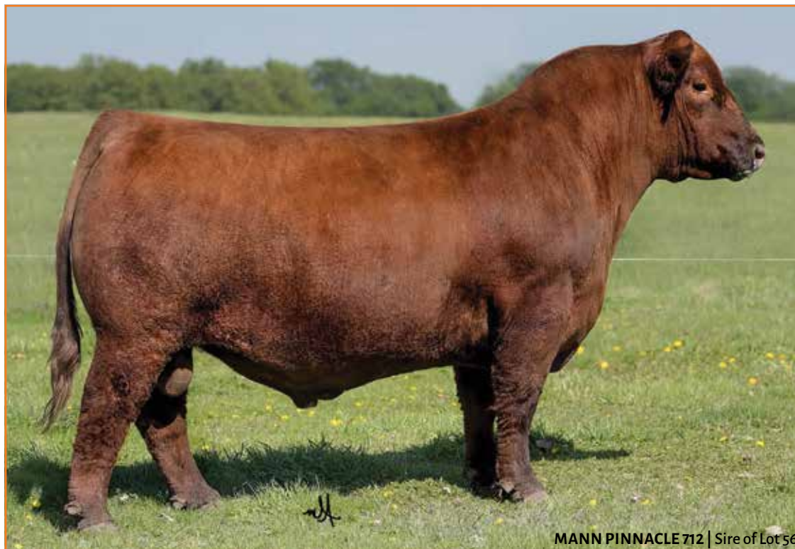
MANN PINNACLE 712 | Sire of Lot 56