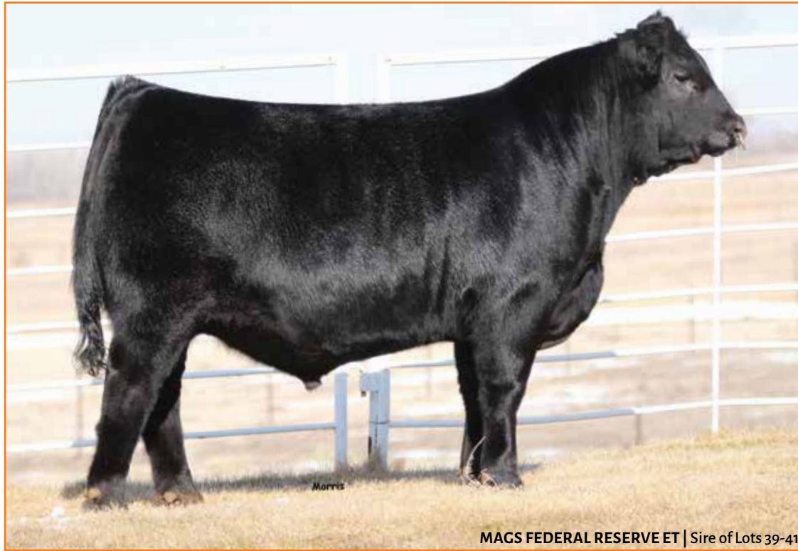
MAGS FEDERAL RESERVE ET | Sire of Lots 39-41