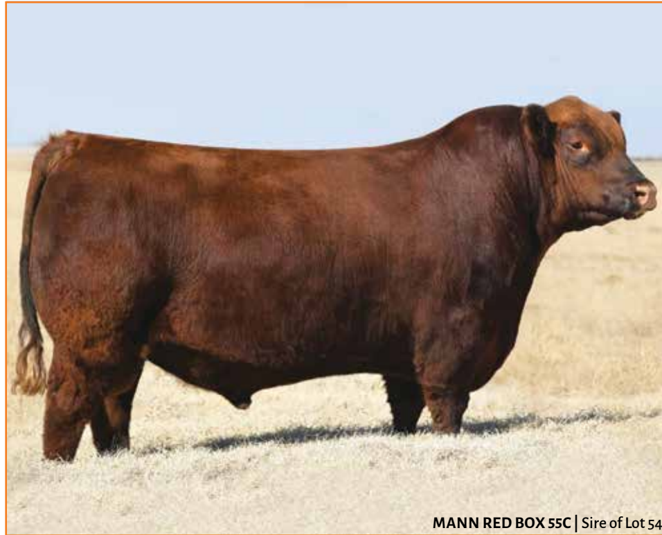
MANN RED BOX 55C | Sire of Lot 54