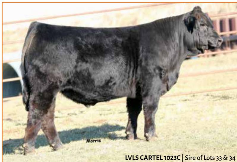
LVLS CARTEL 1023C | Sire of Lots 33 & 34