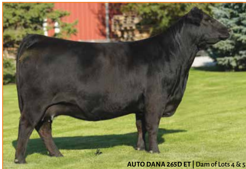
AUTO DANA 265D ET | Dam of Lots 4 & 5