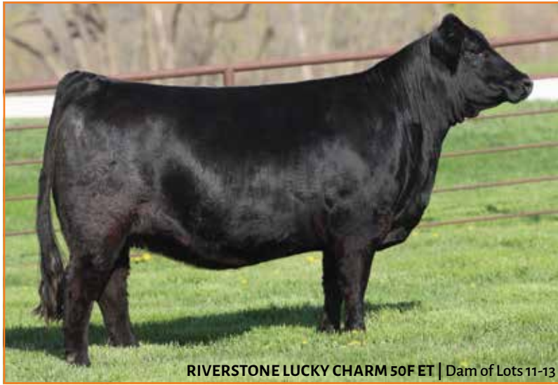
RIVERSTONE LUCKY CHARM 50F ET | Dam of Lots 11-13