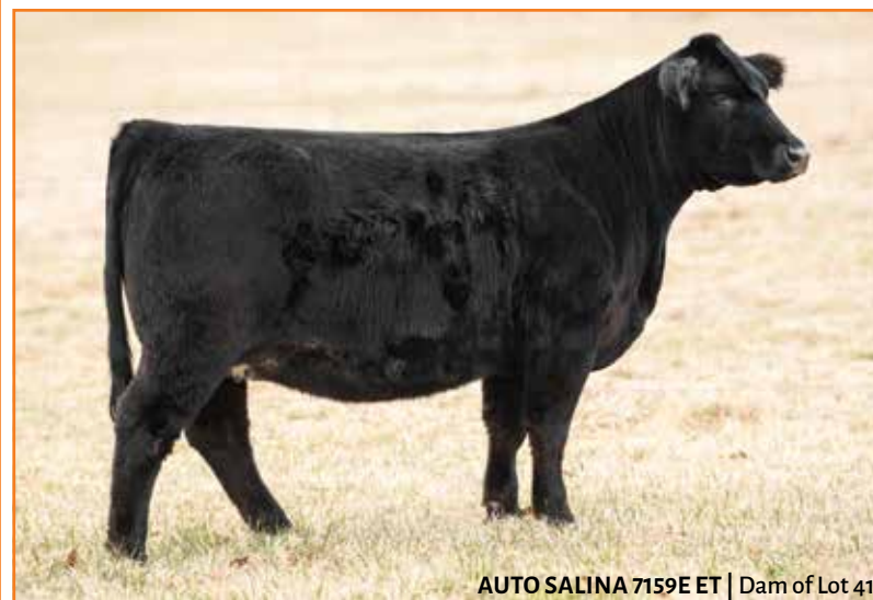
AUTO SALINA 7159E ET | Dam of Lot 41

PBRS 1212] is a full sibling to PBRS 1207]. She is from the MAGS Federal Reserve ET x MAGS Zenovia mating. On paper, she ranks in the top 2% of the breed for Marbling, 25% for both Yearling Weight and Milk, and 30% for Weaning Weight. This female has tremendous body and mass that fits nicely into a powerful, feminine package. She is homozygous black and homozygous polled.