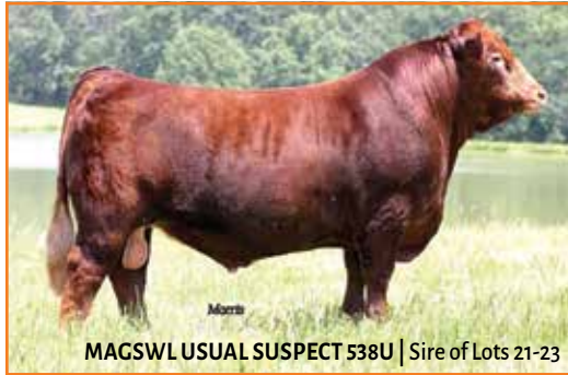
MAGSWL USUAL SUSPECT 538U | Sire of Lots 21-23