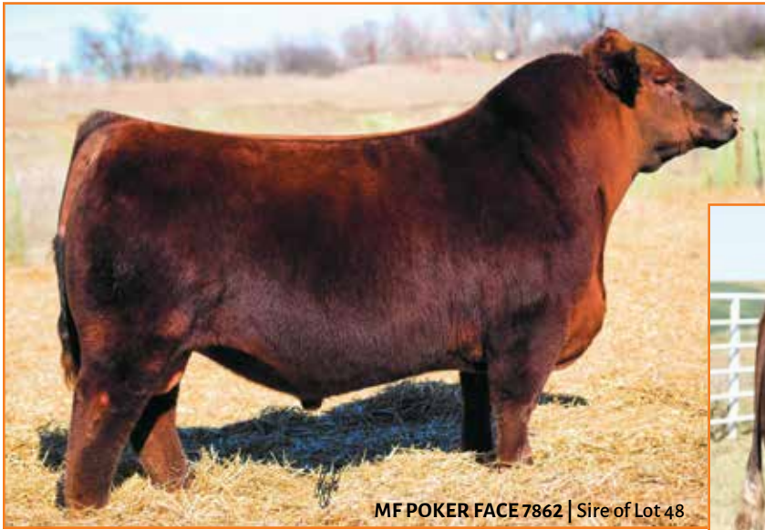
MF POKER FACE 7862 | Sire of Lot 48