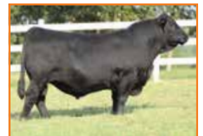
PBRs MAX 1333J ET