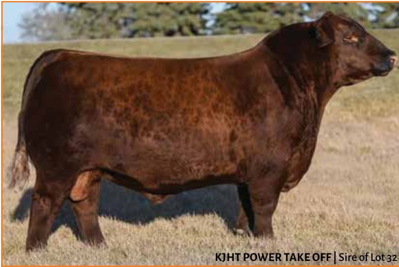
KJHT POWER TAKE OFF | Sire of Lot 32