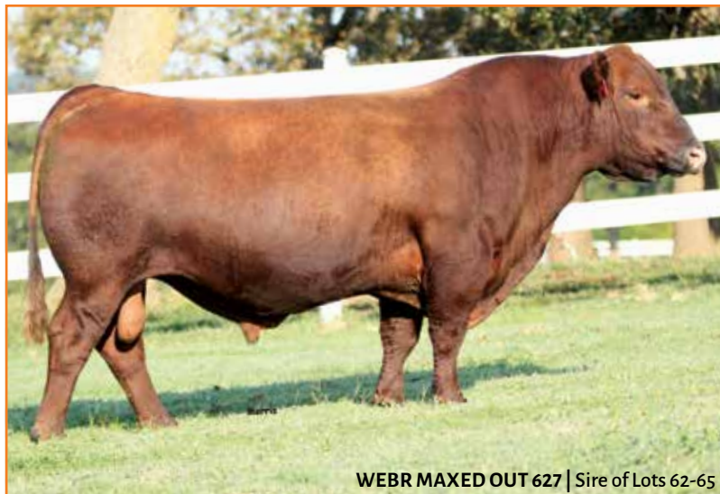
WEBR MAXED OUT 627 | Sire of Lots 62-65