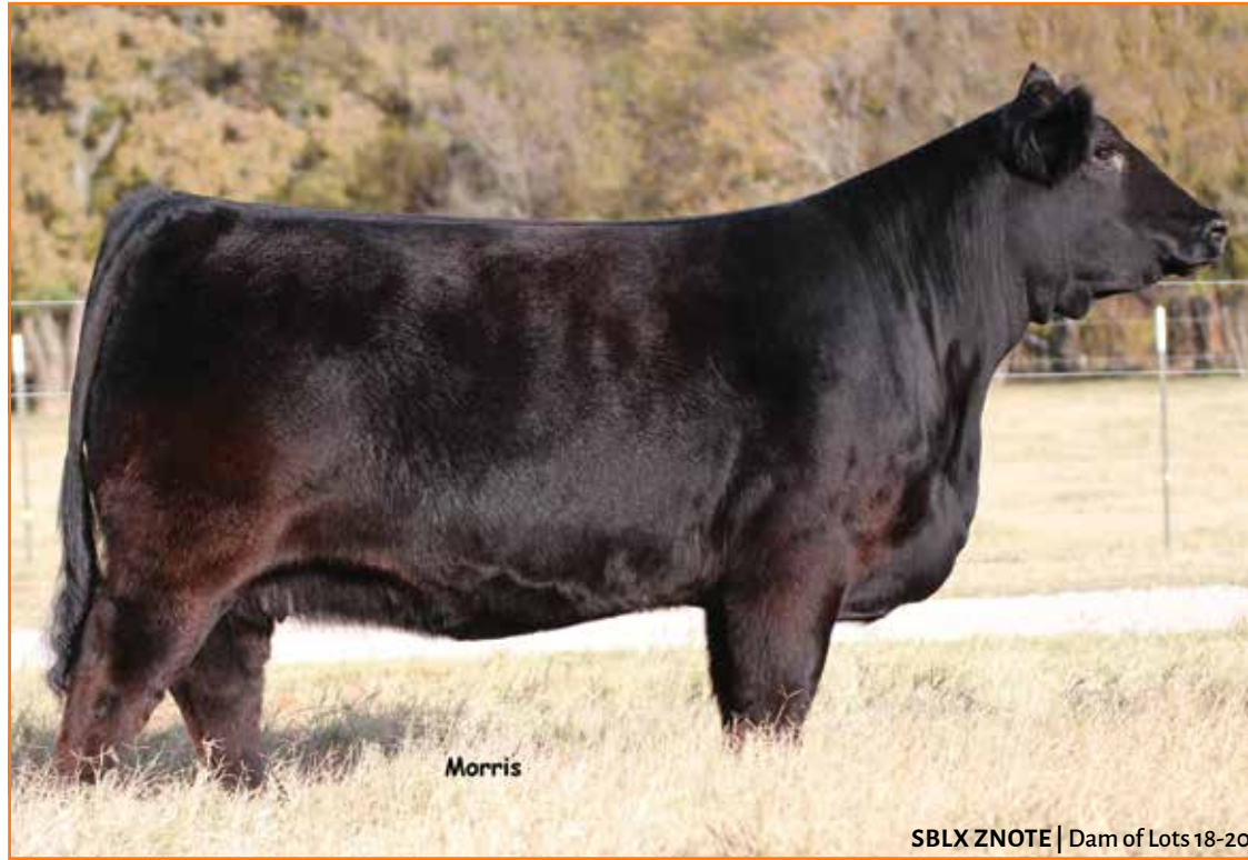
SBLX ZNOTE | Dam of Lots 18-20