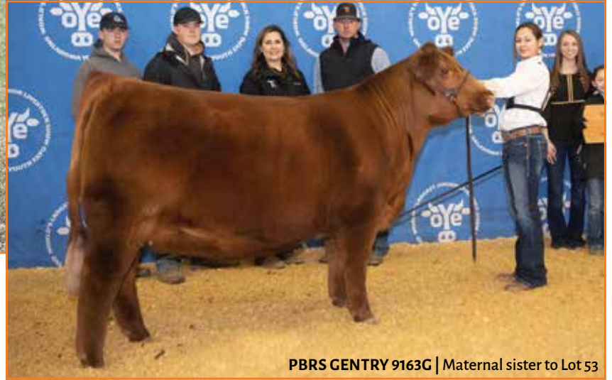
PBRS GENTRY 9163G | Maternal sister to Lot 53