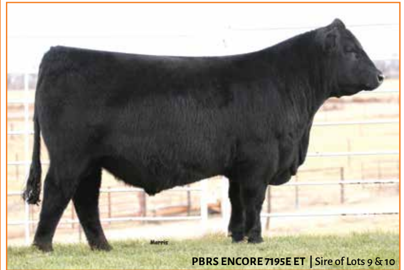
PBR ENCORE 7195E ET | Sire of Lots 9 & 10

Another truly dynamic sister duo here. PBR Crazy K 216K is a full sib to PBR Karma 215K. She is a 43% Lim-Flex female that also ranks in the top 15% for Marbling. This duo is sure to generate a lot of attention. These two females have such stunning silhouettes, practical builds and such a soft maternal look about them. They are sure to produce progeny that will capture top earning potential and functional longevity. PBR Crazy K 216K is homozygous polled.