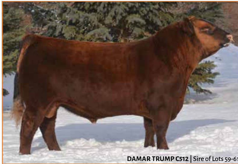
DAMAR TRUMP C512 | Sire of Lots 59-61