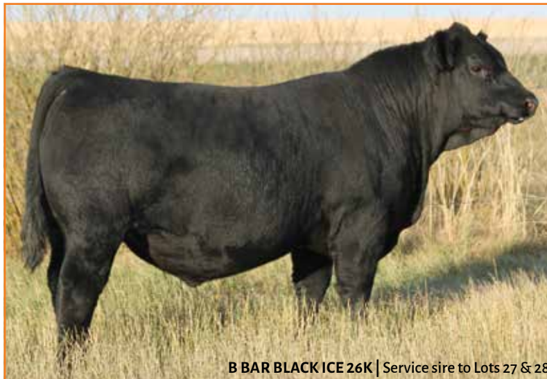
B BAR BLACK ICE 26K | Service sire to Lots 27 & 28