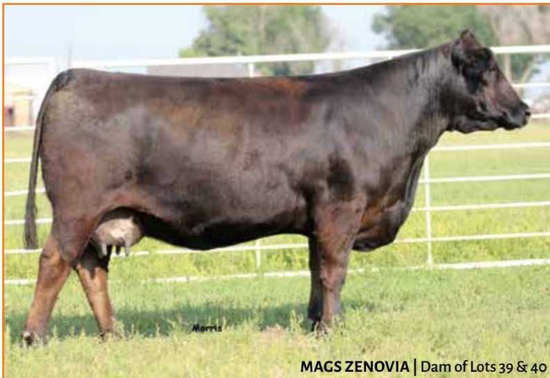
MAGS ZENOVIA | Dam of Lots 39 & 40