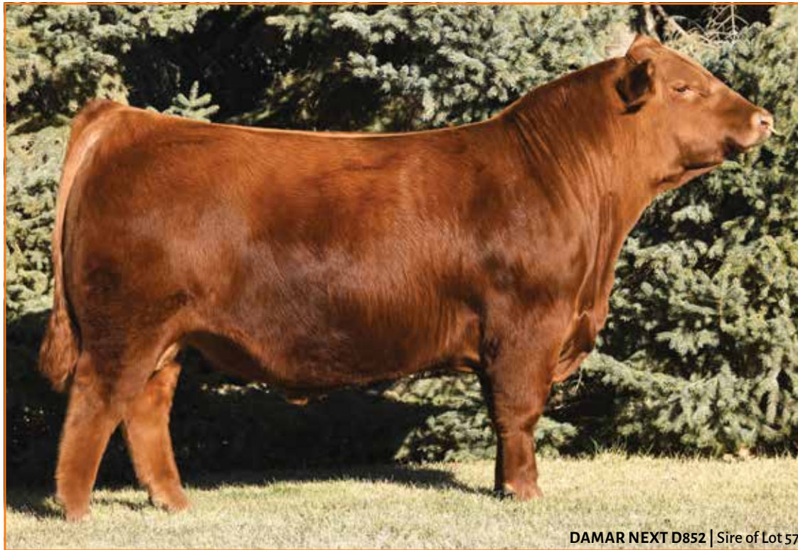
DAMAR NEXT D852 | Sire of Lot 57