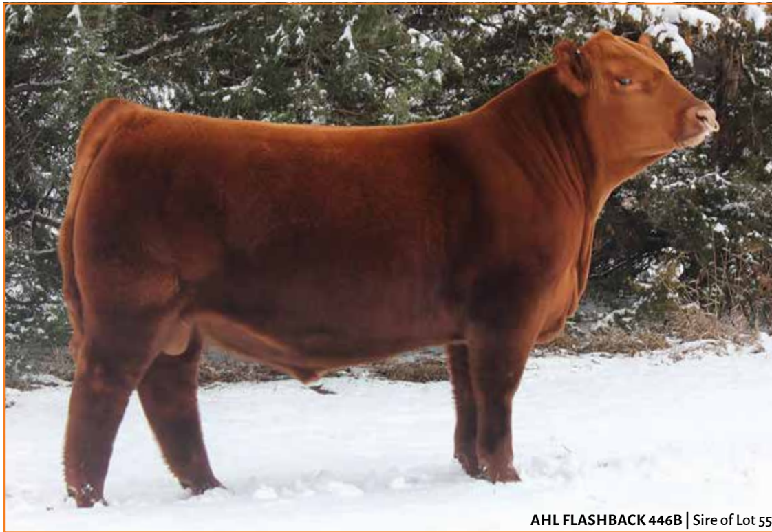
AHL FLASHBACK 446B | Sire of Lot 55