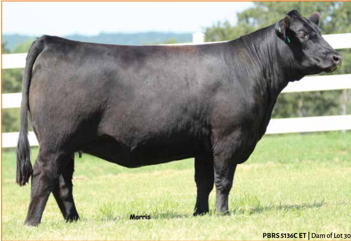
PBRS 5136C ET | Dam of Lot 30