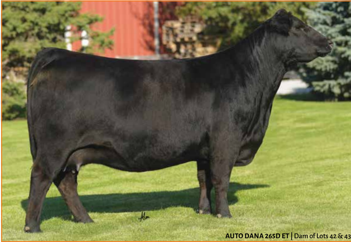
AUTO DANA 265D ET | Dam of Lots 42 & 43