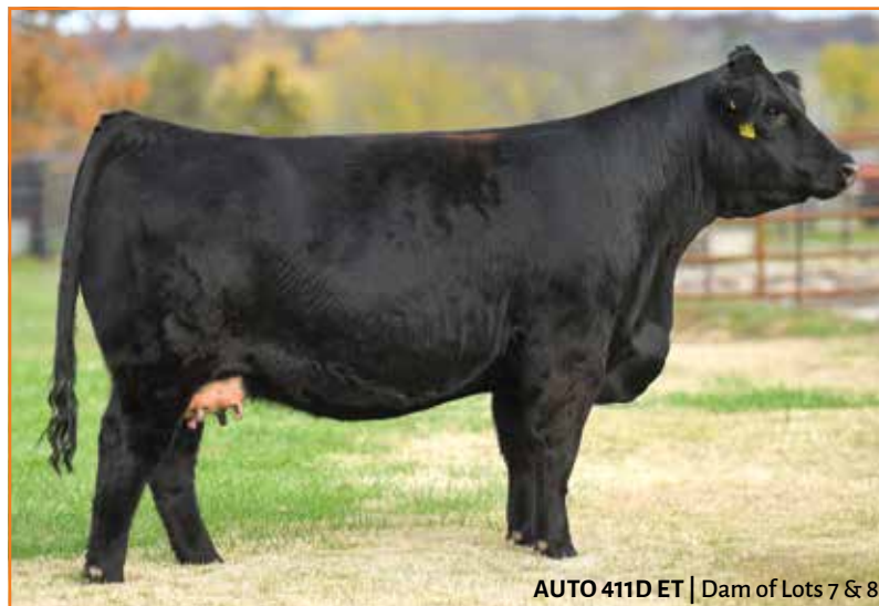
AUTO 411D ET | Dam of Lots 7 & 8

Talk about a dynamic duo of sisters! PBRS Keeping Kind 212K ET is a full sib to PBRS Krona 213K ET. She is sired by MAGS Wazowski and out of the TMCK Hydraulic 17Y x MAGS Wallpaper daughter, AUTO 411D ET. This female ranks in the top 2% for Milk, 10% for Weaning Weight and 20% for Yearling Weight. PBRS Keeping Kind 212K ET combines genetic excellence with visual merit. She is practical in her design, attractive from all angles and structurally sound. What's more, she is homozygous black and homozygous polled.