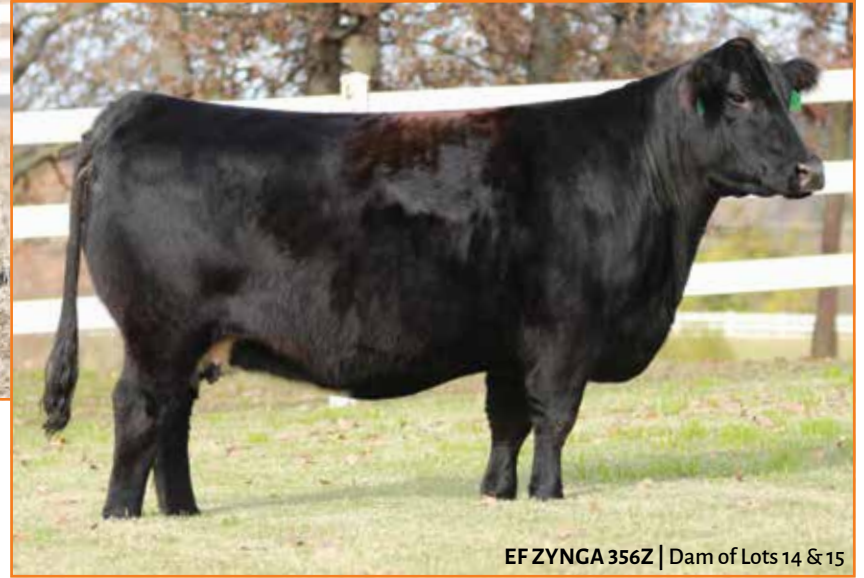
EF ZYNGA 356Z | Dam of Lots 14 & 15