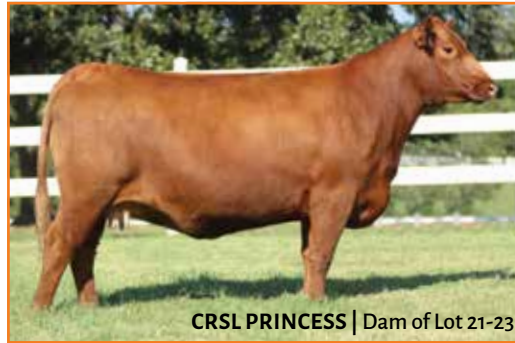
CRSL PRINCESS | Dam of Lot 21-23