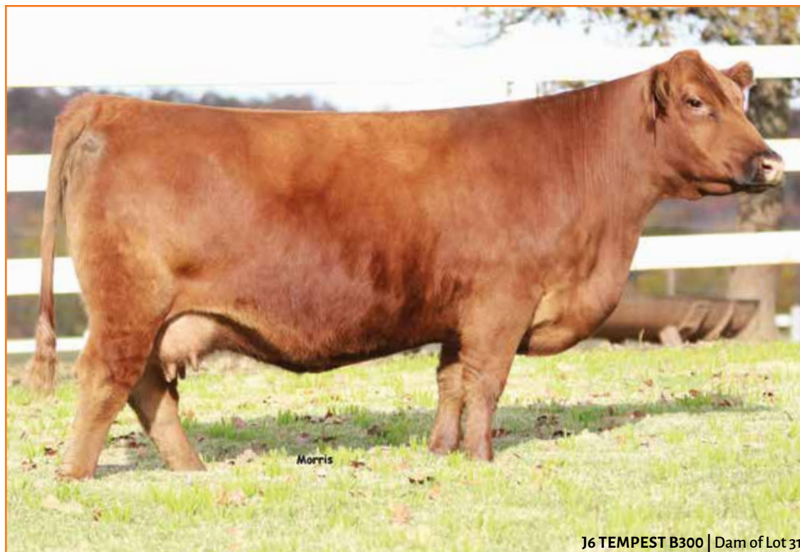
J6 TEMPEST B300 | Dam of Lot 31