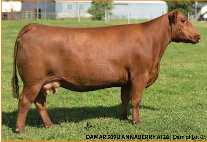
DAMAR 509U ANNABERRY A128 | Dam of Lot 64