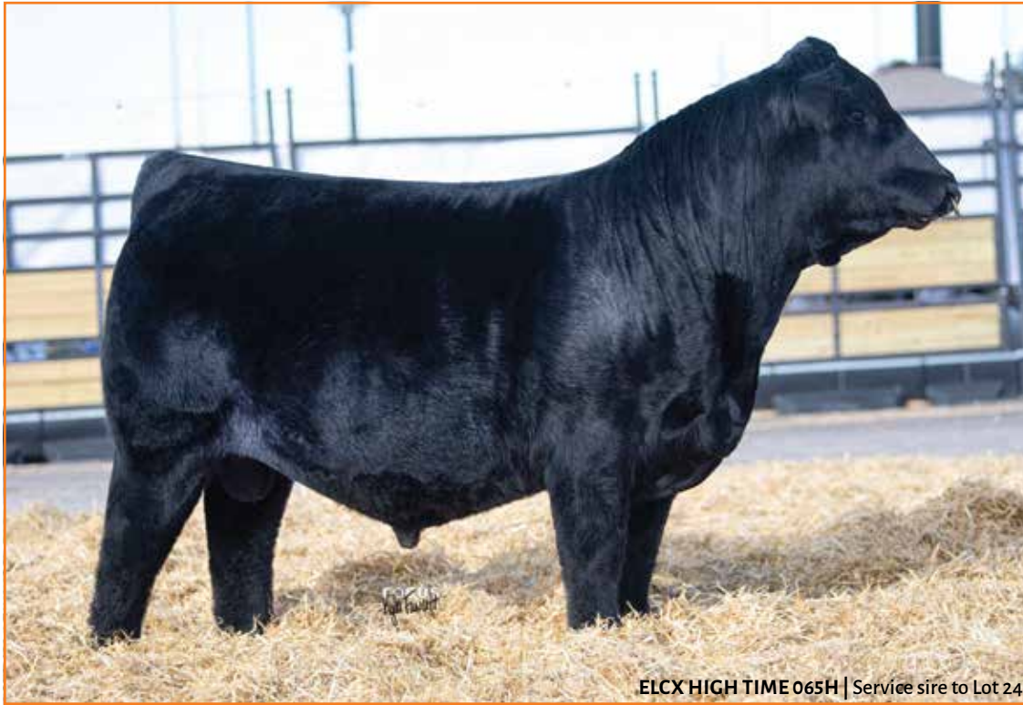
ELCX HIGH TIME 065H | Service sire to Lot 24