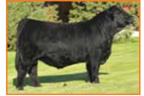
WLR FINAL CALL ET