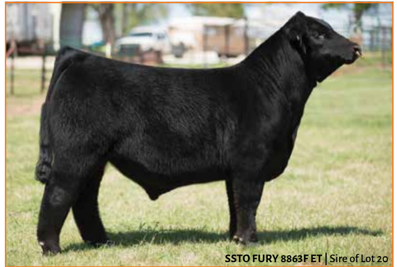
SSTO FURY 8863F ET | Sire of Lot 20

PBRs 1339J ET is a 68% Lim-Flex female sired by SSTO Fury 8863F ET. He is the Colburn Primo 5153 son out of Riverstone Charmed. He is one of the finest genetic masterpieces to come from the Stowers Limousin program. This female's dam, SBLX Znote, is a daughter of MAGS Xyloid out of the breed matriarch MAGS Manuela. PBRs 1339J is a role model female that personifies the meaning of longevity and productivity.