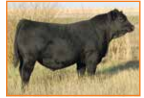
B-BAR BLACK ICE 26K