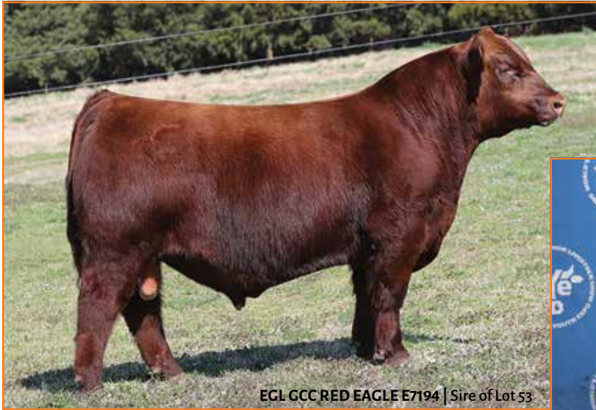
EGL GCC RED EAGLE E7194 | Sire of Lot 53