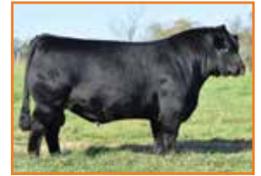
CJSL DAUNTLESS 6257D ET