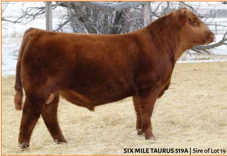
SIX MILE TAURUS 519A | Sire of Lot 19