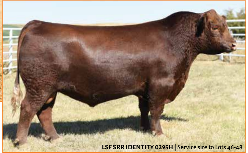
LSF SRR IDENTITY 0295H | Service sire to Lots 46-48