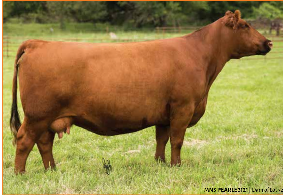
MNS PEARLE 3121 | Dam of Lot 52