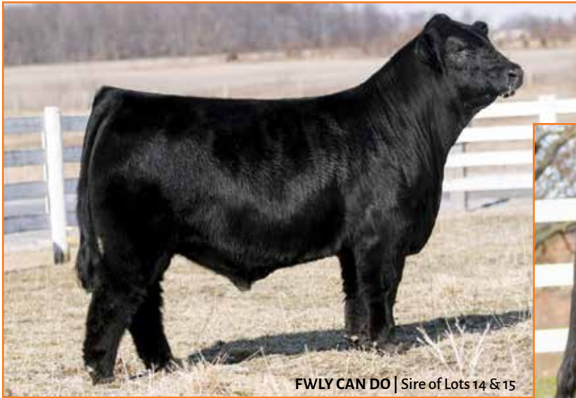
FWLY CAN DO | Sire of Lots 14 & 15