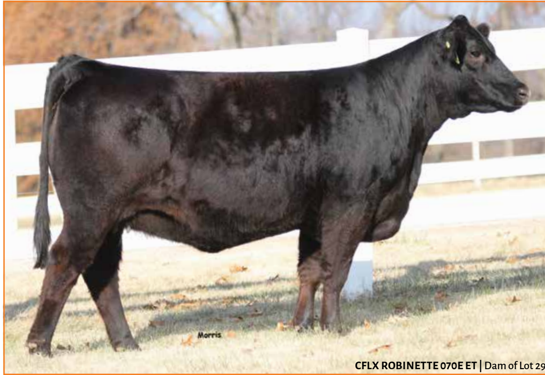
CFLX ROBINETTE 070E ET | Dam of Lot 29