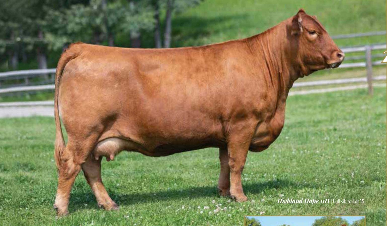
Highland Hope 11H | Full sib to Lot 15