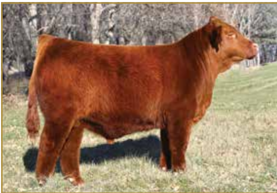
Royal Jester RBGL 103J | Full sib to Lot 19