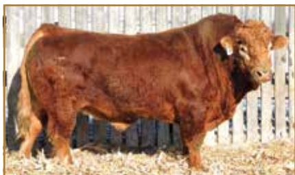
TREF EZ Street 107E