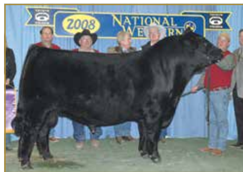
DHVO Deuce 132R | Sire of Lot 11

Here is a unique opportunity to flush CELL 5065C. This standout donor female has produced progeny with extra style that have been ultra-competitive. She is a daughter of renowned DHVO Deuce 132R, one of the most influential sires in the history of the Limousin breed. Few sires have reached the elevated status that Deuce has. Her dam is the well-known MAGS Wrigley, a daughter of MAGS Sasquatch. It's not every day you get an opportunity like this. Imagine the possibilities and make them a reality sale day.