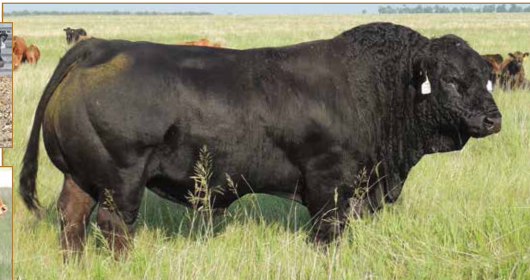
Richmond Fantom SRD 102F