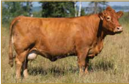
Pinnacle's Drama Queen 8D | Dam of Lot 5