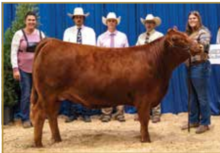
Maternal sister to Lot 5