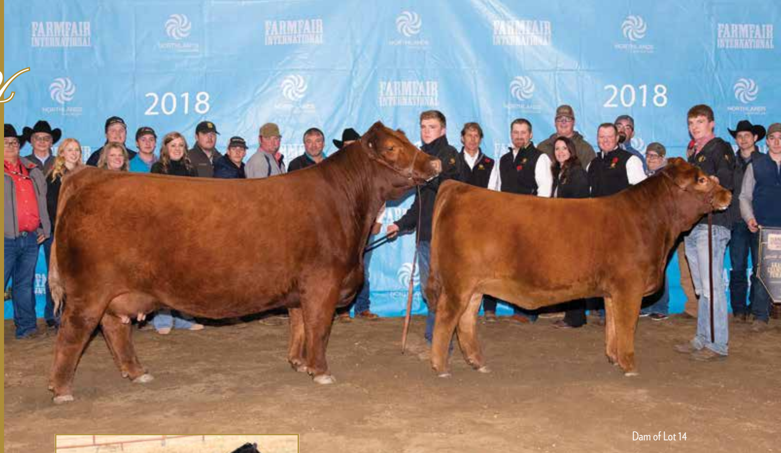
Dam of Lot 14