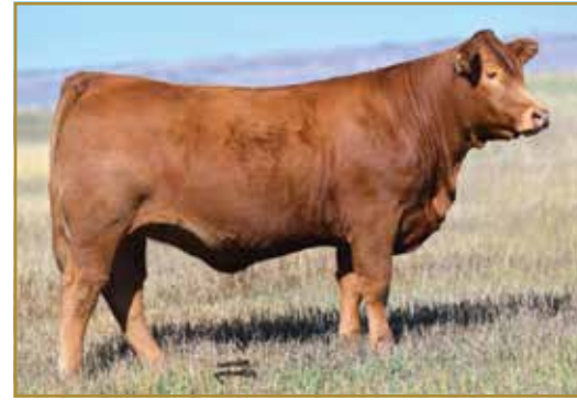
DBCC Kentucky Bluebird 29K | Full sister of Lot 6