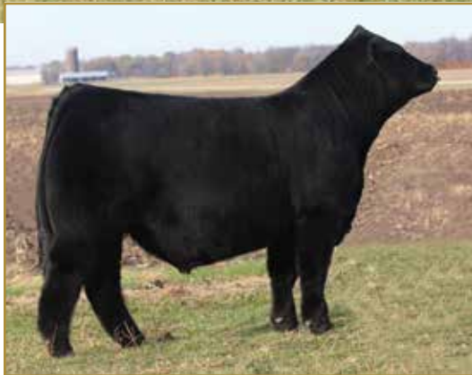
SSTO Guns N' Roses 9408G ET | Sire of Lot 3