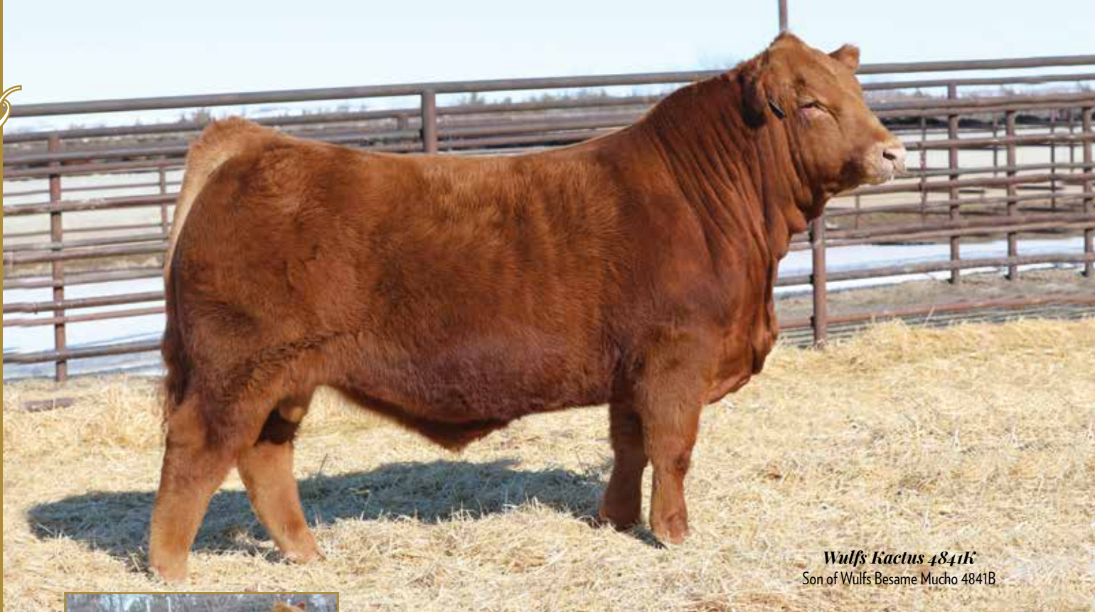
Wulfs Kactus 4841K Son of Wulfs Besame Mucho 4841B