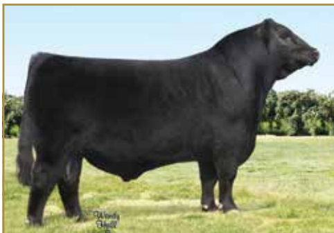
Silveiras Style 9303 | Sire of Lot 14