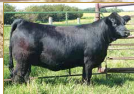
EDW Chewy Chocolate | Dam of Lot 17