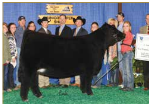
Riverstone Charmed | Granddaughter of HSF Tinkerbell

SOLID GOLD LIMOUSIN SALE • NOVEMBER 22, 2023