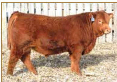
TREF Grandslam 111G