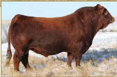
RPY Paynes Cracker 17E | Paternal grandsire of Lot 7