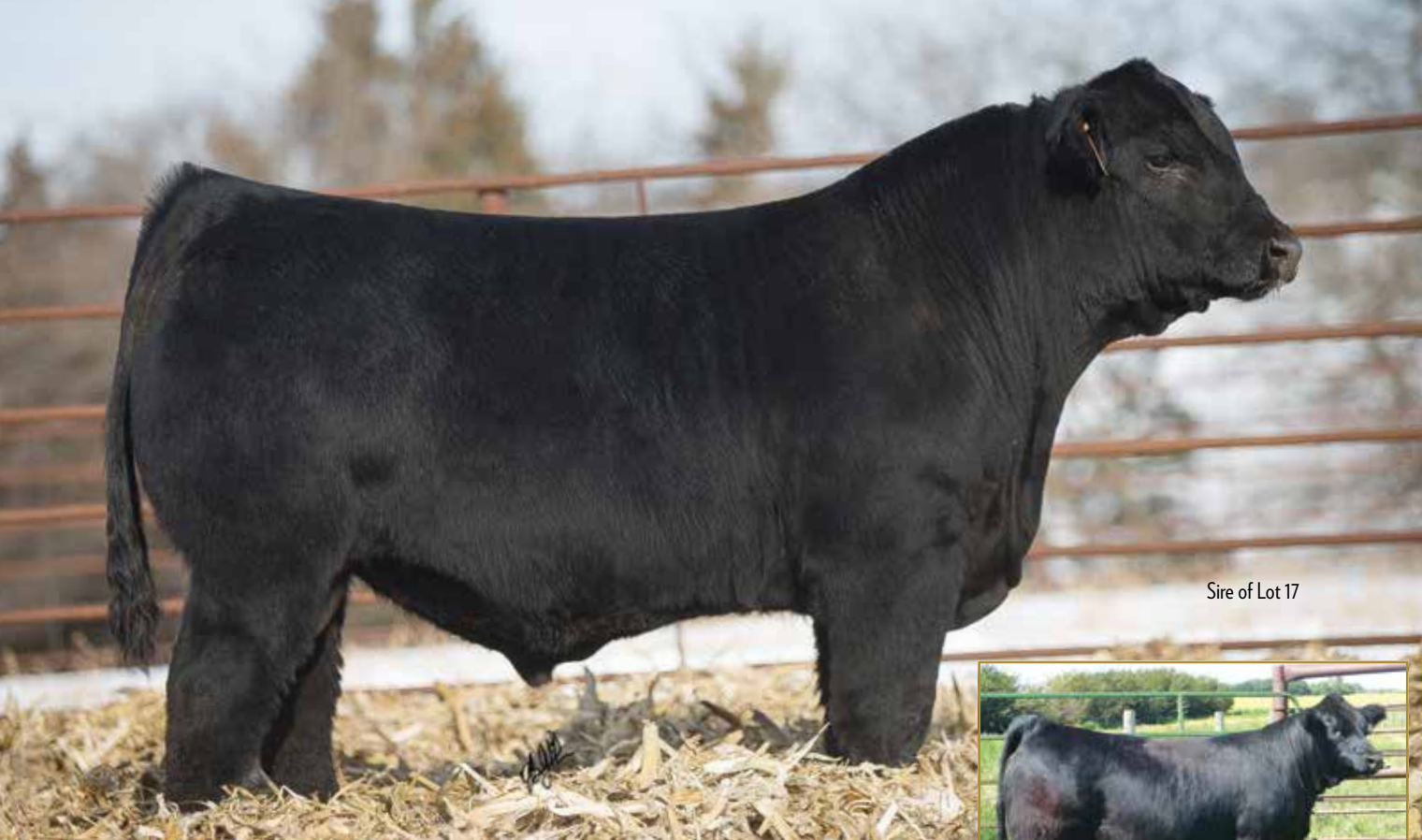
Sire of Lot 17