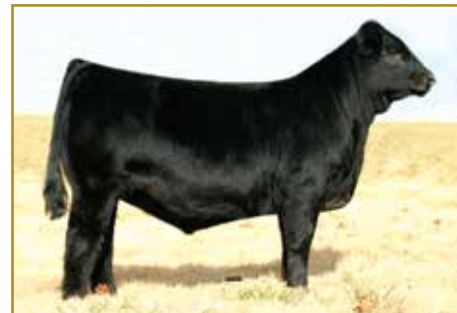
CFLX Wild Card | Maternal grandsire of Lot 4

SOLID GOLD LIMOUSIN SALE • NOVEMBER 22, 2023