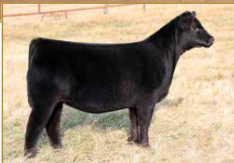
Greenwood Ally 110K | Full sib to Lot 14