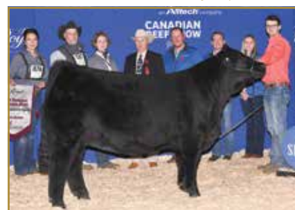
Boss Lake Ms Molly 812F ET | Dam of Lot 2