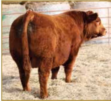
Anchor B Gold Rush 48G