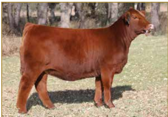
Royal Kolly RBGL 205K | Daughter of Lot 10