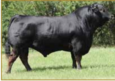
B Bar Soot 25B