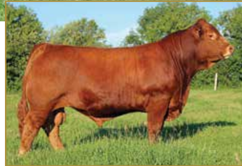
Greenwood Curve Ball | Sire of Lot 15

Here is the opportunity to purchase embryos that are full siblings to last year's CWA Champion Female, Highland Hope 11H. This donor is a head-turner. Highland Champagne is the attractive patterned JYF Zeus 609Z daughter and a farm favorite. She is ultra-feminine, level topped, bold sprung and fundamentally correct. Greenwood Curve Ball is a son of the popular EXLR Total Impact 054T out of the well-known Greenwood Pld Zoom Bloom. Don't miss these embryos that will get the job done phenotypically and genetically.