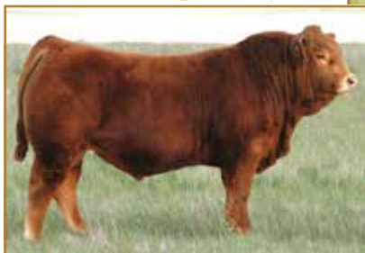
TREF Hardcore 204H