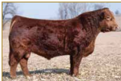
Wulfs Hat Trick 7183H | Sire of Lots 18A & 18B