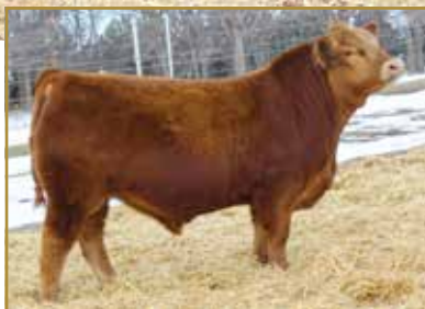
Wulfs Holliday 4841H | Son of Wulfs Besame Mucho 4841B