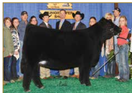
Riverstone Charmed 50C | Dam of Lot 20

20A-10 Units of Canadian Qualified Semen 20B-10 Units of Canadian Qualified Semen 20C-10 Units of Canadian Qualified Semen 20D-10 Units of Canadian Qualified Semen 20E-10 Units of Canadian Qualified Semen 20F-10 Units of Canadian Qualified Semen 20G-10 Units of Canadian Qualified Semen 20H-10 Units of Canadian Qualified Semen 20I-10 Units of Canadian Qualified Semen 20J-10 Units of Canadian Qualified Semen