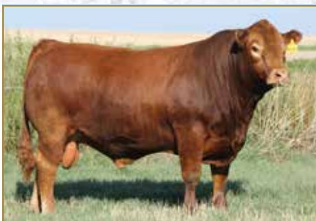
Diamond C Kingsman 5K | Sire of Lot 16