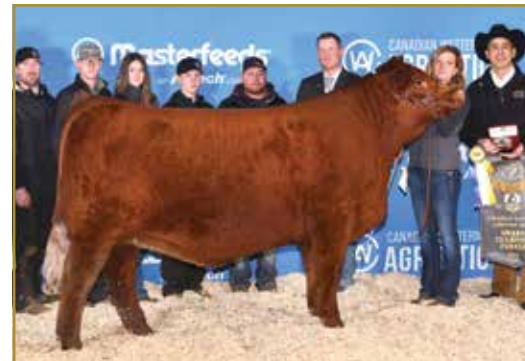
DBCC High Society 15H | Maternal sister of Lot 6