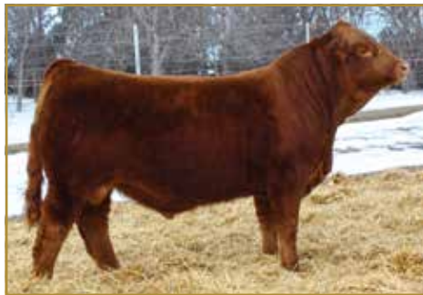
Wulfs Horton 7358H

Min. 6; Max. 10 freezable embryos. Buyer pays flush expense.