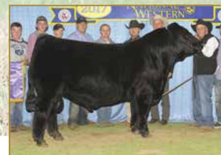
TASF Crown Royal 960C ET | Sire of Lot 2