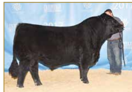
RPY Paynes Dillinger 43D | Sire of Lot 4

This stylish heifer has endless potential in the show ring and adding value to any herd. She grabs your attention with her eye appeal and presence. She has an attractive front end that is carried through with her bold design, excellent hair coat and of course ample amount of Limousin hip. She is sired by RPY Paynes Dillinger 43D, the 2018 CWA Grand Champion Bull. Her donor dam is the highly productive RPY Paynes Bailey 30B. On paper, this female offers tremendous growth, ranking in the top 10% for WW and top 5% for YW. This sweetheart is the complete package and would work great for any junior looking for a heifer to hang purple banners. She already has a winning record as Calf Champion at the Manitoba Ag Ex and Reserve Calf Champion at the Black Gold Jackpot. Once she is done in the show ring, Lucy should follow in her dam's footsteps and produce excellent offspring.