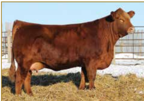
Miss TMF Shameless | Maternal grandam of Lot 16