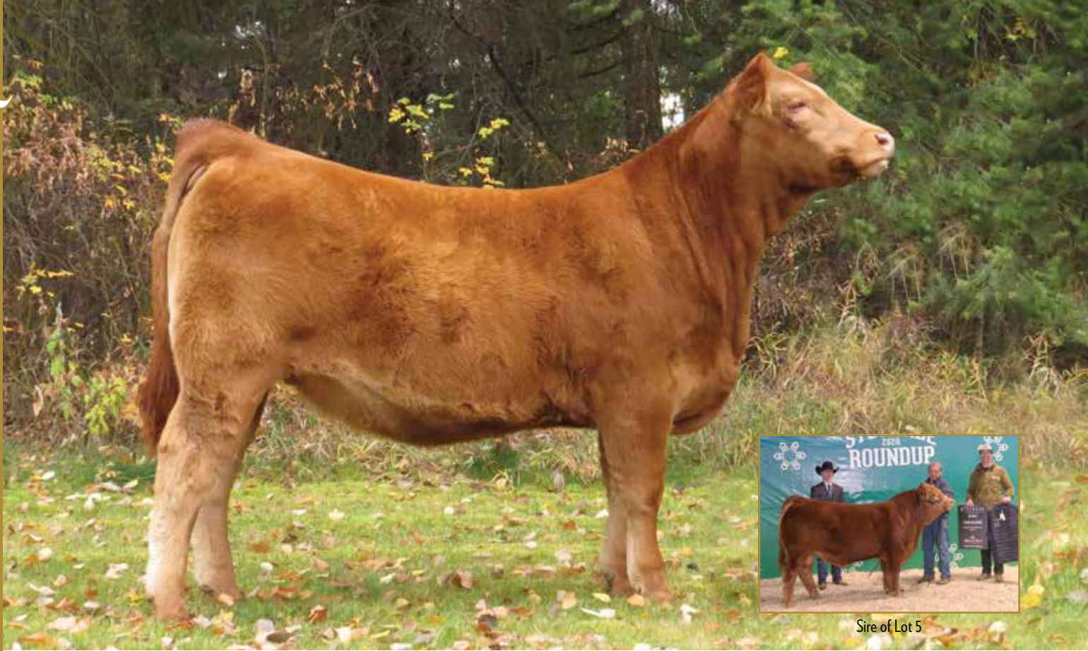
Sire of Lot 5