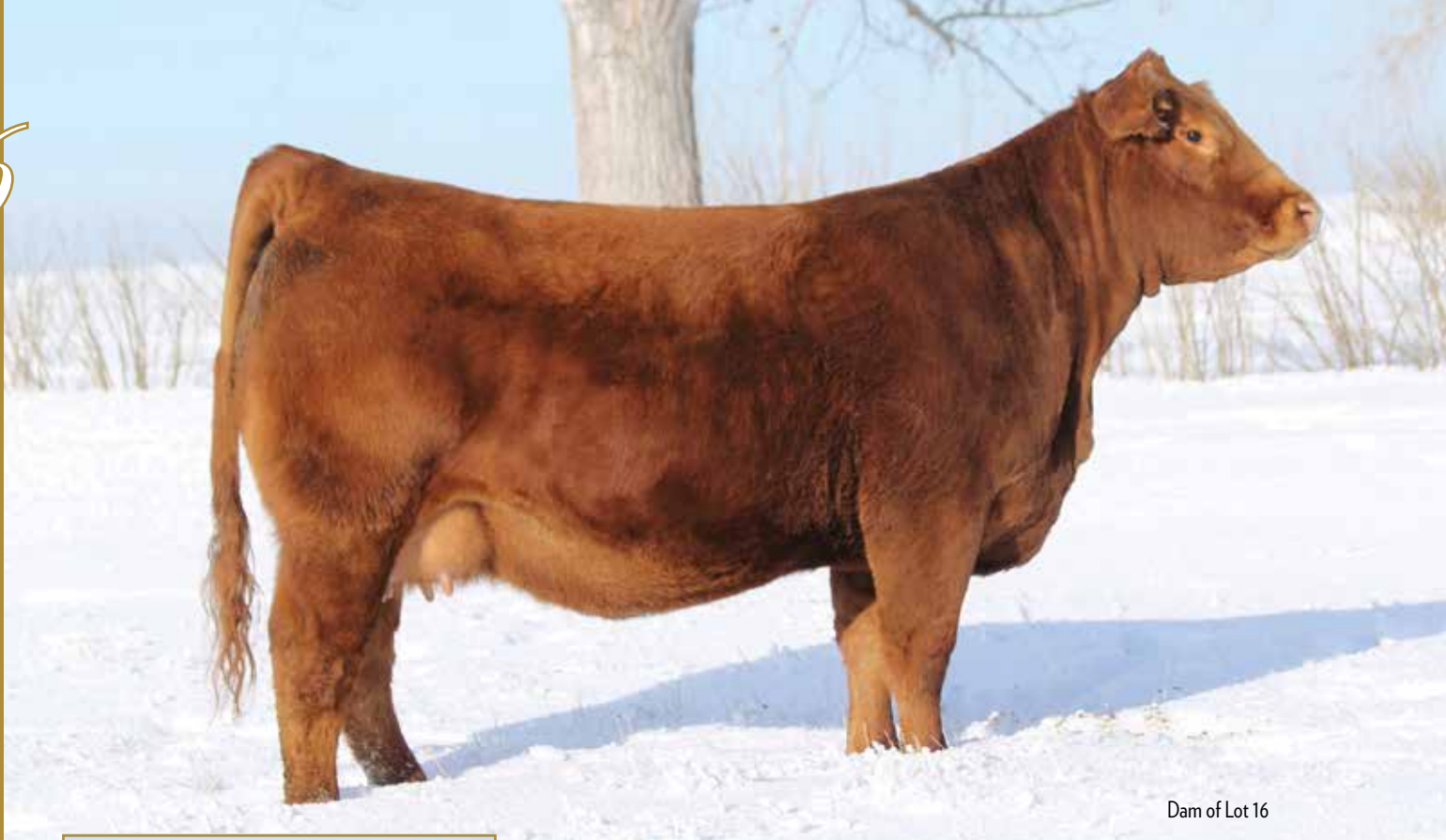
Dam of Lot 16