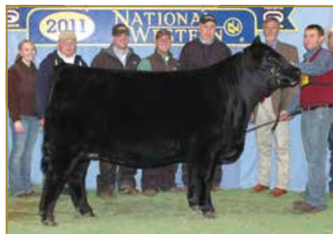
MAGS Wrigley | Dam of Lot 11