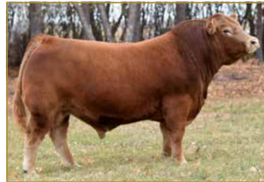
777 Cattle Hawkins | Sire of Lot 6