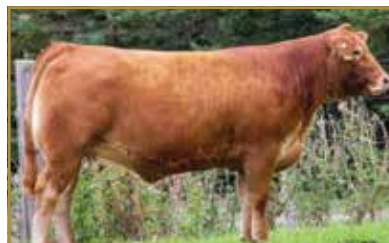
Red Maple Jumbleberry