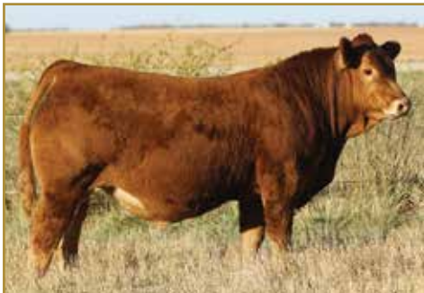
B-Bar Wrangler 41H | Sire of Lot 7