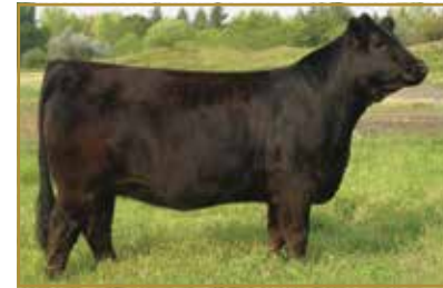
RPY Gibsons Mischief 557

We pride ourselves in our cow families and much of our herd are progeny resulting from purchasing cattle from many of the top breeders in Canada. We have females sired by Wulfs Xtractor, B Bar Bentley 8D, RPY Paynes Cracker 17E, RPY Paynes Tank, Greenwood Electric Impact, RPY Paynes Diesel, Circle T Fight Club and of course our herdsires B Bar Soot 25B and HLC DBCC Flatliner.