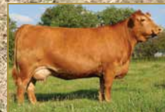
Dam of Lot 1