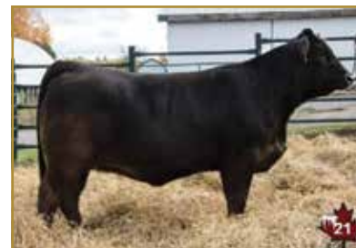
WGL Eastern Star 8E

SOLID GOLD LIMOUSIN SALE • NOVEMBER 22, 2023