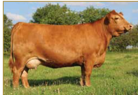
Greenwood PLD Zoom Bloom | Paternal grandam of Lot 15