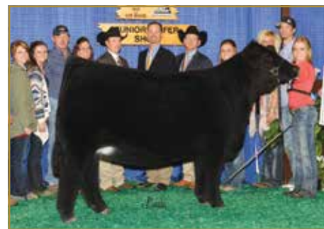
Riverstone Charmed | Full sib to dam of Lot 17

EDW Chewy Chocolate is a full sibling to Riverstone Charmed 50C, one of the greatest show females of all time. Not only did she make her mark during her storied show career, she is now generating progeny that command top dollar and dominate any arena they walk into. There are too many banners won to report on a single page from her progeny. These cattle have impressed some of the most reputable cattlemen in the industry for their eye-catching profile and athletic abilities when set into motion. CELL History Maker is one of the most popular A.I. sires in the breed right now and for a good reason. He is a go-to Envision son for many due to his impressive EPDs and phenotype. Do not sleep on this opportunity, the product is self-evident.