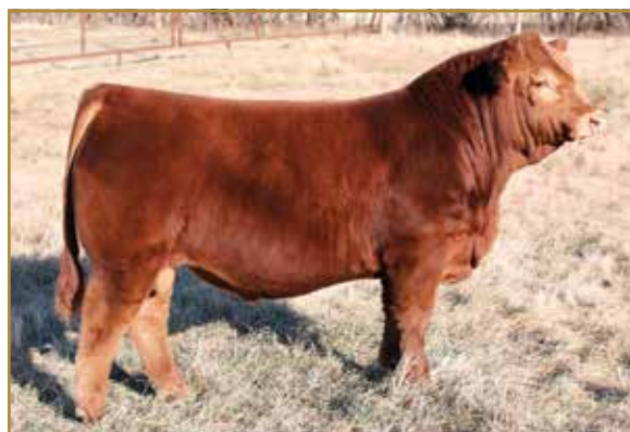
PY:N Commitment 705K | Full sib of Lot 1