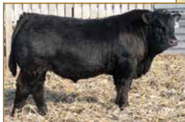
TREF Gunpowder 290G