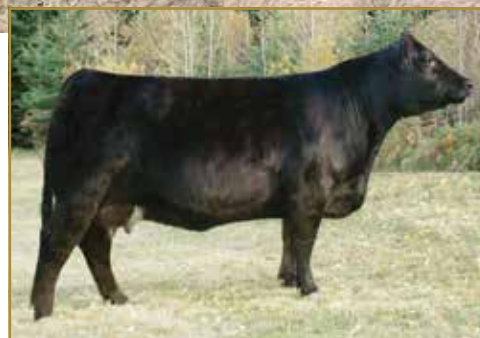
HSF Tinkerbell | Dam of Lot 13

Greenwood Pld Birch combines a notable pedigree, proven resume and eye-catching phenotype. This donor was a sale feature in last year's Solid Gold Sale from the heart of the prestigious Greenwood Limousin herd. Greenwood Pld Birch is sired by the popular A.I. sire CJSL Windfall 9072W, whose influence has been seen across North America in multiple progressive breeding programs. Her dam is the storied HSF Tinkerbell, the popular Carrousel's Nasdaq daughter out of the well-known NP Vidalia 164H. On paper, Greenwood Pld Birch presents above-average growth and maternal traits. From the ground up this female is big-footed and stout in her bone work with added angularity to her skeletal design. Don't miss the opportunity to flush this incredible female.