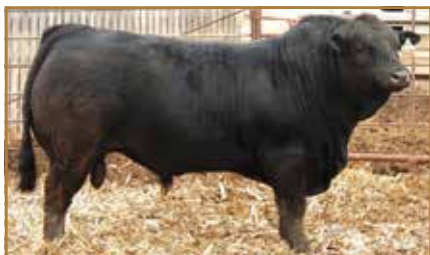
Balamore Hershey 0120H