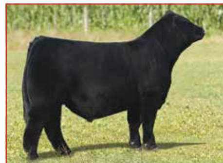
SSTO GUNS N ROSES 9408G • Service sire to Lot 26