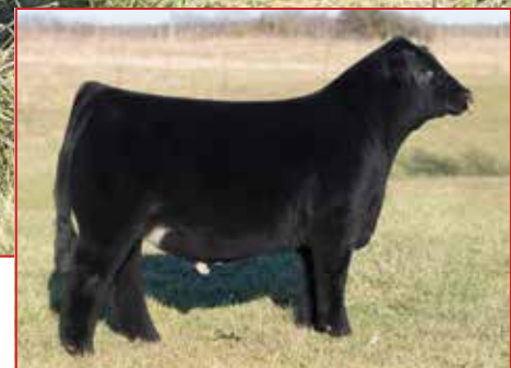
RATLIFF JUMP START 340J ET • Sire of Lot 6