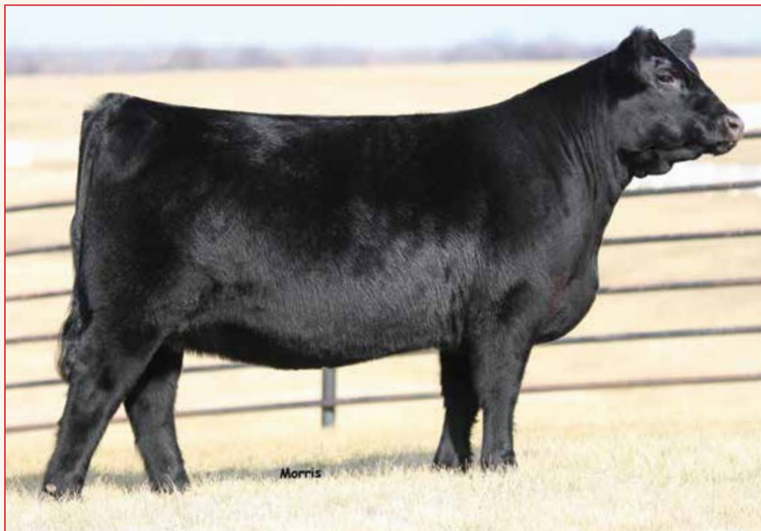
AUTO CHAPERALL 406C ET • Dam of Lot 26