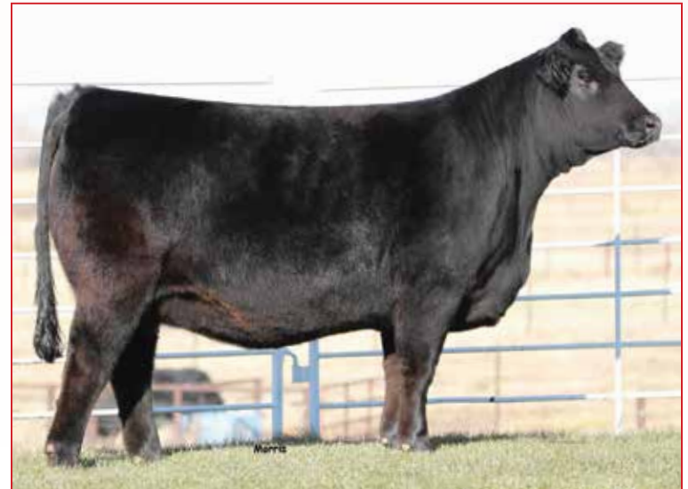
MAGS ETERNAL FLAME 580E • Dam of Lots 36A & 36B

Form and function are built into this FWLY LHC Capital son out of the proven donor MAGS Eternal Flame. ATAK Knuckle is a double homozygous 71% Lim-Flex. We appreciate this bull for his length and muscle shape, and his impressive numerical profile. Make sure to circle him in your catalog and look him up sale day!