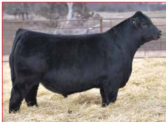
CELL KILIMANJARO 2218K ET • Sire of Lot 4B

CELL 7215E ET hails from two of the most impressive individuals in the Limousin breed. Her sire, AHCC Cowboy Kind C595, is a known producer of powerful herd sires and deep, broody daughters. Her dam, EF Xpect The Best, has captured many hearts as she continues to produce progeny that have continuously found their way to the winners circle. The blending of these greats has created the stunning female. She is a beautifully designed 62% Lim-Flex that is homozygous polled. Her pedigree is solid from top to bottom providing exciting opportunities that meshes nicely with her well-balanced numerical profile.