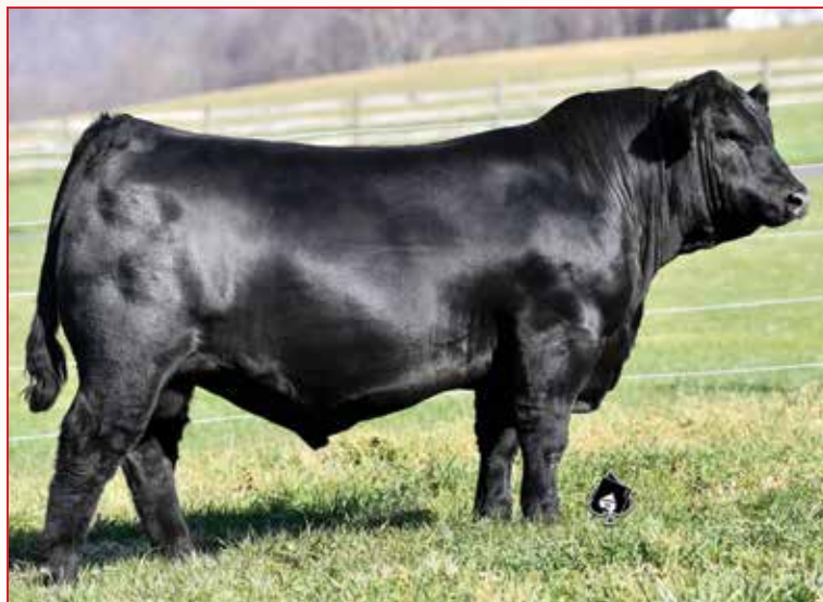
TMCK HUMVEE 767H ET • Sire of Lot 21

Check out this young miss. ATAK Kaia is an exciting 50% Lim-Flex. With her pedigree, you know you'll have years of exciting producing ability. Plus, she offers a functional set of numbers. This sound-moving female is straight in her top with a square hip design and smooth shoulder. She sells bred to MAGS Hedge Fund, the 50% Lim-Flex son of MAGS Federal Reserve x MAGS Andrea. He is double homozygous with a top 20% for Milk and top 10% for Marbling.