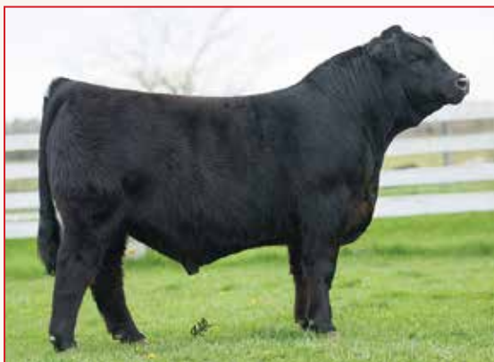
FWLY LHC CAPITAL ET • Sire of Lot 54