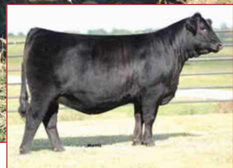
AUTO MOONSHINE 280B ET Maternal grandam of Lot 13