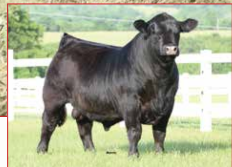
FWLY LHC CAPITAL ET • Sire of Lot 7