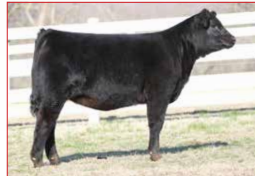
MINO KALAMITY JANE 052K • Daughter of Lot 1