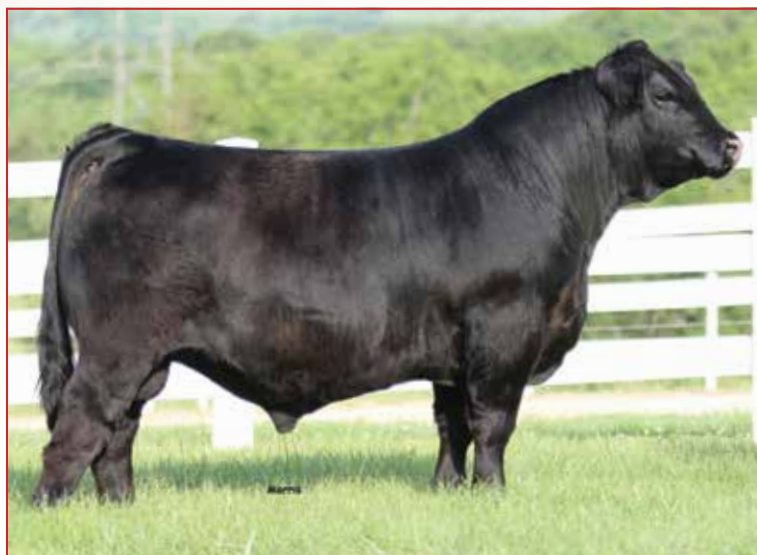
FWLY LHC CAPITAL ET • Sire of Lots 36A &amp; 36B