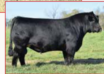
CJSL DAUNTLESS 6257D