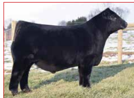
TASF HEINEKEN 405H • Service sire to Lot 27