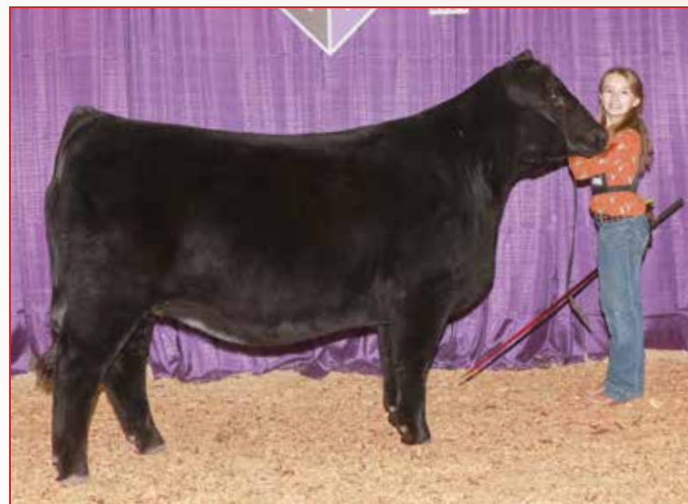
SEEE KRIS' PINA COLADA ET • Dam of Lots 5A & 5B

The sire of this mating is TASF Heineken 405H ET, the top-selling $44,500 lot in the 2021 Thomas & Son Farms New Year's Resolution Online Bull Sale. He is a double homozygous son of TASF Crown Royal 960C and out of Pleasant Valley Elsa 1439. TASF Crown Royal 960C is the highly renowned son of DHVO Deuce 132R and TASF Whiskey Lullaby 357W. TASF Heineken 405H ET's dam is a daughter of EXAR Classen 1422B. From a phenotypic standpoint he is big footed, relaxed in his pasterns and excellent when you set him in motion. Numerically, he ranks in the top half of the breed or better in some of the most relevant traits in the industry today—weaning weight, yearling weight, carcass weight, ribeye, marbling and mainstream terminal index.