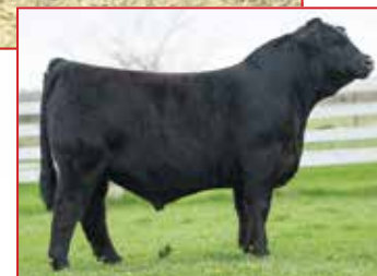
FWLY LHC CAPITAL ET • Sire of Lot 9