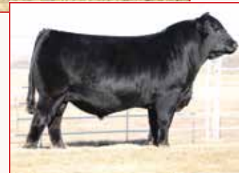
MAGS FIRESTONE 218F • Sire of Lot 14