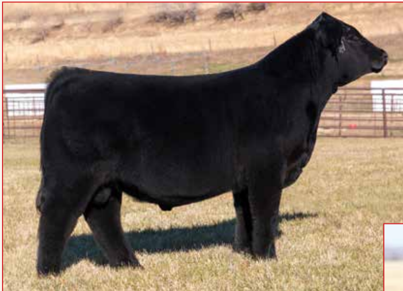
KLS SULL CHARMER ET • Sire of Lot 2