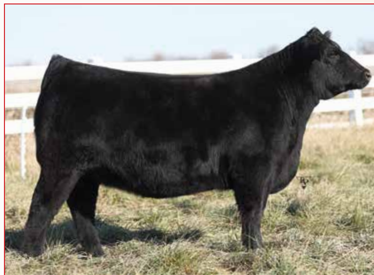
CELL JAZZY 1572J • Dam of Lot 3

The sire of this mating is TASF Heineken 405H ET, the top-selling $44,500 lot in the 2021 Thomas & Son Farms New Year's Resolution Online Bull Sale. He is a double homozygous son of TASF Crown Royal 960C and out of Pleasant Valley Elsa 1439. TASF Crown Royal 960C is the highly renowned son of DHVO Deuce 132R and TASF Whiskey Lullaby 357W. TASF Heineken 405H ET's dam is a daughter of EXAR Classen 1422B. From a phenotypic standpoint he is big footed, relaxed in his pasterns and excellent when you set him in motion. Numerically, he ranks in the top half of the breed or better in some of the most relevant traits in the industry today—weaning weight, yearling weight, carcass weight, ribeye, marbling and mainstream terminal index.