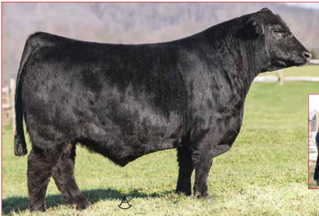
CJSJ CREED 5042C • Sire of Lot 31