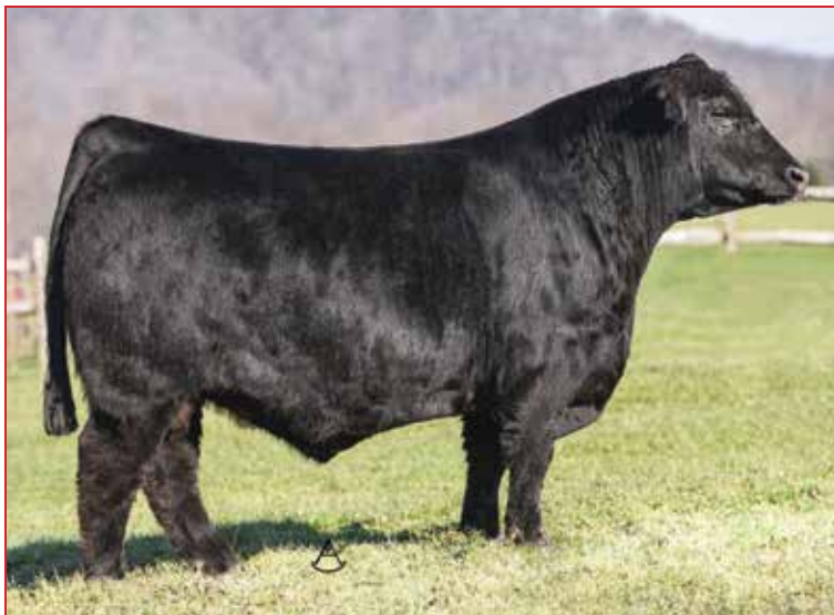
CJSL CREED 5042C • Sire of Lots 16, 17 & 19