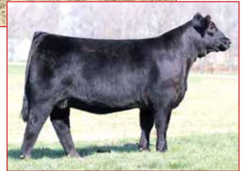
AUTO POPPY 421Z • Dam of Lot 35