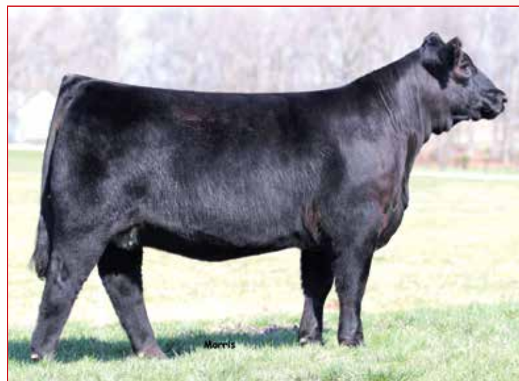
AUTO POPPY 421Z • Maternal grandam of Lot 24

ATAK Koil is a homozygous polled, 53% Lim-Flex female that offers length of body, massive rib shape and a wide top. She has an elegant head and neck and is sure to have attractive progeny. She's the kind we strive to make, and we are excited to see what she will do in someone else's herd. She sells bred to MAGS Hedge Fund, the 50% Lim-Flex son of MAGS Federal Reserve x MAGS Andrea. He is double homozygous with a top 20% for Milk and top 10% for Marbling.