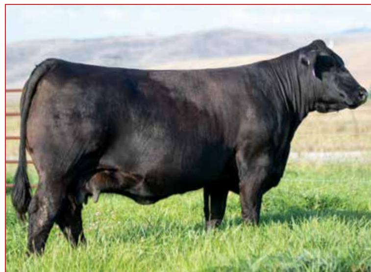
COLE MISS ZAM 6112D • Dam of Lots 16 &amp; 17

Here is a tremendous quality female with cow power and massive overall dimension. She is robust through her center body, unbelievably strong in her top, and flat out good from all angles. They don't make them like this every day. She is sired by CJSL Creed 5042C, the proven MAGS Aviator son. This female deserves some serious attention.