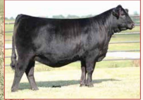
AUTO MOONSHINE 280B ET Paternal grandam of Lot 40