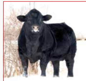
TMCK DURHAM WHEAT 6030X Sire of Lot 28