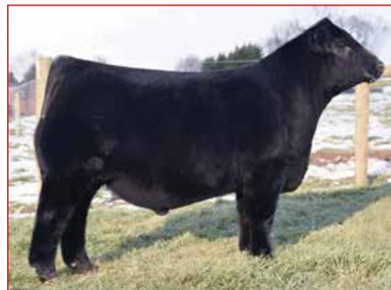
TASF HEINEKEN 405H • Sire of Lot 5B