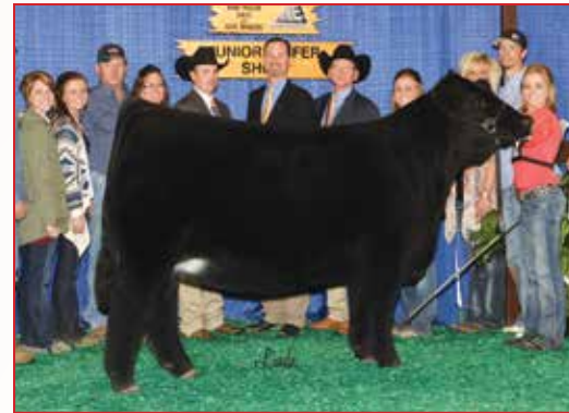
RIVERSTONE CHARMED • Paternal grandam to Lot 2