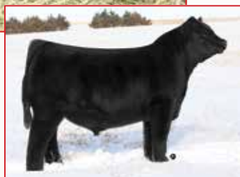
SCHILLING HALAS ET • Sire of Lot 8