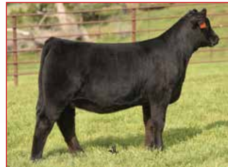
CELL LEXI 3110L • Paternal sib to Lot 35