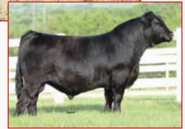
FWLY LHC CAPITAL ET • Sire of Lot 10