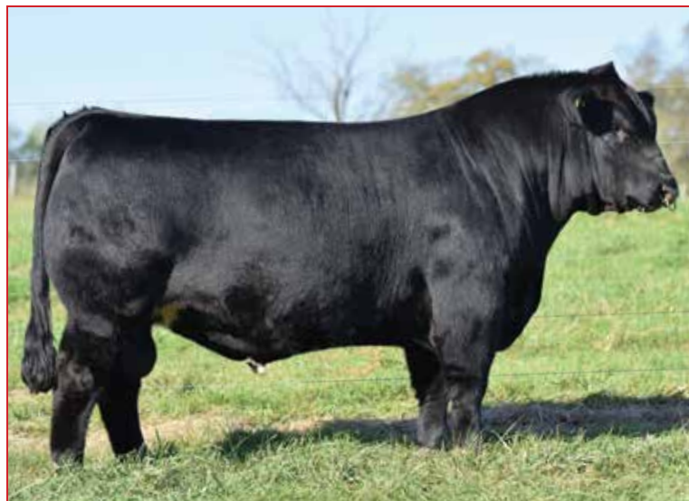
CJS� DAUNTLESS 6257D • Sire of Lot 15