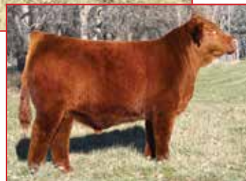
ROYAL JESTER RBGL 103J • Sire of Lot 11