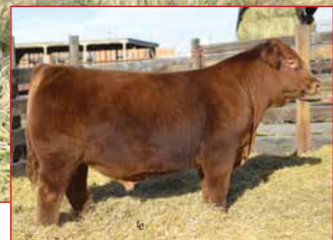
AHCC COWBOY KIND C595 ET Maternal grandsire of Lot 12