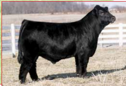
FWLY CAN DO • Maternal sib to Lot 1