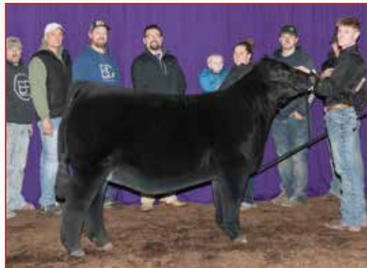
Full sib to Lot 2