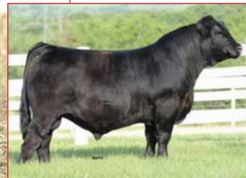
FWLY LHC CAPITAL ET Sire of Lots 37 & 38