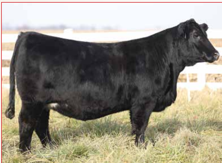
ATAK KARMA • Maternal sib to Lots 4A & 4B