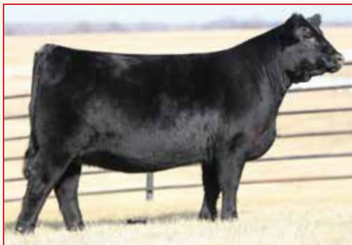
AUTO CHAPERALL 406C ET