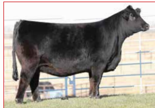
MAGS ETERNAL FLAME 580E