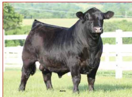
FWLY LHC CAPITAL ET • Sire of Lot 3A