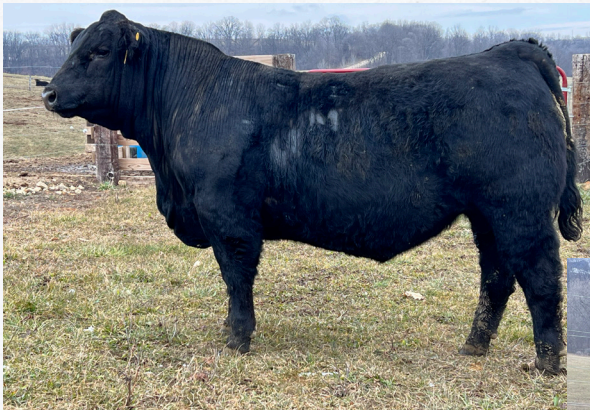
SPRING CREEKS LEGEND 9021L