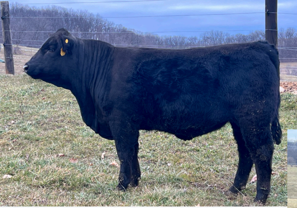
SPRING CREEKS LITTLE POWER