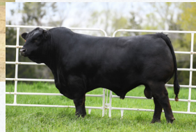
WULFS EISENHOWER 3616E