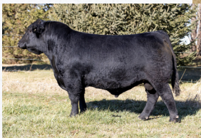
JBV YELLOWSTONE 901G