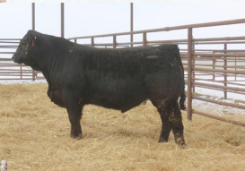
WULFS ENDEAVOR C703E