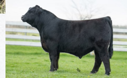
FWLY LHC CAPITAL SIRE