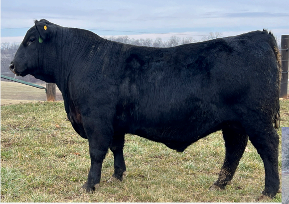
SPRING CREEKS Iconic 9055