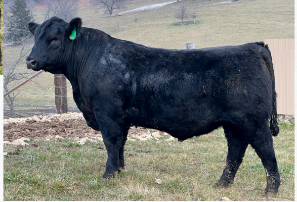
SPRING CREEKS Do It Again 7909