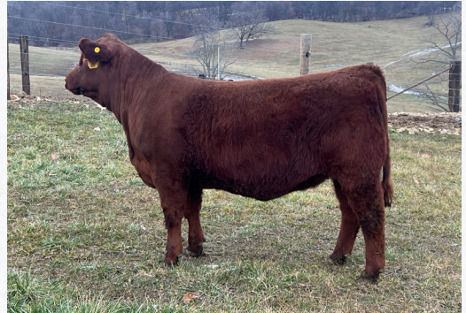
SPRING CREEKS LOVELY ONE

This one offers a ton of versatility, that you won't want to miss sale day!