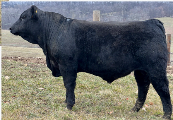
SPRING CREEKS LEARN IT