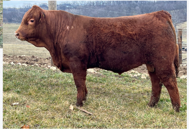
SPRING CREEKS LEAVE IT ON