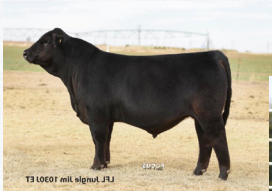
LFL JUNGLE JIM 1030J ET