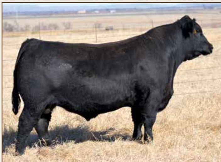
LFL GENETIC VALUES 9148G • SIRE OF LOT 19