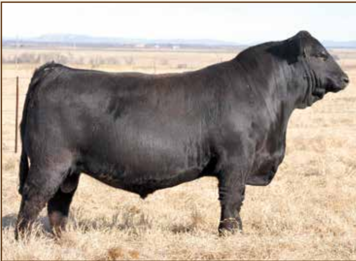
CHR GOOD FELLA 137G • SIRE OF LOTS 74 & 75