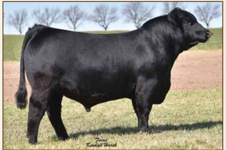
LFL ELLIS 7303E • 6 SONS SELL!