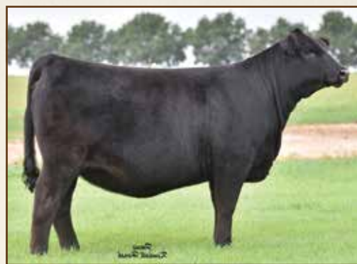
LFL GEORGIE GIRL 9013G ET • DAM OF LOTS 1 & 2