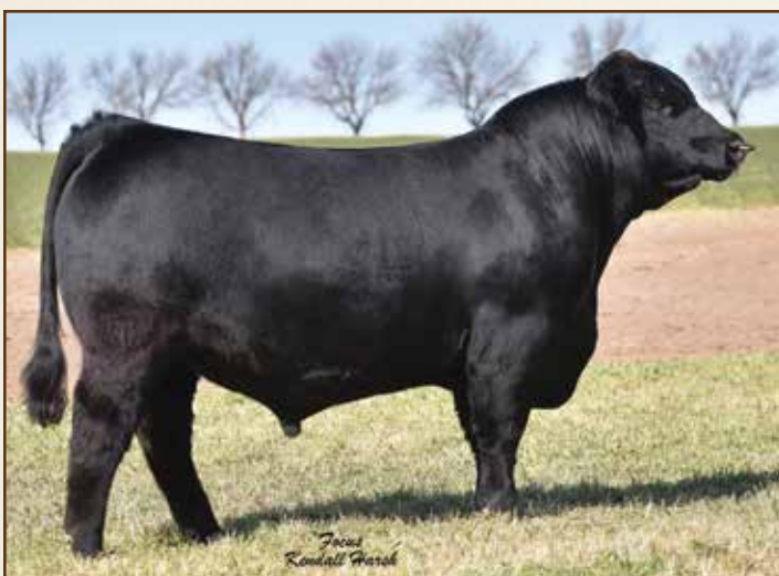
LFL ELLIS 7303E ET • SIRE OF LOT 45