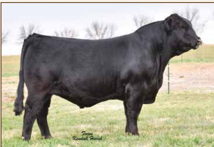
LFL DIVIDEND 6084D • 5 SONS SELL!