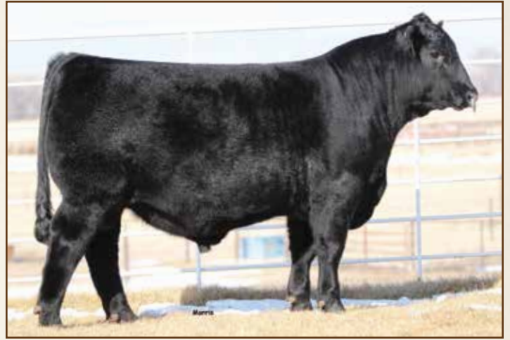
MAGS FAULTLESS 154F • 4 SONS SELL!