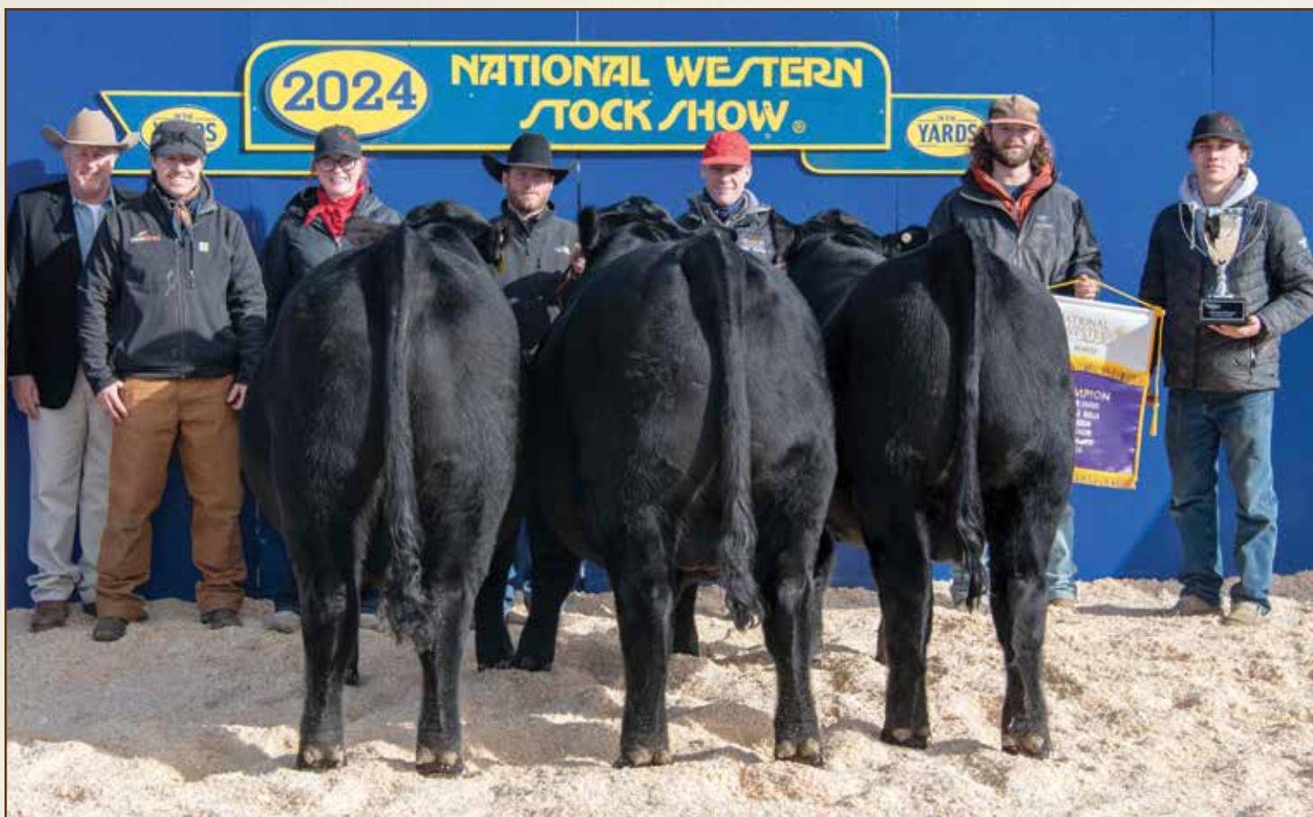
2024 NATIONAL WESTERN STOCK SHOW GRAND CHAMPION LIM-FLEX PEN