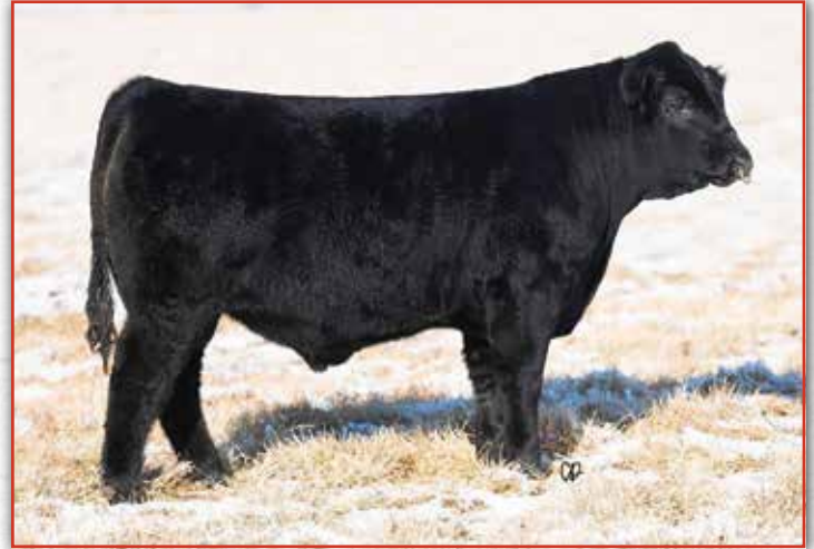
LEWIS GRAVITY FLOW G62 • SIRE OF LOT 19

Get ready for takeoff! SYES Launcher 97L is a red-hided son of Lewis Gravity Flow G62 out of a Wulfs Apostle T343A daughter. He has a pleasing look with added muscle and rib. Take note if his impressive EPD profile. He ranks in the top 1% for milk and docility, top 4% for ribeye area and top 10% for scrotal and yield grade.