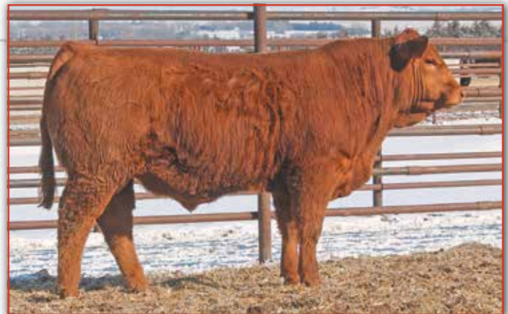
WULFS DEVILS LAKE K118D ET • SIRE OF LOT 80

Another incredible Wulfs Devils Lake son! SYES Kitsch ranks in the top 15% for marbling. This homozygous polled, black-hided herd sire prospect does a lot of things right. Find him sale day.