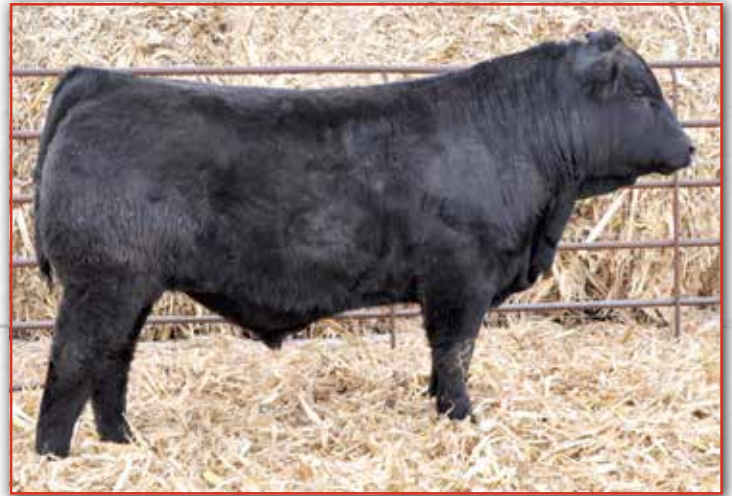
L7 GENUINE VISION 9033G • SIRE OF LOT 100

Miss SYES Gen Vision will be a production machine. She is double homozygous and totes a balanced set of EPDs. This purebred daughter of L7 Genuine Vision comes from our Miss SYES Easy Going 369H female who doesn't miss. These genetics are good, don't miss them.