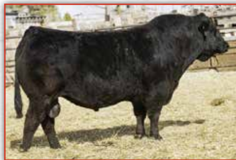
SYES ENCORE 315E