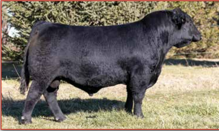
JBV YELLOWSTONE 901G • SIRE OF LOT 74