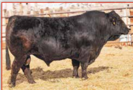
SYES EASY GOING 77E