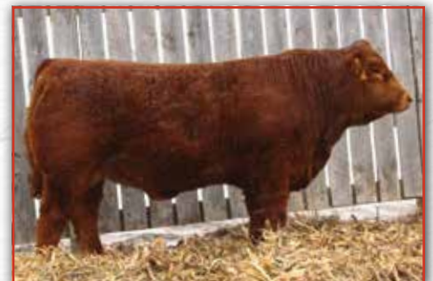
SYES JOHN DOE 123J