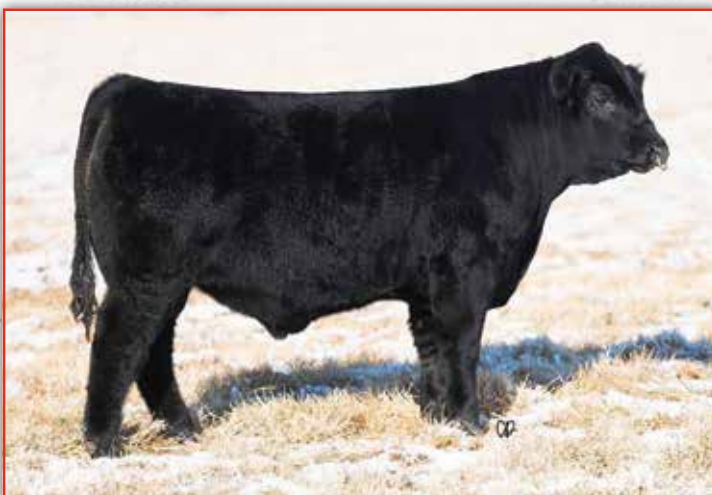
LEWIS GRAVITY FLOW G62 • SIRE OF LOT 97

Miss SYES John Doe is a purebred daughter of SYES John Doe out of our Miss SYES Ex Chunk 192J cow that we think a lot of. This red-hided female is long featured and sound made. She ranks in the top 10% for calving ease maternal and top 15% of the breed for calving ease and birth weight.