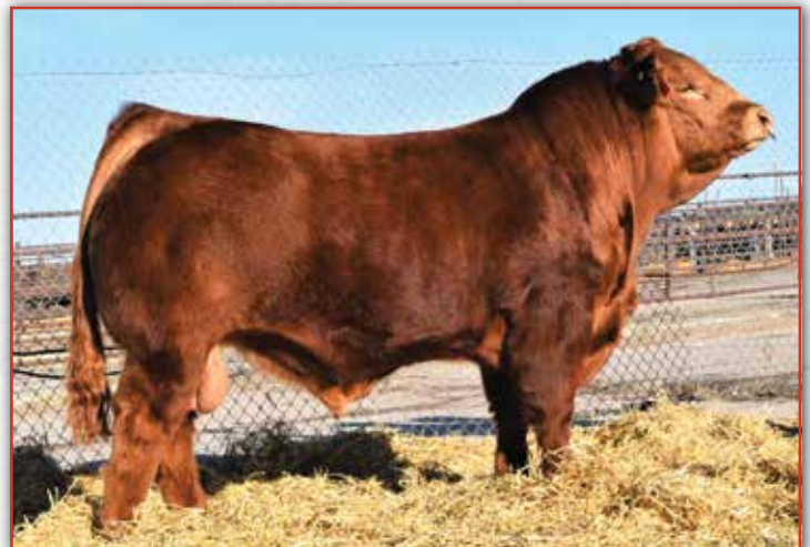
JYF EXTRA CHUNK 518E • SIRE OF LOT 15

Check out this muscled up bull. SYES Leatherman is a homozygous polled, red-hided JYF Extra Chunk 518E son from a GV Big Timer 328E daughter. Leatherman is a strong candidate for transmitting elite growth to his calf crop with top 30% rankings for weaning weight, yearling weight and scrotal EPDs. What's more, he ranks in the top 10% for yield grade and mainstream terminal index, top 15% for marbling and top 20% for ribeye area. He is desirable in his design with a strong top, great hip and sound structure.