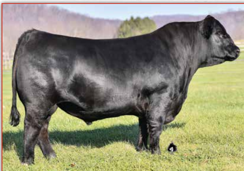
COLE GENESIS 86G • SIRE OF LOT 1

Member of 2024 National Western Grand Champion Division VI Pen of Limousin Bulls. Leading off our 44th Annual Sale is SYES Landmark 875L. This homozygous black son of COLE Genesis 86G is out of a fantastic LFLC Denver 857D daughter. This is a great bull to start off our 2024 offering. Landmark is stout in his features with a big, square hip and lots of muscle shape that ties down nicely to his quarter. With added depth of rib and flank and a smooth shoulder, this herd-sire prospect will serve his new owners well for years to come. When you factor in his breed-leading numerical profile you really start to get excited! He ranks in the top 10% for yearling weight, calving ease maternal and mainstream terminal index; top 15% for weaning weight and marbling and ranks in the top 20% for milk and carcass weight. There is a lot to like about this bull. With his powerful phenotype, genotype and lineage, he offers you a package capable of adding value!