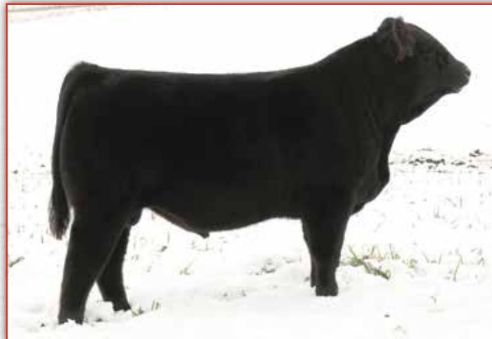
RMKR HERCULES 020H • SIRE OF LOT 106

Miss SYES Hercules packs a solid, uniform set of EPDs into a homozygous polled, purebred package. This is a female you won't want to miss out on. She brings several industry relevant traits to the table, allowing her to work in a magnitude of programs. Don't miss her.