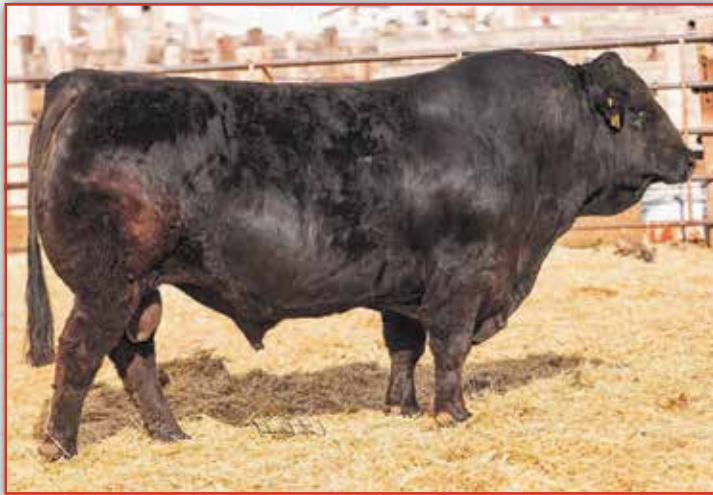
SYES EASY GOING 77E • SIRE OF LOT 30