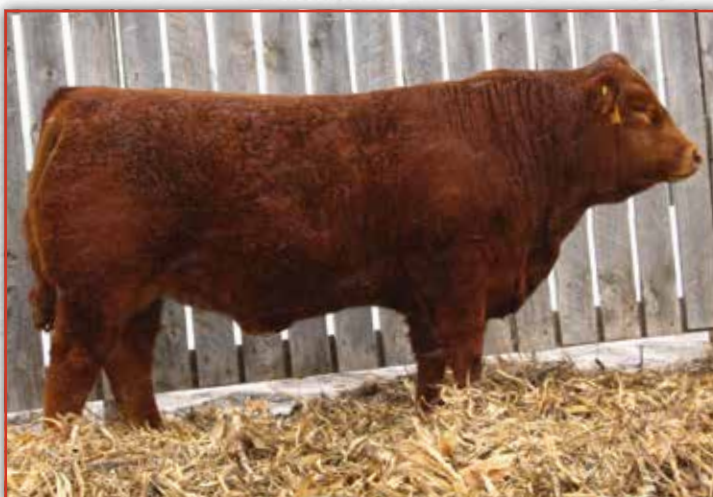
SYES JOHN DOE 123J • SIRE OF LOT 32

Top 10% rank for calving ease here! This SYES John Doe 123J son is impressive across his EPD data ranking in the top 10% for calving ease, ribeye area and calving ease maternal, top 15% for docility and calving ease maternal and top 20% for yield grade. From a GV Big Timer 328E daughter, SYES Longrange 546L is a homozygous polled, red bull who is moderate in his birth weight.