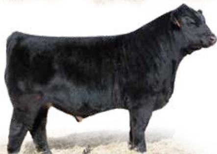
CJSL DAUNTLESS 6257D ET