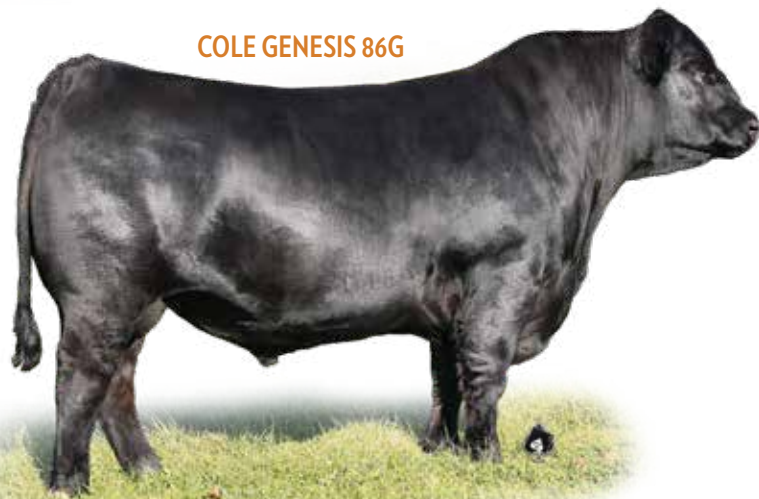
COLE GENESIS 86G