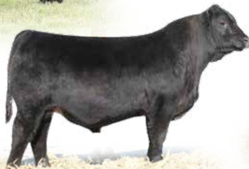
LVLS FULL DUTY 2201F