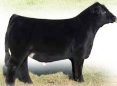
RATLIFF JUMP START 340J ET