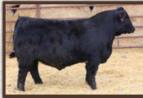
AHCC HANDYMAN 831H