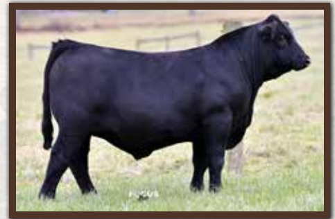
TMCK SKYNARD 824J