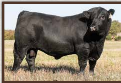
HBRL GATEWAY 9511G