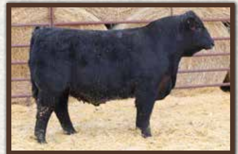
AHCC HIGH STAKES 376H