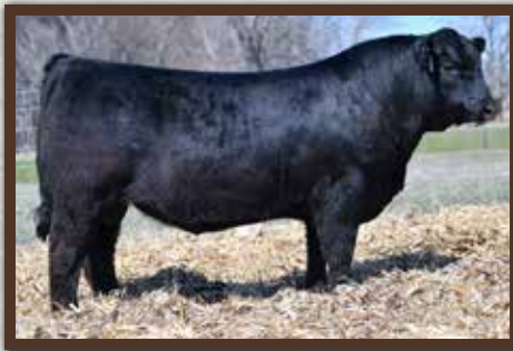
WULFS GAMEBOY C911G ET