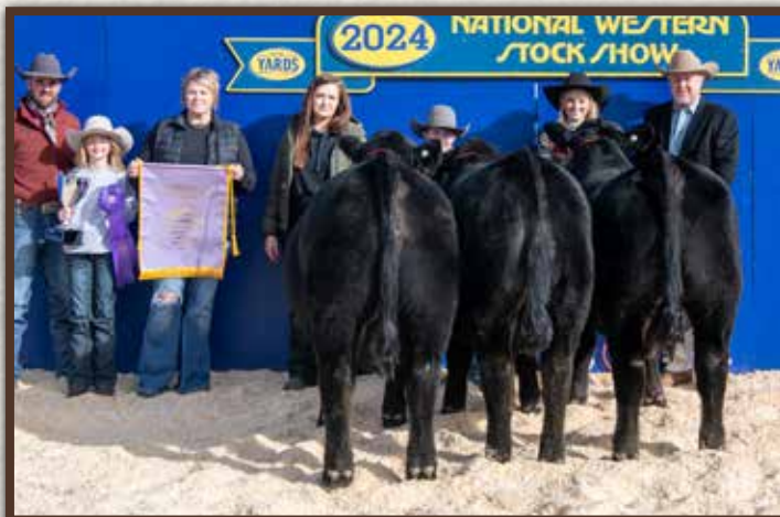
2024 NWSS RESERVE PEN OF THREE LIM-FLEX BULLS

It is with great excitement that we offer this genetic opportunity on AHCC Land Shark 9624L, a bull that has created a lot of chatter amongst breeders around the nation! Land Shark was recently the lead off bull of our 2024 Reserve Champion Pen of Lim-Flex Bulls at the National Western Stock Show. When displayed in Denver, Colorado, many cattlemen admired him for his eye-catching phenotype. He combines athleticism, muscle expression, bone, length of body, power and mass – all while maintaining a masculine look. It is challenging to find double homozygous cattle as complete and intriguing as this future herd sire. He is a son of Wulfs Gameboy C911G, the high seller in the 2020 Wulf Cattle Opportunity Sale and popular A.I. sire, proven to transmit eye-catching phenotypes. His dam is a moderate made, functionally patterned female that is perfect in terms of her utter quality and foot shape. On paper, he boasts exceptional growth and performance figures, ranking in the top 1% for weaning weight and total maternal. Continue to study his EPDs to find a top 2% ranking for yearling weight and top 5% for mainstream terminal index. Also, take note of his impressive carcass merit. Don't miss out on your chance to purchase semen on a remarkable individual that will predictably advance your breeding program to new heights. We feel AHCC Land Shark 9624L as an A.I. sire will unite real-world values with a look cattlemen demand.