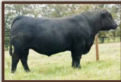
AHCC EASY RIDER 5594E