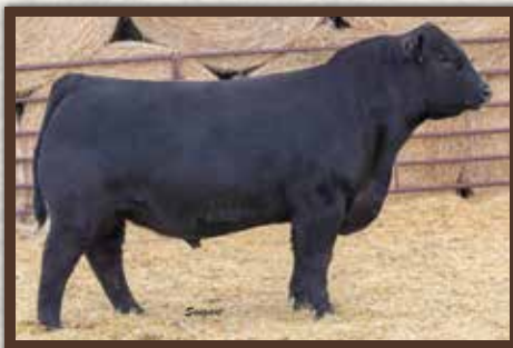
MAGS FEDERAL RESERVE ET