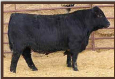
AHCC HARVESTER 834H