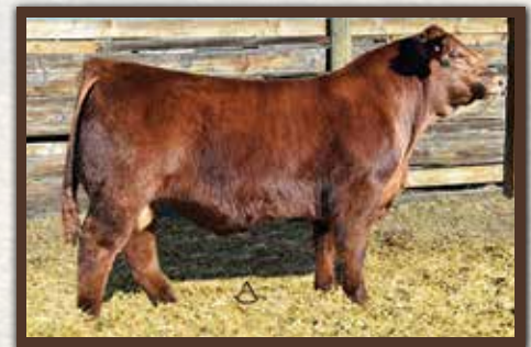
WULFS EDGE 5045E