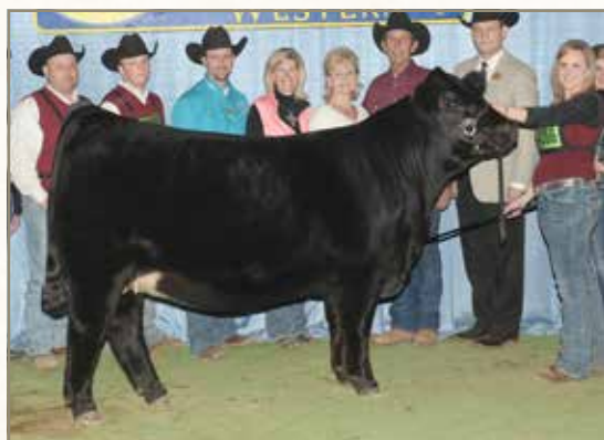
AUTO AMERIE • Great grandam of Lots 1 & 2