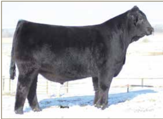
MAGS AVIATOR • Maternal grandsire of Lots 26 & 27