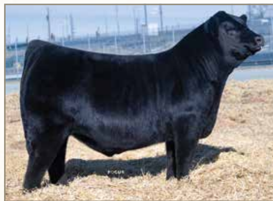
OLIM KEYSTONE • Maternal brother to Lot 1