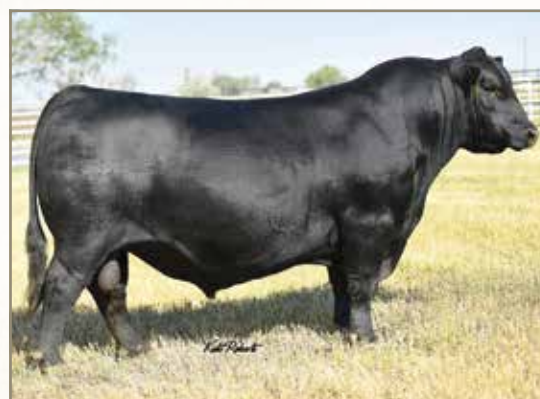
DB ICONIC G95 • Sire of Lot 5