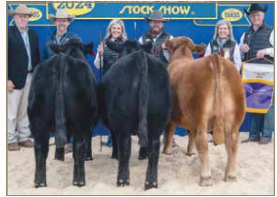
2024 NWSS CHAMPION LIMOUSIN PEN