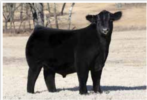
CONLEY A 1 $100,000 Sire of Lots 42 & 43