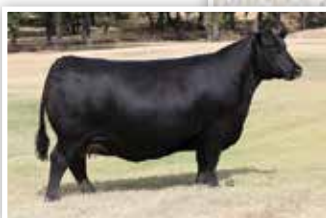
CONLEY SANDY 7350 $90,000 Granddaughter of K N C Cabin Creek Sandy 804