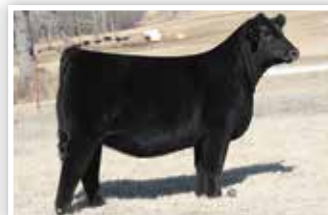
CONLEY DT SANDY 1078 Maternal Sister to Lots 9 & 10