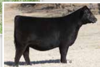
CONLEY DT SANDY 1056 $35,000 Maternal Sister to Lots 9 & 10

• This female has the build and genetic lineage to go the distance! Invest in the future of your breeding program with the addition of a female of this caliber that has the potential to follow in the footsteps of the females that line her pedigree!