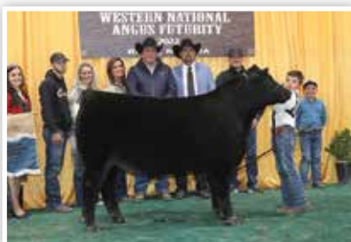
CONLEY JR 1229 2022 WNAF Grand Champion Market Steer & Maternal Brother to Lots 18-27