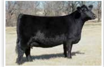
CONLEY SANDY 5104 Full Sister to Lot 65 Embryos