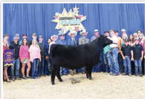
CONLEY DT GEORGINA 1076 2023 NJAS Grand Champion Angus Heifer Product of the "Georgina" cow family!