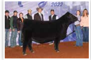
DIECKMANN LADY 1117 Dam of Lot 61 Embryos