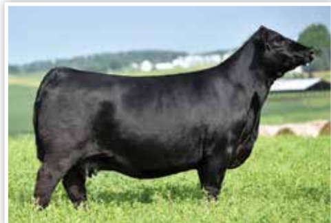
BCII SANDY 1315 Maternal Granddam of Lots 12-15