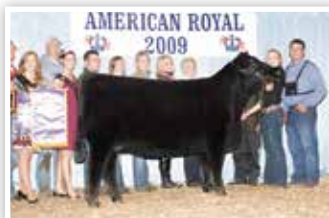
K N C CABIN CREEK SANDY 804 Legendary Maternal Granddam of Lots 4-10