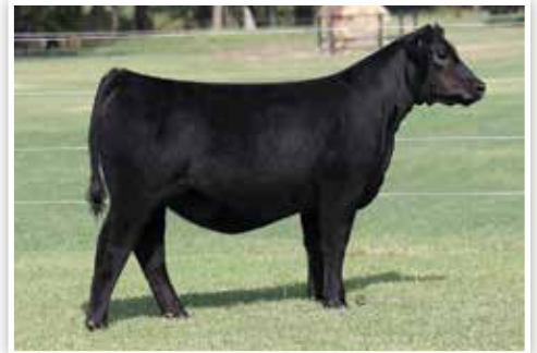
CONLEY MADDIE 3176 Full Sister to Lots 19-27