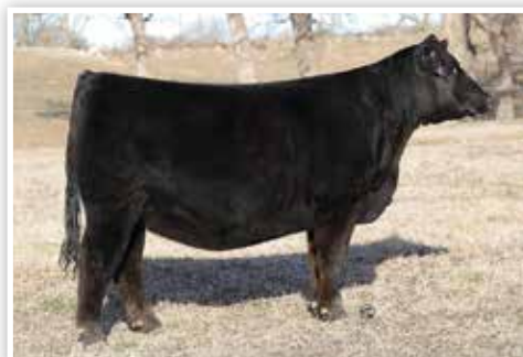
BBPB PIO LASS 1094 $10,000 Maternal Sister to Lot 41