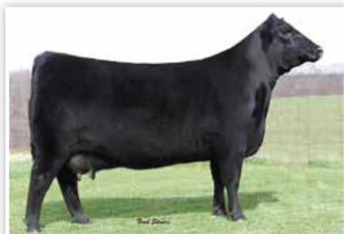
CHAMPION HILL GEORGINA 8547 Dam of Lots 33-35