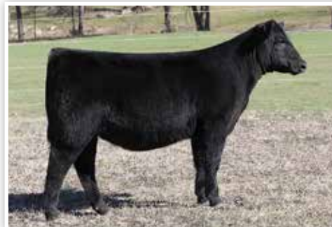
CONLEY DT LUCY 2556 Full Sister to Lot 40