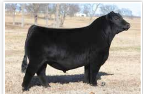
CONLEY DS CLEAR CUT 0510 $400,000 Valuation Sire of Lots 19-27