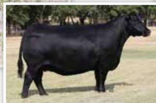
CONLEY SANDY 8104 $75,000 Maternal Sister to Lots 9 & 10