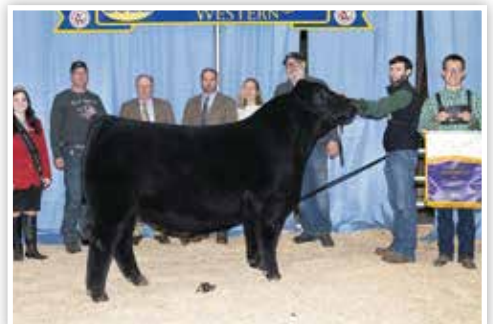
CONLEY DS CLEAR CUT 0510 2022 NWSS Grand Champion Angus Bull & Sire of Lots 19-27