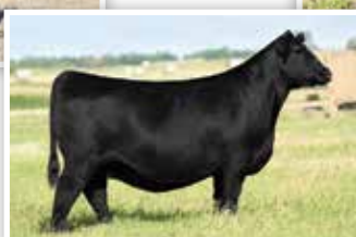
HOFFMAN PEG 9539 Full Sister to Dam of Lot 47