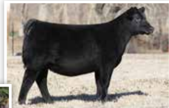
CONLEY DT SANDY 2507 $23,000 Maternal Sister to Lots 9 & 10

• This female's pedigree aligns some of the highest dollar generating females in the Angus breed!