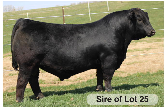
Sire of Lot 25

A real nice high percent, homo polled, red son of Just One. He offers calving ease and performance. This big topped, massive middled bull ratioed a 111 for REA.