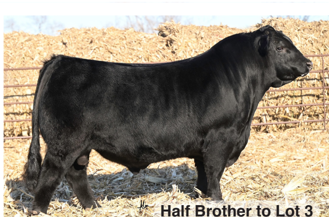
Half Brother to Lot 3

A curve bending bull that's a half brother to this years BHSS People's Choice Supreme Champion Bull, L7 Koko. This high percentage, homo polled, homo black bull tipped the scales at over 700 at weaning and 1400 at yearling. He ranks in top 30% in 10 traits and ratioed a 109 for marbling. If your looking for something with a bit of a genetic twist give this guy a look!