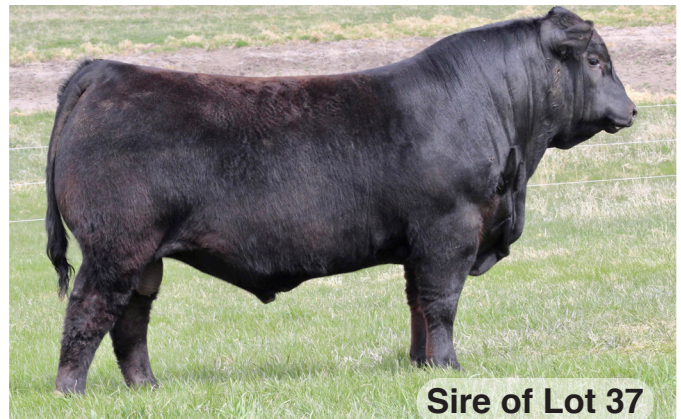
Sire of Lot 37

A good looking purebred son of L7 Humdinger. Long made and big topped, going back to our popular 557 female.