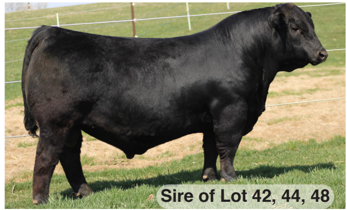
Sire of Lot 42, 44, 48

Another solid made Just One son that is homo polled. A high performing bull that ranks in to 35% for WW, 40% for YW, and 20% for REA.