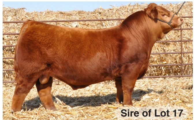
Sire of Lot 17

A long geared, high performing, heavy built L7 Huckleberry son out of a Xcellsior female that's had her fair share of good ones.