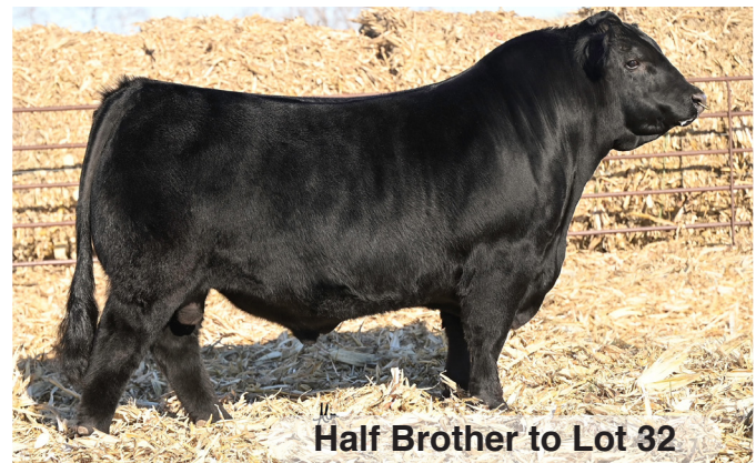
Half Brother to Lot 32

Really enjoy what the Heartland cattle have to offer. Small at birth and grow like weeds after that. Another solid homo polled, homo black son here.