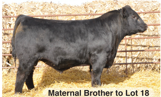
Maternal Brother to Lot 18

Exceptional homo black and homo polled Earning Power son here. Low birth, high performing bull that ratios 116 for IMF and ranks in top half for 16 traits that are highlighted by the top 1% for REA.