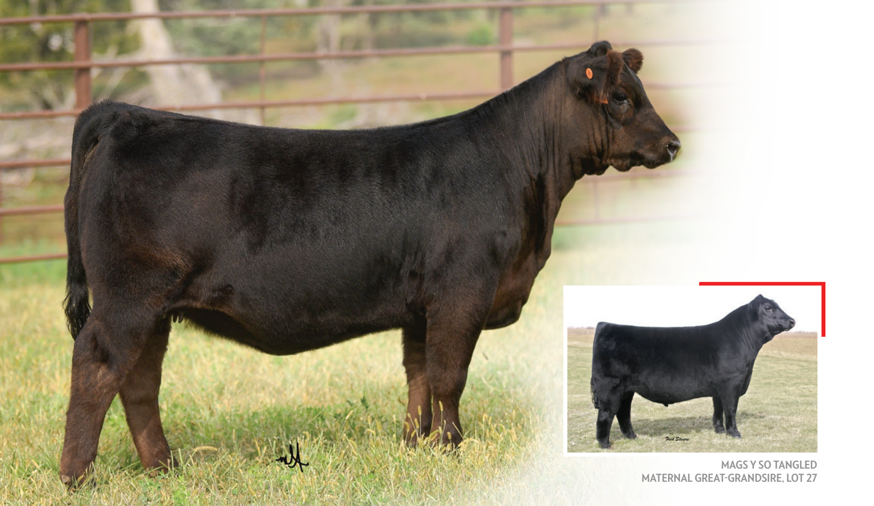
MAGS Y SO TANGLED MATERNAL GREAT-GRANDSIRE, LOT 27