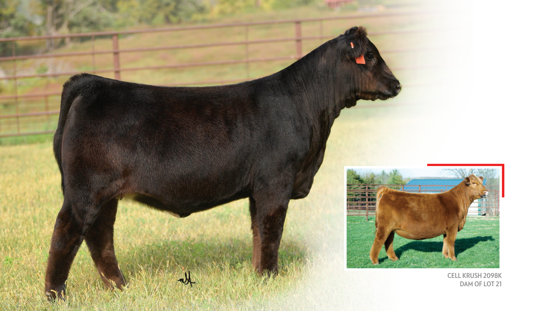
CELL KRUSH 2098K DAM OF LOT 21