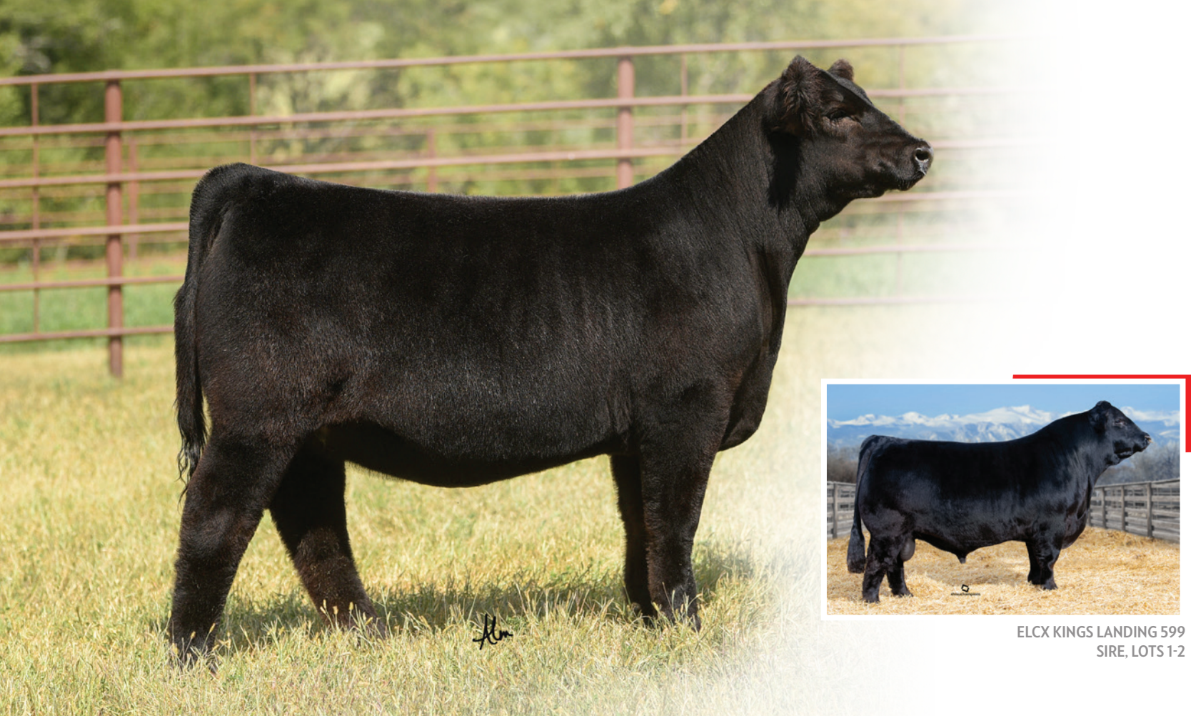
ELCX KINGS LANDING 599 SIRE, LOTS 1-2