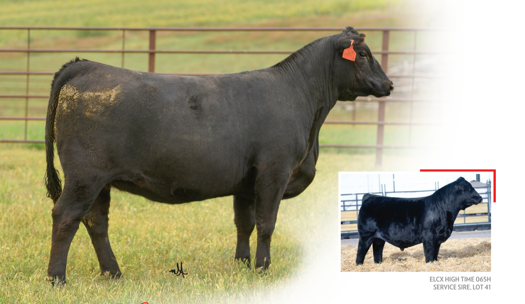
ELCX HIGH TIME 065H SERVICE SIRE, LOT 41