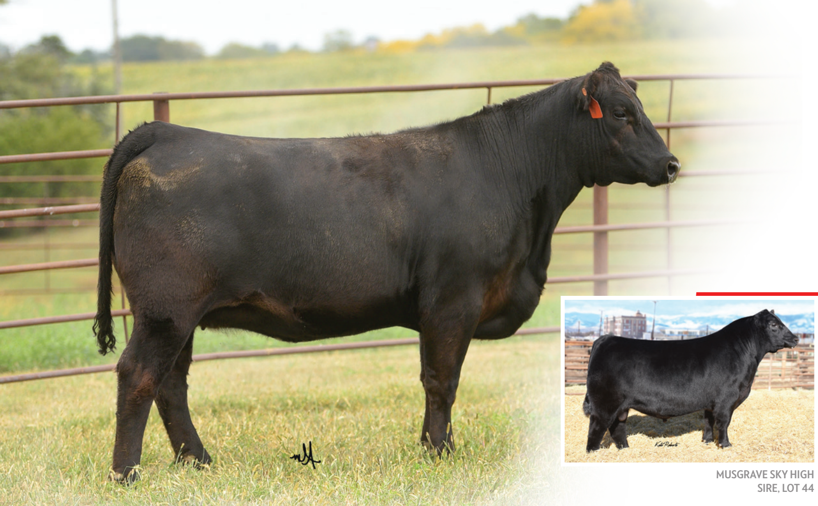
MUSGRAVE SKY HIGH SIRE, LOT 44