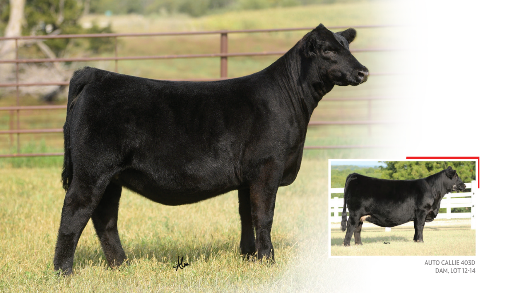
AUTO CALLIE 403D DAM, LOT 12-14