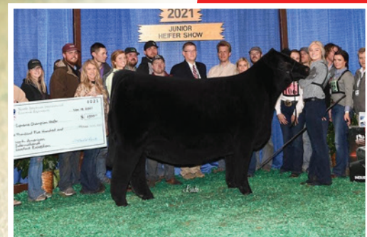
RATLIFF HOWBOUTIT RIVERSTONE CHARMED DAUGHTER SUPREME JUNIOR FEMALE, 2021 NAILE FULL SIB TO LOTS 5 & 6