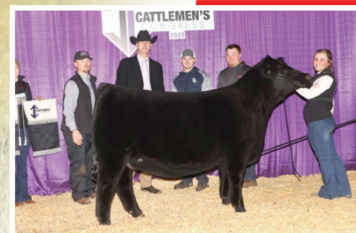
CELL 1401J SUPREME CHAMPION LIMOUSIN FEMALE 2023 CATTLEMEN'S CONGRESS MATERNAL SIB TO LOTS 1-11 FULL SIB TO LOT 11