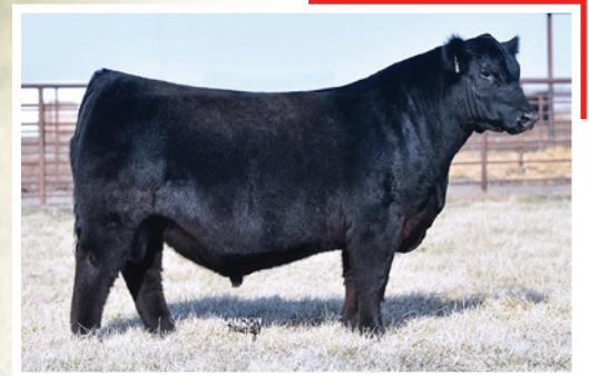
PVF DLX KING PIN 0058 SIRE, LOTS 3-4