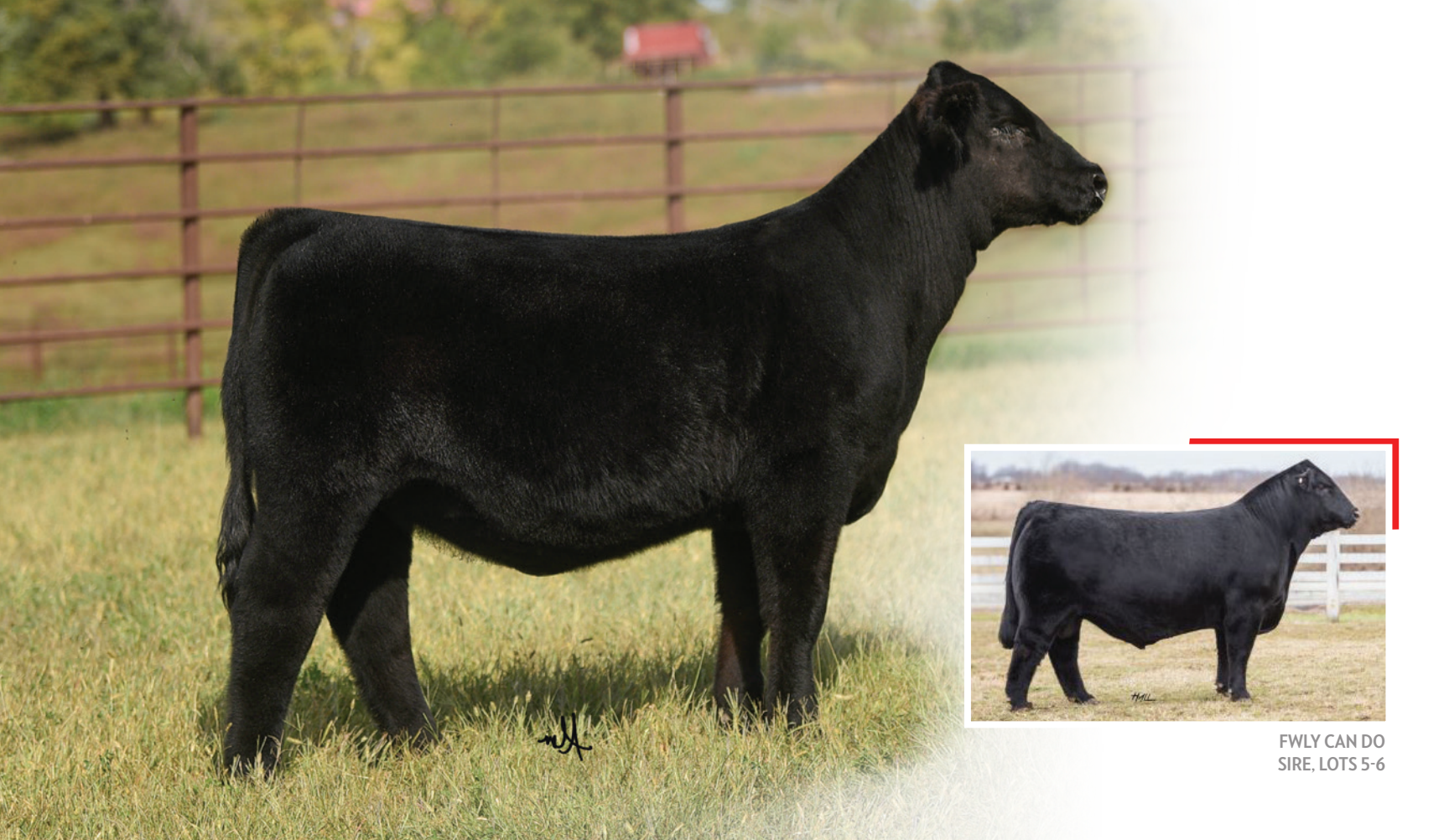
FWLY CAN DO SIRE, LOTS 5-6