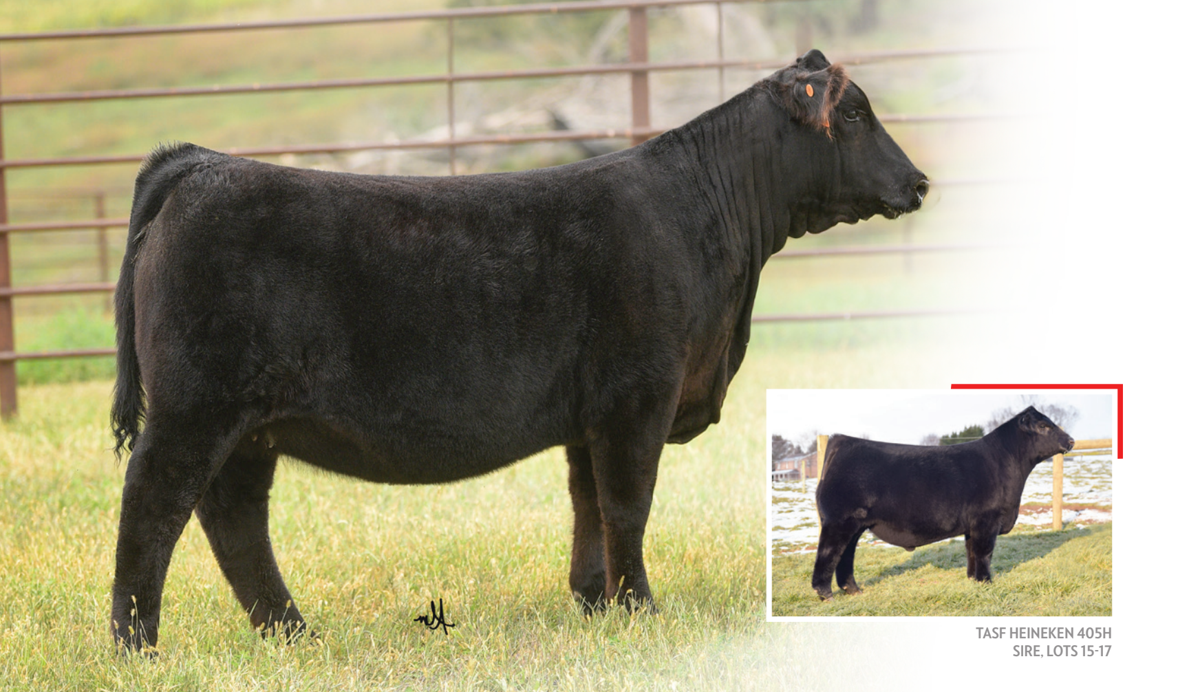
TASF HEINEKEN 405H SIRE, LOTS 15-17