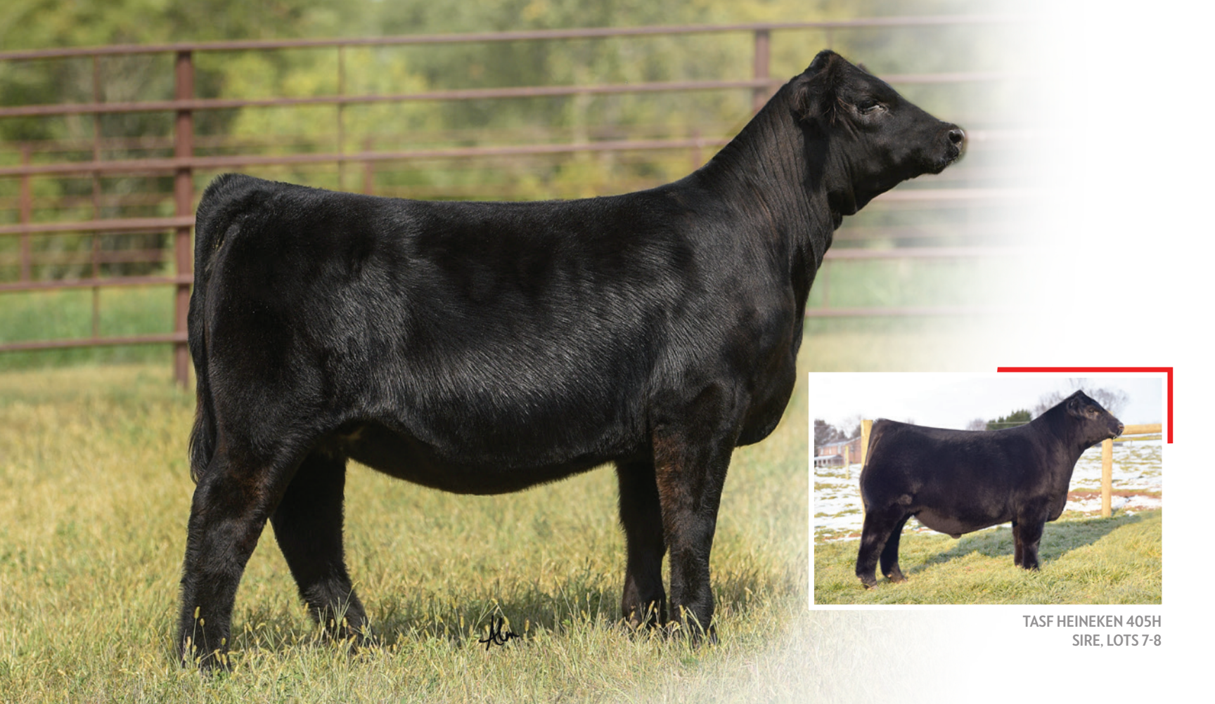
TASF HEINEKEN 405H SIRE, LOTS 7-8