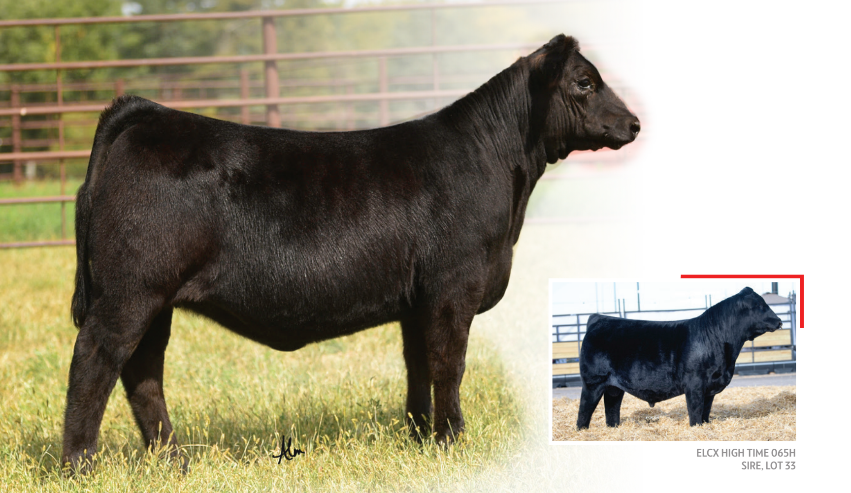
ELCX HIGH TIME 065H SIRE, LOT 33