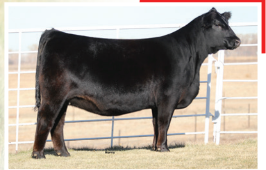
MAGS GRETE 288G DAM, LOT 30