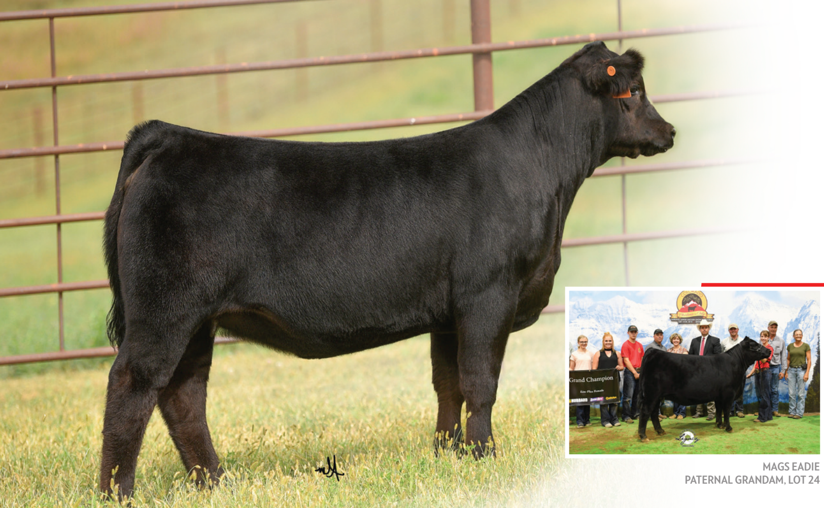
MAGS EADIE PATERNAL GRANDAM, LOT 24