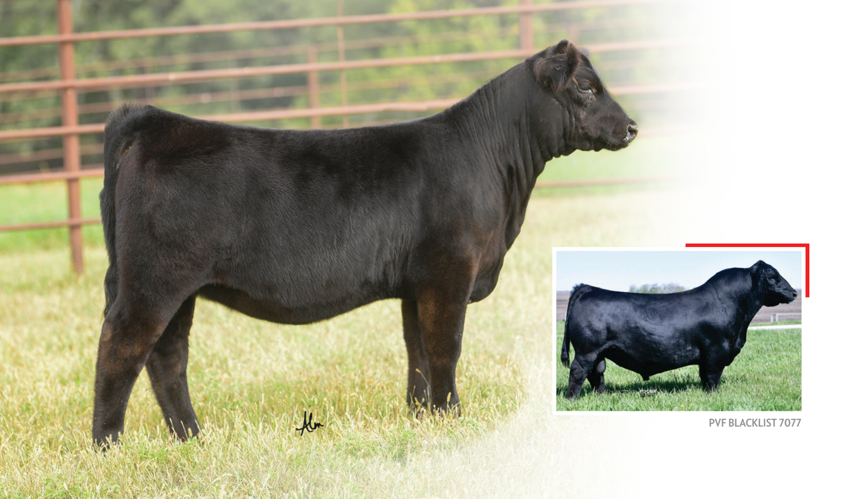
PVF BLACKLIST 7077