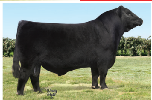
SILVEIRAS STYLE 9303 PATERNAL GRANDSIRE , LOT 18