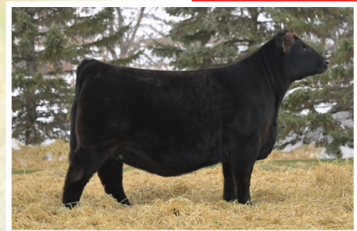
CELL KARMA 2215K HIGH-SELLING FEMALE, 2022 FALL HARVEST FULL SIB TO LOTS 9 & 10