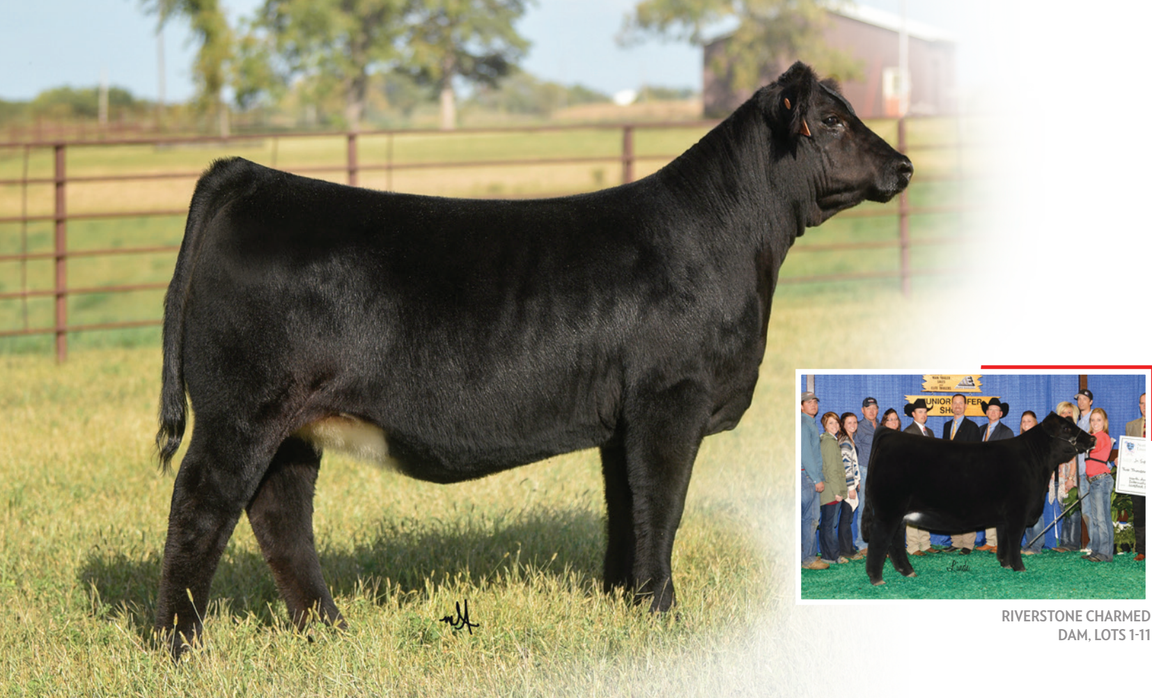
RIVERSTONE CHARMED DAM, LOTS 1-11