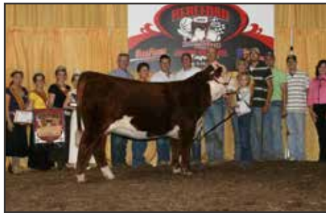
RRR L18 PENELOPE 0509 ET 2010 JNHE Grand Champion Horned Hereford Heifer 4th Generation Maternal Granddam of Lot 22