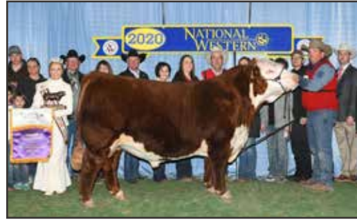
H THE PROFIT 8426 ET 2020 NWSS Grand Champion Polled Hereford Bull Sire of Lot 8