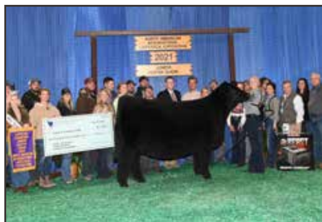
RATLIFF HOW BOUT IT 008H ET 2021 NAILE Supreme Champion Junior Breeding Heifer Maternal Sister to Dam of Lots 34-39