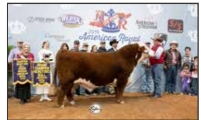
H MONTGOMERY 7437 ET 2019 American Royal Grand Champion Polled Hereford Bull Maternal Brother to Lot 13