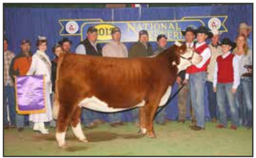
TCC MS DIANA 01 2012 NWSS Grand Champion Polled Hereford Heifer Full Sister to Maternal Granddam of Lot 7

LOT 7A | BULL CALF BORN 9/3/24 SIRED BY GKB 8123 BELLE AIR 1968 (AHA: 44305639).