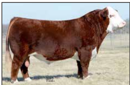
CHAC MASON 2214 Maternal Grandsire of Lot 27