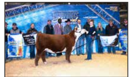
CHEZ TR LOLLIPOP 3910 ET

2016 JNHE Grand Champion Horned Hereford Heifer Dam of Lot 19