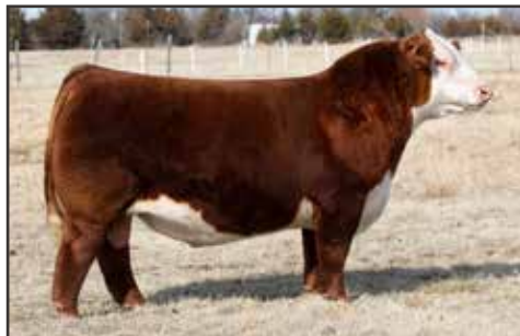
CH HIGH ROLLER 756 ET Sire of Lots 21-23