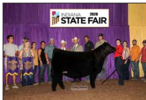
JSZC TSSC LARISSA 49G ET 2020 IN State Fair Reserve Supreme Champion Junior Breeding Heifer Maternal Sister to Dam of Lots 34-39