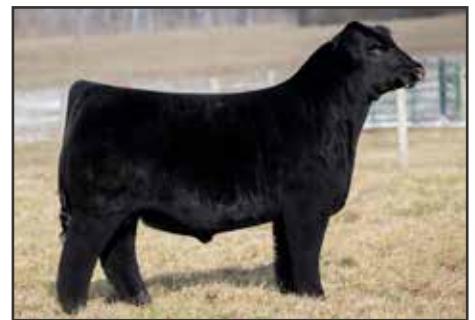
REVELATION 2K Sire of Lots 40 & 41

DAM: NOUVELLE MS SOPHIE Y83 NVL SOPHIE T83