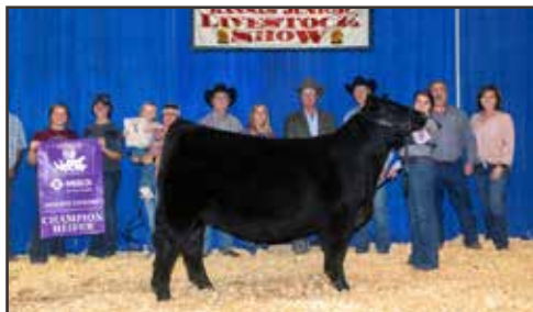
FIRES BLACK BETTY 30J Maternal Sister to Lots 34-39