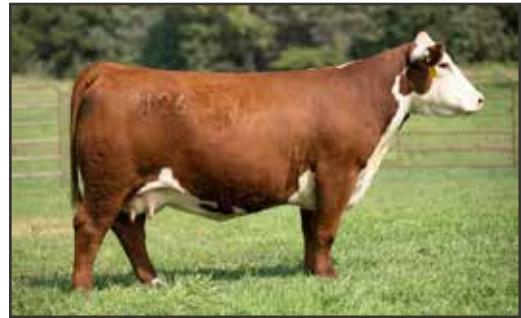
H LADY 9126 ET Dam of Lot 14

LOEWEN GENESIS G16 ET SIRE: C ARLO 2135 ET C 88X NOTICE ME 1311 ET CRR 5280 DAM: H LADY 9126 ET RST GAT NST Y79D LADY 54B ET