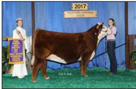
KOLT CARLY'S HARLEY 2858 ET 2017 NAILE Grand Champion Junior Hereford Heifer Full Sister to Dam of Lots 9 & 10