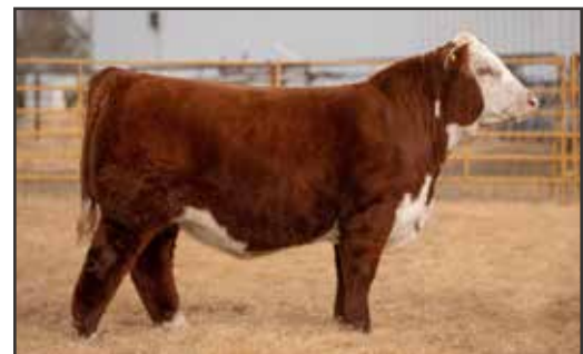
JDH AH LINCOLN 106H ET Maternal Brother to Dam of Lot 16