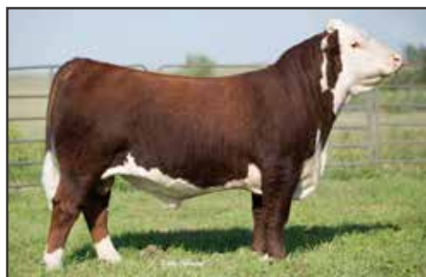
H FHF AUTHORITY 6026 ET Maternal Brother to Dam of Lot 20