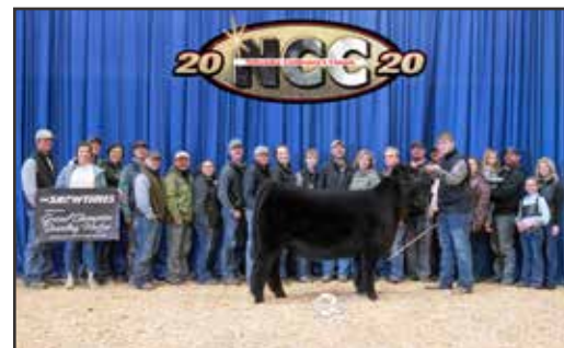
ELCX GOOD ONE 900G ET 2020 Nebraska Cattlemen's Classic Supreme Champion Junior Breeding Heifer Maternal Granddam of Lot 33

DAM: MISS ROYALTY 209K ELCX GOOD ONE 900G ET