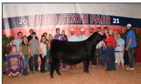
JSZC III TSSC LARISSA 101G ET 2021 OH State Fair Supreme Champion Junior Breeding Heifer Maternal Sister to Dam of Lots 34-39