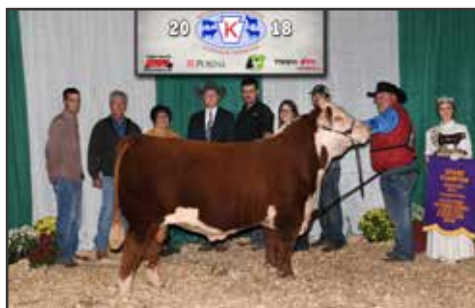
R&R FIREBALL 5086 7070 2018 KILE Grand Champion Hereford Bull Sire of Lots 26 & 27