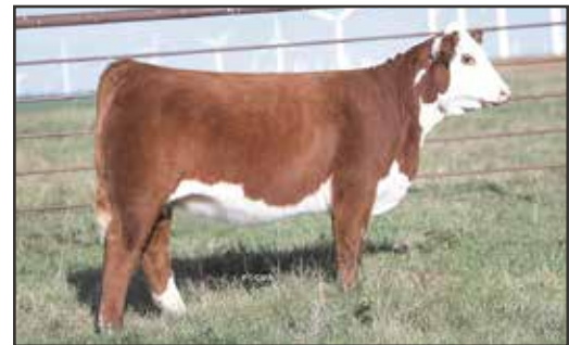
JDH AH ND 19Z 36E RITA 18J ET Dam of Lot 16