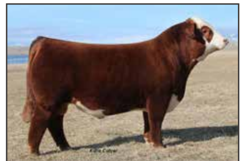
C ARLO 2135 ET $165,000 Sire of Lots 14-16