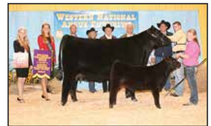
EXAR FRONTIER GAL 1405 2013 WNAF ROV Grand Champion Angus Heifer Dam of Lot 27