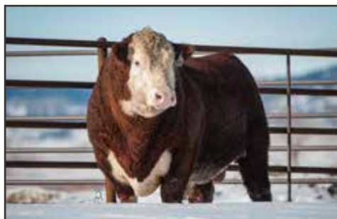
LCX PERFECTO 11B ET Sire of Lot 6