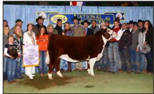
CHEZ STRAWBERRY WINE ET 204Z Full Sister to Lot 1 & Dam of Lot 2