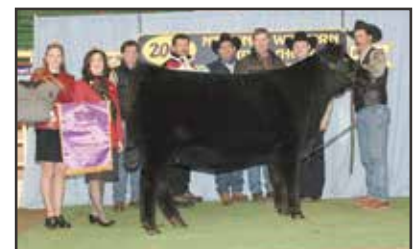
W C C FRONTIER GAL 39 Legendary Maternal Granddam of Lot 27

LOT 28A | BULL CALF BORN 7/1/24 SIRED BY SCC SCH 24 KARAT 838 (AAA: 19262743).