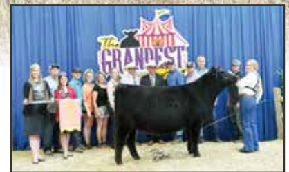
EXAR FRONTIER GAL 1400 2021 NJAS 4th Overall Owned Heifer