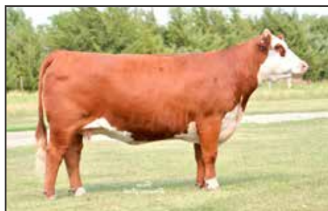
R SWEET RED WINE 039 Immortal Dam of Lot 1 Full Sister to Lot 3