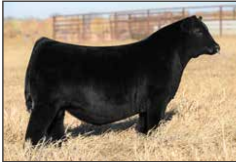
UDE NEW HEIGHTS 62/87 $280,000 Service Sire to Lot 29