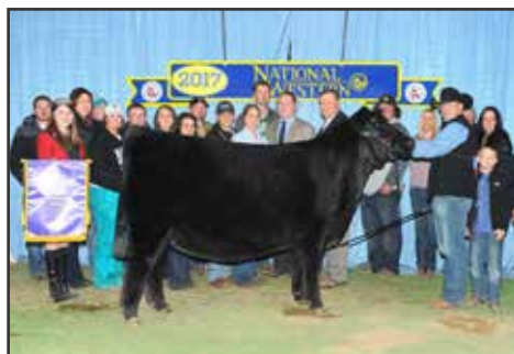
CCC SARA'S DREAM 5116 2017 NWSS ROV Grand Champion Angus Heifer Dam of Lot 31