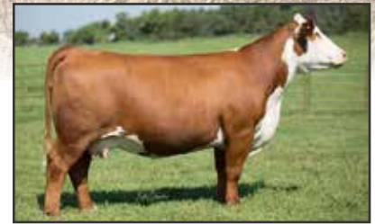
RST GAT NST Y79D LADY 54B ET Prolific Dam of Lot 13 & Maternal Granddam of Lot 14