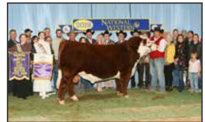
H DEBERARD 7454 ET 2019 NWSS Grand Champion Polled Hereford Bull Maternal Brother to Lot 13