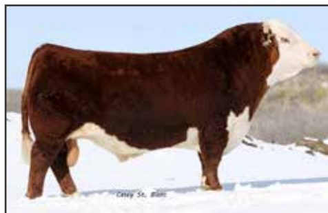
NJW 73S 980 HUTTON 109Z ET Maternal Grandsire of Lot 21