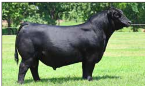
CONLEY A 1 $100,000 Sire of Lot 32