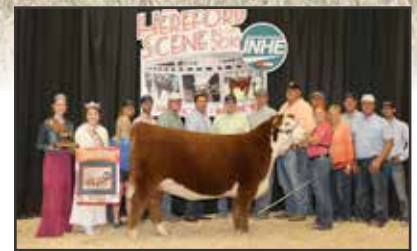
ECR CANDI 5451 ET

EST. DUE TO CALVE 3/20/25 TO GKB 8123 BELLE AIR 1968 (AHA: 44305639).