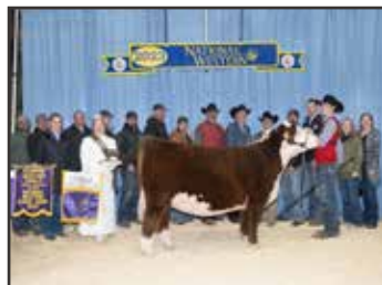
HAWK MURPHY 14J ET 2023 NWSS

Grand Champion Polled Hereford Heifer Maternal Sister to Lot 12