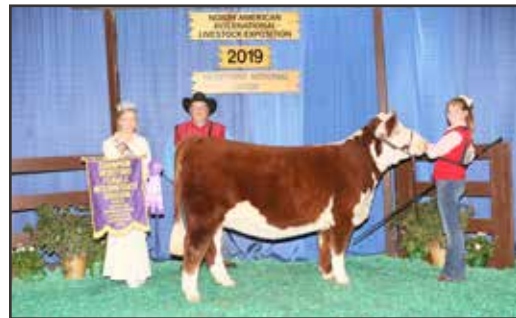
KOLT MS DIANA 3F 2019 NAILE Intermediate Division Champion Dam of Lot 7 Maternal Granddam of Lot 8