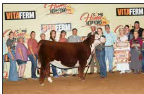
KOLT RUSTIC WINE 5546 ET 2020 JNHE Reserve Grand Champion Bred & Owned Heifer