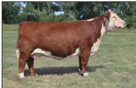
LCC TWO TIMIN 438 ET Iconic Maternal Granddam of Lots 9 & 10