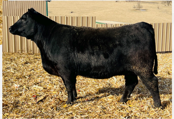
SPRING CREEKS LAKE HOUSE