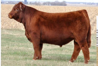
LFLC BANK ACCOUNT 701B