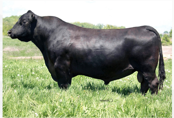
JINDRA ACCLAIM PATERNAL GRAND SIRE