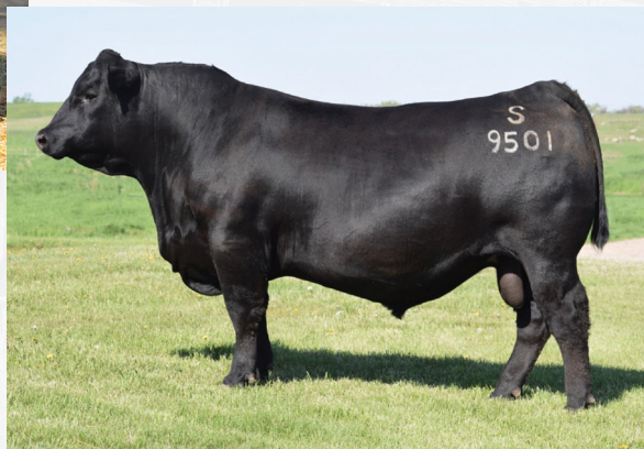
S ARCHITECT SIRE