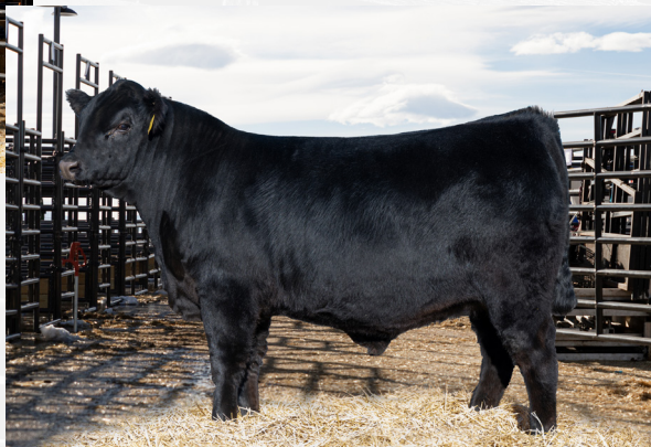
SPRING CREEKS M*A*S*H