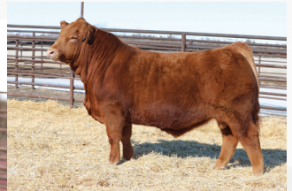
WULFS KACTUS 4841K