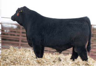
CELL HISTORY BUFF 0245H ET