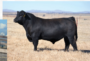
LFL GAMER 9116G ET