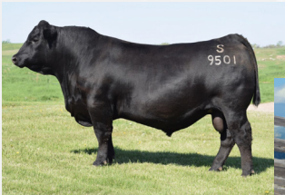
S ARCHITECT 9501