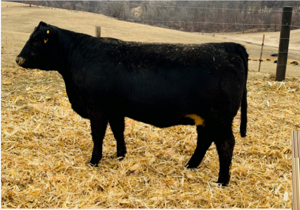
SPRING CREEKS LIKE ME