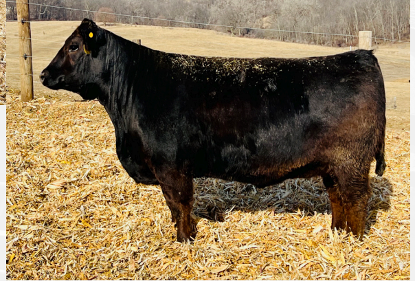
SPRING CREEKS LET IT GO