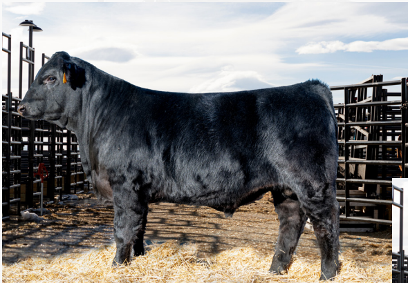
SPRING CREEKS MATLOCK