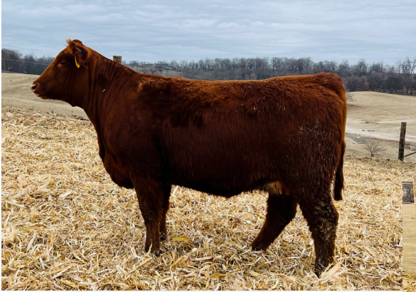
SPRING CREEKS LIKE EM RED