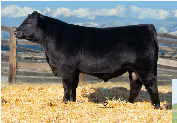
SPRING CREEKS ACCLAIM SIRE