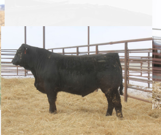
WULFS ENDEAVOR C703E