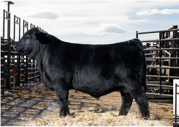
SPRING CREEKS MADAGASCAR