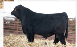
CELL HISTORY BUFF 0245 SIRE

Big-time herd sire prospect that combines phenotype and numbers. He has breed-leading traits highlighted by his top 1% rank for ADG, top 2% for MARB and top 3% for YW. Machete posted an adjusted 878-weaning weight.