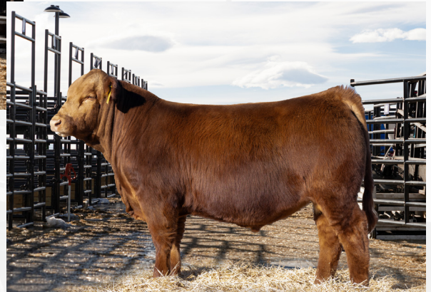
SPRING CREEKS MICHELANGELO