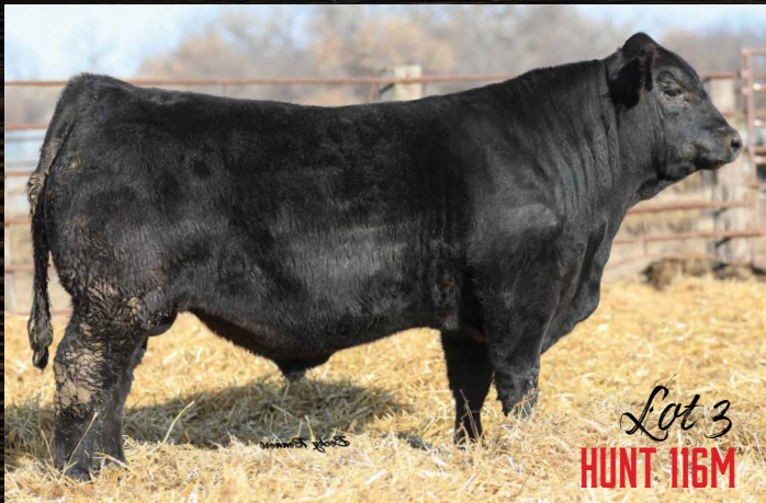
Lot 3 HUNT 116M