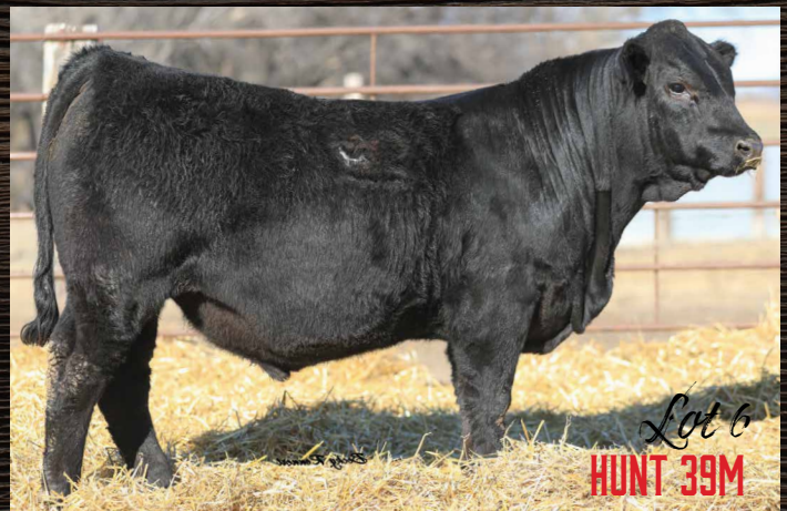
Lot 6 HUNT 39M