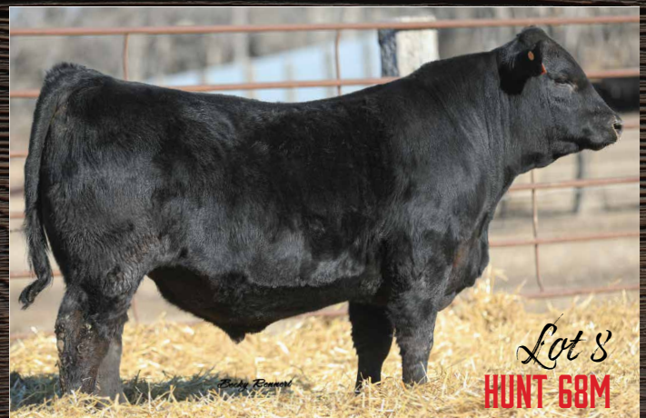
Lot 8 HUNT 68M