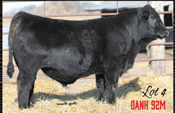
Lot 4 DANH 92M