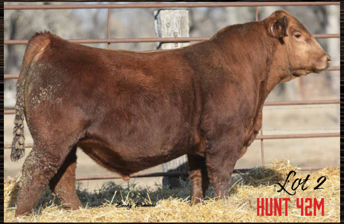
Lot 2 HUNT 42M