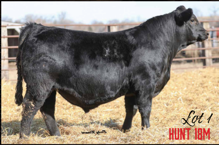
Lot 1 HUNT 18M