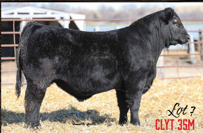
Lot 7 CLYT 35M