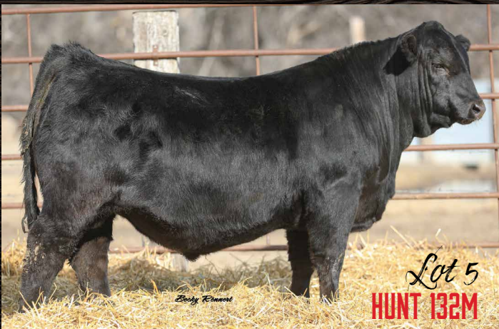
Lot 5 HUNT 132M