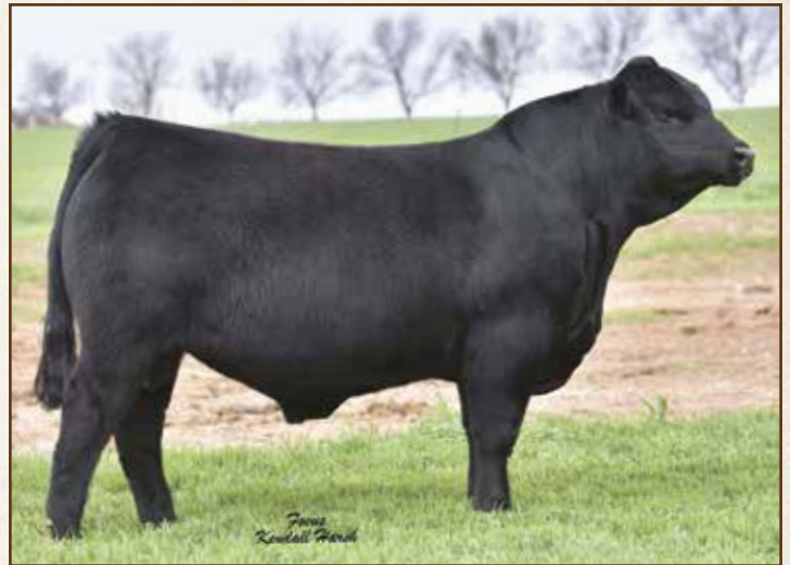
LFL GUNSLINGER 9050G ET • SIRE OF LOT 71