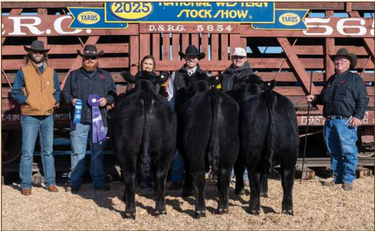
2025 NATIONAL WESTERN STOCK SHOW DIVISION CHAMPION LIM-FLEX PEN