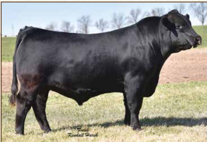
LFL ESQUIRE 7084E • 17 SONS SELL!