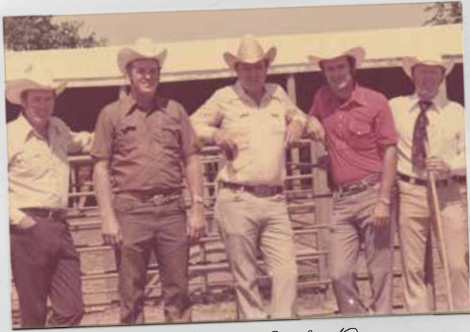
Coyote Hills - Early Days