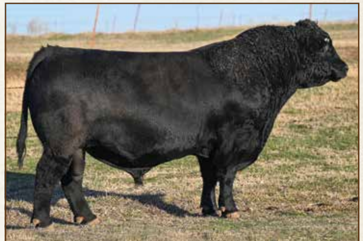
CHR FREE AGENT 215F • 5 SONS SELL!