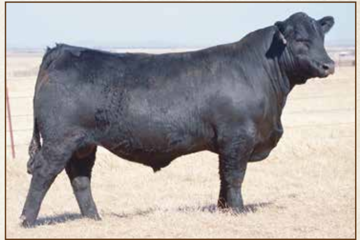
CHR HARD ROCKS 151H • 7 SONS SELL!