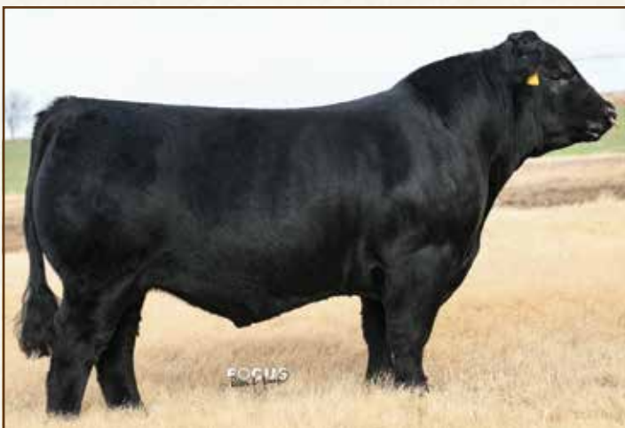
LFL JOHNNY 1117J • 2 SONS SELL!