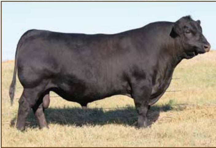
MAGS EAGLE • 2 SONS SELL!