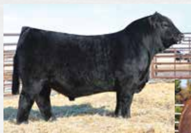
WULFS JOINT VENTURE G579J