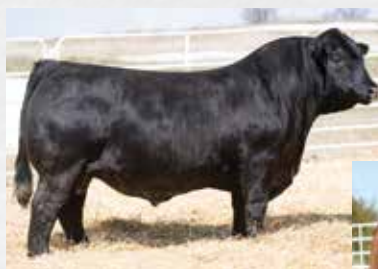
CJSL DATA BANK 6124D ET