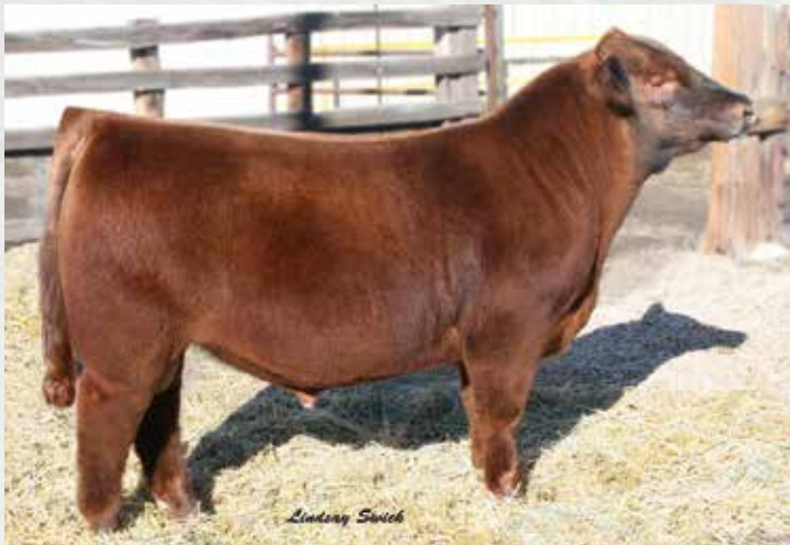
WEBR TC CARD SHARK 1015 | Maternal grandsire of Lot 58