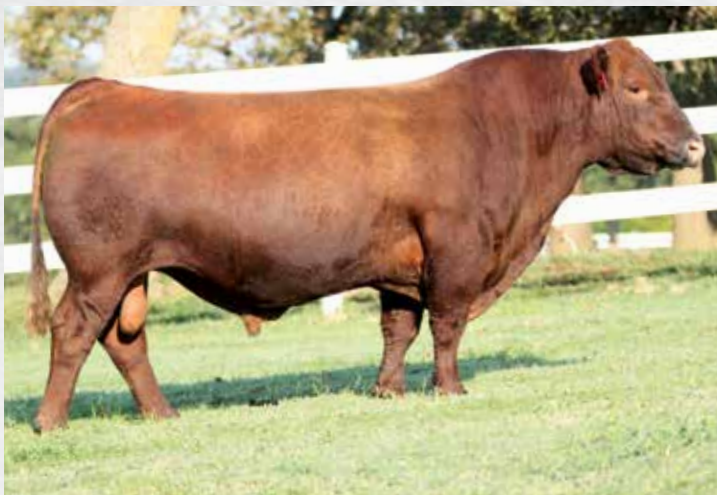
WEBR MAXED OUT 627 | Maternal grandsire of Lot 34