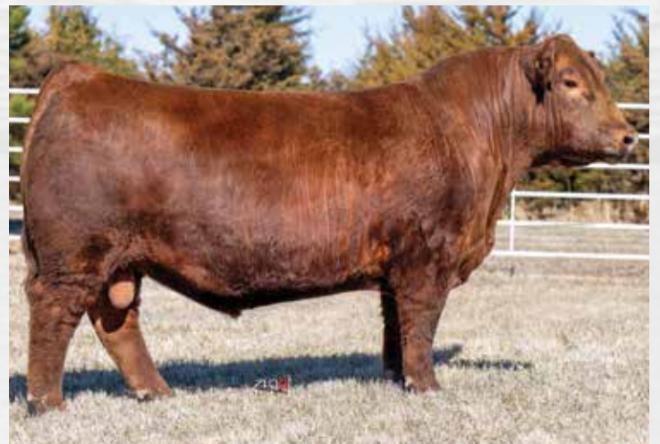
PIE HOLLYWOOD 222 | Sire of Lot 43

A powerhouse of a herd sire prospect that deserves your attention with single digit rankings for his growth EPDs. This PIE Hollywood 222 son has profitability written all over him and when you see him in person, you'll understand why. We've always loved his soggy build, the substance of bone he stands on and his commanding presence. His Weaning Weight, Yearling Weight and Carcass Weight EPDs are in the top 1% and his Ribeye Area is in the top 3% of the breed. With splendid growth EPDs like these, he can take your herd to the top in a flash.