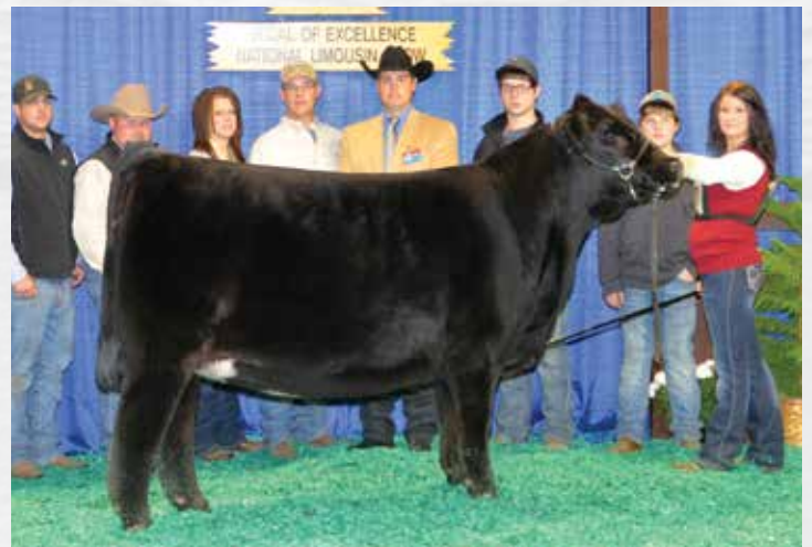
LLJB ABSOLUTE STYLE 3056A | Dam of Lot 23

Be sure to not overlook this wide-bodied, thick-ended, deep-centered individual. His sire is TASF Heineken 405H, the $44,500 top-selling lot from the 2021 Thomas & Son Farms Sale. His dam is none other than LLJB Absolute Style 3056A, the daughter of Silveiras Style 9303 and MAGS Wassail. LLJB Absolute Style 3056A was successfully campaigned by Shelby Hennessey and was named the 2014 NAILE Grand Champion Limousin Female. Add this homozygous polled sire to your bull pen to create highly marketable calves.