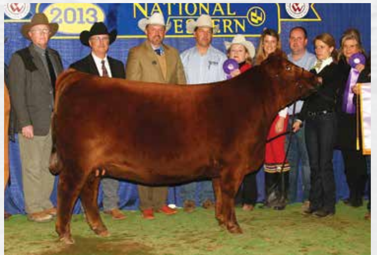
SIX MILE LAKOTA 112Y | Maternal grandam of Lot 35

Here is another PIE Hashtag 1249 son that hits you hard. He is level topped with extra center capacity and moves freely off both ends of his skeleton. Mark him high on your list if you are looking for a do-it-all herd sire that will add dollars to your program. Numerically, J6RA 219M carries a well-balanced number set worth studying. This bull's dam is Rojas Belly Dancer 5039, a female sired by the legendary, Leachman King Rob, the maternal grandsire of the famed CT Cita 4060 female. He is ready to hit the pasture and take control of breeding duties.