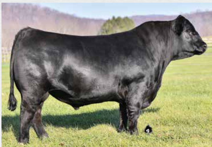
COLE GENESIS 86G | Sire of Lot 54

BW: 82 | ADJ. WW: 653 | ADJ. YW: 1167 | AVG. DMI: 23.11 | ADG: 3.81 | RFI: 1.66 | FCR: 6.07