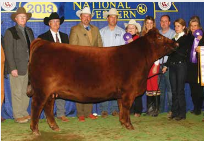
SIX MILE LAKOTA 112Y | Maternal grandam of Lot 39