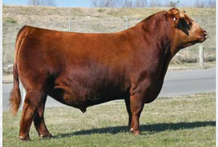
J6 BULLETPROOF 542K | Sire of Lot 56