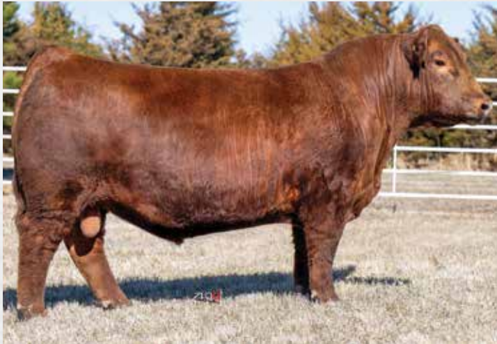
PIE HOLLYWOOD 222 | Sire of Lot 38