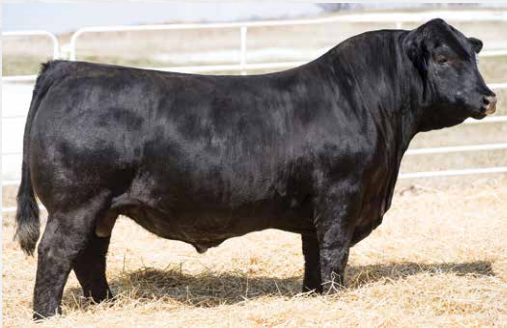
CJSL DATA BANK 6124D Sire of Lot 18

BW: 72 | ADJ. WW: 628 | ADJ. YW: 1072 | AVG. DMI: 21.66 | ADG: 3.17 | RFI: 2.18 | FCR: 6.84