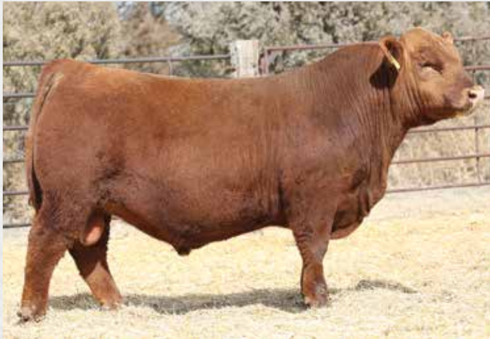
PIE HASHTAG 1249 | Sire of Lot 30