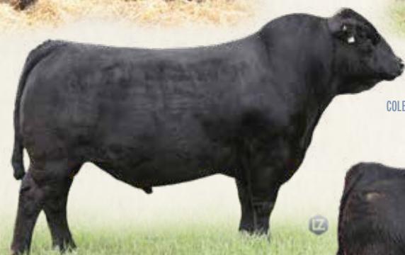
COLE JACKPOT 38J