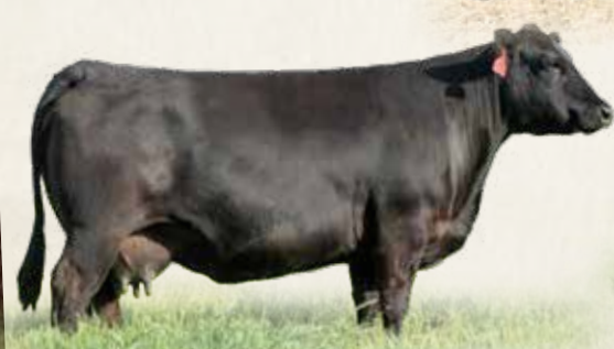
COLE MISS XRATED 354A