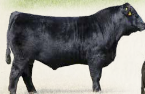
CELL ENVISION 7023E