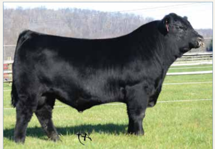
TMCK MISS CAMDEN YARD 195C • Maternal grandsire of Lots 5 & 6