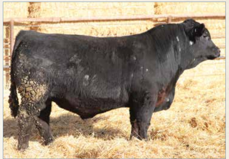
COLE EARNING POWER 82H • Sire of Lots 32 & 33