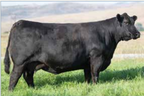
COLE MISS PRODUCTION 104Y • Dam of Lots 12 & 13