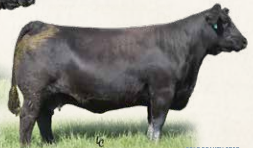
COLE BEAUTY 276Z