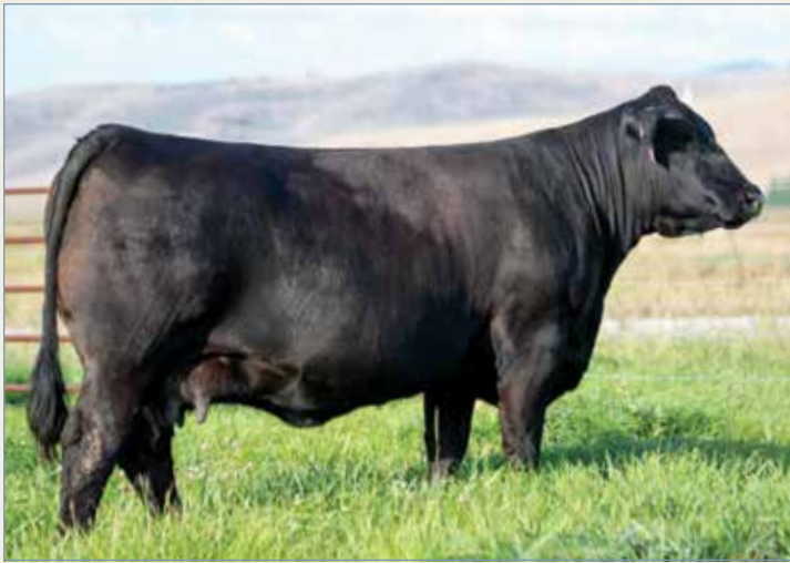
COLE MISS ZAM 8117F • Maternal grandam of Lot 36

If you're looking for a heifer-safe, long-bodied, functionally correct bull, look no further than COLE Justice 09M. He combines impressive calving ease, ranking in the top 10% for this trait, with top 20% rankings for both birthweight and marbling. His balanced EPD profile reflects his ability to sire quality progeny with both maternal and growth advantages. With a solid foundation and excellent potential, COLE Justice 09M is a bull you can confidently add to your breeding program.