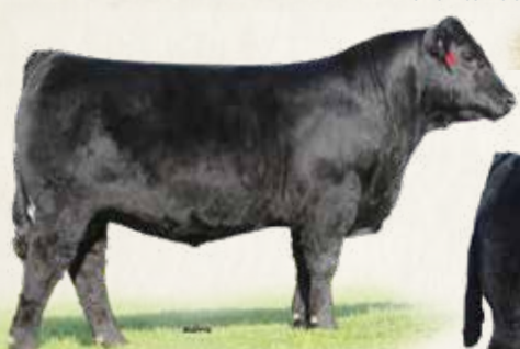
AHCC EASY RIDER 5594E