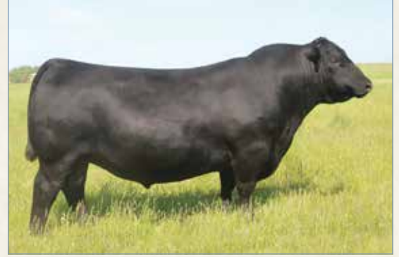
S A V RAINFALL 6846 • Sire of Lot 45