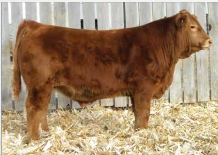
SYES HARDROCK 65H • Sire of Lots 5 & 6

COLE Master Plan 66M ET is a genetically elite herd sire prospect that offers a powerful combination of performance, predictability and phenotype. As a full sibling to Lot 5, he shares the same impressive lineage, being sired by SYES Hardrock 65H and out of COLE Miss Camden Yard 881F. This pedigree blends performance-driven growth with exceptional maternal strength. Numerically, he excels in key areas—ranking in the top 4% for docility, ensuring a calm and manageable disposition. Additionally, he ranks in the top 10% for calving ease, ribeye area and $TPI, making him a well-rounded choice for breeders focused on efficiency, carcass merit and profitability. COLE Master Plan 66M ET is an outstanding choice for those looking to enhance docility, muscle expression and overall performance in their program.