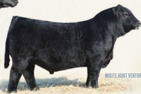
WULFS JOINT VENTURE 6579J