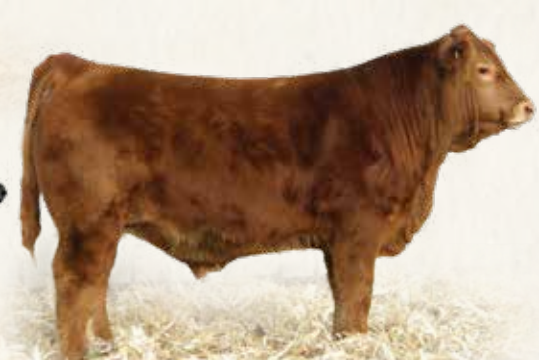
SYES HARDROCK 65H