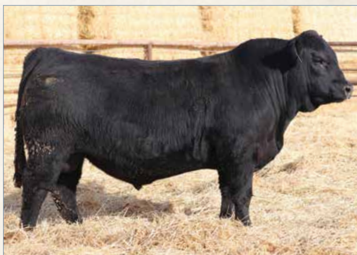
COLE HOMERUN 51H ET • Sire of Lot 57

If you're looking to elevate your herd's growth and carcass merit while maintaining excellent eye appeal and convenience traits, COLE Homerun 75M should be on your short list. He excels with a top 1% ranking for $TPI, top 4% for carcass merit, top 10% for yearling weight and top 15% for weaning weight. He brings impressive performance numbers along with an attractive phenotype. Be sure to study this exceptional prospect and have him at the top of your list come sale day!