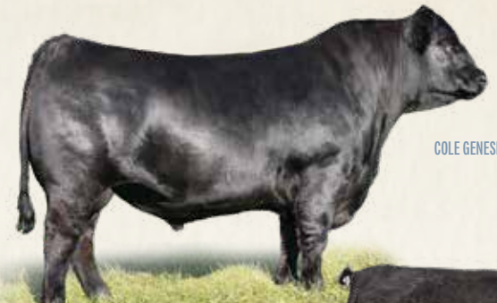
COLE GENESIS 86G