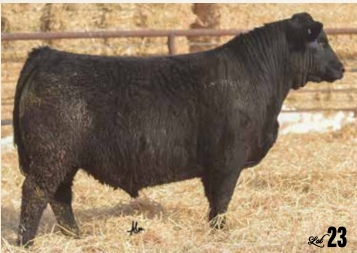
AHCC EASY RIDER 5594E • Sire of LotS 21-25