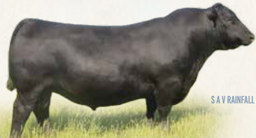
S A V RAINFALL 6846