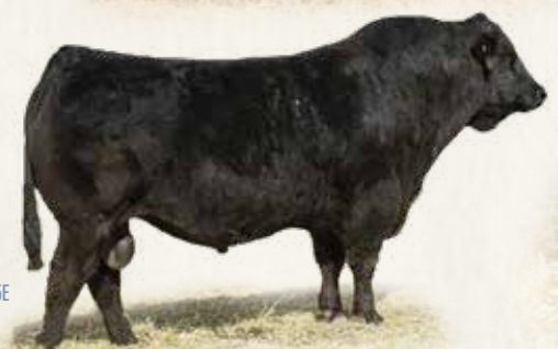
SYES ENCORE 315E