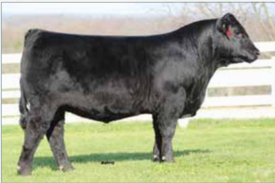
AHCC EASY RIDER 5594E • Sire of Lot 8