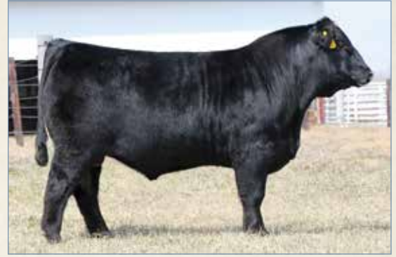
CELL ENVISION 7023E • Sire of Lots 12 & 13