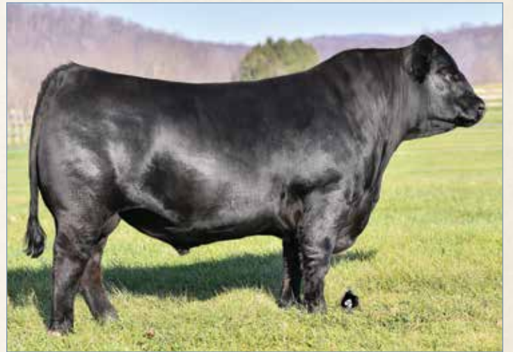
COLE GENESIS 86G • Sire of Lot 2

COLE Missoula 24M is a powerhouse prospect that combines elite genetics with breed-leading performance. Sired by the highly popular COLE Genesis and out of COLE Miss Cashflow 911G, he carries a pedigree stacked with performance and maternal excellence. His impressive EPD profile places him in the top 2% for carcass weight, top 3% for $TPI, top 5% for milk and top 10% for weaning weight—making him a standout choice for those seeking growth, maternal strength and carcass merit. Structurally, COLE Missoula 24M is bold ribbed, heavy muscled and athletic in his movement, with the added dimension and power expected from this pedigree. His combination of numbers, phenotype and proven lineage makes him a high-impact sire candidate that will leave a lasting mark on any progressive program.