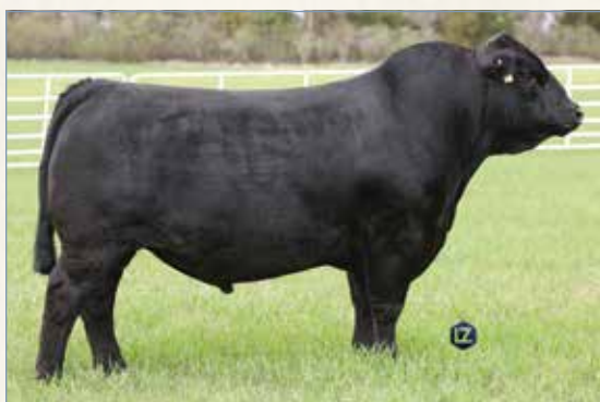
COLE JACKPOT 38J ET • Sire of Lot 48