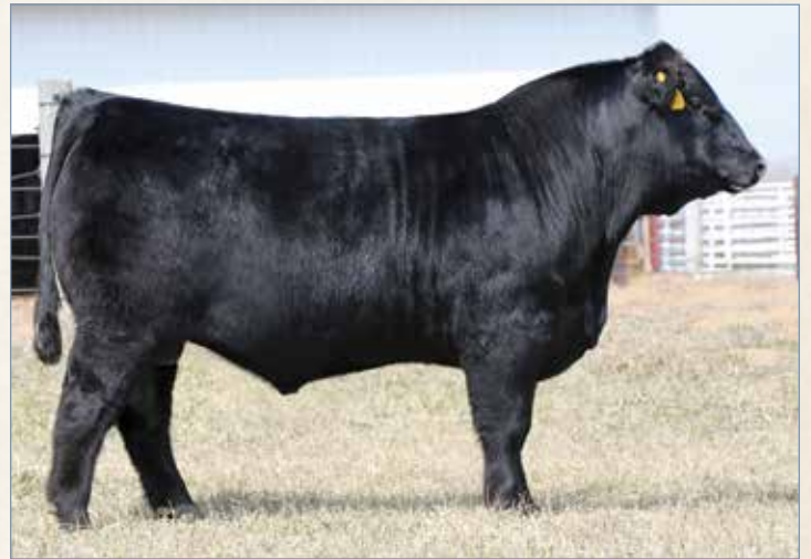
CELL ENVISION 7023E • Maternal grandsire of Lot 1

COLE Made To Order 44M is the complete package, combining an elite EPD profile with an impressive phenotype. Structurally sound, deep bodied and heavily muscled—he exemplifies the best traits of the Limousin breed. His genetic profile ranks him in the top 10% for calving ease, birth weight and docility, making him a heifer-safe option with the added benefit of a quiet, manageable temperament. Additionally, he ranks in the top 15% for milk and calving ease maternal, ensuring his daughters will be productive, efficient mothers. Whether you're looking to improve calving ease, maternal strength, or overall structural correctness, COLE Made To Order 44M is a sire that delivers on all fronts.