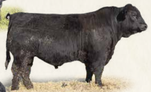
COLE JUNEAU 48J ET