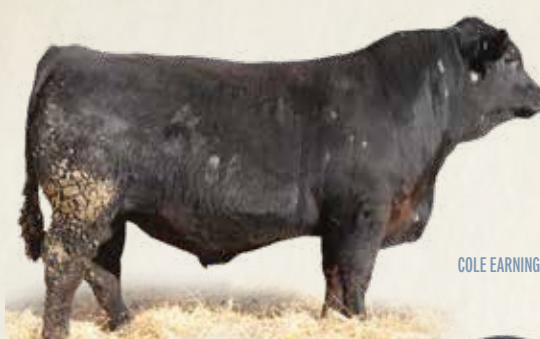
COLE EARNING POWER 82H