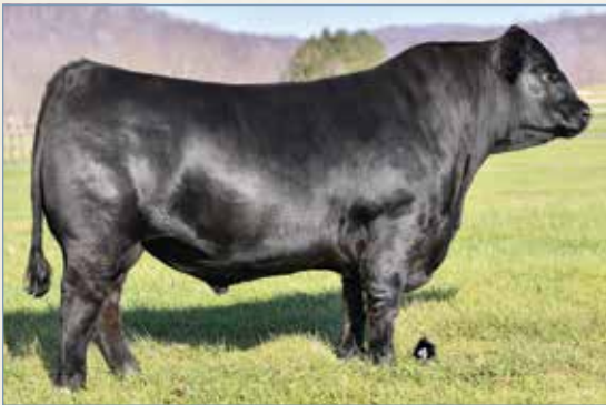
COLE GENESIS 86G • Maternal grandsire of Lot 46