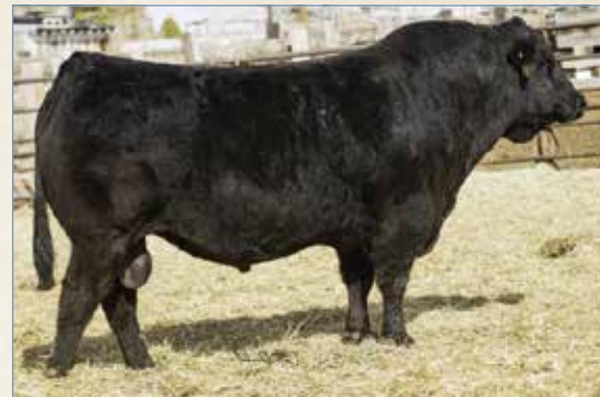
SYES ENCORE 315E • Sire of Lots 46 & 47