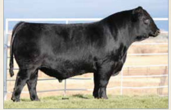
AHCC EARNING POWER 1015J • Maternal grandsire of Lot 7