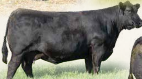
COLE MISS PRODUCTION 104Y